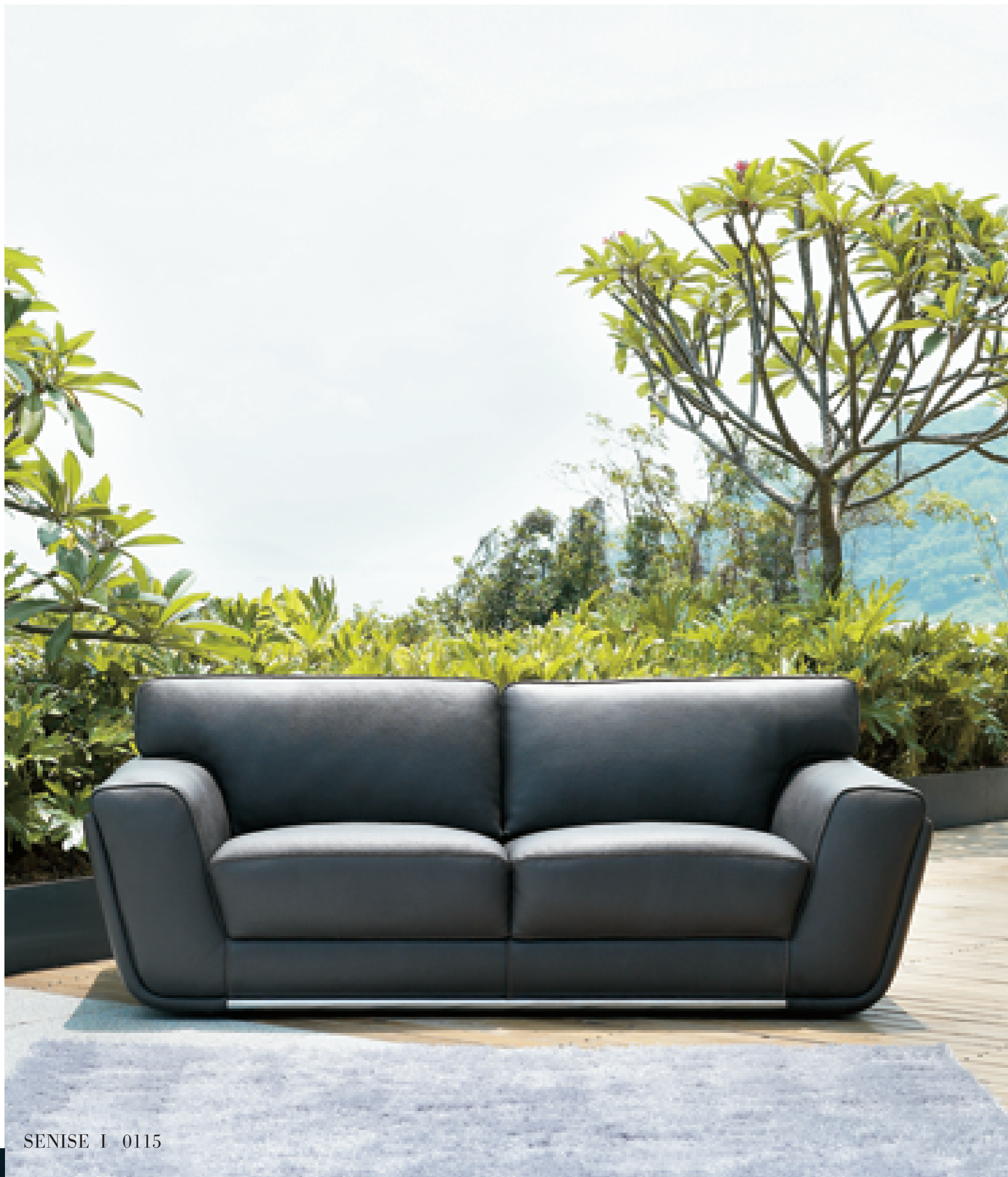
SENISE I 0115