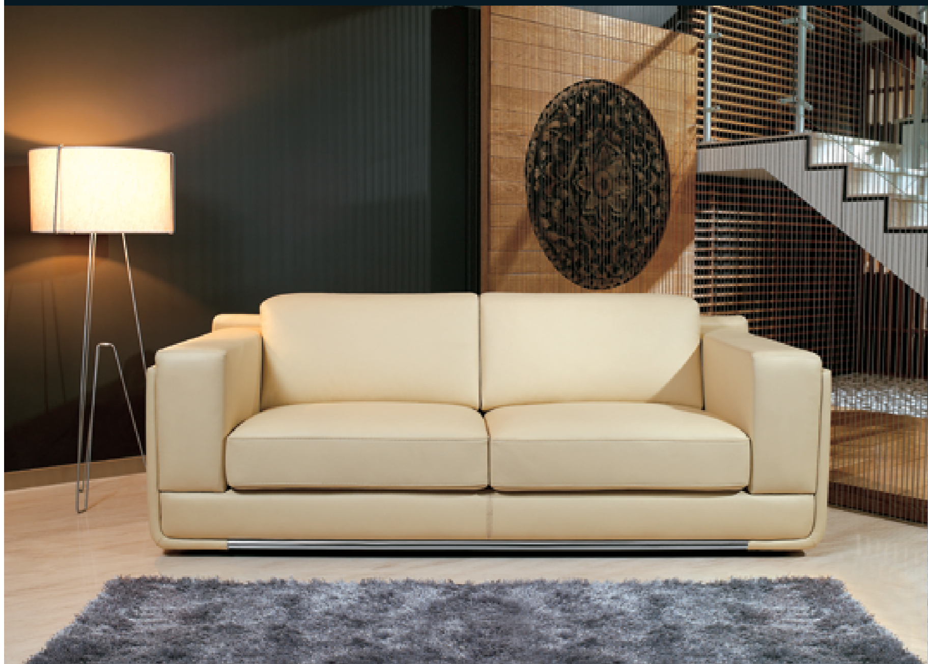
LATINA I 0117