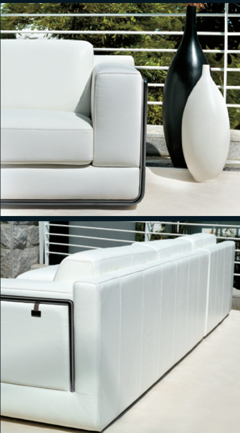
Adding "DC" at the end of the model number creates an option of having a prestige electro-plated color of "Dark Champagne" on the stylish and unique stainless steel feature of Model ANSON.