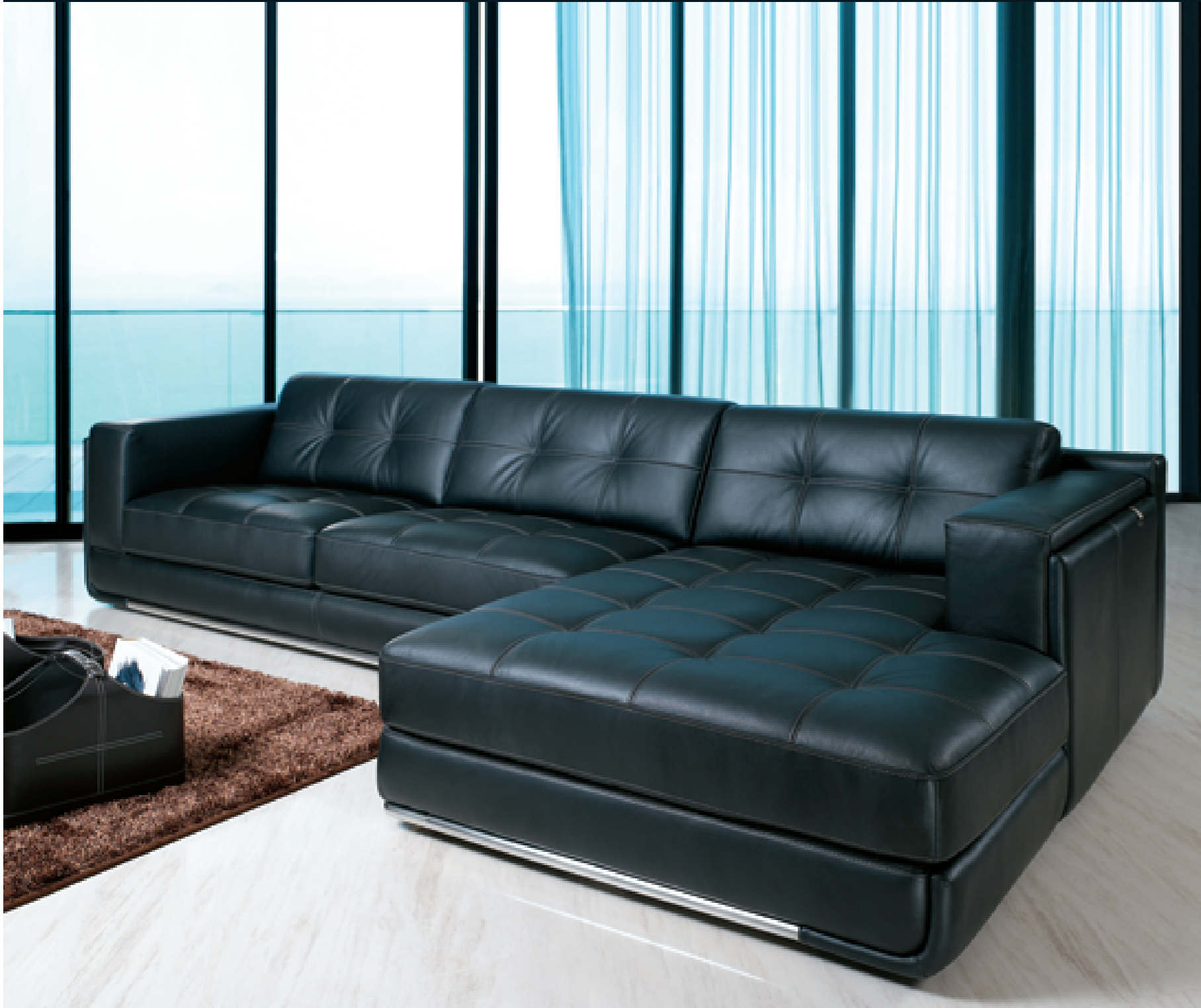
LATINA II is the showy version of the model. It comes with strong visual effect of tufted squares on seat and back cushions.