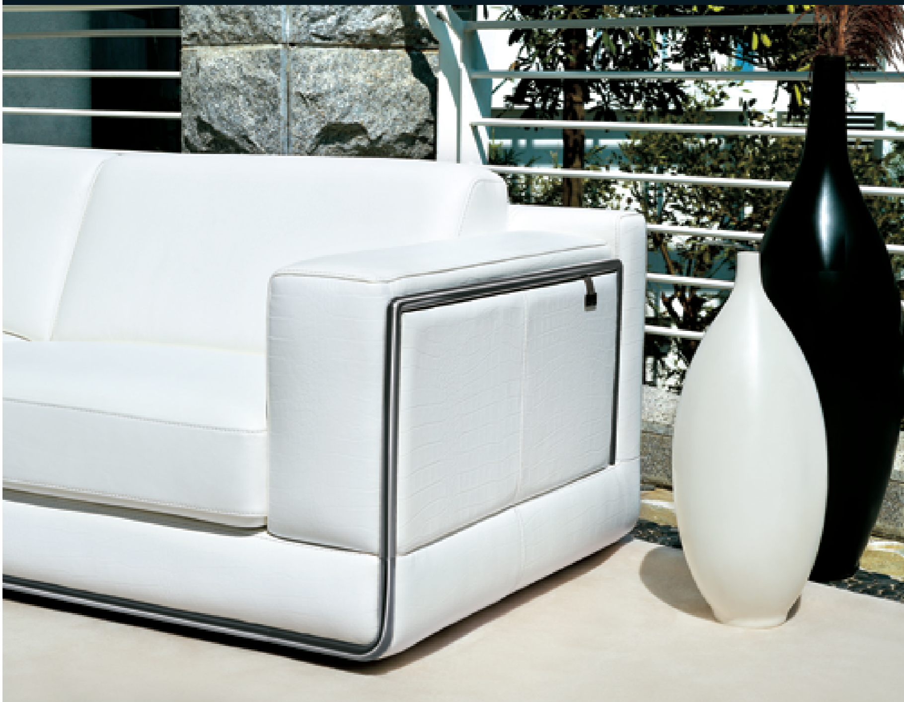
Crocodile-skin-printed leather is specially used for upholstering the entire frames and arm-exterior of Model ANSON III. This Third Version of Model ANSON is slightly re-configured from ANSON I to give a better definition for the placement of the Crocodile-skin-printed leather.