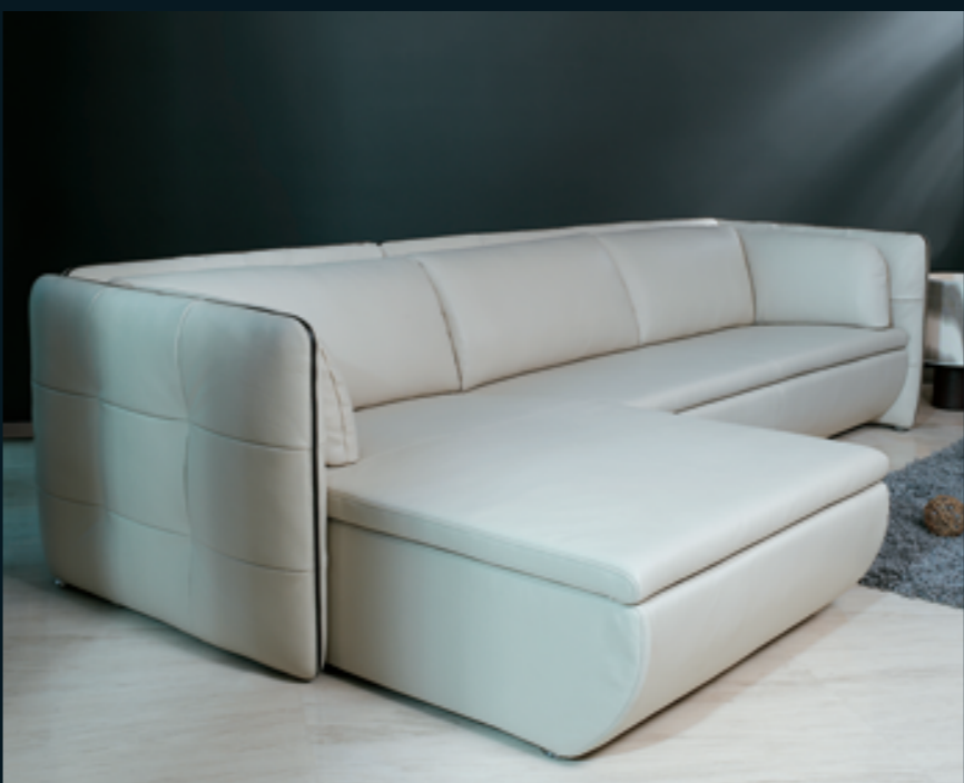
The smooth and round outline of the seat-frame is a contemporary feature of Model MASIO. It's particularly well-presented with the corner-chaise unit.