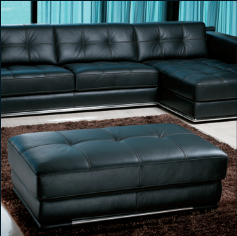
The optional stool possesses the matching design of squares-on-seats and stainless steel front base.