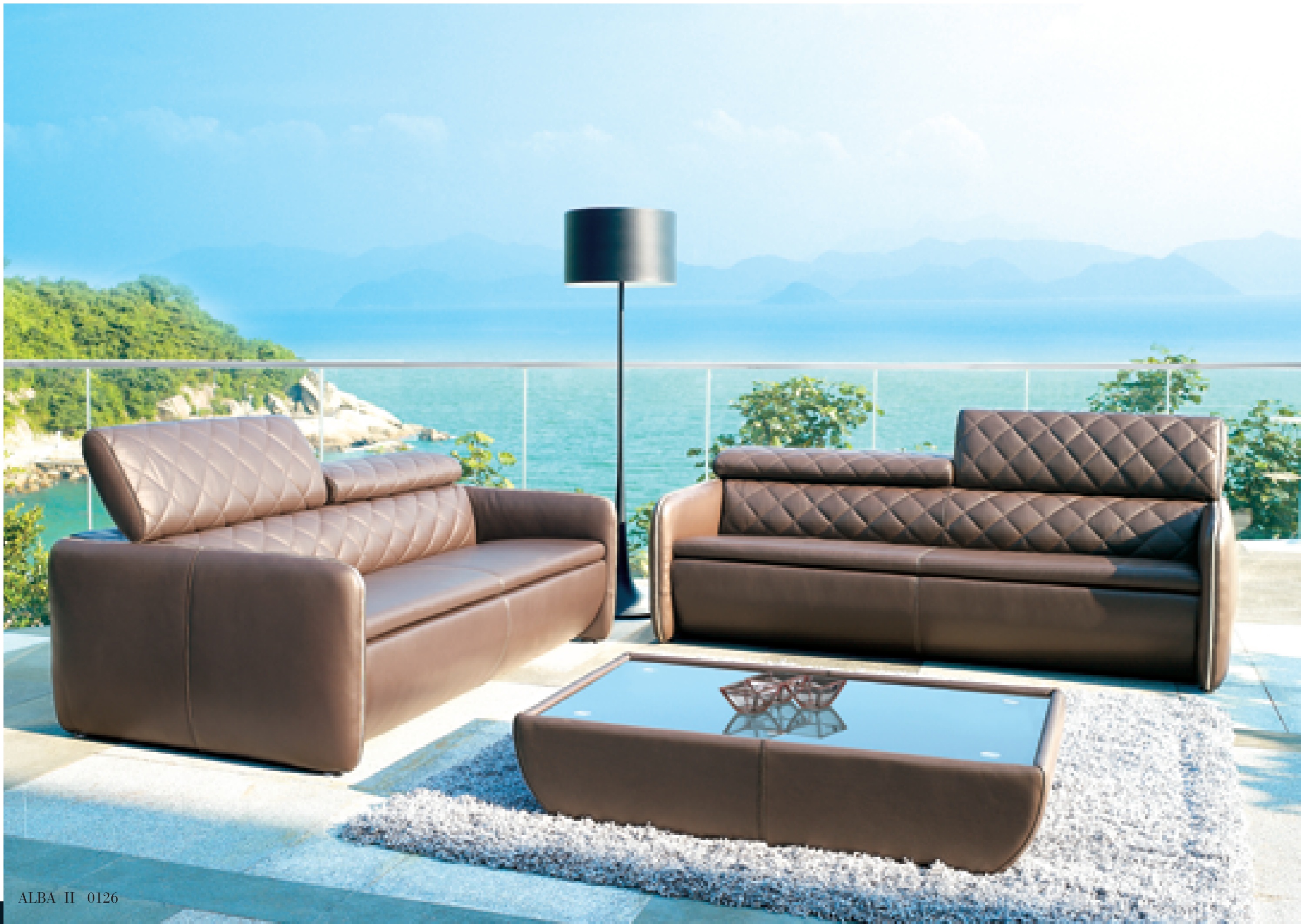
ALBA II 0126