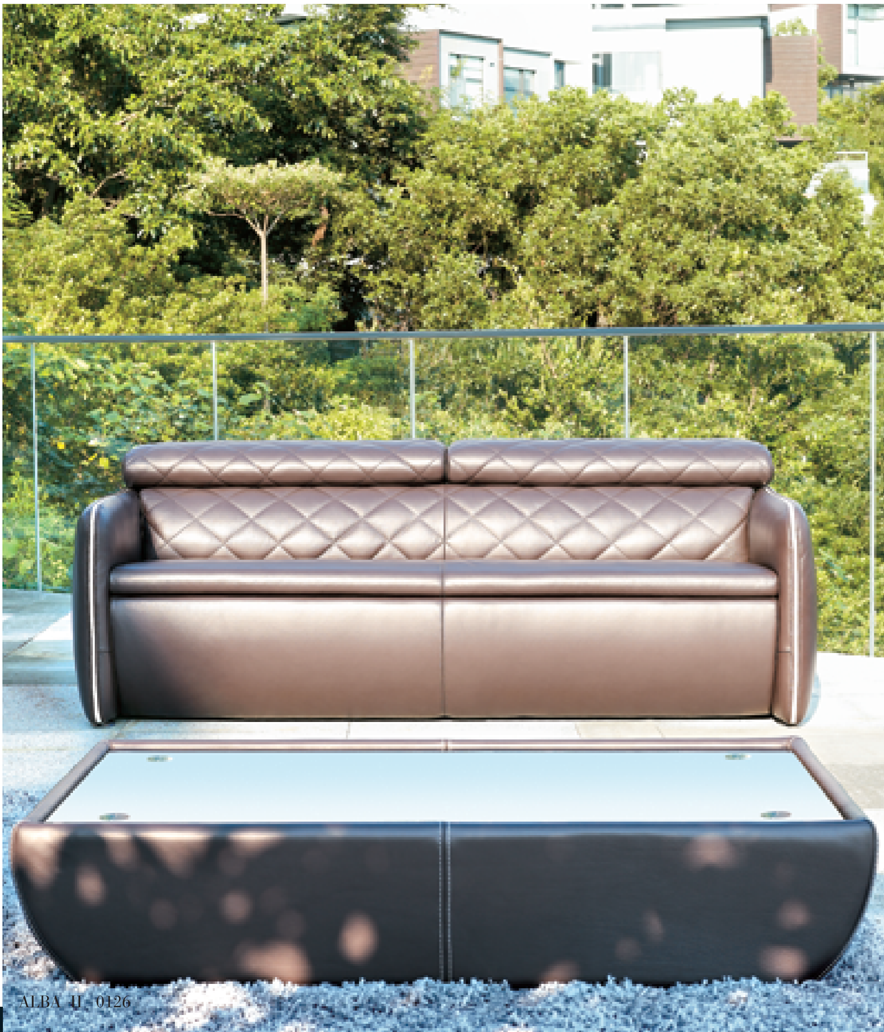
ALBA II 0126