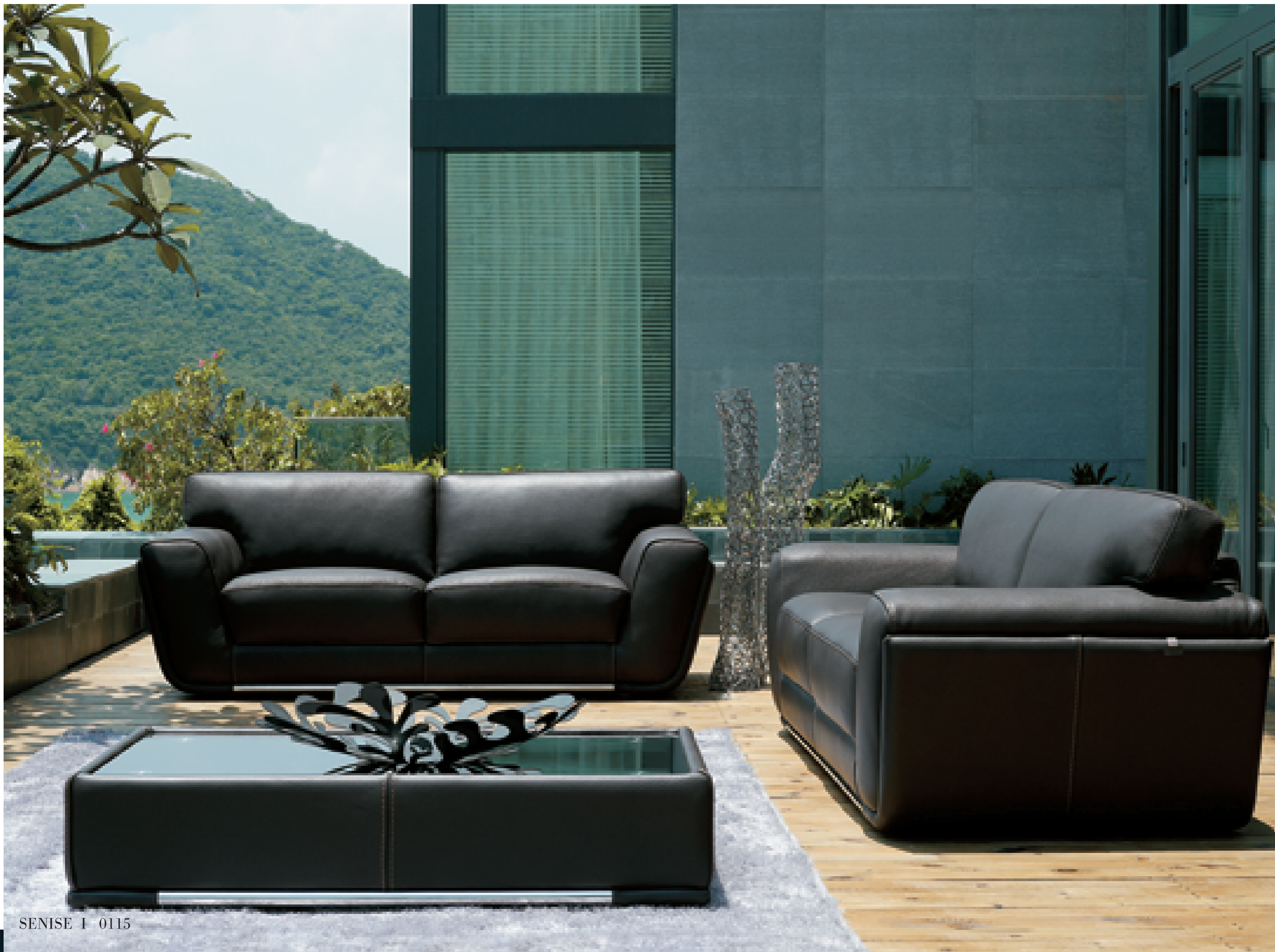
SENISE I 0115