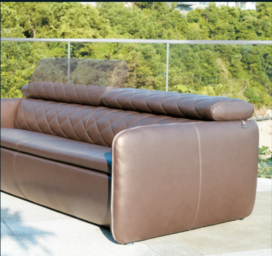
ALBA II is the showy version of the model. The stitching lines on surface of the upper front give fashion elements to the sofas which represent the love of elegance and appreciation of fine detail.