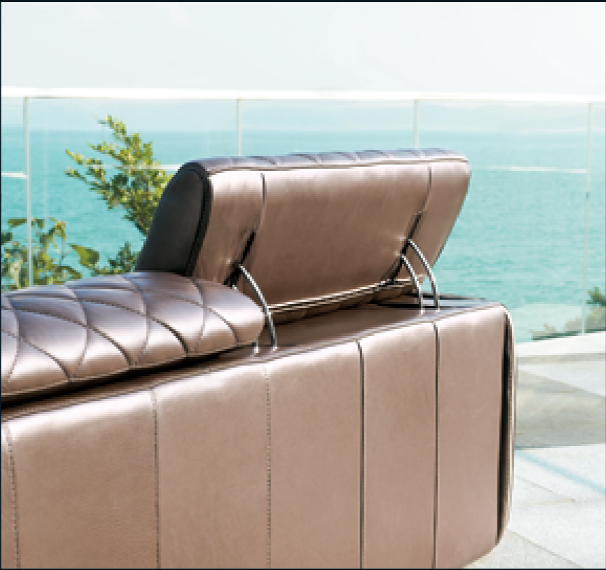
Highly reliable Italian mechanisms, including gas lifts, flip up and create strong back support while sitting.