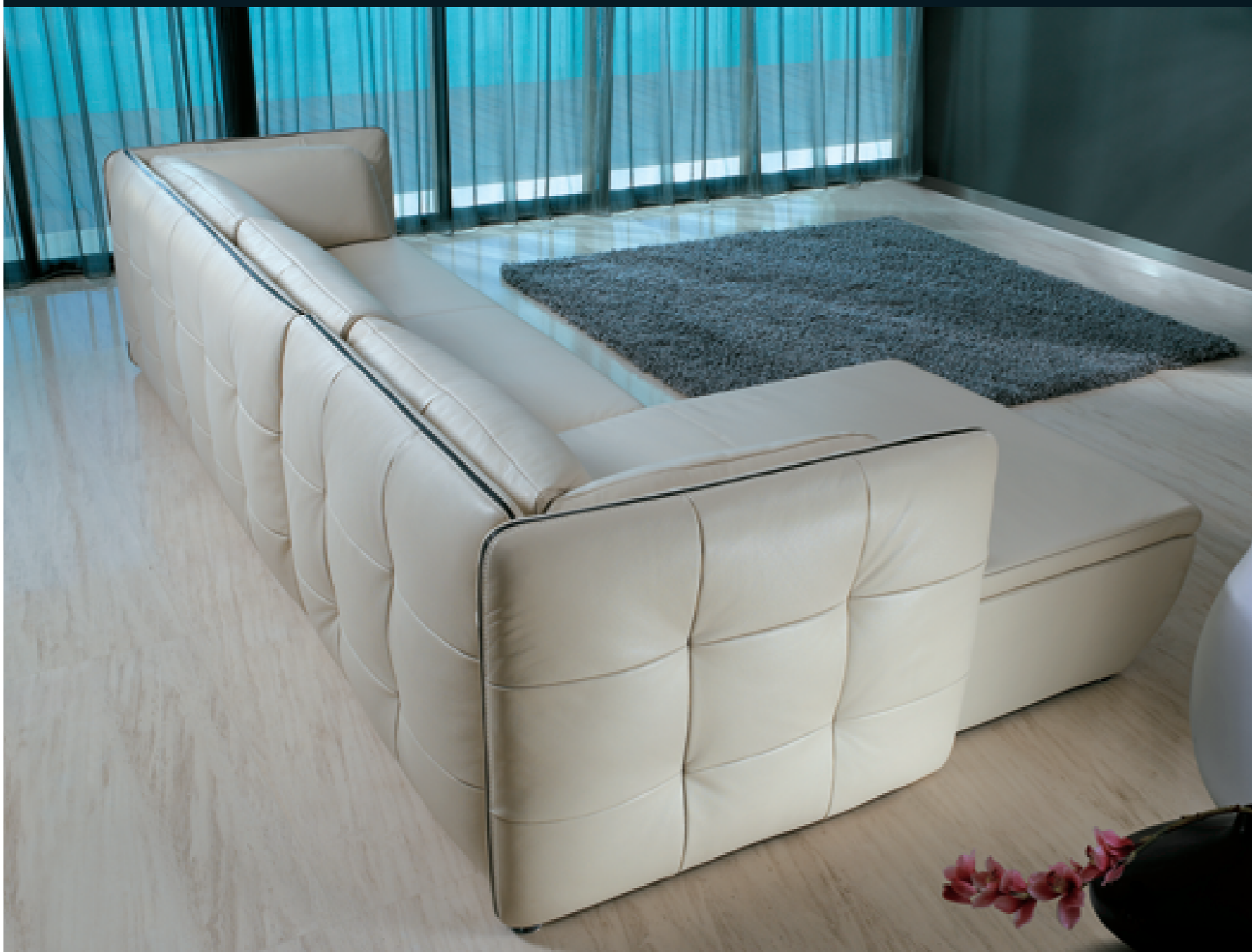
MASIO II is the showy version of the model. It comes with strong visual effect of tufted squares at the exterior of the sofa backs and arms.