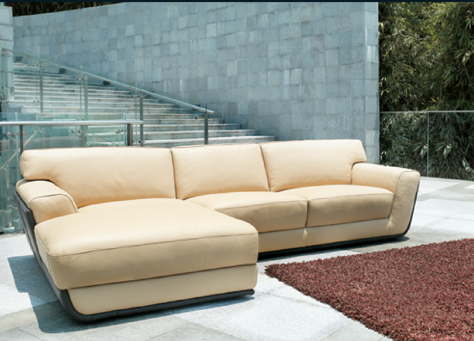
The special design of the base frame runs from the seat base to the arm sides which gives a clear definition for the modern 2-tone color scheme on the sofa set.