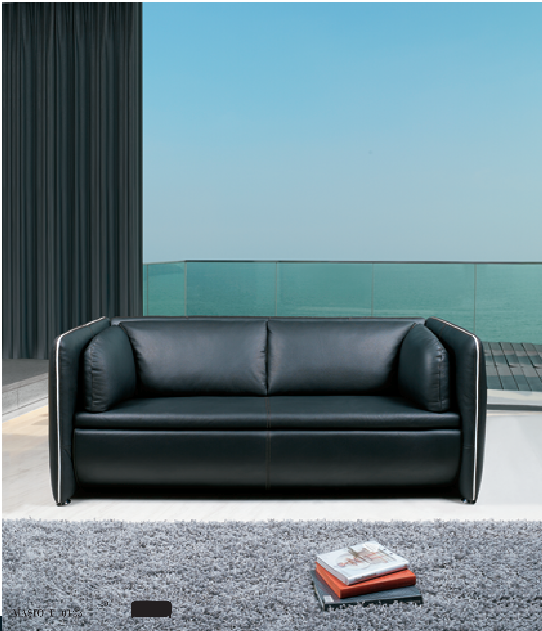
MASIO I 0123