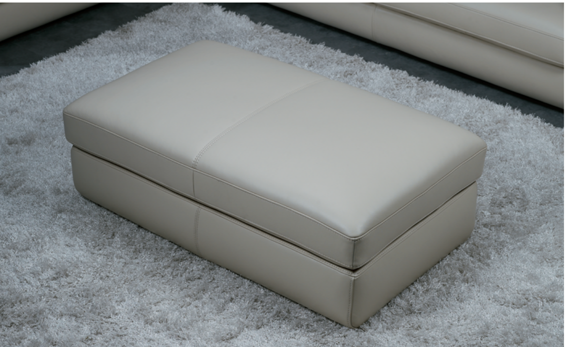
The optional stool (no. ST2) has the matching base frame design