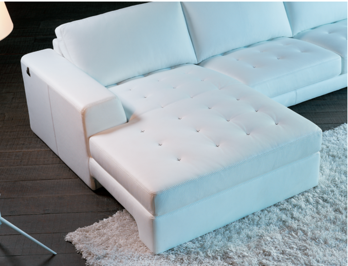
Small plus-shape stuffings in contrast stitching colors (as a standard) on seat cushions offer a lighter and more uptrend alternative to ordinary square-tufted seats.