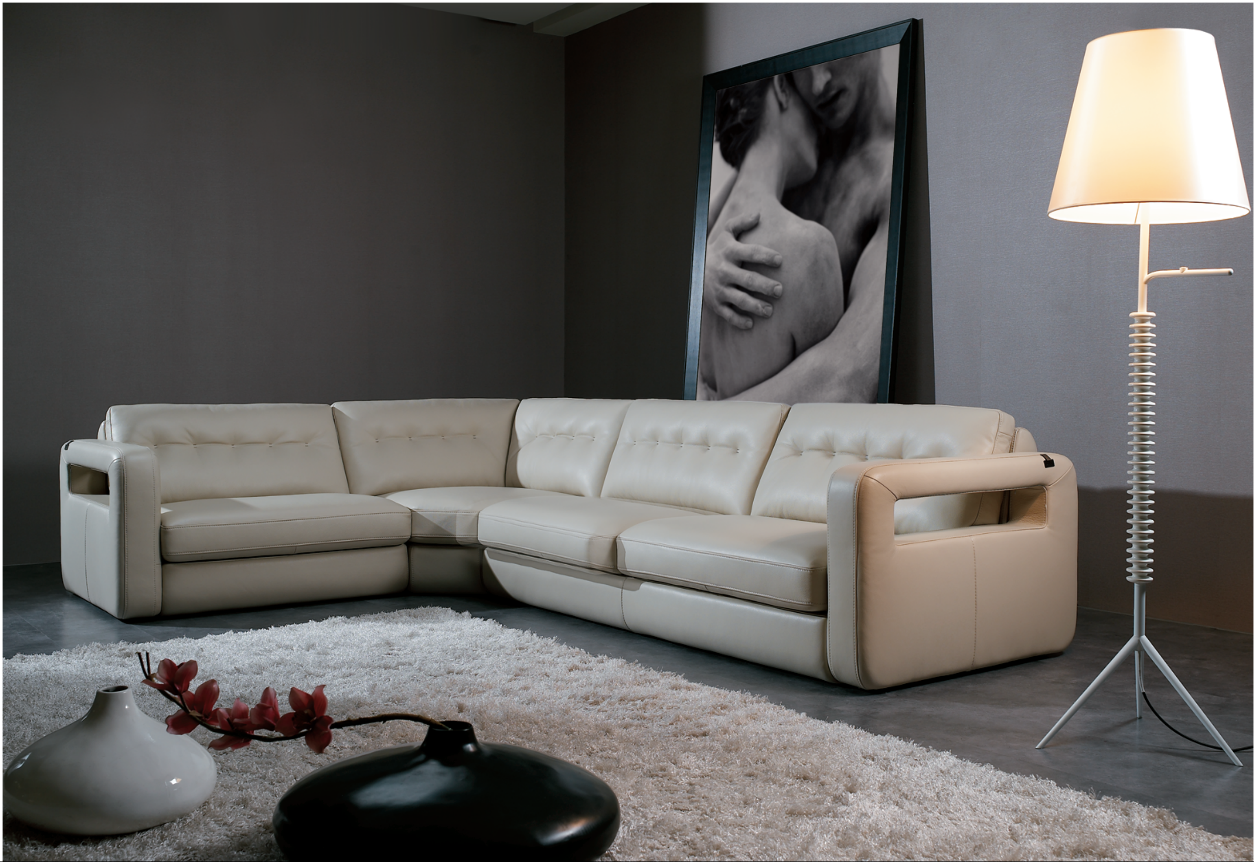
Model GANGI I is the "lighter" version of the model which does not have the "heavy metal" accessories of Model GANGI II.