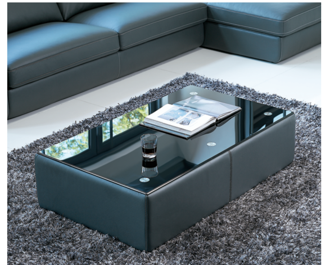
The optional coffee table (no. STG3B) can always be custom-made with the matching leather color of the sofa group