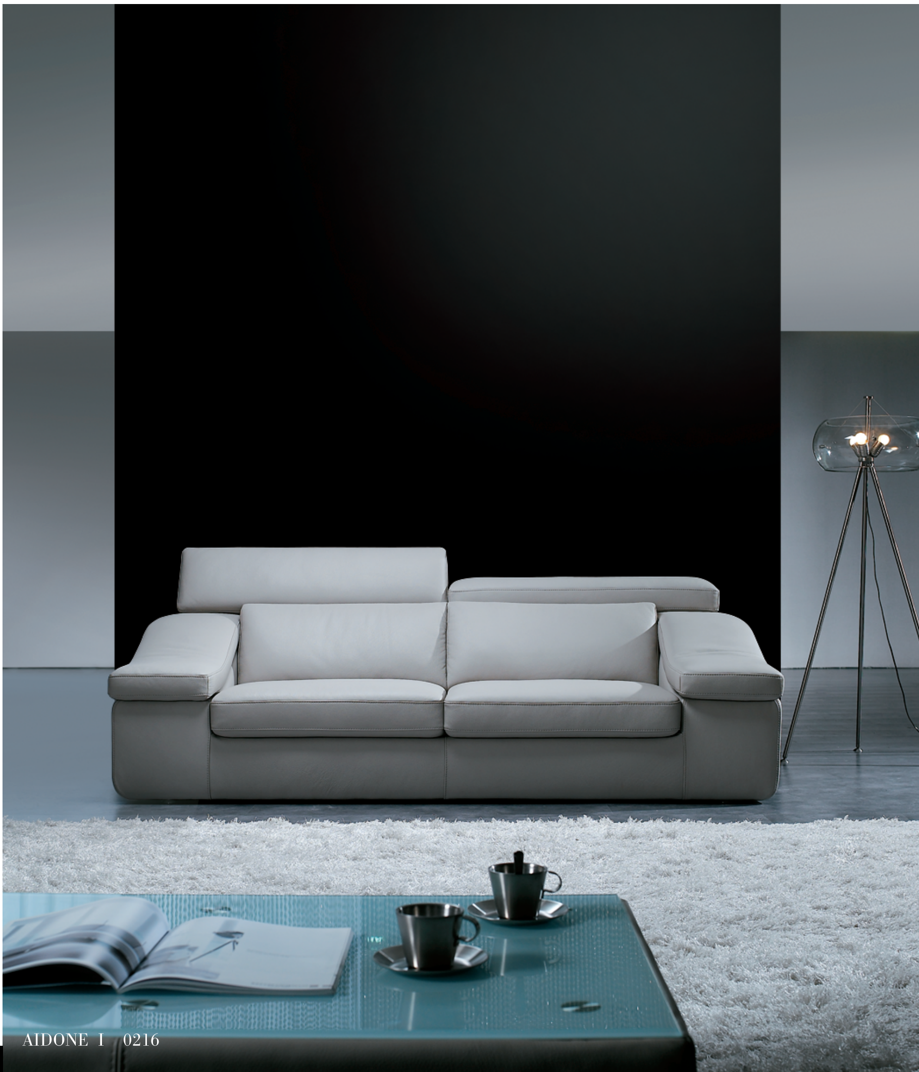
AIDONE I 0216

Head mechanisms from Germany with various locking positions deliver extra comfort when needed.