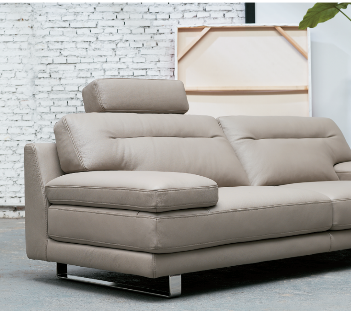
The optional headrest (no. HR2) gives additional support from neck to head.