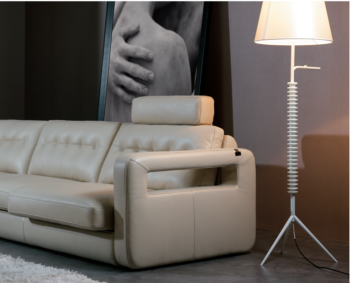
The optional headrest (no. HR2) gives additional support from neck to head.