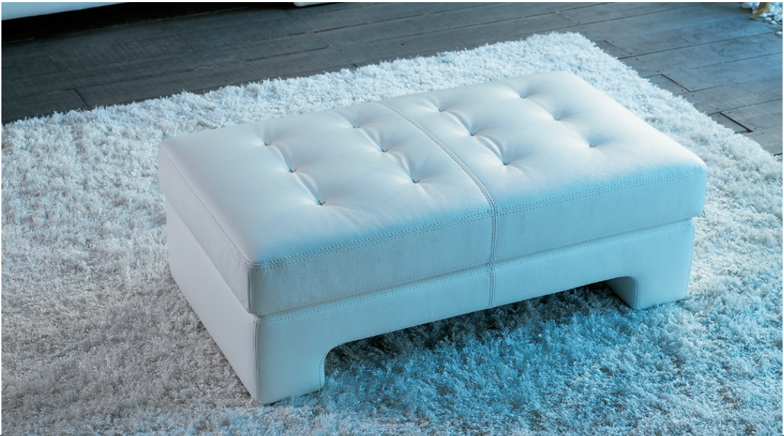
The optional stool (no. ST2) has the matching base frame design.