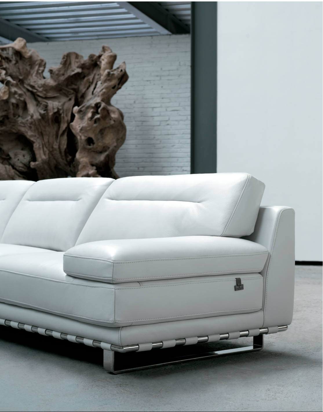
The low-arm design always allows more different sitting postures and angles comparing with higher arm designs.