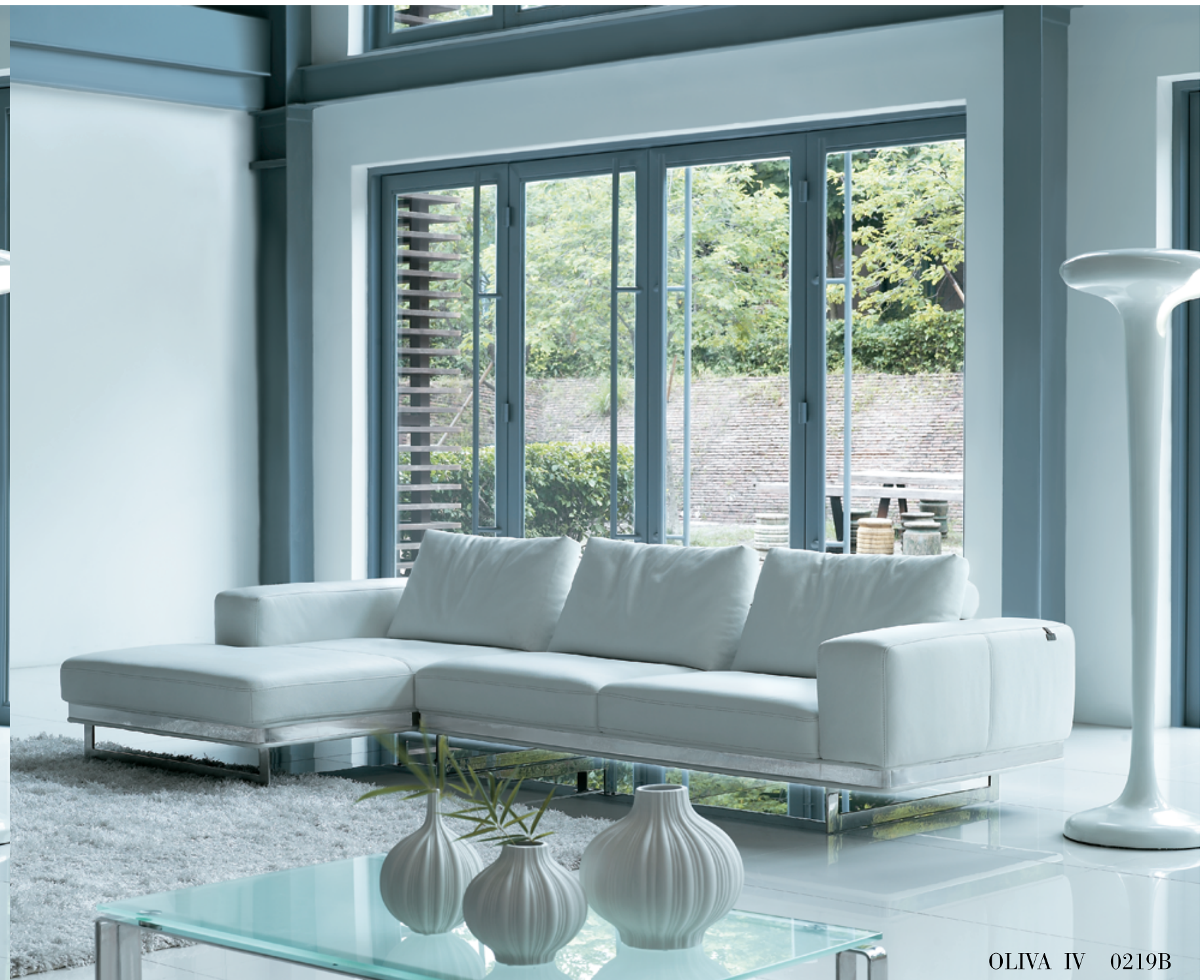
OLIVA IV 0219B

Two optional back cushions are available to choose from. The Style A offers firmer support at the back which also enhances the consistency of the cushion appearance after years of sitting.