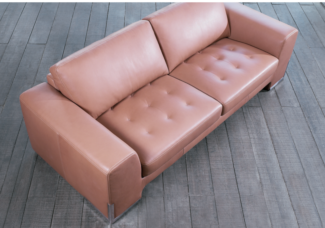
Small plus-shape stuffings in contrast stitching colors (as a standard) on seat cushions offer a lighter and more uptrend alternative to ordinary square-tufted seats.