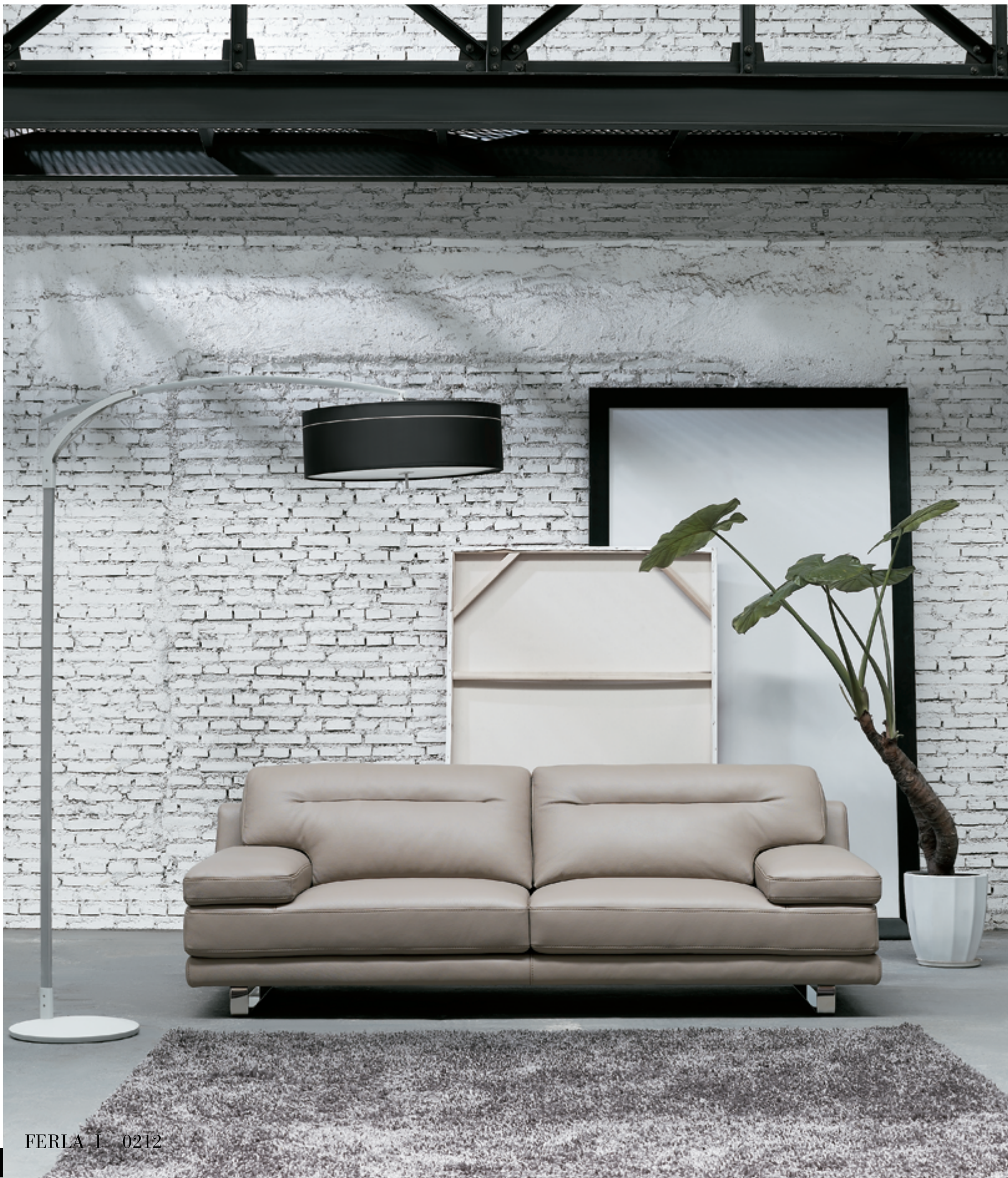
FERLA J 0212