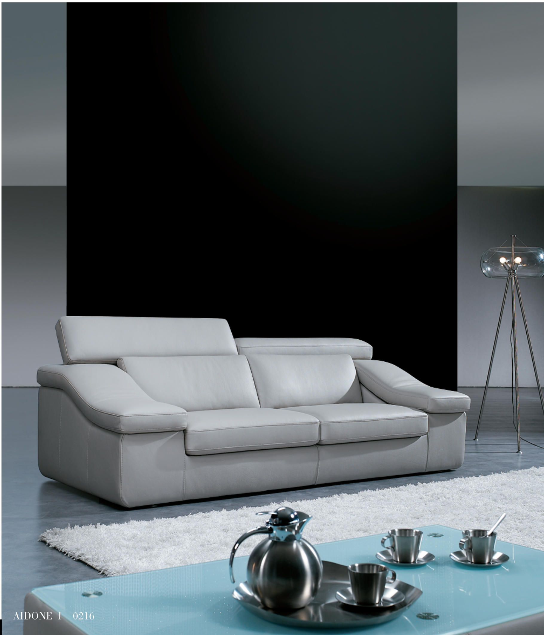
AIDONE I 0216