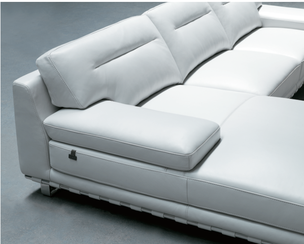
The "Zebra" effect of stainless steel tubes and leather on base frames creates a special contrast between metal with showy-gloss and leather with homey-comfort.