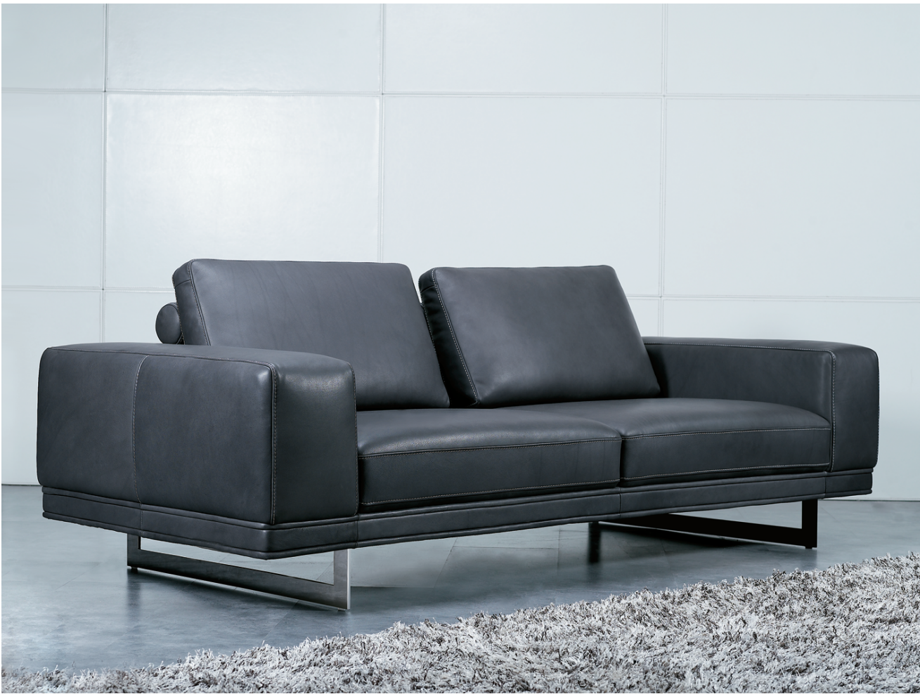
Extra thin solid stainless steel legs give a light look to the sofa design.