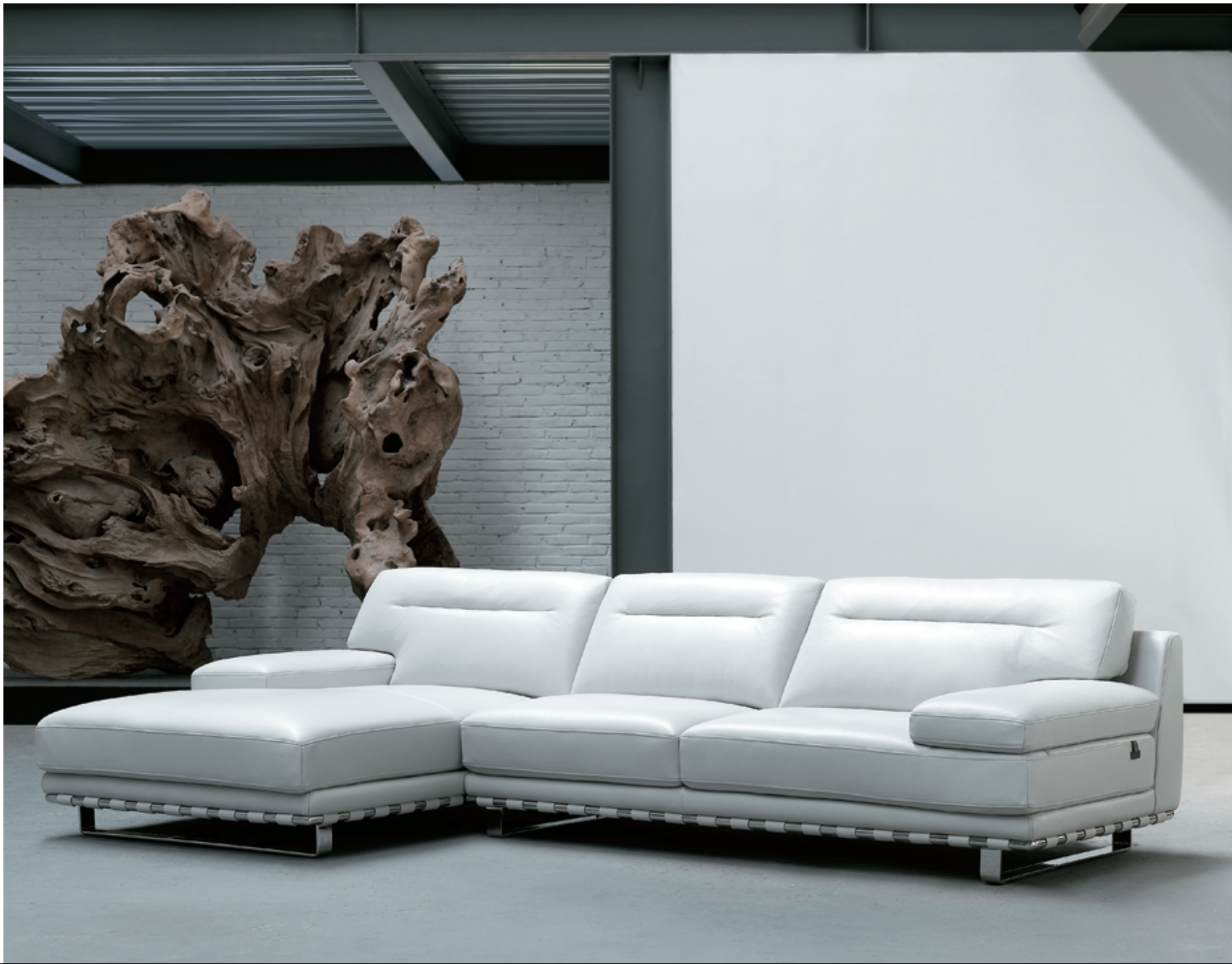
Straight line tufting on a one-piece back cushion delivers better lumbar support while sitting.