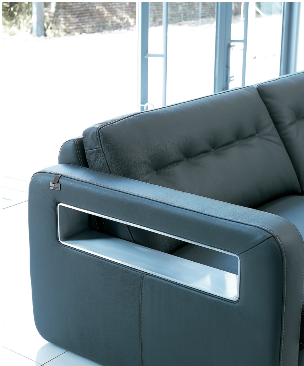
Solid aluminum frame insert (8mm thickness) within sofa arms. The aluminum inserts are placed at a bold and eye-catching level of the sofa.