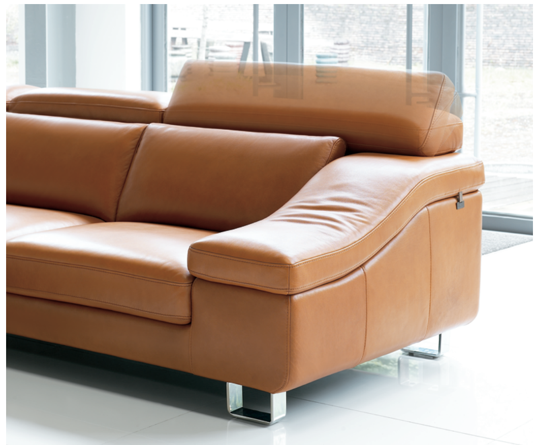
Head mechanisms from Germany with various locking positions deliver extra comfort when needed.