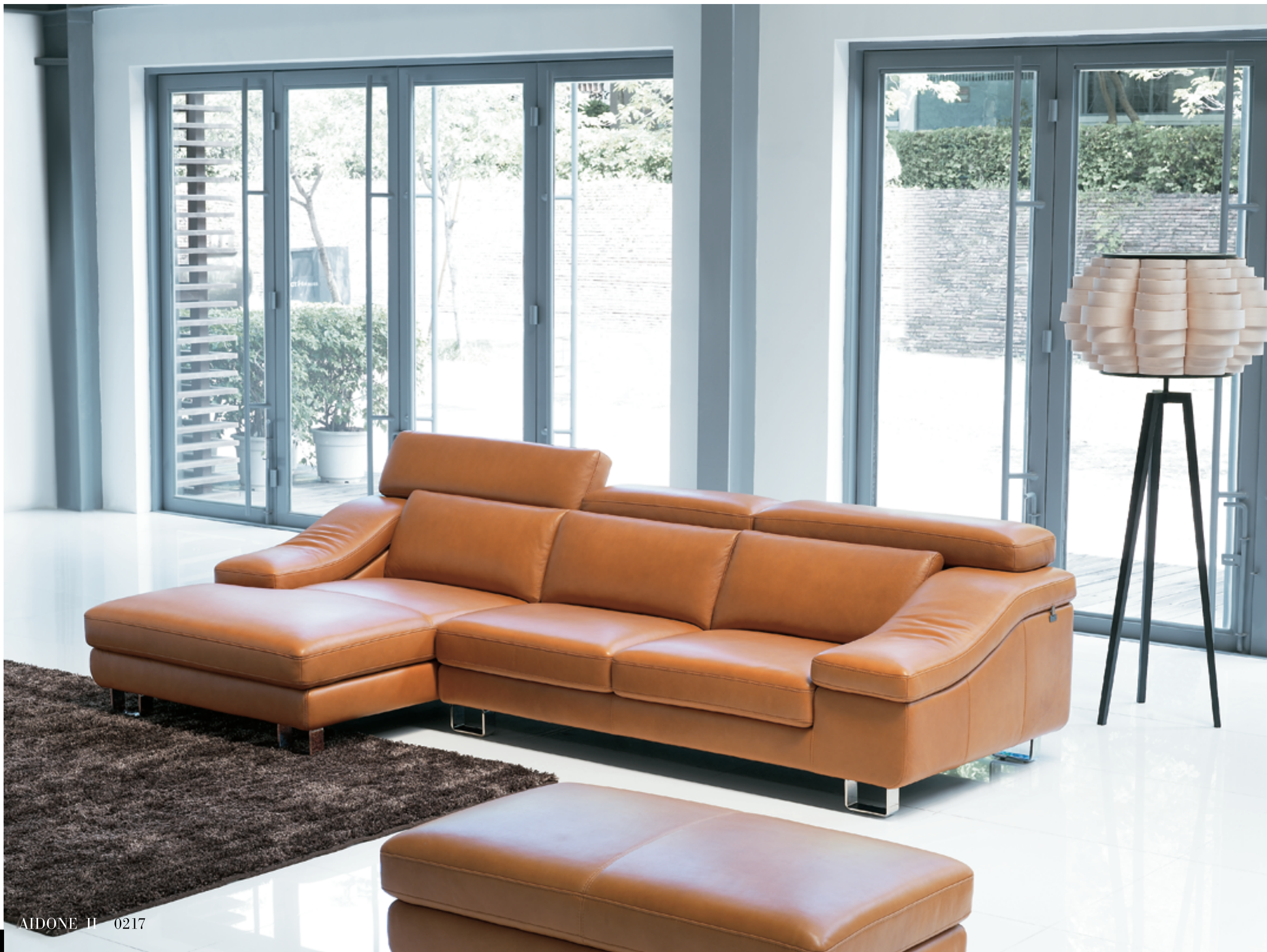
AIDONE II 0217

The back height before opening the mechanisms is the highest ever from the KELVIN GIORMANI collection. It gives the best ever comfort for a sofa with head mechanisms.