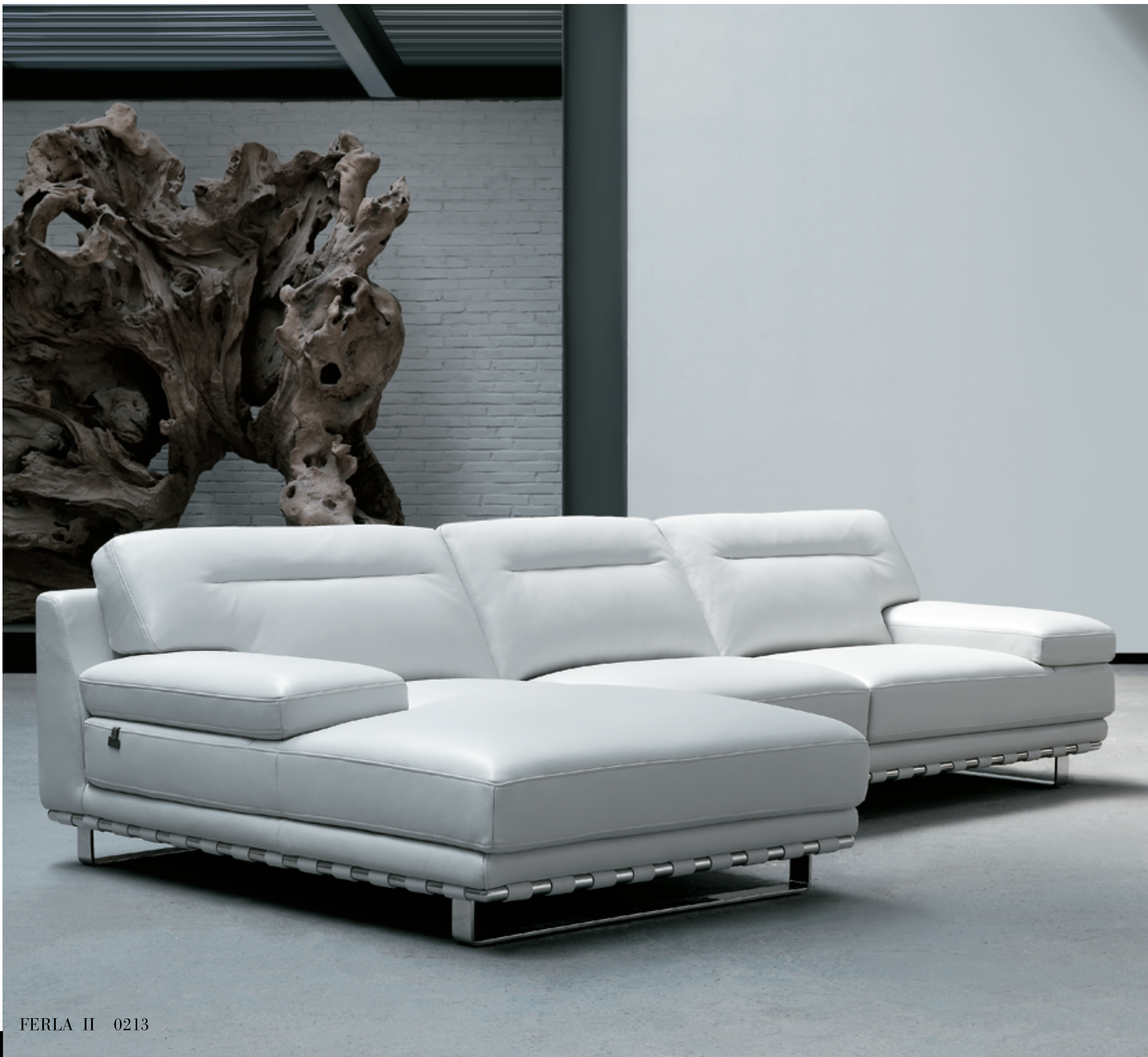
FERLA II 0213