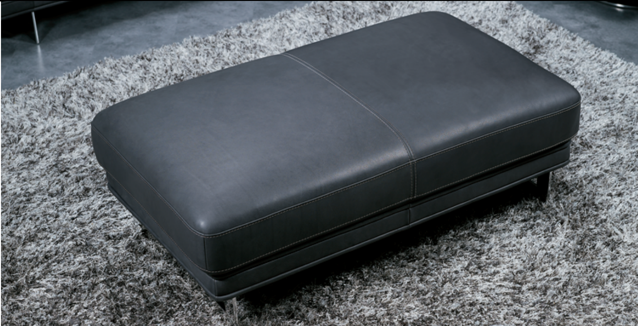
The optional stool (no. ST2) has the matching base frame and legs.