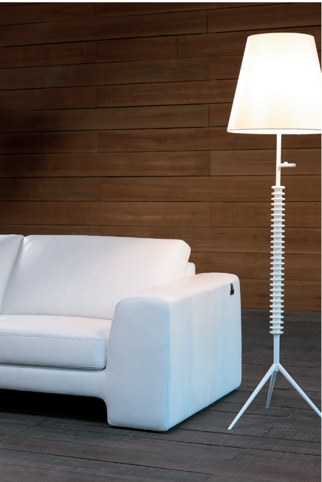
Leather legs appear to have no seam from sofa frames to legs creates a smooth continuation from frame top to bottom..