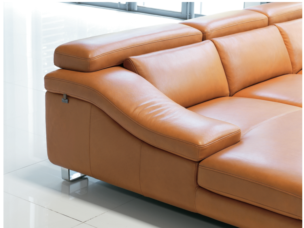
A low and flat arm design which is rarely found on sofa models with head mechanisms.