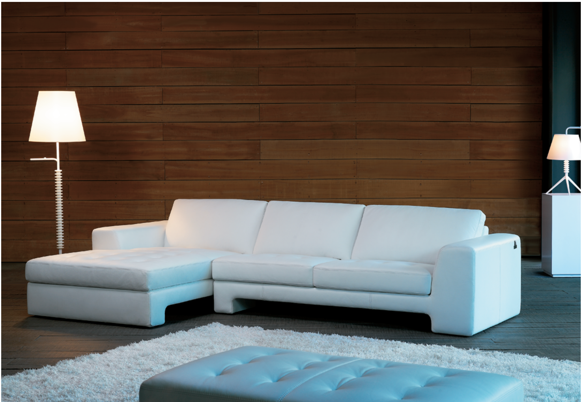
Minimalism is always an option within the KELVIN GIORMANI collection. Model COMISO I is for people who love simple lifestyle.