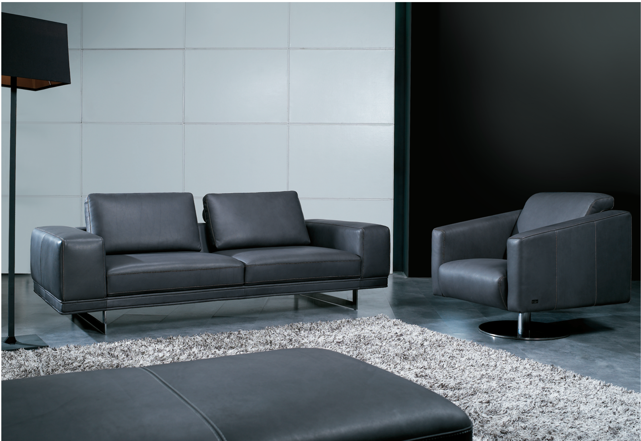
Model OLIVA III & IV are the alternative versions of the model which do not have the wide stainless steel plates. That gives an alternative for those who like the clean-cut design of Model OLIVA but want to keep the stainless steel element in a lower profile.