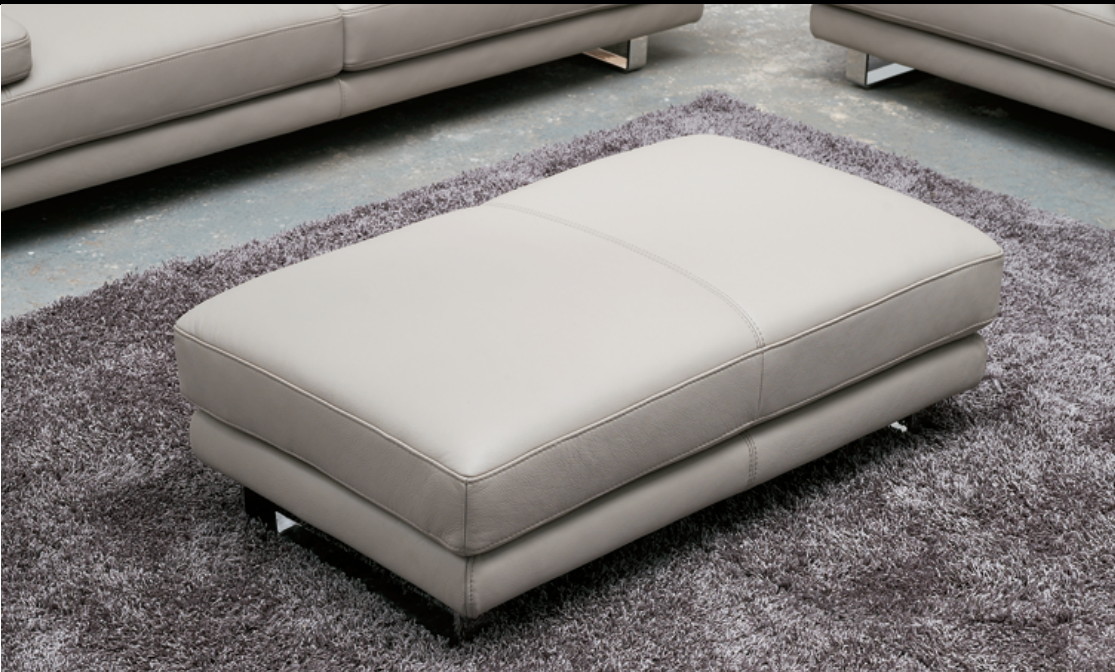
The optional stool (no. ST2) has the matching base frame and legs.