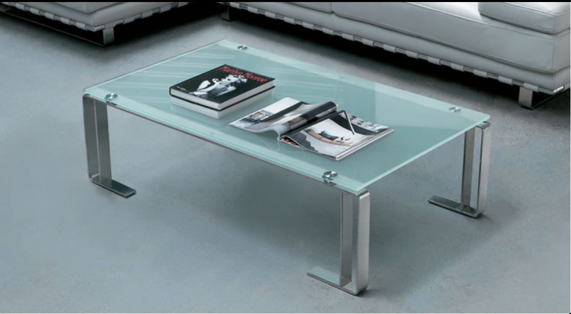
The matching coffee table (no.MTG3) comes with solid stainless legs and tempered glass.