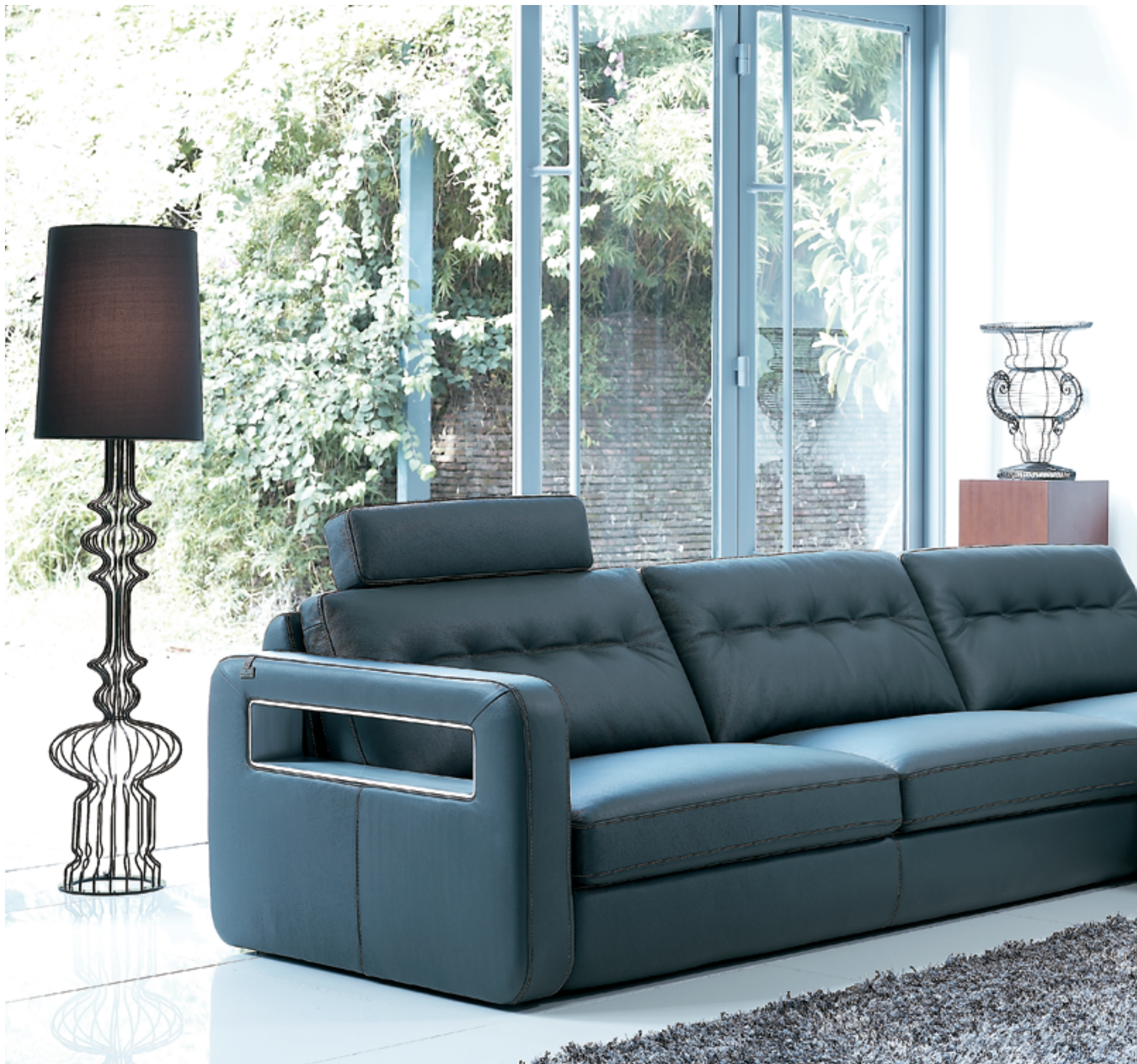
The optional headrest (no. HR2) gives additional support from neck to head.