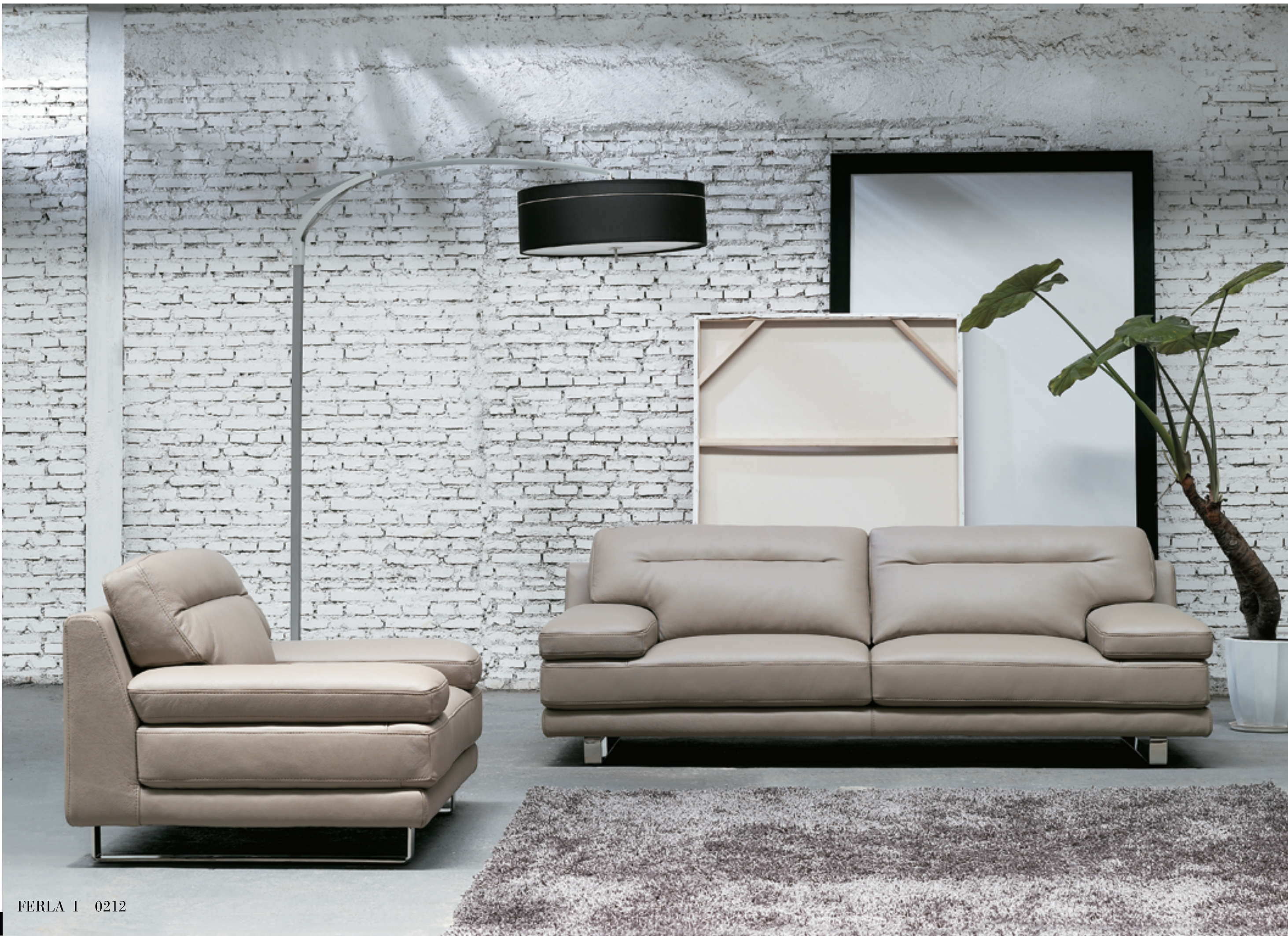
FERLA I 0212

Model FERLA I is the minimal version of the model. Now, the design focus will be on the beauty of the horizontal lines at various levels as well as the particular sitting comfort.