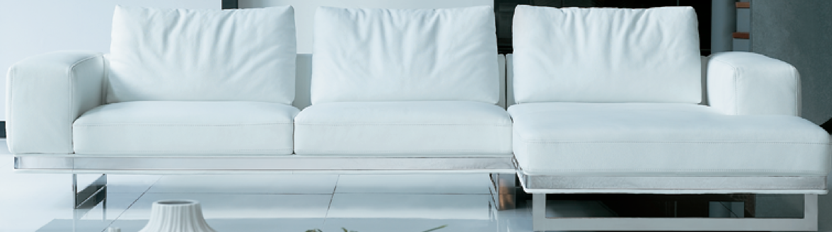
Modern Sofas with Showy Details