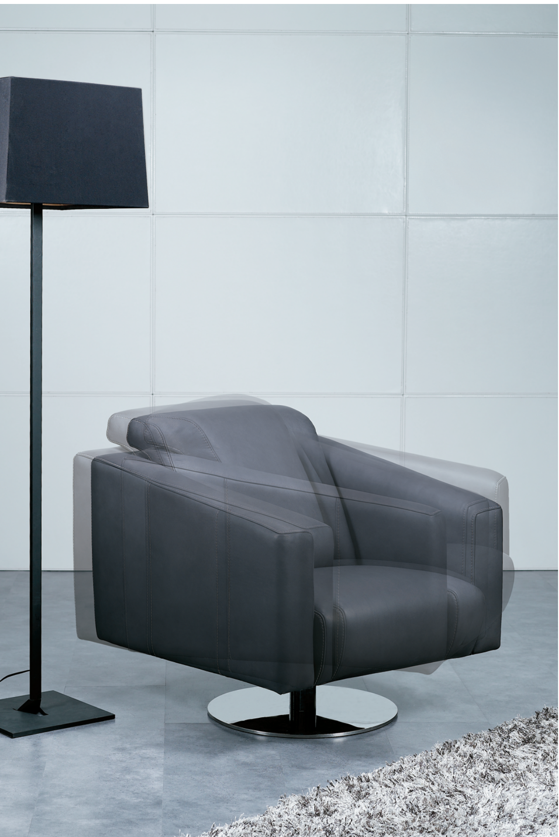
The matching armchair, Model RIANO (no. AC43), comes with the swivel function and clean-cut chrome base. There is an alternative design, Model MICELI (no. AC44), which does not have the swivel function nor the chrome base (please check P. 72)