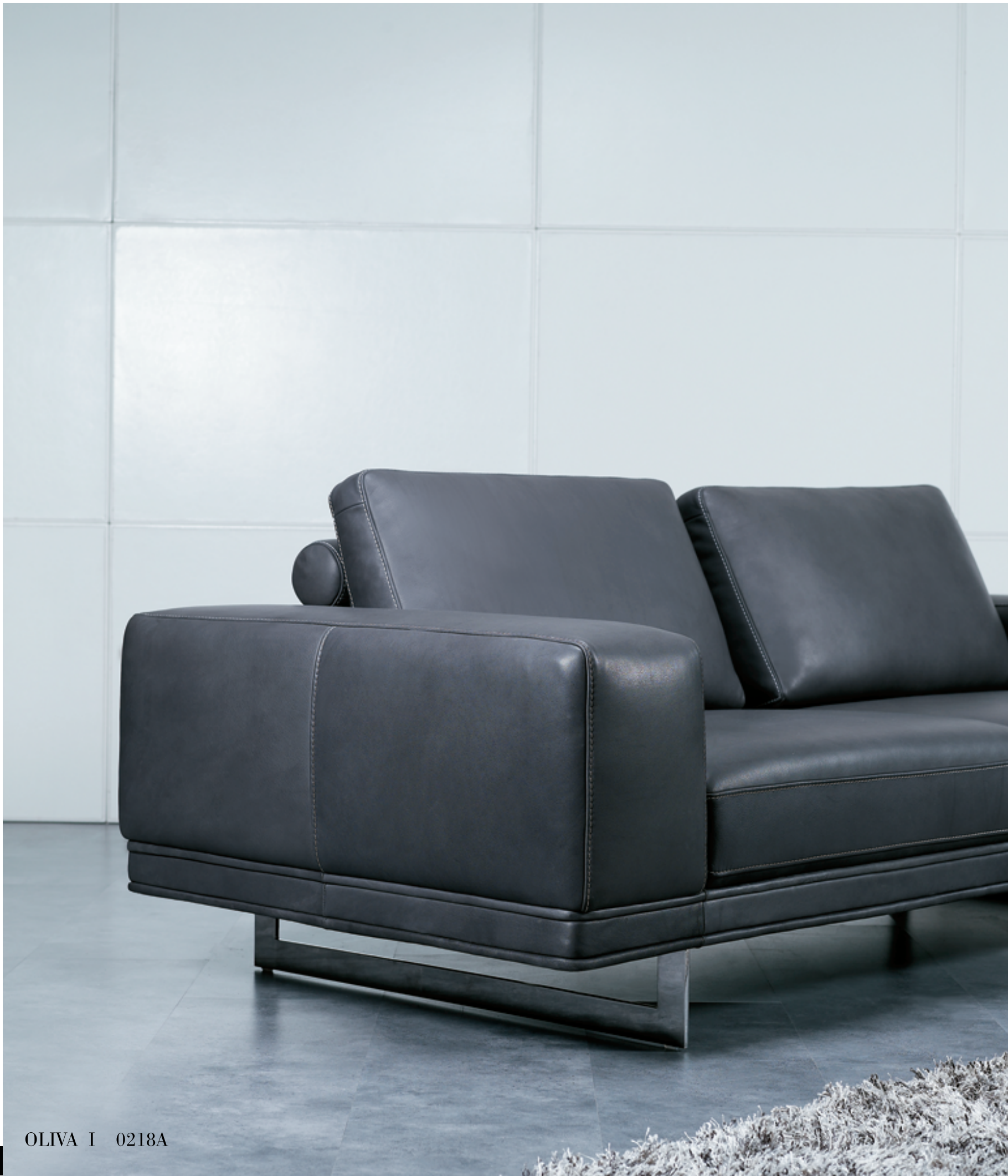
OLIVA I 0218A