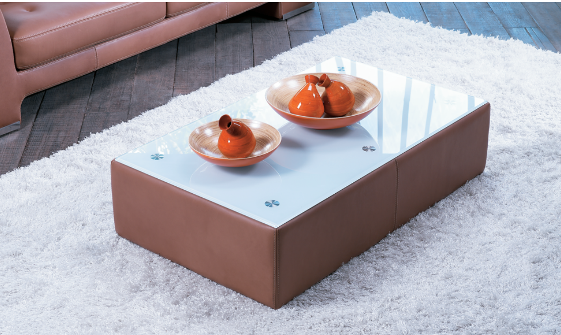
The optional coffee table (no. STG3W) can always be custom-made with the matching leather color of the leather sofa group.