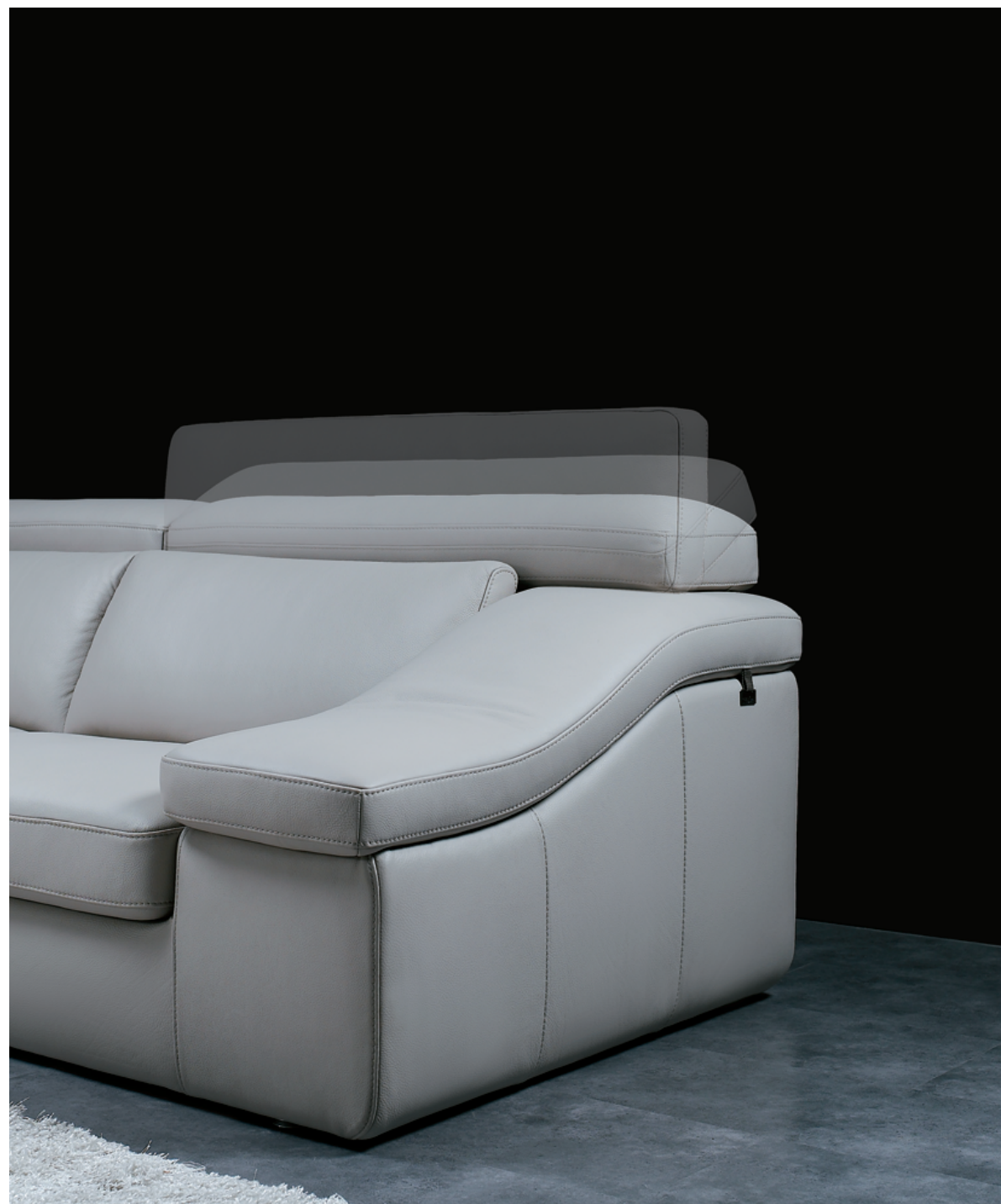
Model AIDONE I is simply a version of the model without the stainless steel legs.. It shows the beauty of pure leatherwork