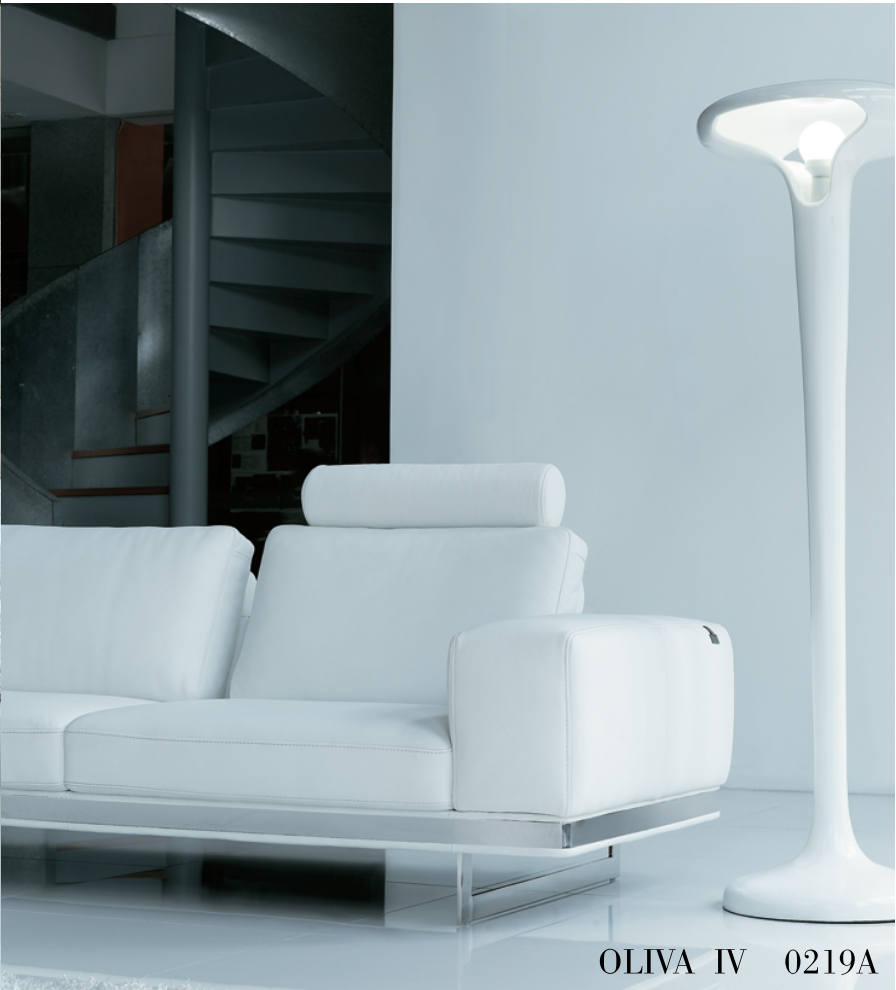
OLIVA IV 0219A

The optional headrest (no. HR2) gives additional support from neck to head.