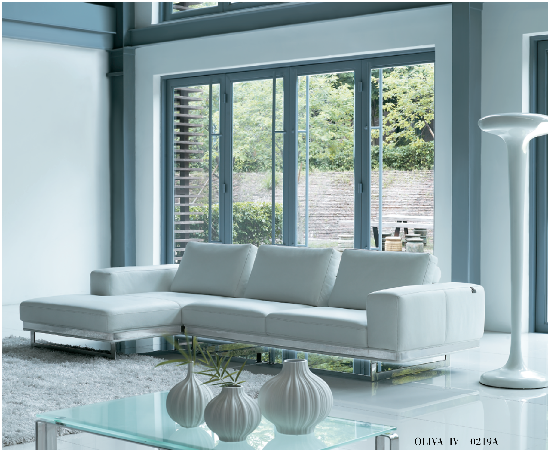
OLIVA IV 0219A

Two optional back cushions are available to choose from. The Style A offers firmer support at the back which also enhances the consistency of the cushion appearance after years of sitting.