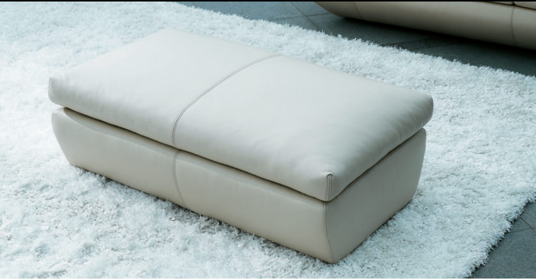
Optional stool (no. ST2) resembles the clean design of the sofa seat frame front.