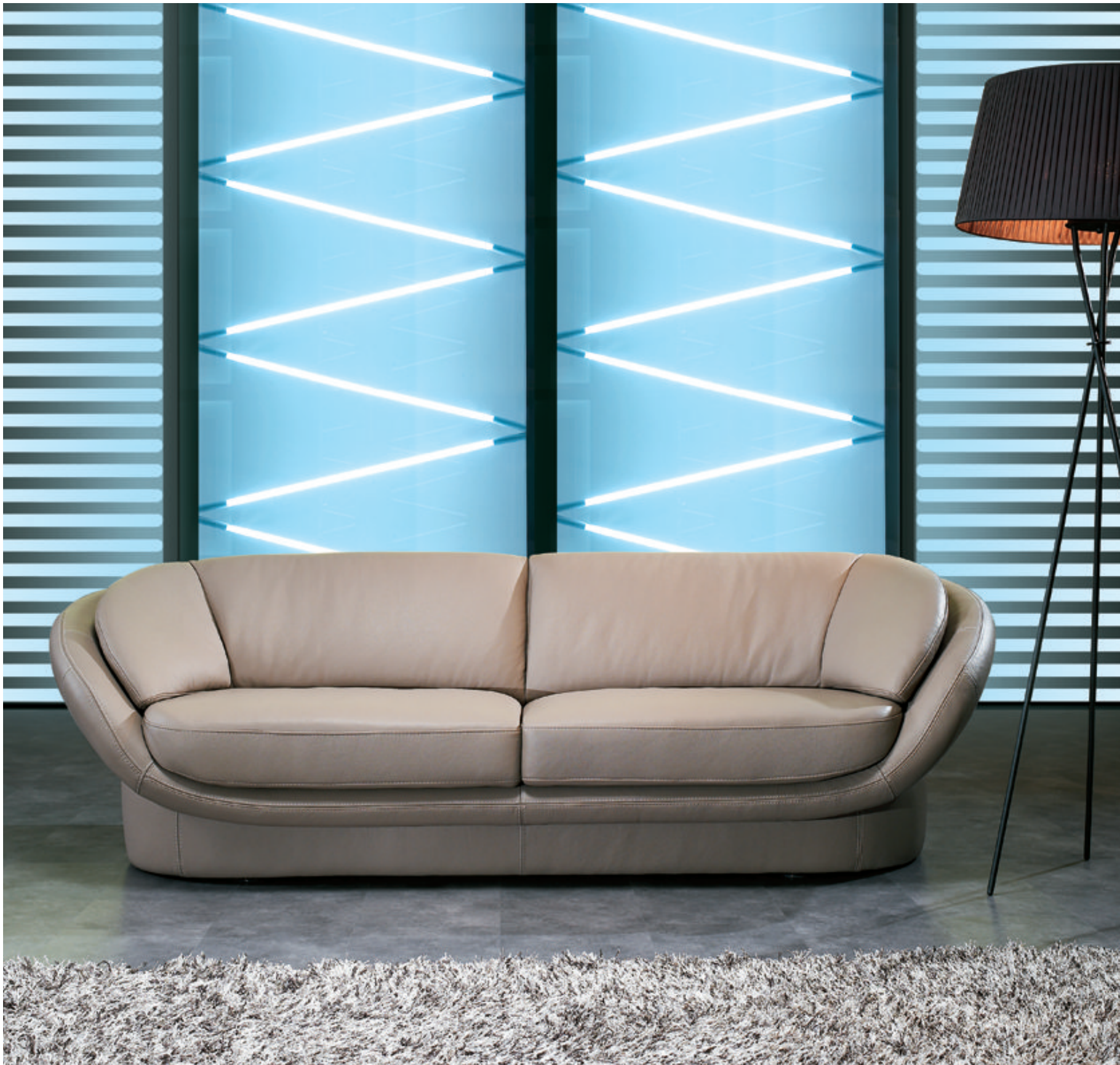
The clean version, TODINA I, possesses a clean-look at the seat cushion top.