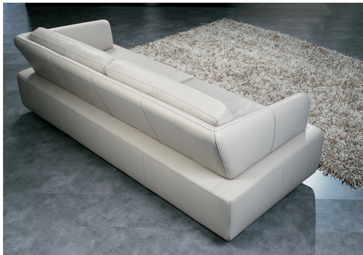
The inclined and slim-look back frame of Model VIESTE "cuts" onto the seat frame illustrate the beauty of simple-but-not-ordinary.