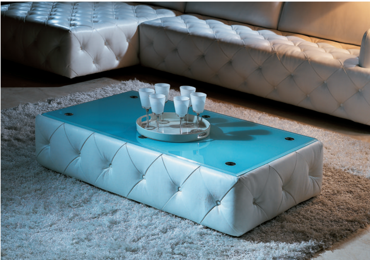
Optional coffee table (STG3W) resembles the "chesterfield" tufted button feature which matches perfectly with the sofa seat frame of Model VIESTE II.