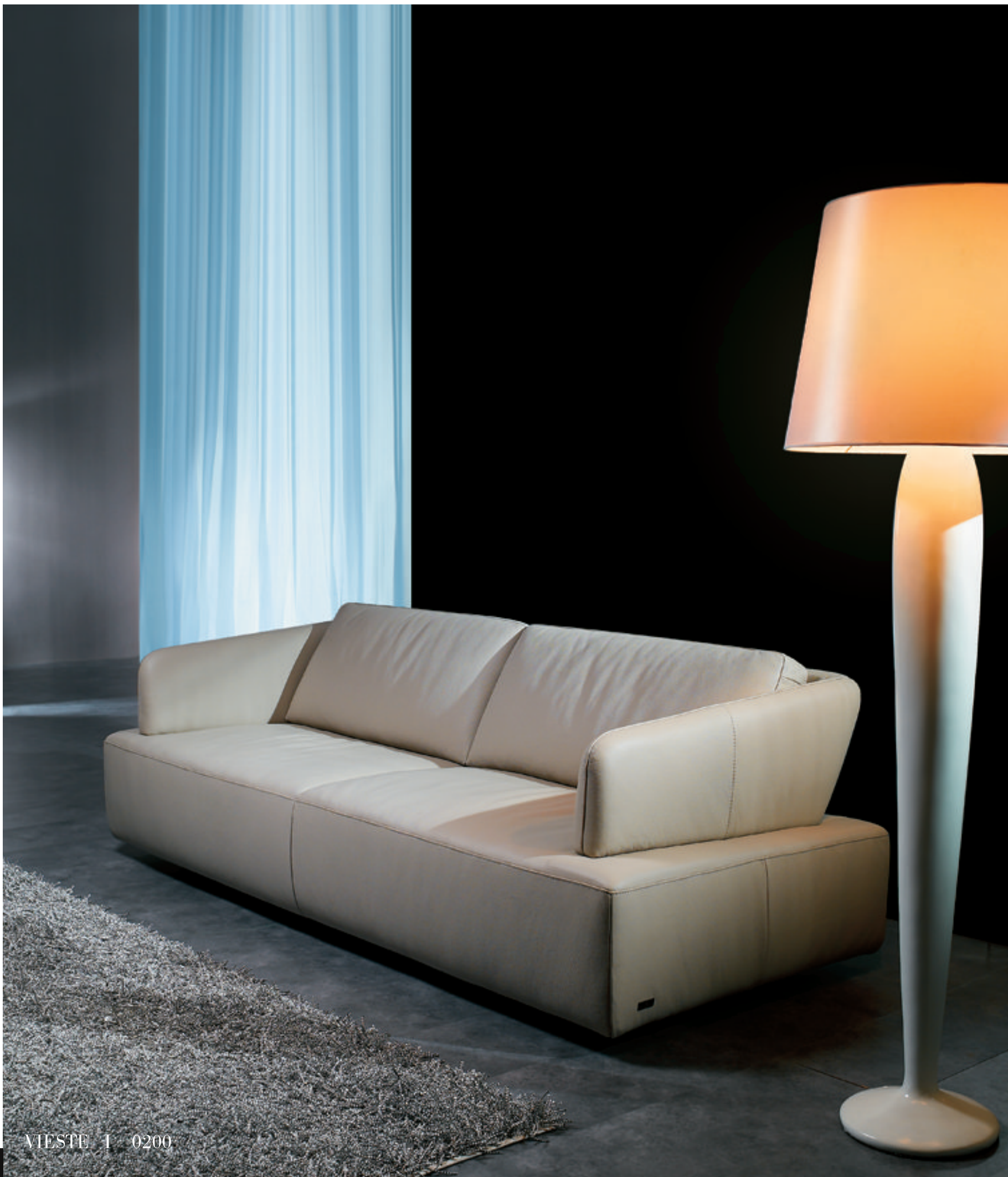
VIESTE 1 0200