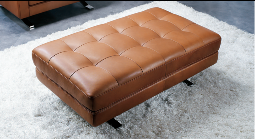
Optional stool (no. ST2) comes with matching solid stainless steel legs (12mm thick).