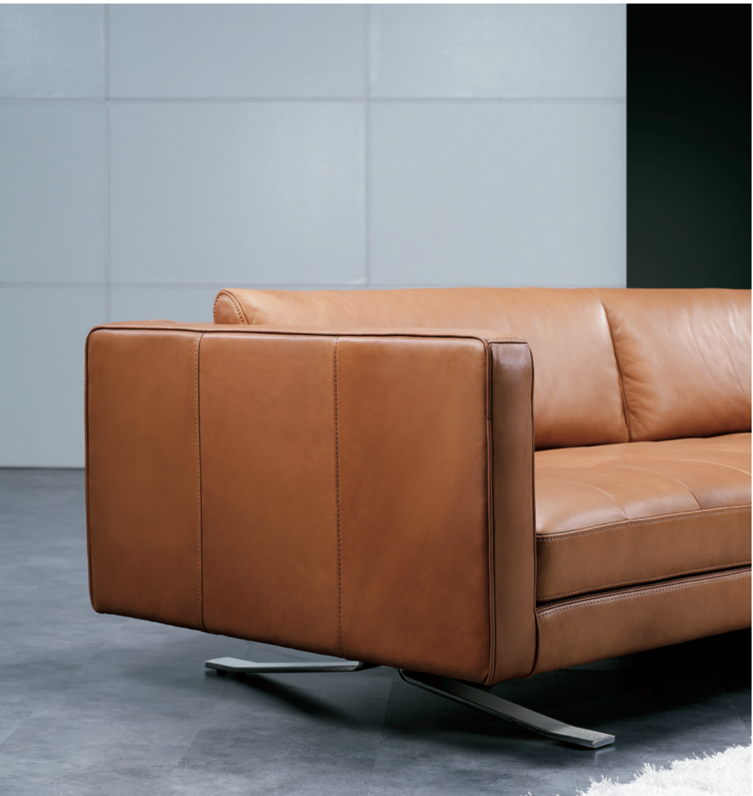
The new solid stainless steel leg (12mm thick) of Model SORANO is an upgrade from Model FORETTI.