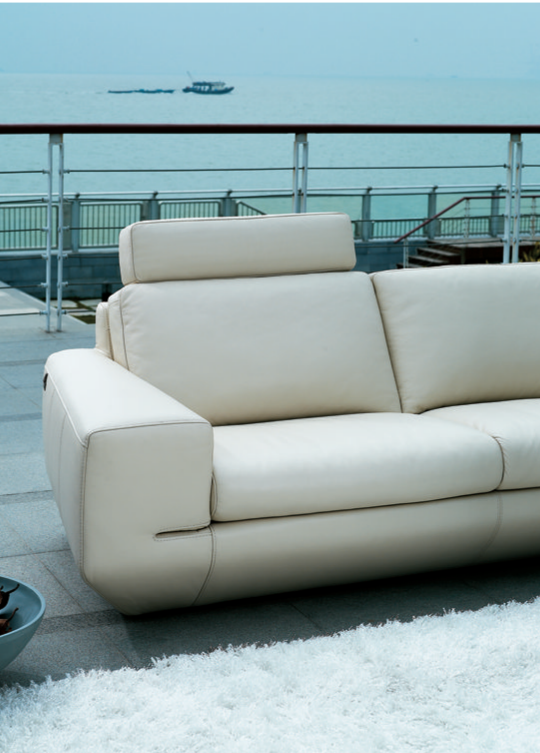
Optional headrest (no. HR2) creates extra support and comfort for your head.

"To Taper for Better" is the design statement for Model NEPI. The tapered sofa arms, the tapered sofa base and the tapered chaise terminal give the clean-and-simple design sofa some eye-catching elements.