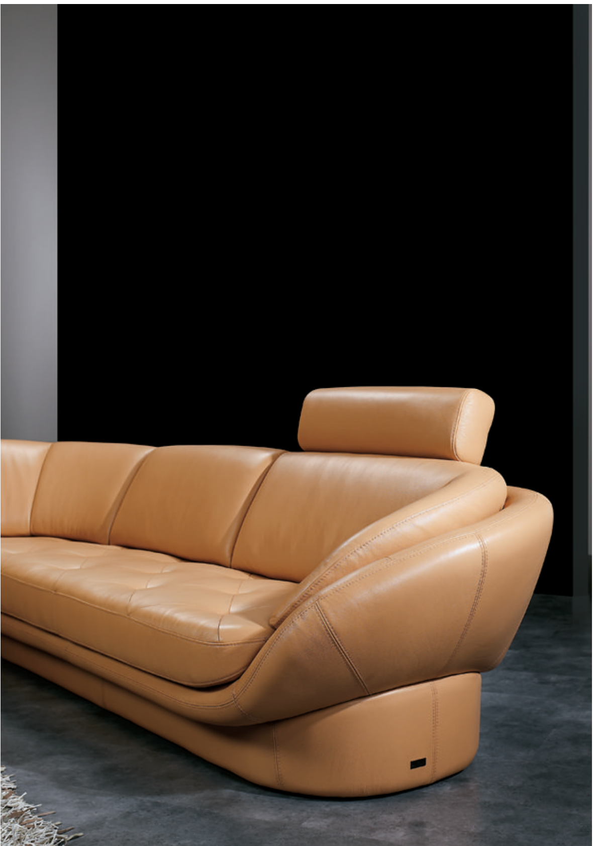
Optional headrest (no. HR2) creates extra support and comfort for your head.