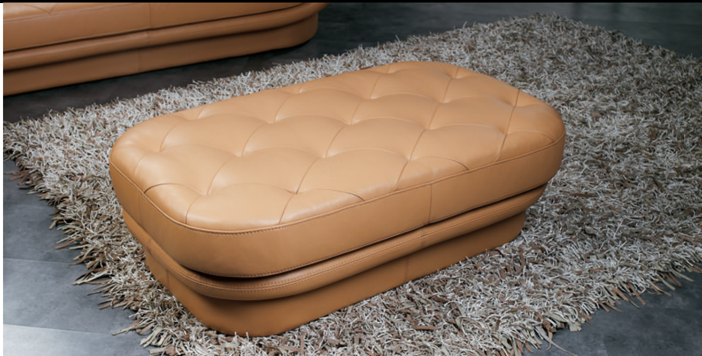
Optional stool (no. ST2) resembles the tufted diamond-shape cuttings of the seat cushion tops and the double seat frames.