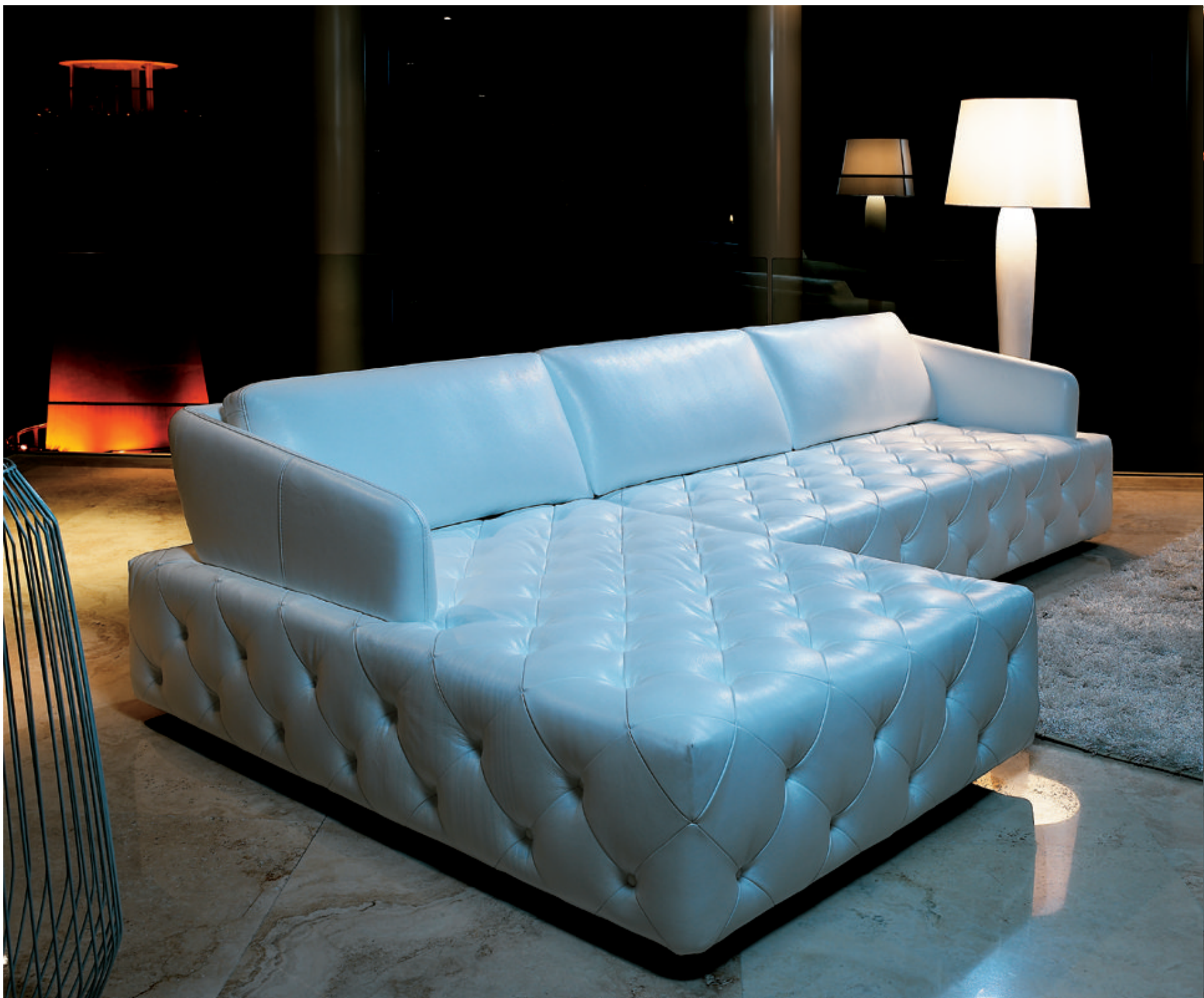
The showy version, Model VIESTE II, presents the cross-over between modern minimalism and classic sofa feature of "chesterfield" tufted buttons.