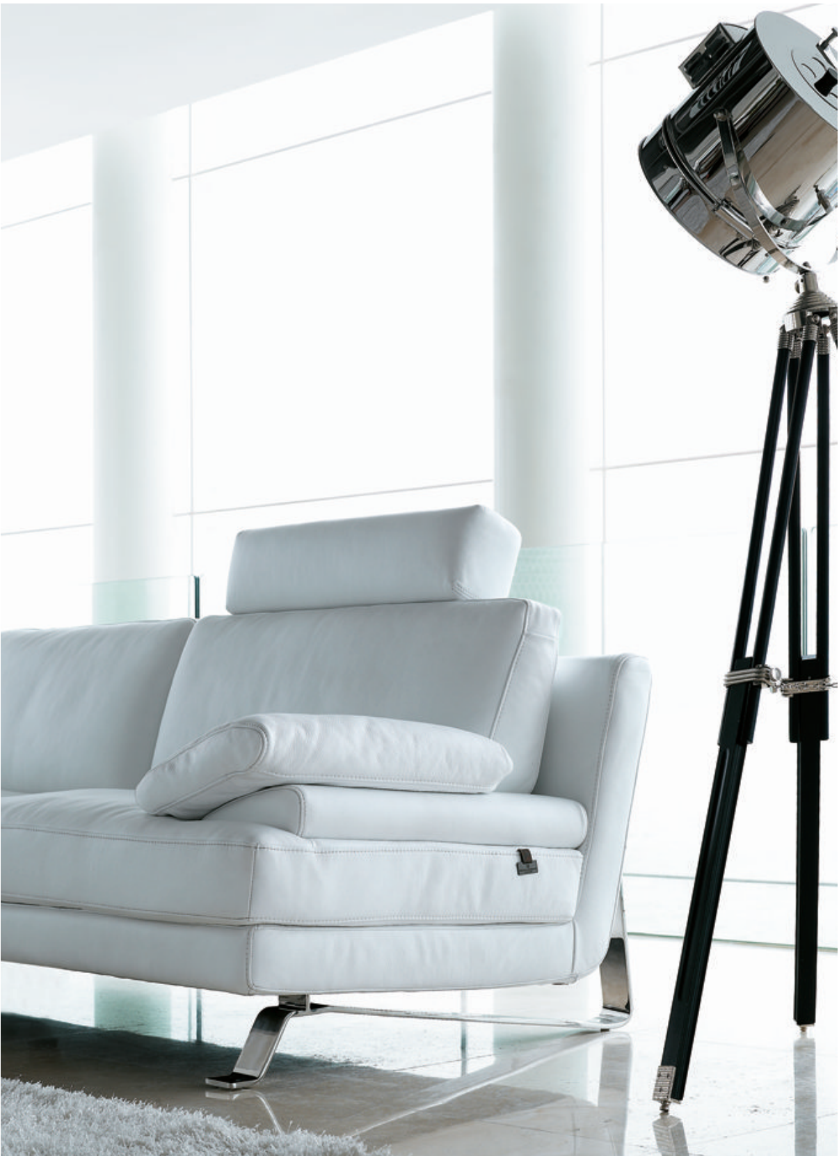
Optional headrest (no. HR2) creates extra support and comfort for your head.