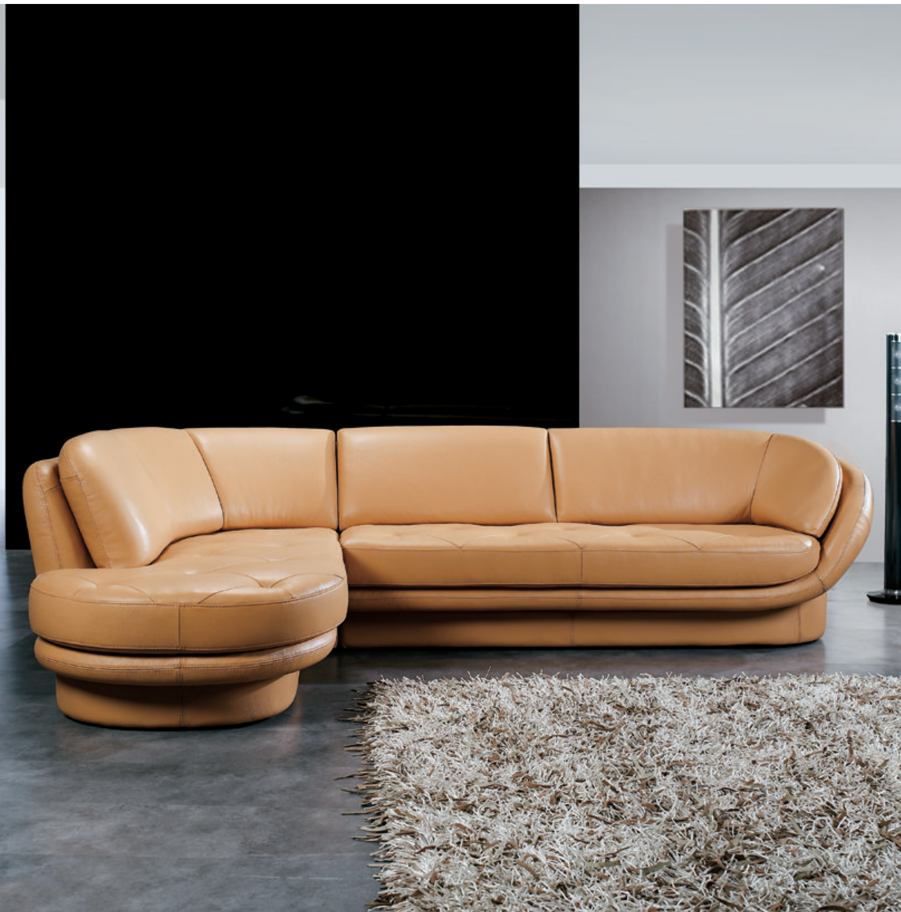
The reduced-size sofa double-base not only creates a vivid segmentation between the seat frame and the sofa base, it also gives a lighter appearance to Model TODINA.