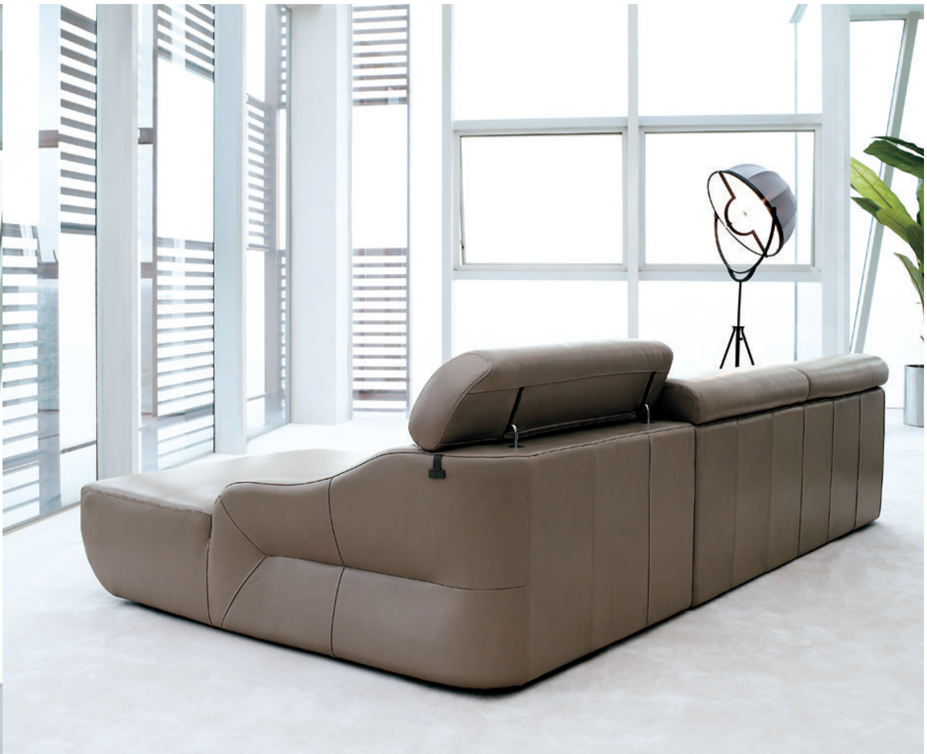
German-made head mechanisms (with various locking positions) offer extra comfort and head support when needed.