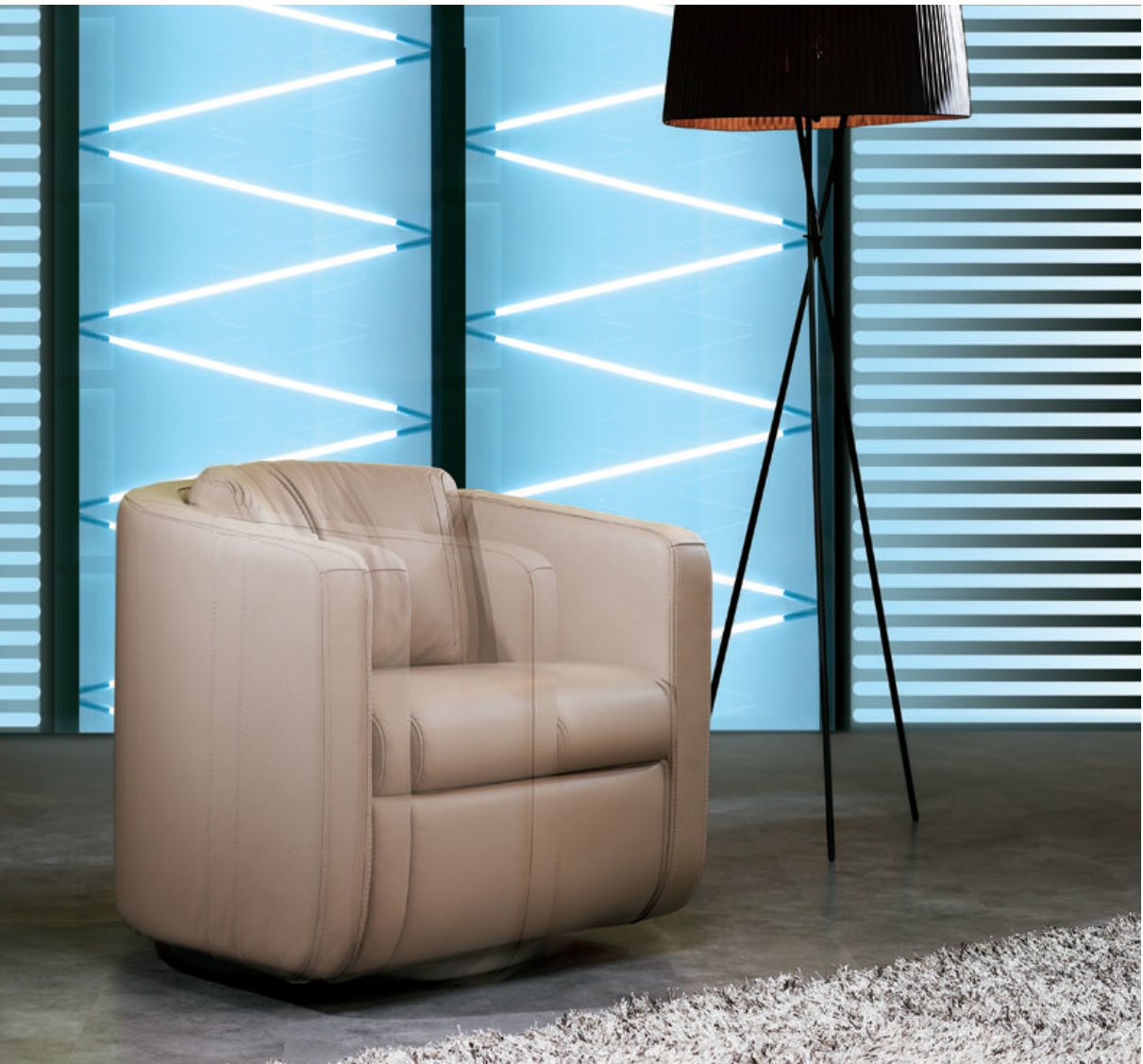
The ALVIANO (no. AC 42) armchair has an option with swivel base.