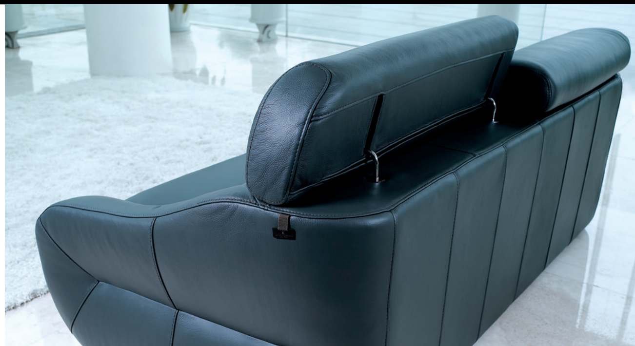
German-made head mechanisms (with various locking positions) offer extra comfort and head support when needed.