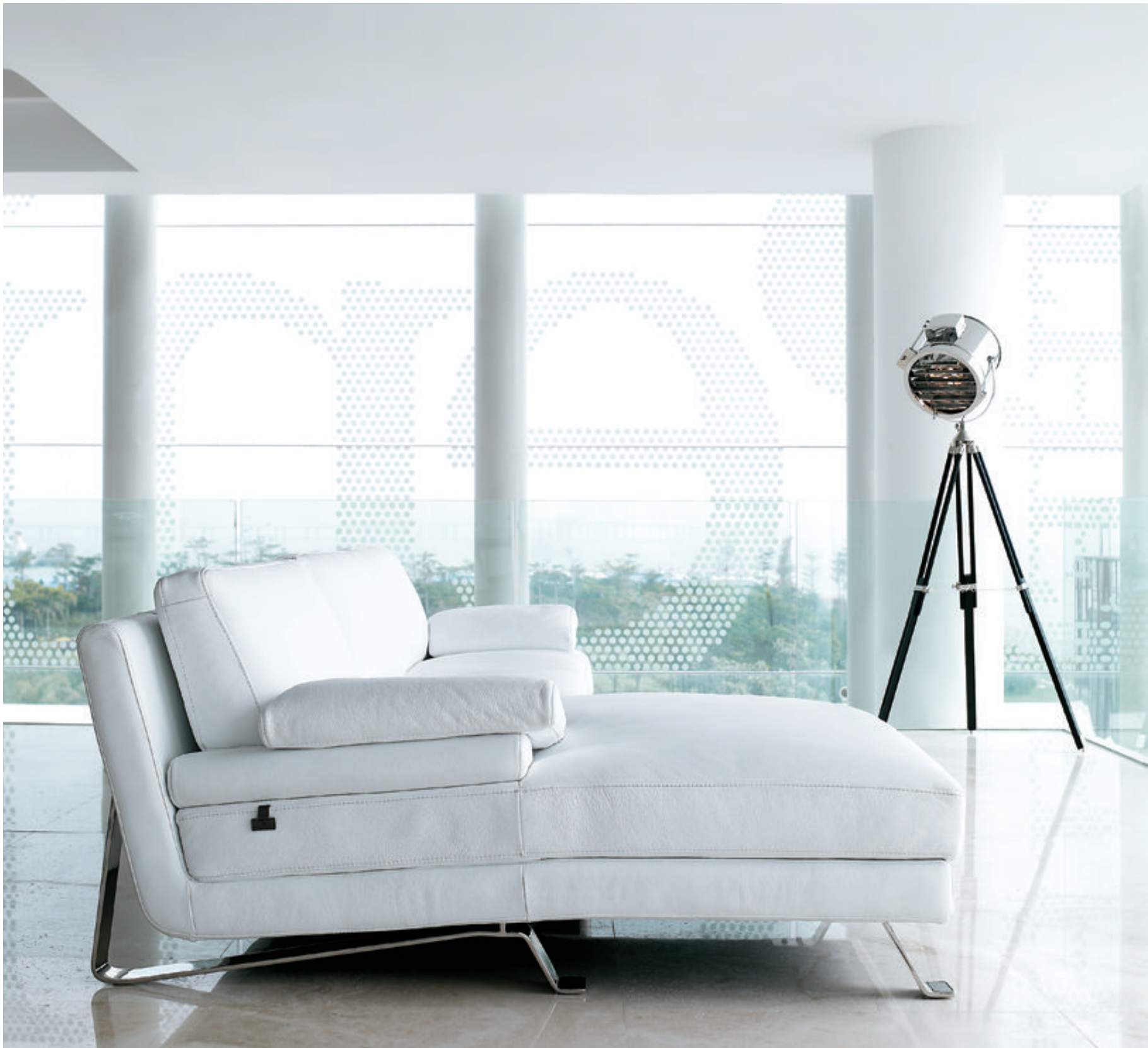
The 10mm thick solid stainless steel sofa legs give a strong foundation to the light-and-simple framework of Model GIANO.