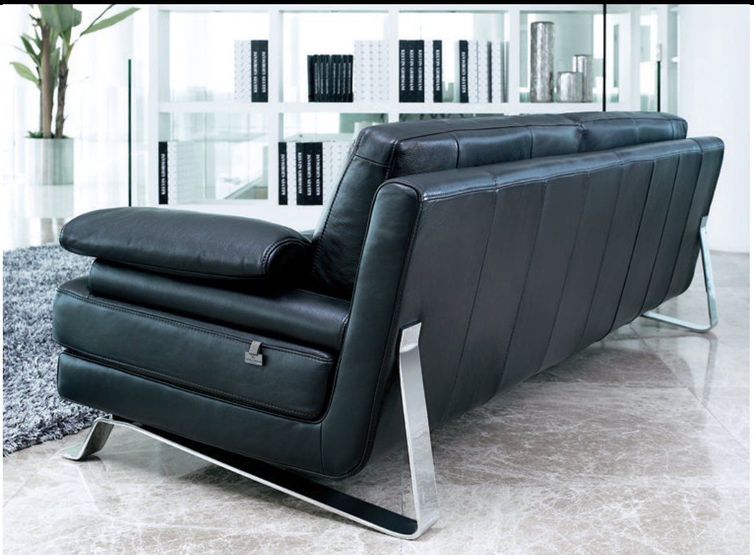
The unique L-shape of the sofa leg brings the attention to Model GIANO all the way from the front through the side to the back of the sofas.