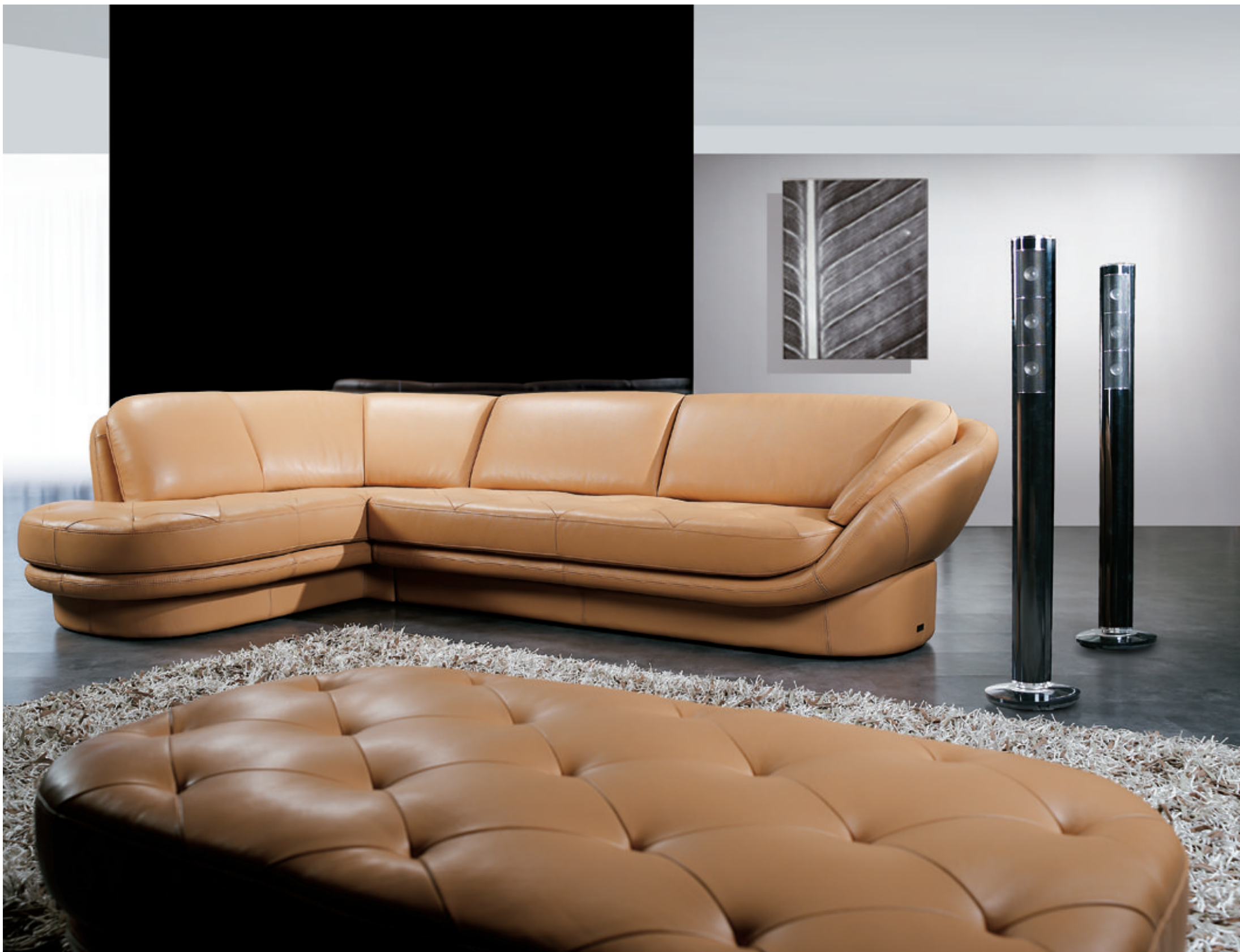
The tufted diamond-shape cuttings on the seat cushion tops of Model TODINA II gives the model additional value for those who appreciate extra handwork and showy details.