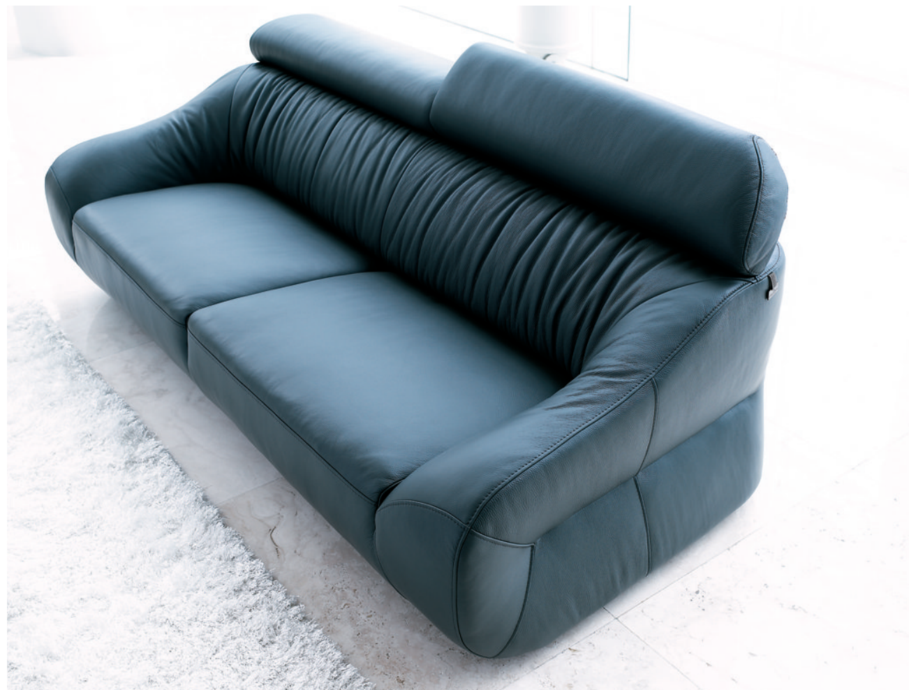
The various curves at the side of the sofa connect one another all the way from the base through the arm to the movable head support. They constitute a "S" shape resembles a beautiful human body curve.