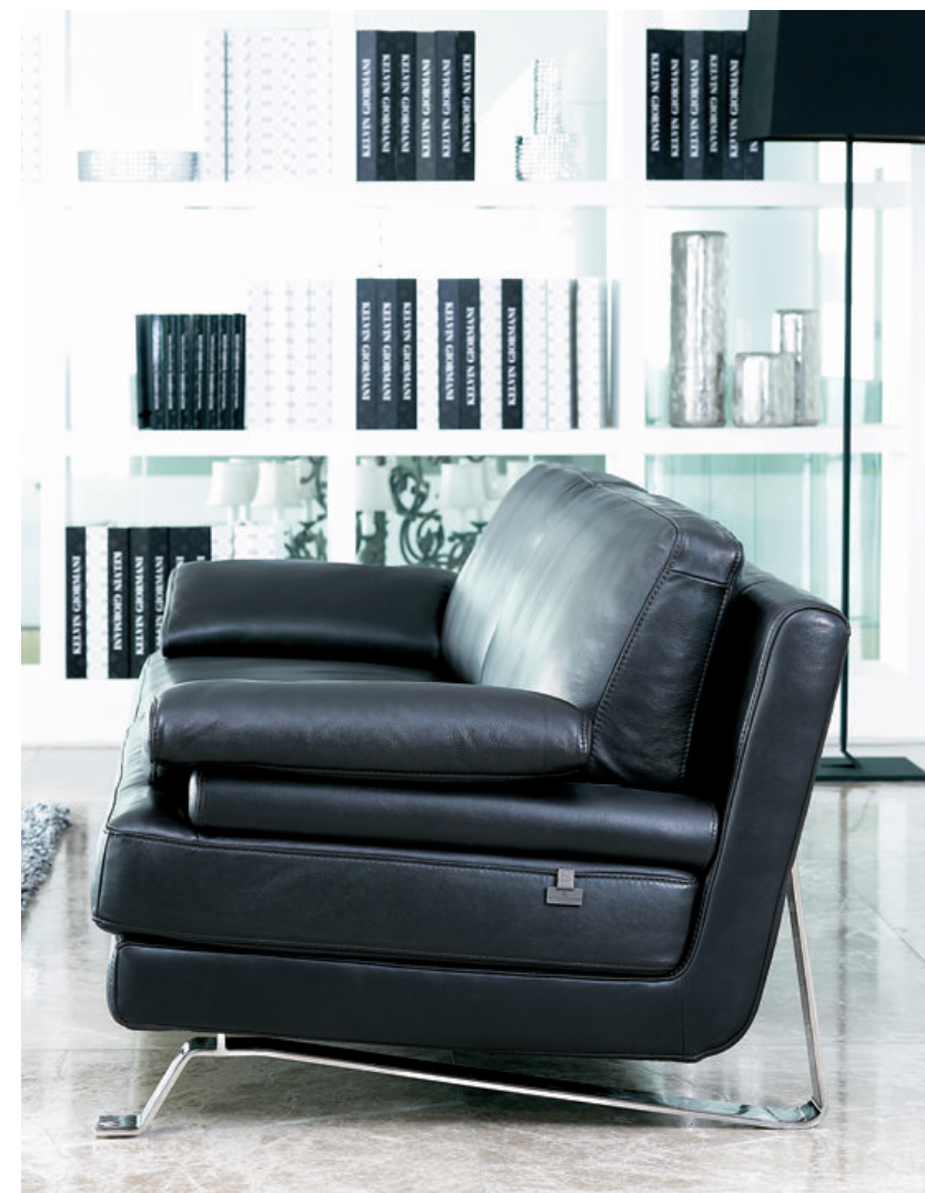
Model GIANO is a clean-cut and timeless model which has its unique design element on its sofa legs.