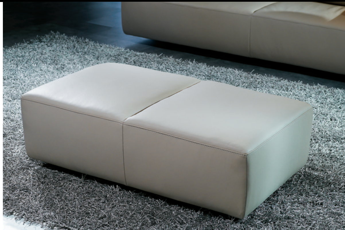
Optional stool (no. ST2) resembles the clean design of the sofa seat frame top and front.