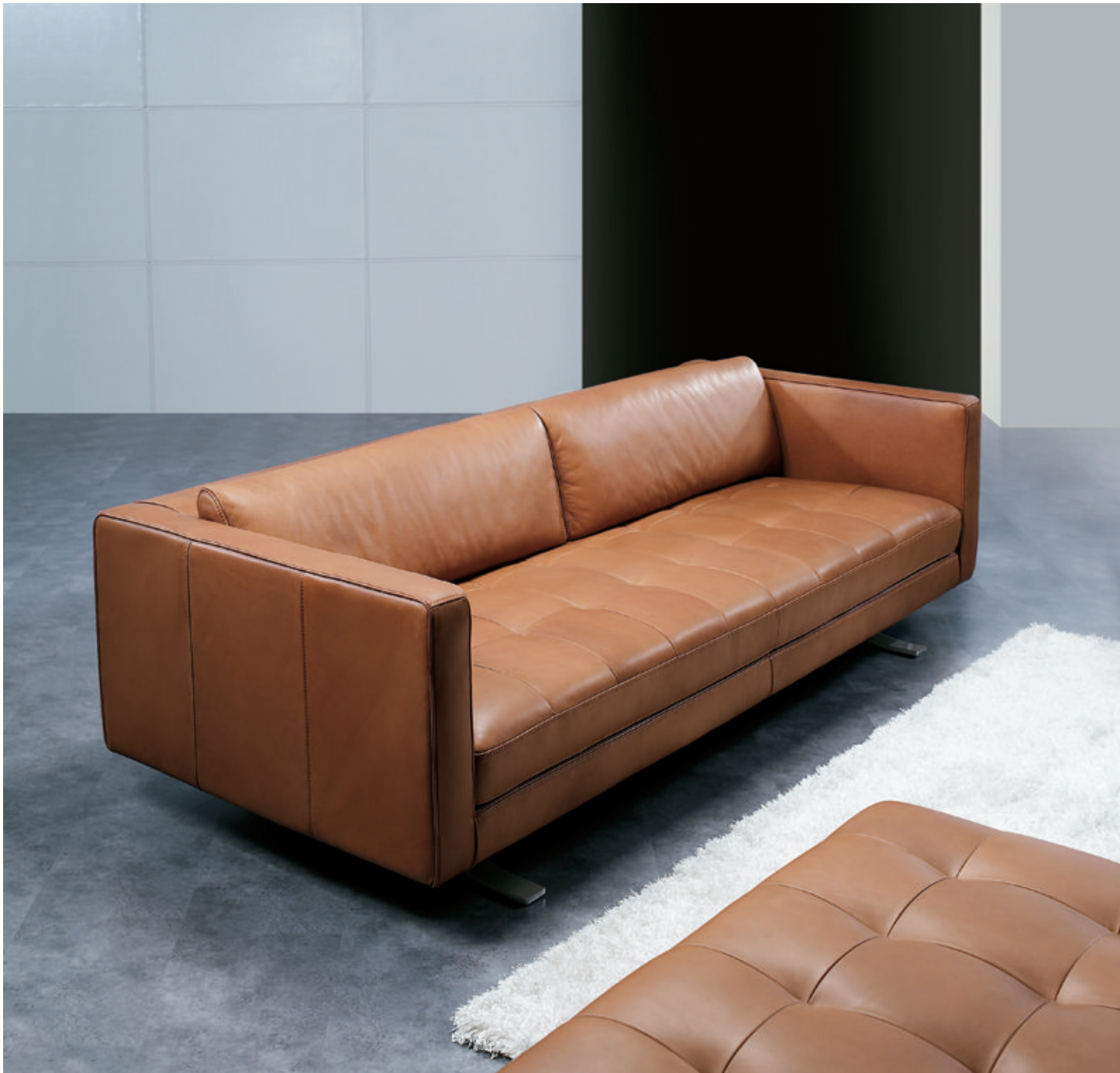
The tufting effect, only on the seat tops is a feature for those who are fond of detail craftsmanship on sofas.