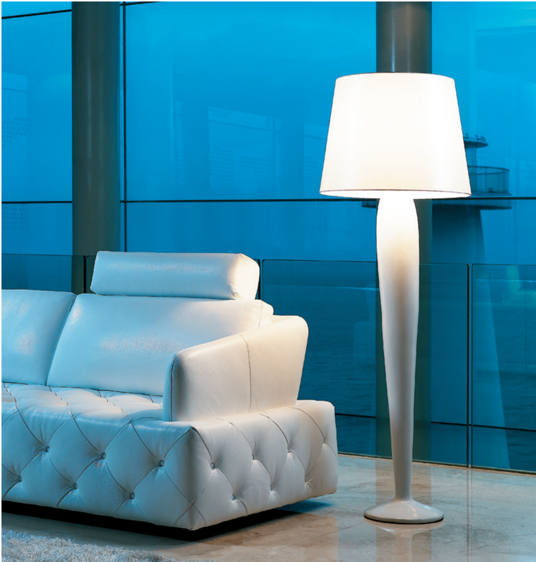
Optional headrest (no. HR2) creates extra support and comfort for your head.