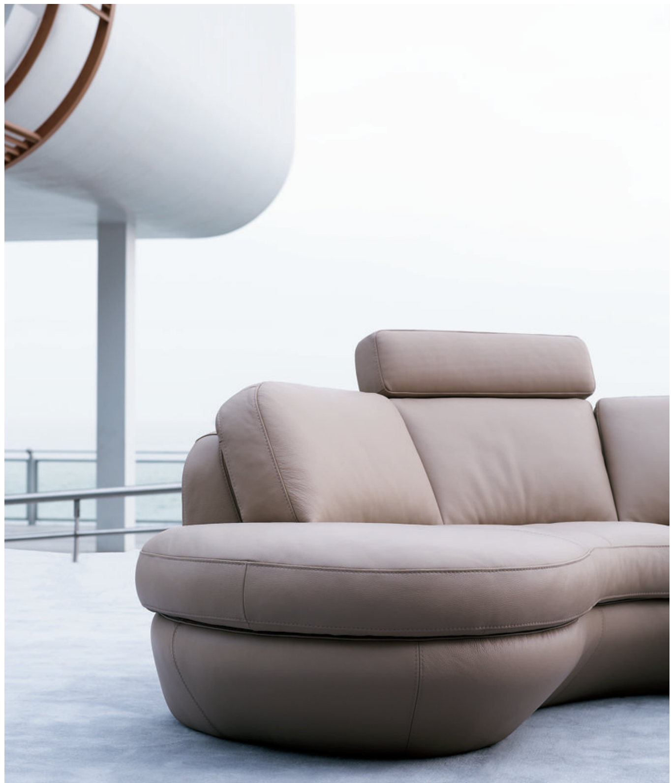
Optional headrest (no. HR1) creates extra support and comfort for your head.