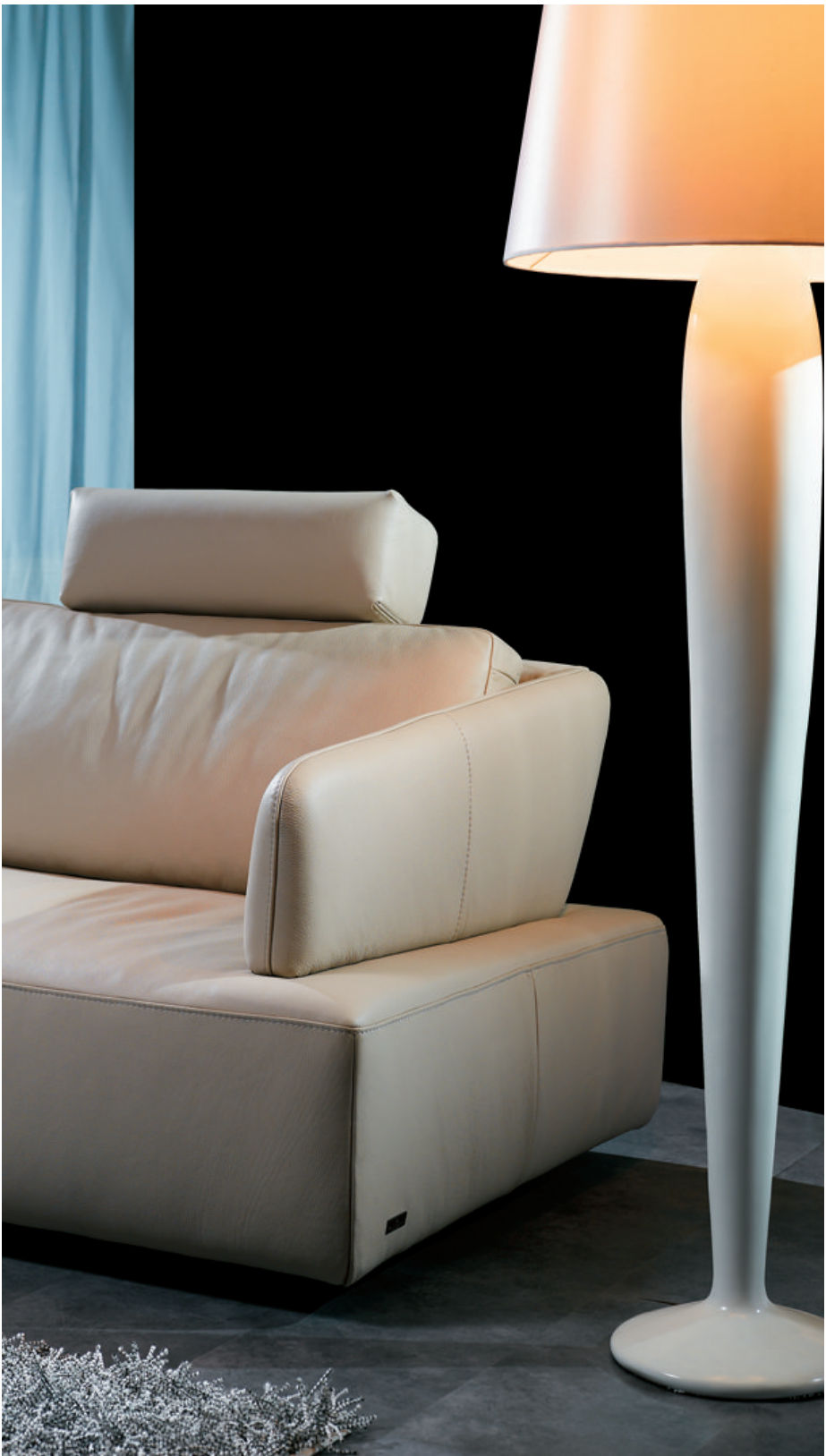
Optional headrest (no. HR2) creates extra support and comfort for your head.