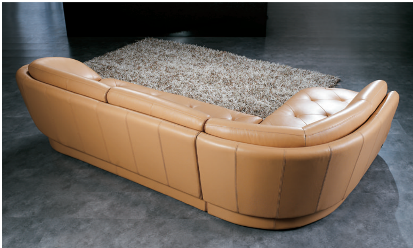
The round concept defines almost all facets of Model TODINA. It offers a design alternative for those who want something different from the conventional square-look on European modern style sofas.