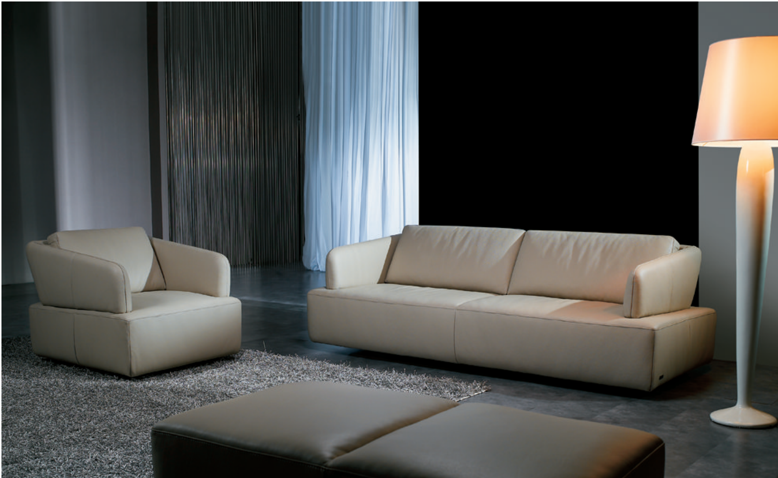
The square-and-clean seat frame plus the single continuation of back frame and sofa arm constitute a timeless sofa piece which presents the minimalistic side of the KELVIN GIORMANI Spring 2010 Collection.