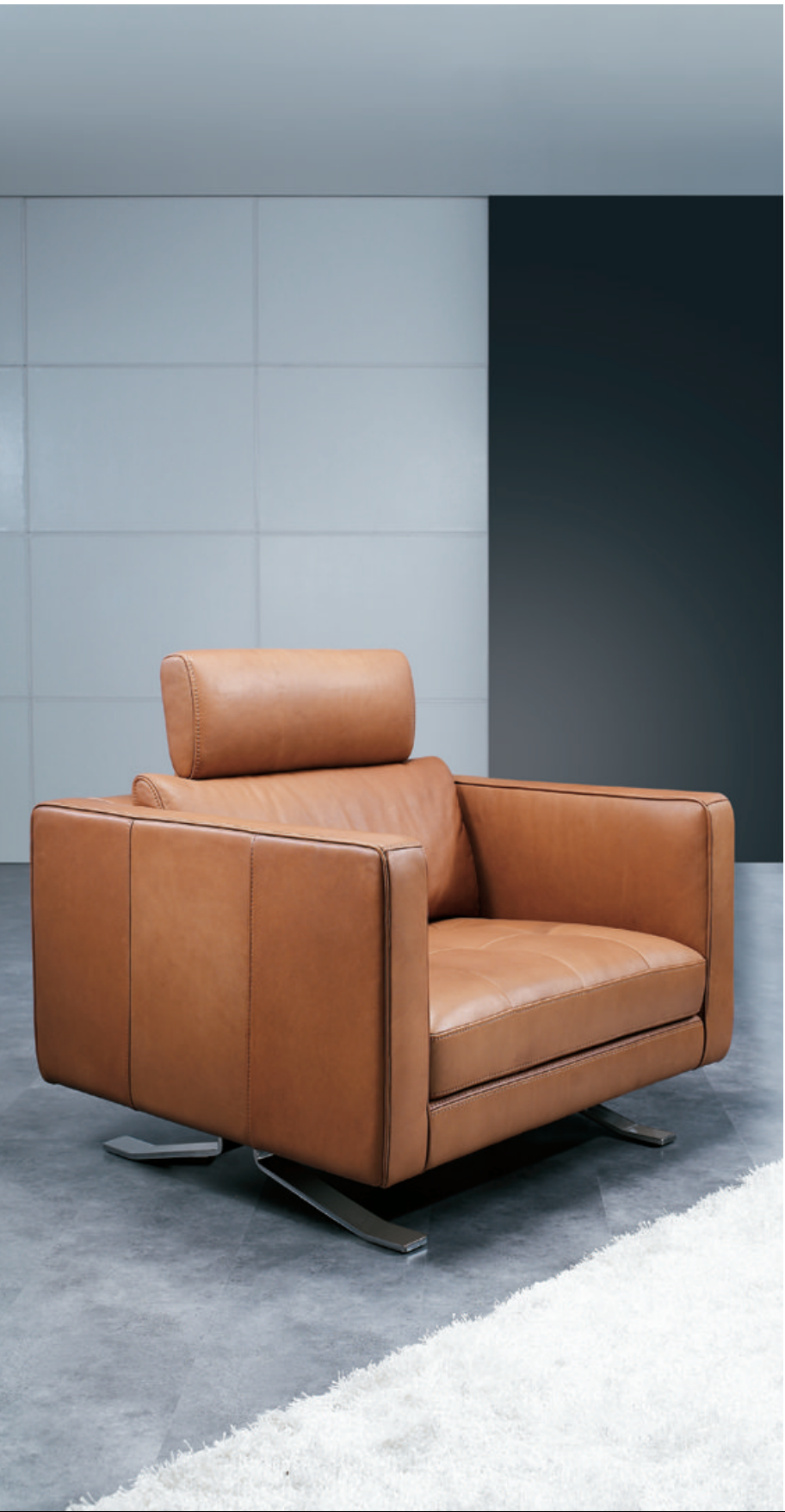
Optional headrest (no. HR1) creates extra support and comfort for your head.