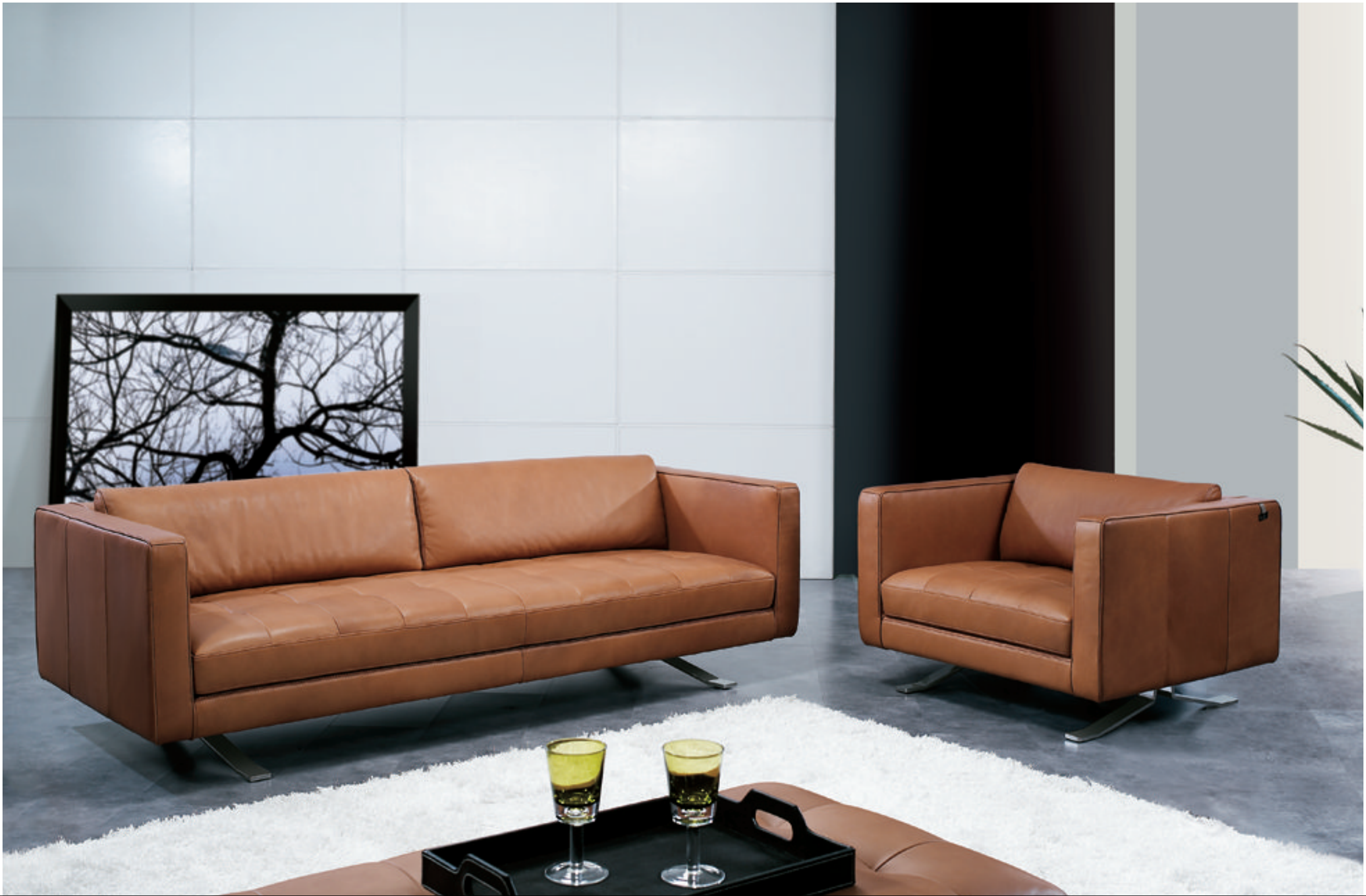
Model SORANO is a simplified version of Model FORETTI (Spring 2009 Collection). Again, being inspired by the western living-room furniture style in the 50s/60s, Model SORANO has the design characteristics of slim & tight arms, extra tall legs, low back and squares-on-seats.