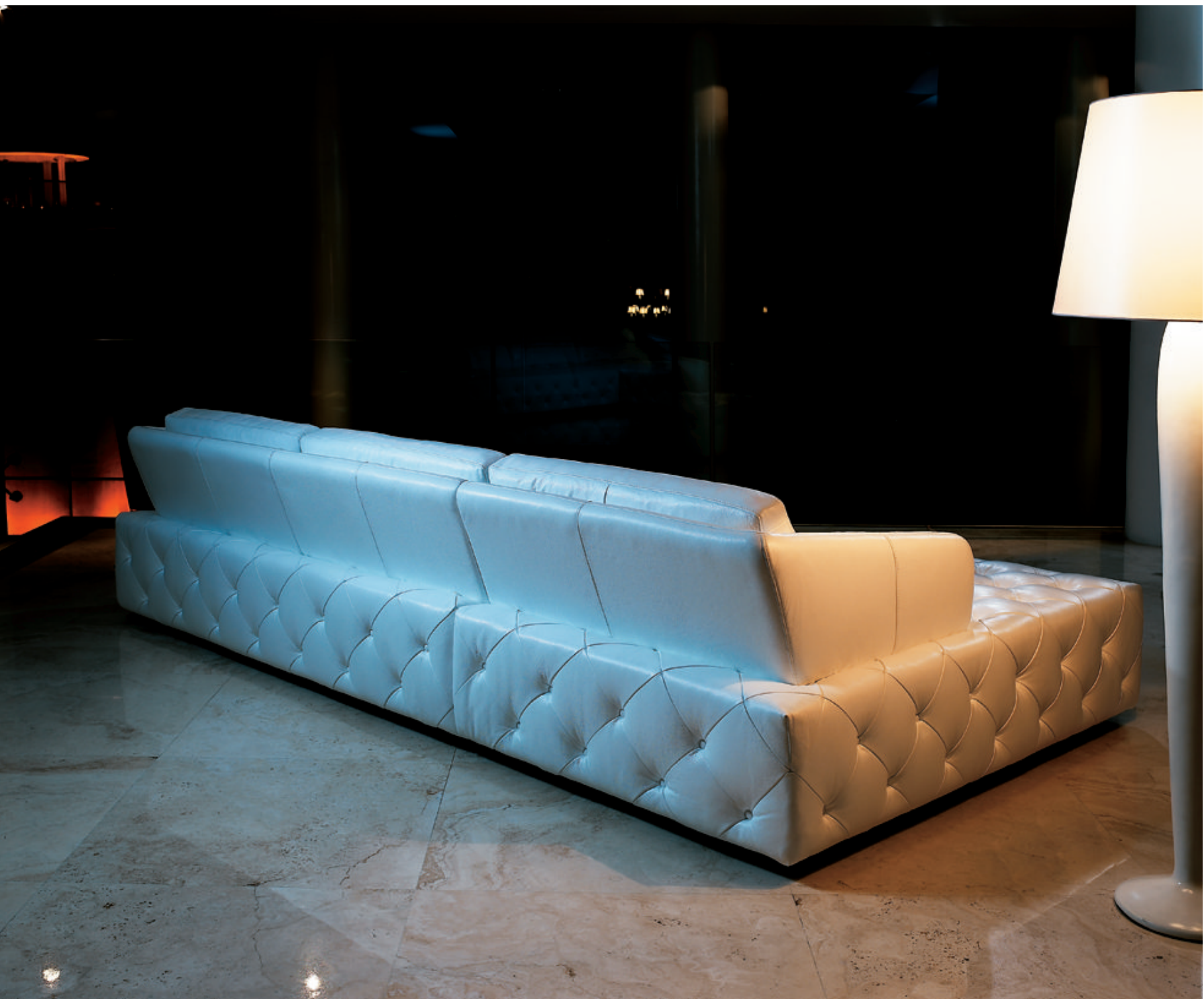
The tufted button feature runs 360 degree around the entire seat frame and top. It can only be realized through tremendous investment on highly-skilled handwork. The handwork shall be easily appreciated when you find there are more than 150 tufted buttons on the composition of sofa and chaise.