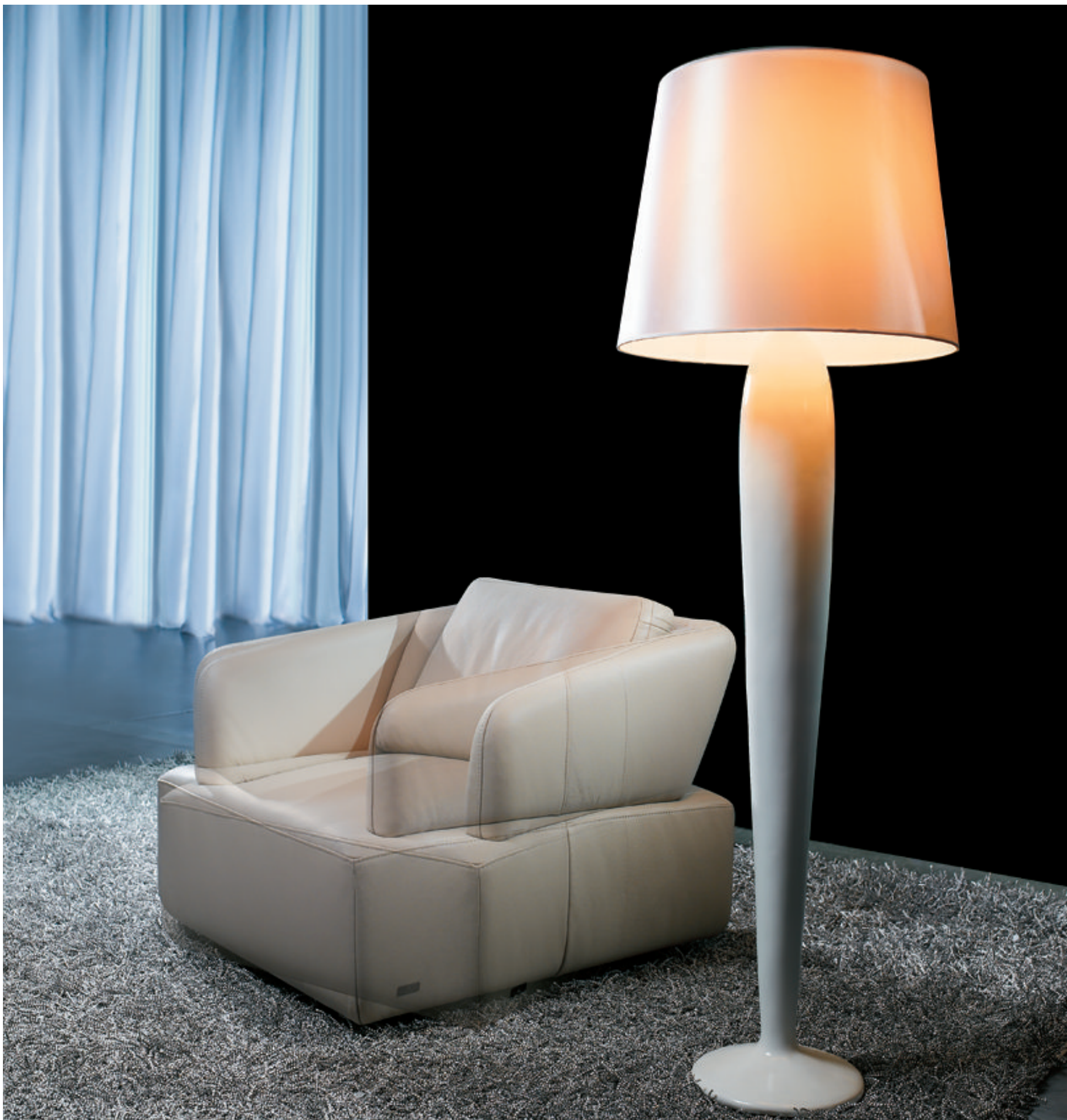
The single-seater (armchair) of Model VIESTE has an option with swivel base.