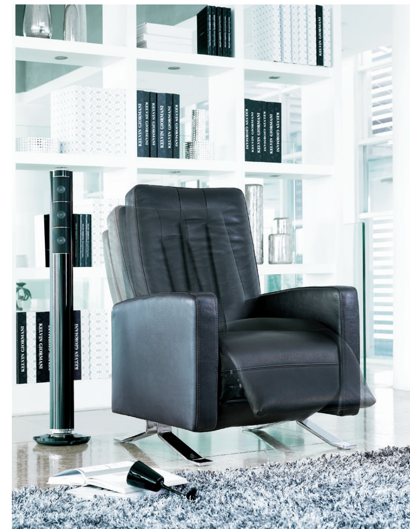
Recliner PRECI (AC 40) comes with German mechanisms and the matching stainless steel legs.