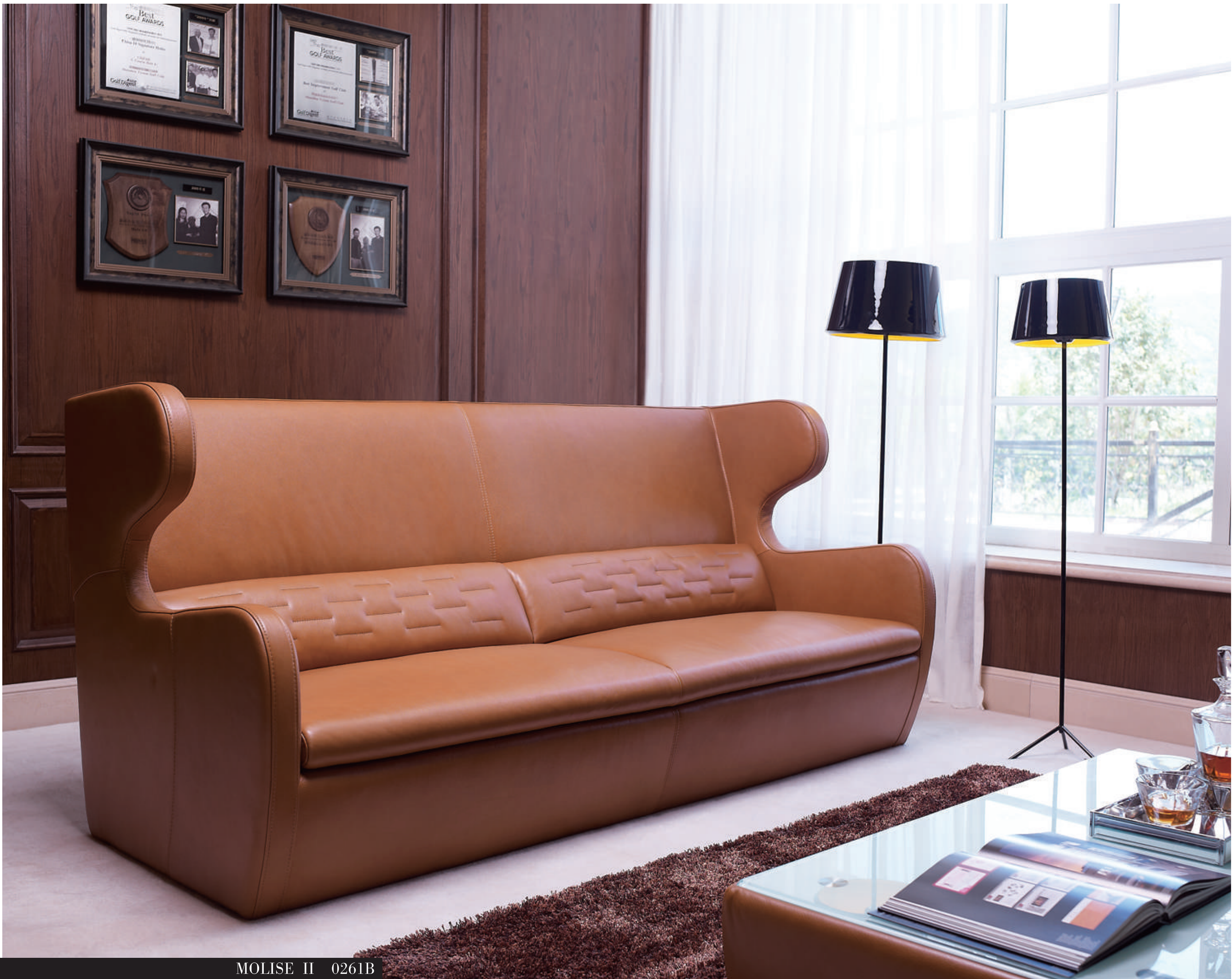
MOLISE II 0261B

Optional genuine leather coffee table (no. STG3W) comes with white color coated tempered glass and with base design matching the sofa base of Model MOLISE.