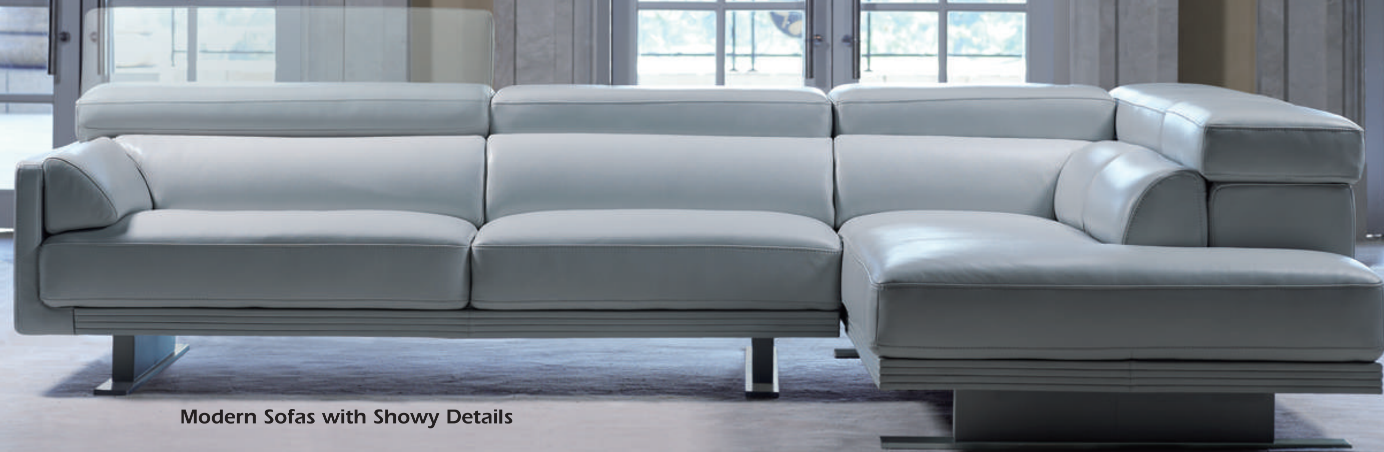
Modern Sofas with Showy Details