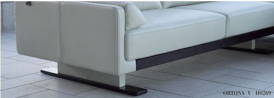
Model ORTONA V features solid wood base front panels which shall always match with solid wood sofa foot panels. There are 6 different solid wood colors for customization.