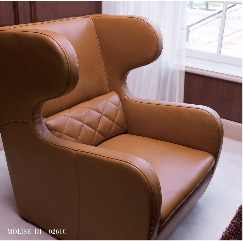
MOLISE III 0261C