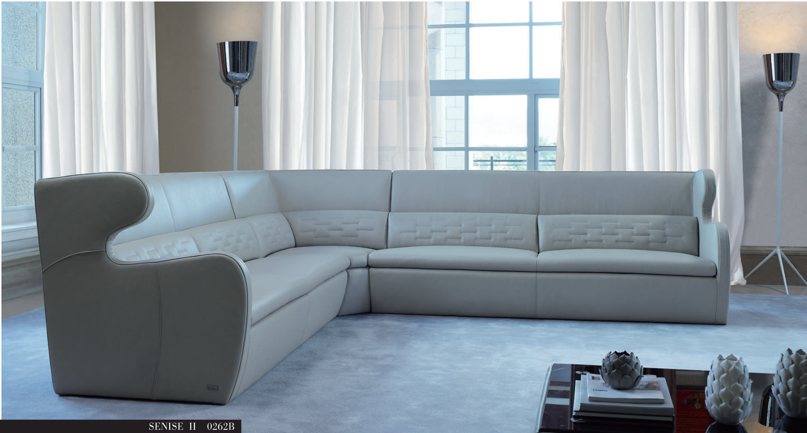
SENISE II 0262B

Model SENISE is the medium-height back version of Model MOLISE. The more popular proportion of Model SENISE better matches with homes of regular ceiling height. For the waist cushion designs, Model SENISE has the same 3 options as what Model MOLISE has (please refer to Page 7 for detail).