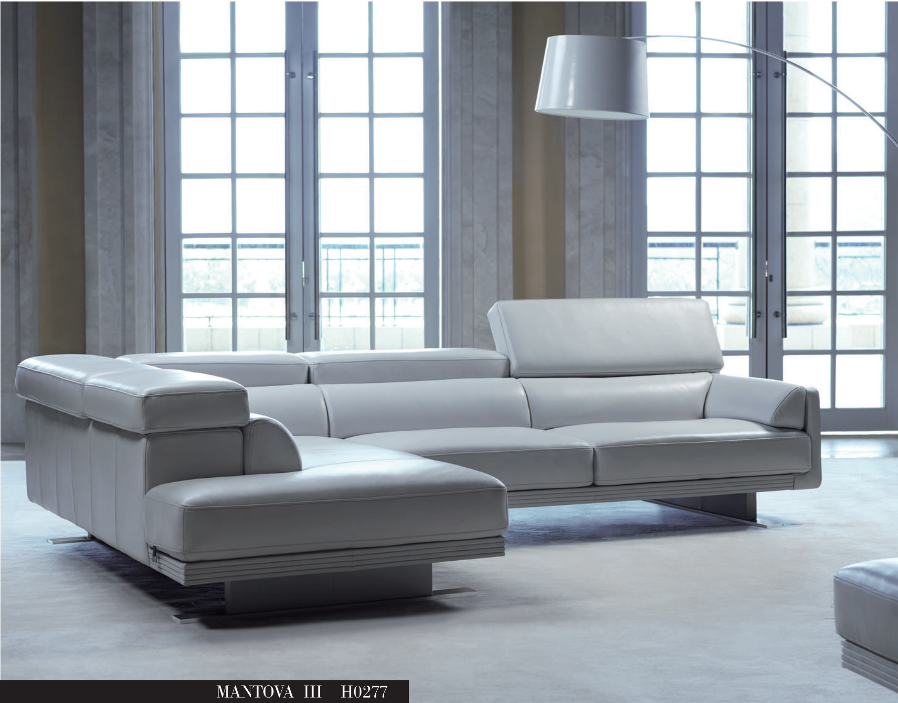
MANTOVA III H0277

Model MANTOVA I features genuine leather wrap base front panel with a clean and simple look. That's a part of the KELVIN GIORMANI design concept while there is always a minimalist version within a model series to choose from.