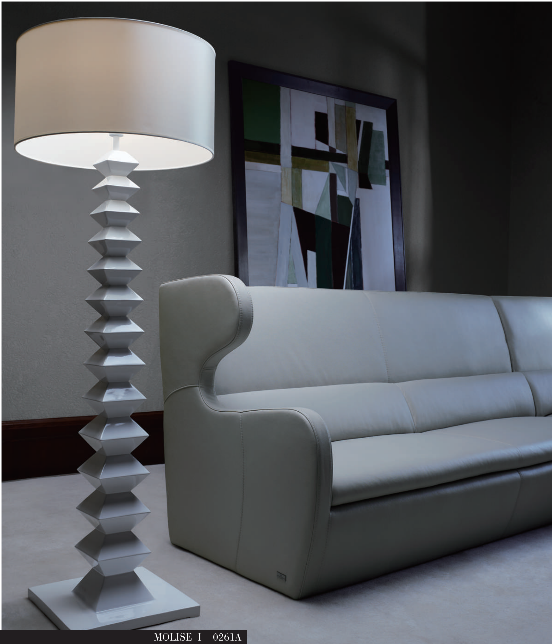
MOLISE I 0261A

There are 3 optional designs for the waist cushions. The diamond pattern of Model MOLISE III gives the model a classical look. The short-straight lines pattern of Model MOLISE II enhances the contemporary feel of the model. Model MOLISE I offers a clean and simple option on the waist cushions.