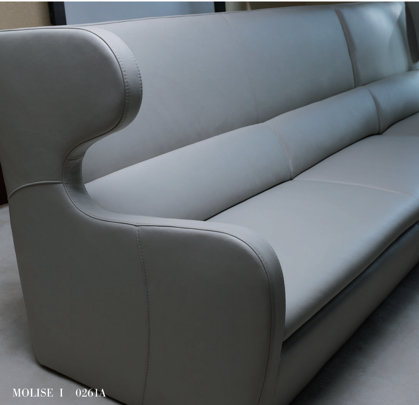
MOLISE I 0261A

There are 3 optional designs for the waist cushions. The diamond pattern of Model MOLISE III gives the model a classical look. The short-straight lines pattern of Model MOLISE II enhances the contemporary feel of the model. Model MOLISE I offers a clean and simple option on the waist cushions.