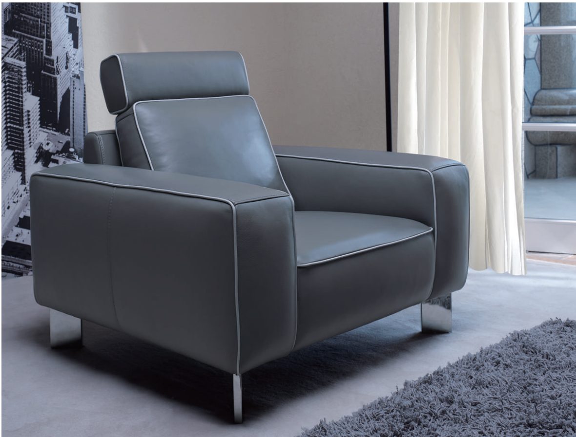
Optional headrest (no. HR3) enhances the comfort of your head.