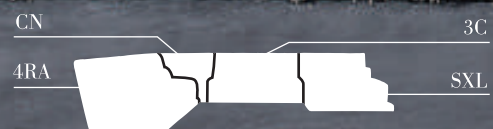
LUCERA I 0280A