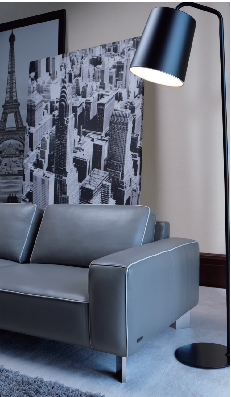
There are options of solid wood or stainless steel sofa legs which will well suit different material concepts of living rooms. There are 6 different solid wood colors to be customized.