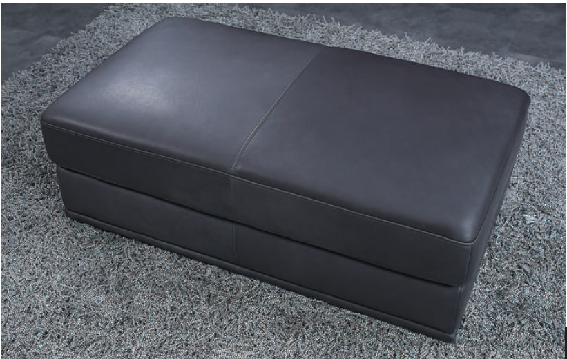
Optional stool (no. ST2) comes with matching sofa seat and base frames of Model TRONTO.