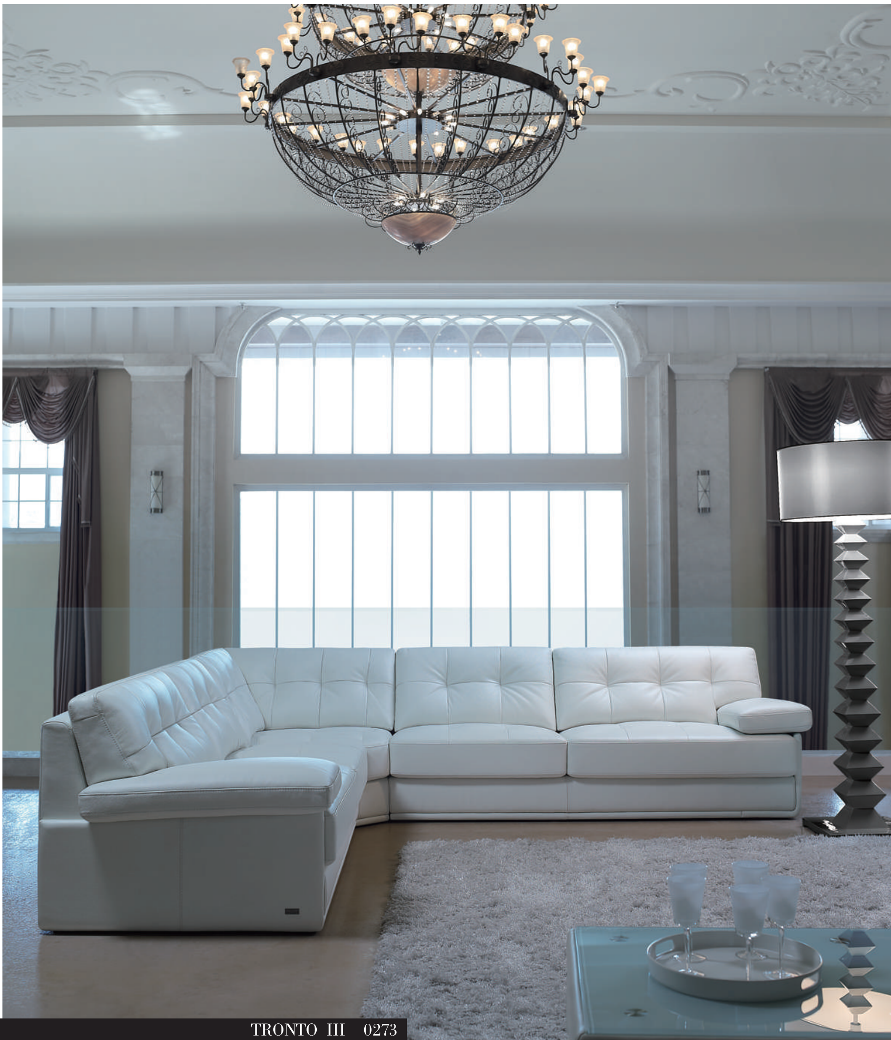
TRONTO III 0273