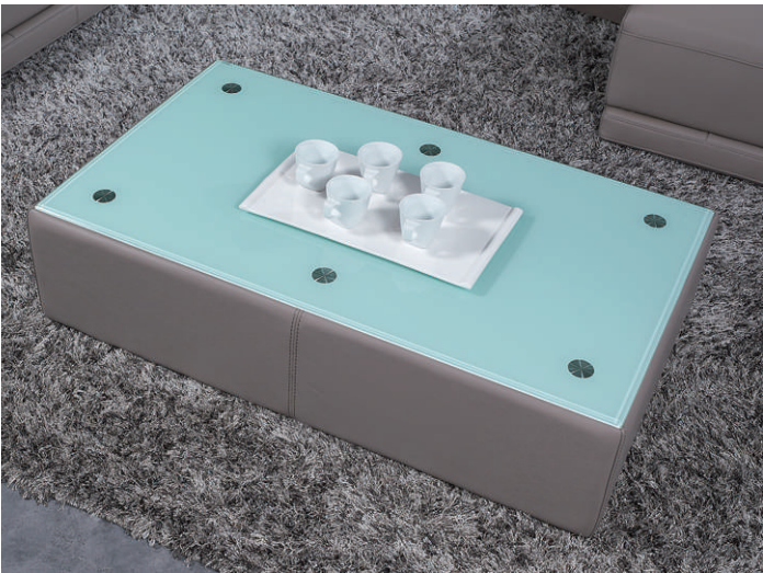
Optional genuine leather coffee table (no. STG3W) comes with white color coated tempered glass, easy-to-match base and hidden legs.