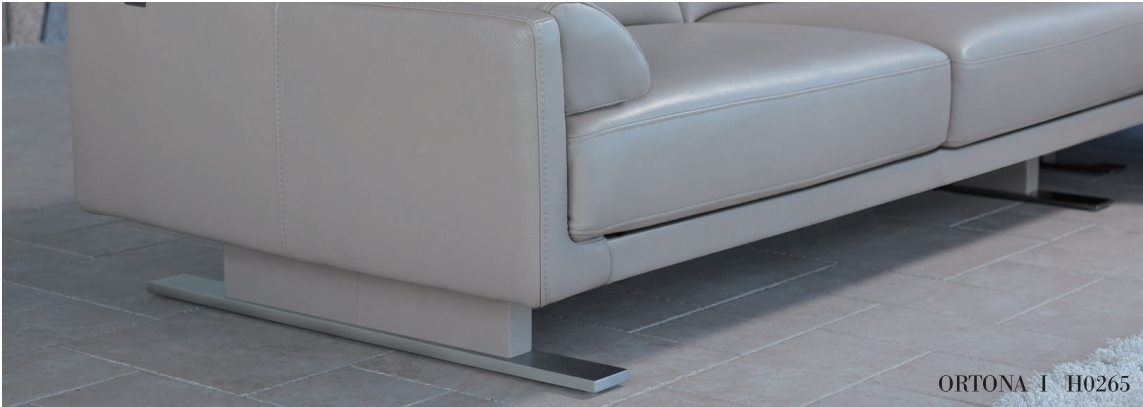
Model ORTONA I features genuine leather wrap base front panel with a clean and simple look. That's a part of the KELVIN GIORMANI design concept while there is always a minimalist version within a model series to choose from.