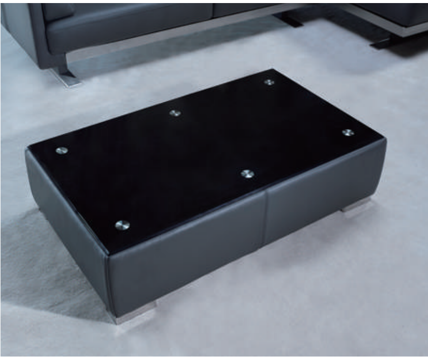
Optional genuine leather coffee table (no. STG3B) comes with black color coated tempered glass, stainless steel legs and a simple and easy-to-match base.