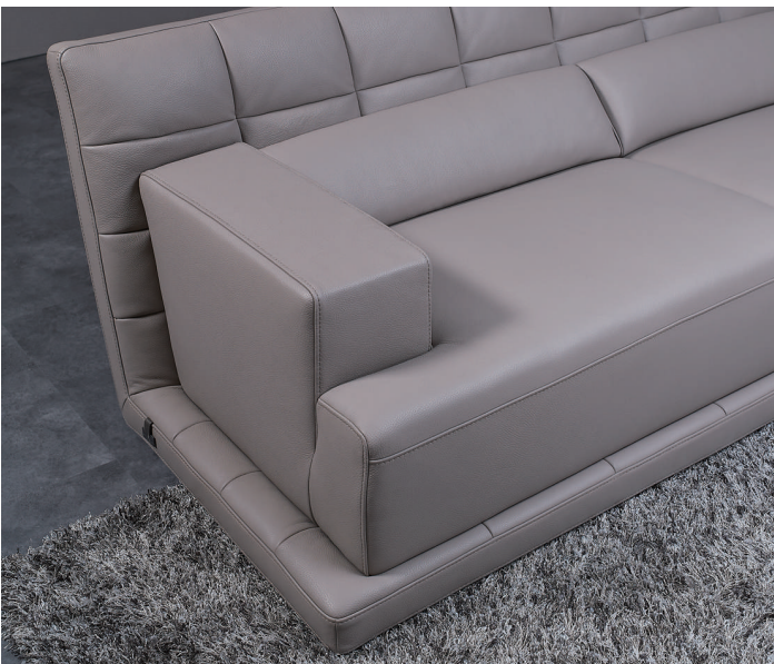
The minimalist design of the sofa arms and seat frames matches perfectly with the back-and-base frame feature. The waist cushions enhance the lumbar support.