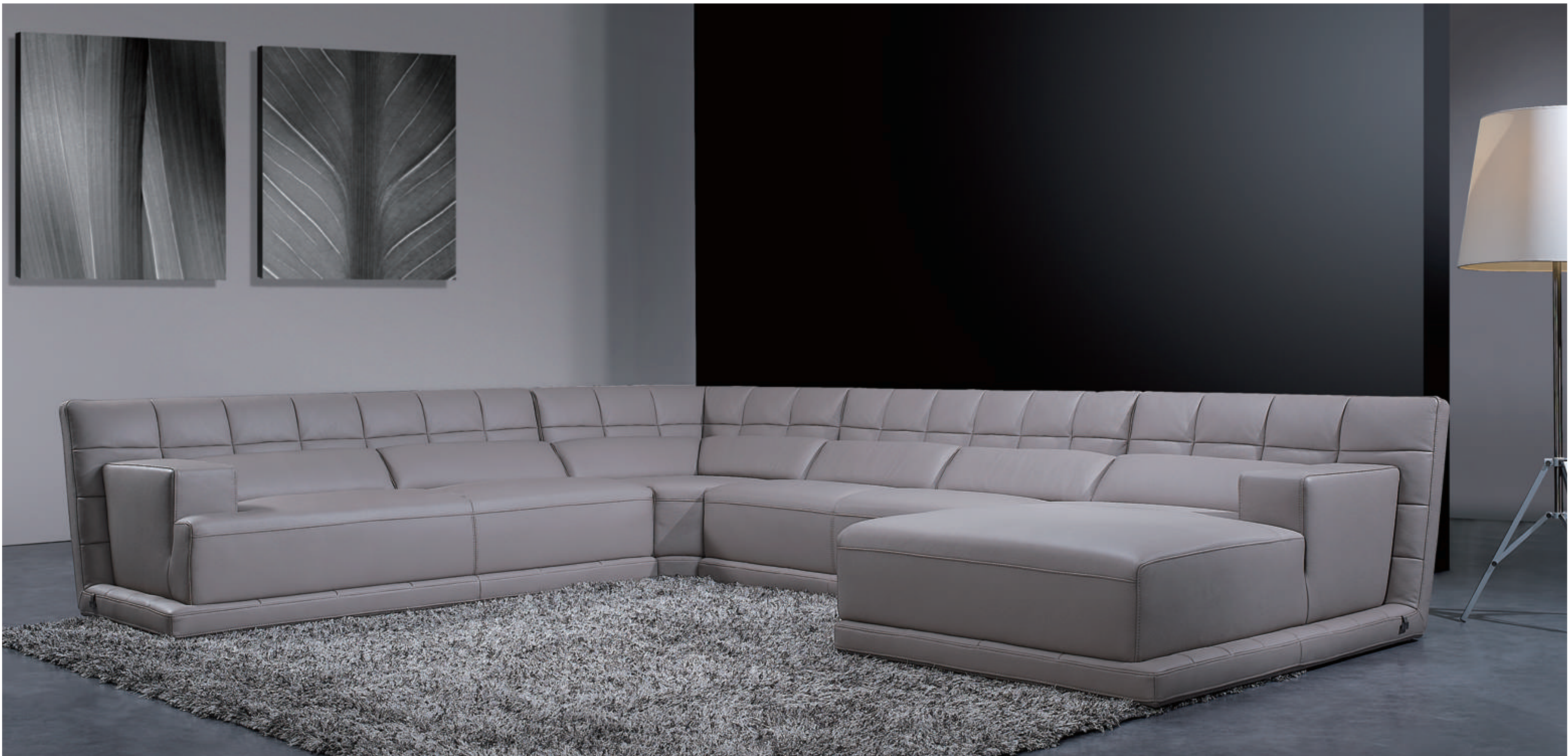
Featuring the tufted-square design continuation from the sofa back to base frames, Model LUCERA looks grand and magnificent when it's in a large corner composition. It's a perfect choice for an extra large living room in a luxury mansion.