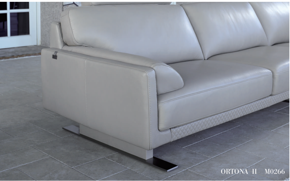
ORTONA II M0266

Model ORTONA has a thin arm and base frame front design. There are 5 different ways to finish the base frame front. The sofa leg composes of 2 elements. It can be either a match of leather wrap leg and solid wood foot panel (no. H0266) or the foot panel can be made with 8mm solid stainless steel (no. M0266). The extraordinary triangular-shape arm cushions enhance the uniqueness of Model ORTONA.