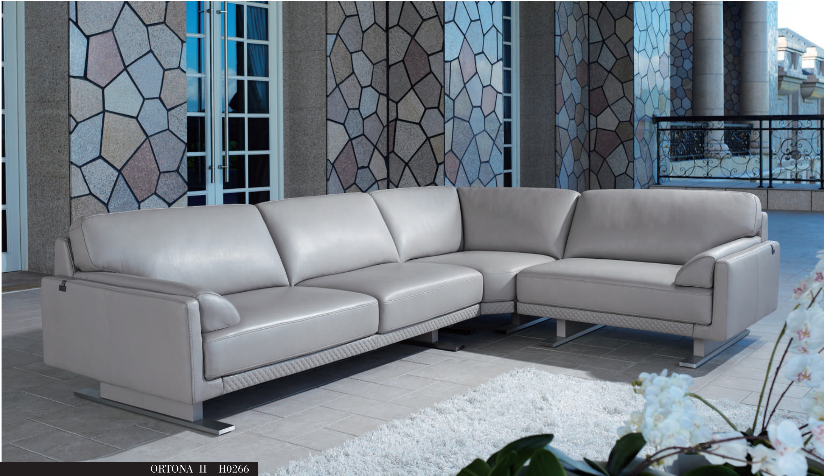
ORTONA II H0266