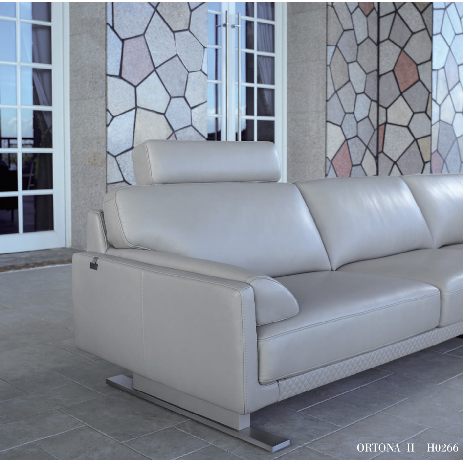
ORTONA II H0266