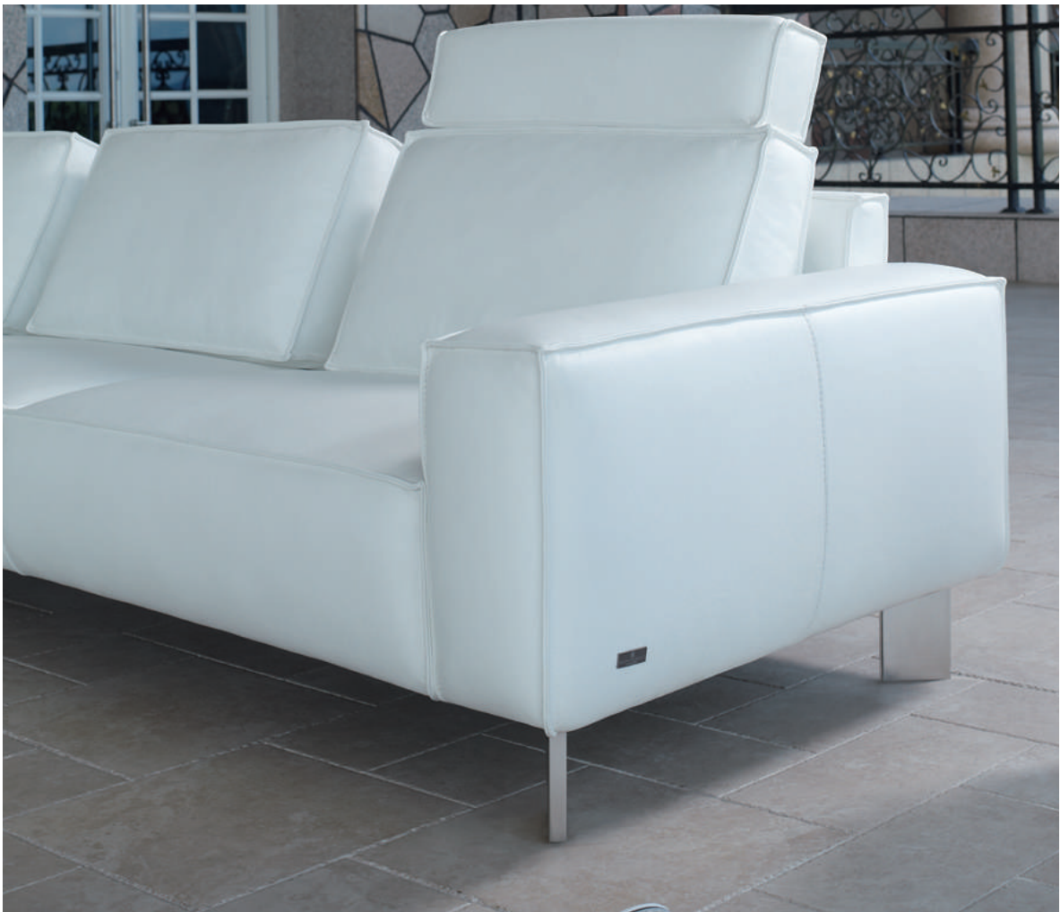
Optional headrest (no. HR3) enhances the comfort of your head.