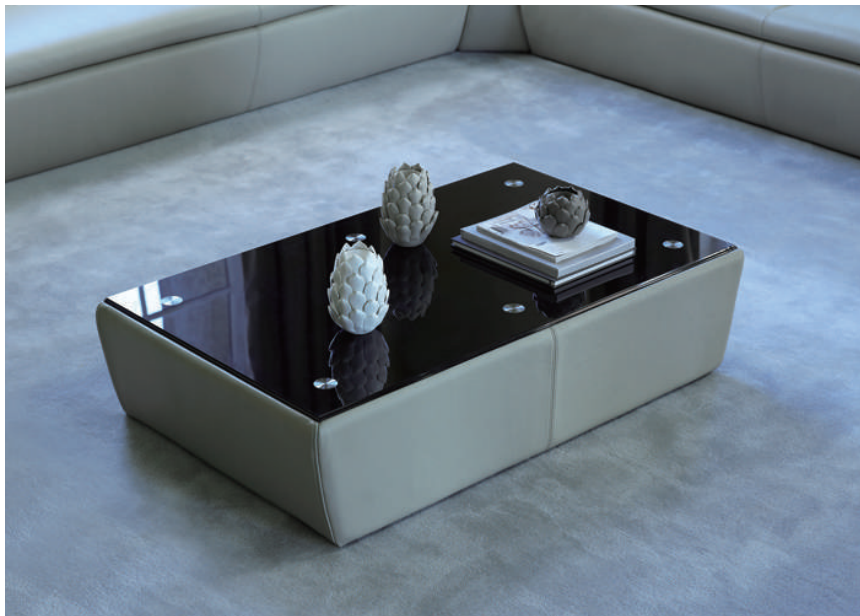
Optional genuine leather coffee table (no. STG3B) comes with black color coated tempered glass and with base design matching the sofa base of Model SENISE.

Model SENISE is the medium-height back version of Model MOLISE. The more popular proportion of Model SENISE better matches with homes of regular ceiling height. For the waist cushion designs, Model SENISE has the same 3 options as what Model MOLISE has (please refer to Page 7 for detail).