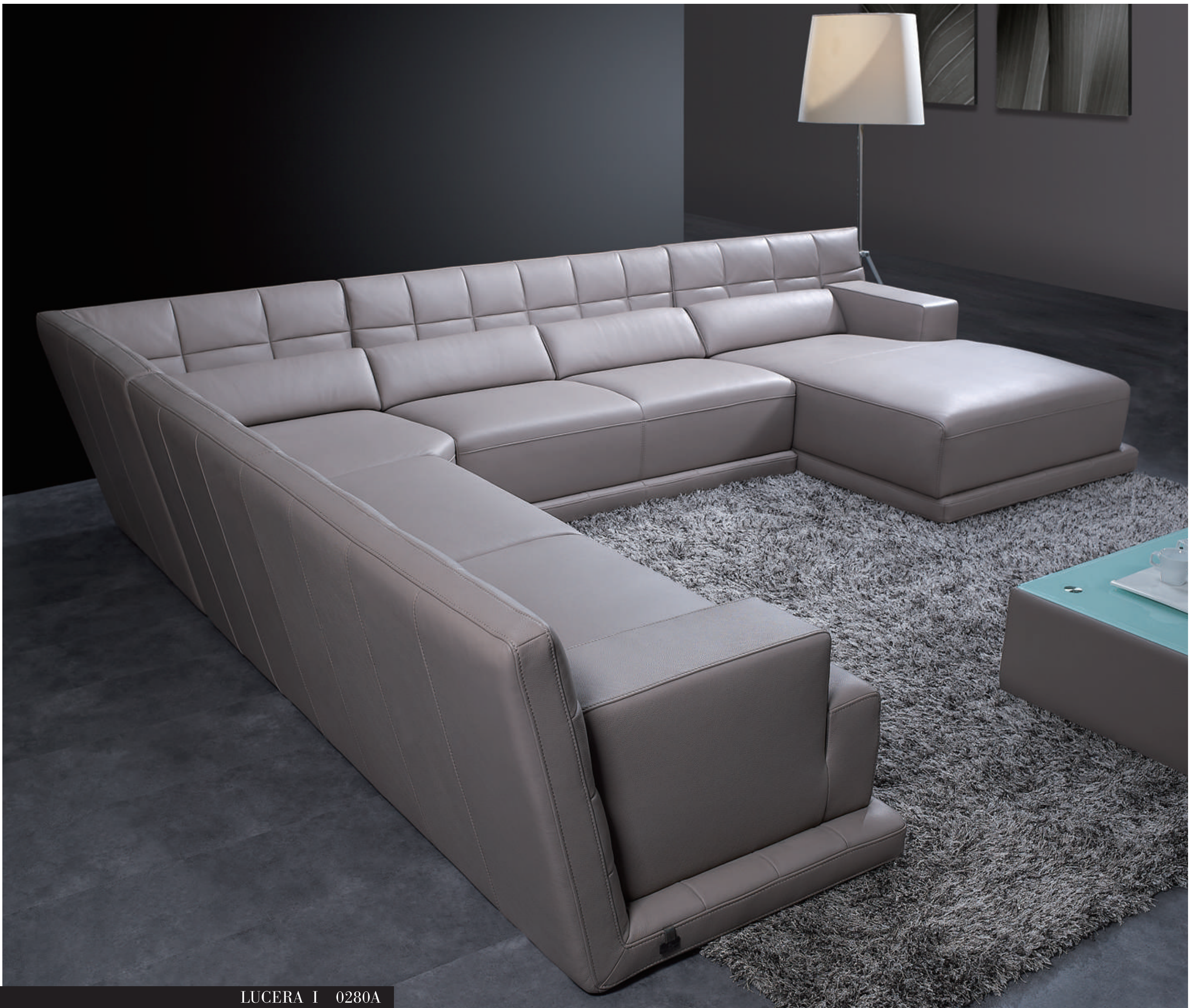
LUCERA I 0280A