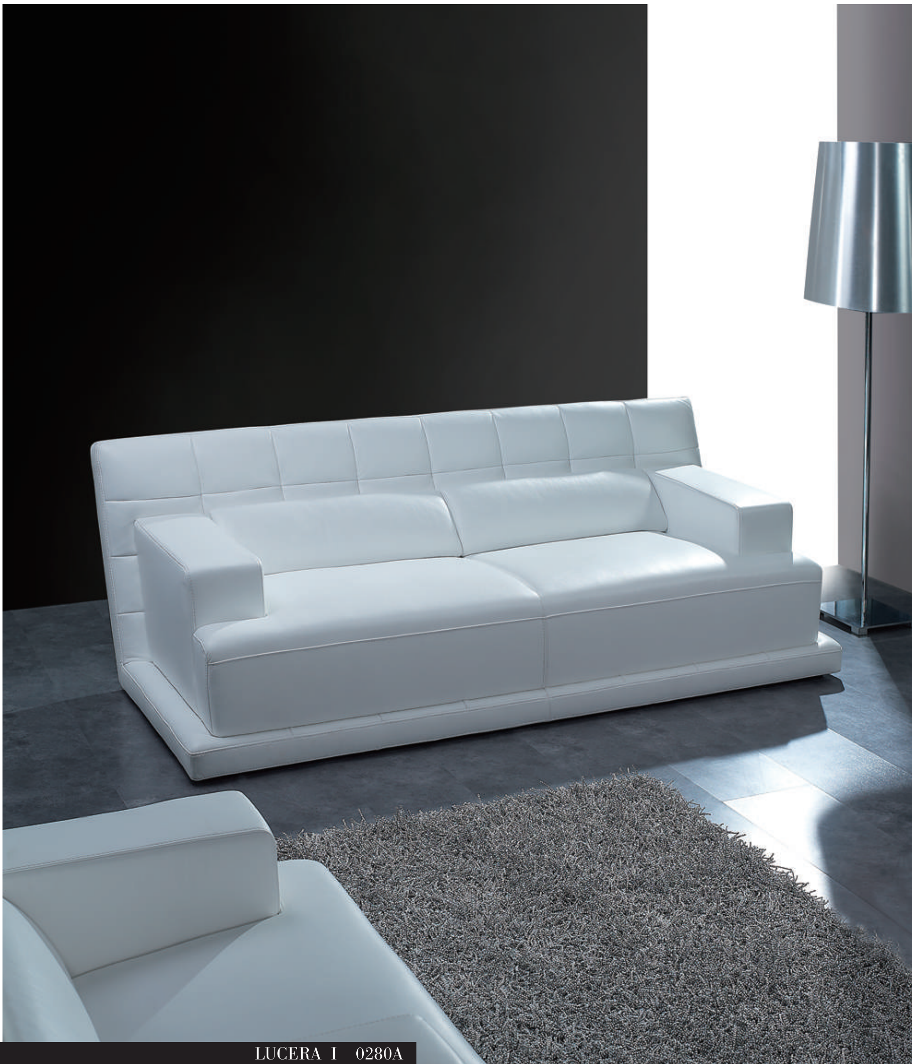
LUCERA I 0280A