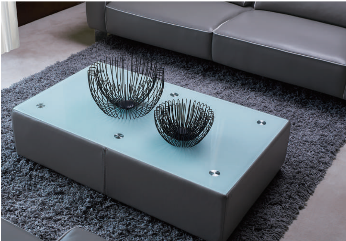
Optional genuine leather coffee table (no. STG3W) comes with white color coated tempered glass, stainless steel legs and a simple and easy-to-match base.