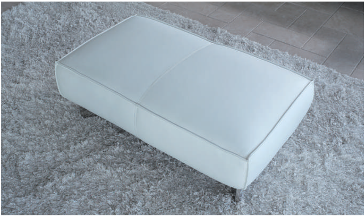
Optional stool (no. ST2) comes with matching sofa seat and leg design of Model TERMOLI.