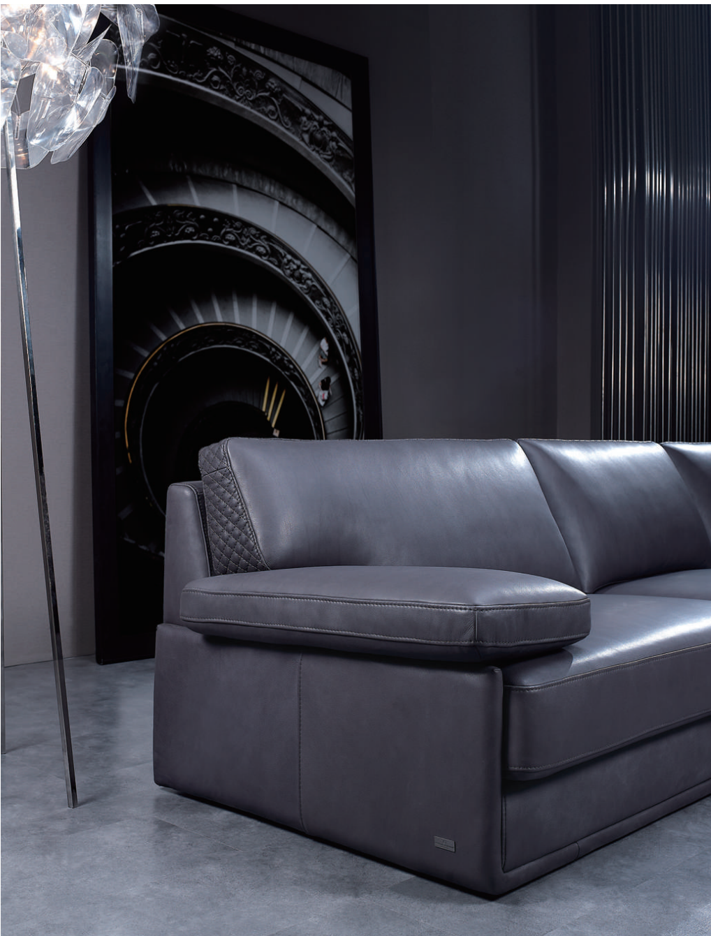
TRONTO II (no. 0272) is a model that can be well placed in a modern or transitional style living room. It's an easy-to-match model which has flat and comfortable arm cushions that are filled with feather.