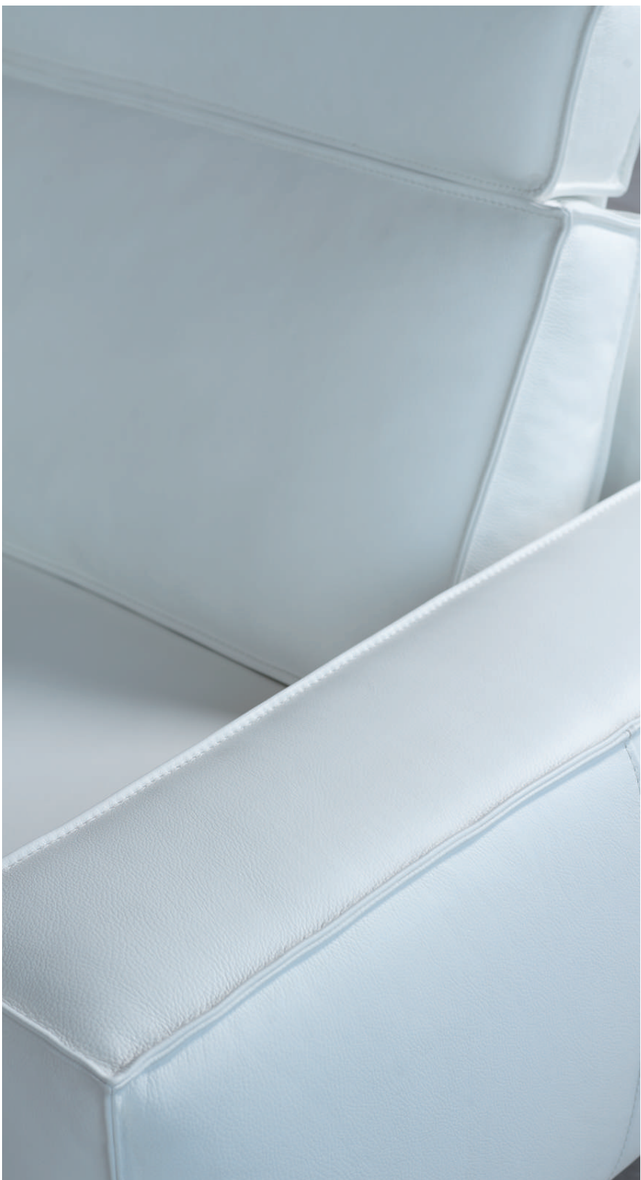
Model TERMOLI is another minimalist, easy-to-match model in the KELVIN GIORMANI Collection. It features "double-edge" stitching which realizes extraordinary sharp corners and square-shape on the arms, seat and back cushions of the model.