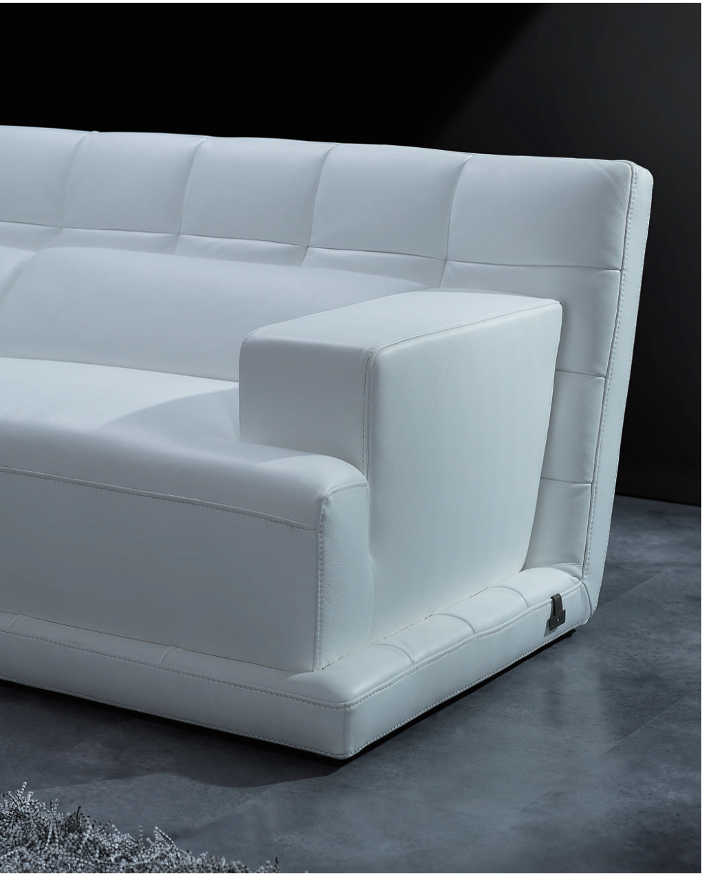
The design of Model LUCERA is inspired by leather bed panels with tufted square patterns. The design of the sofa back panel is continuing to the sofa base frame which becomes a smooth extension. The minimalist design of the sofa arms and seat frames matches perfectly with the back-and-base frame feature. The waist cushions enhance the lumbar support.