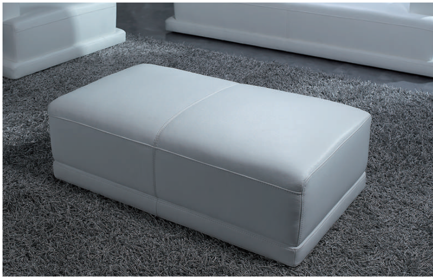
Optional stool (no. ST2) comes with matching sofa seat and base frames of Model LUCERA.

The second version of LUCERA II (no. 0280B) has a feature to accommodate the headrests for head comfort enhancement. If headrests shall never be required, LUCERA I(no. 0280A) shall be a better option.