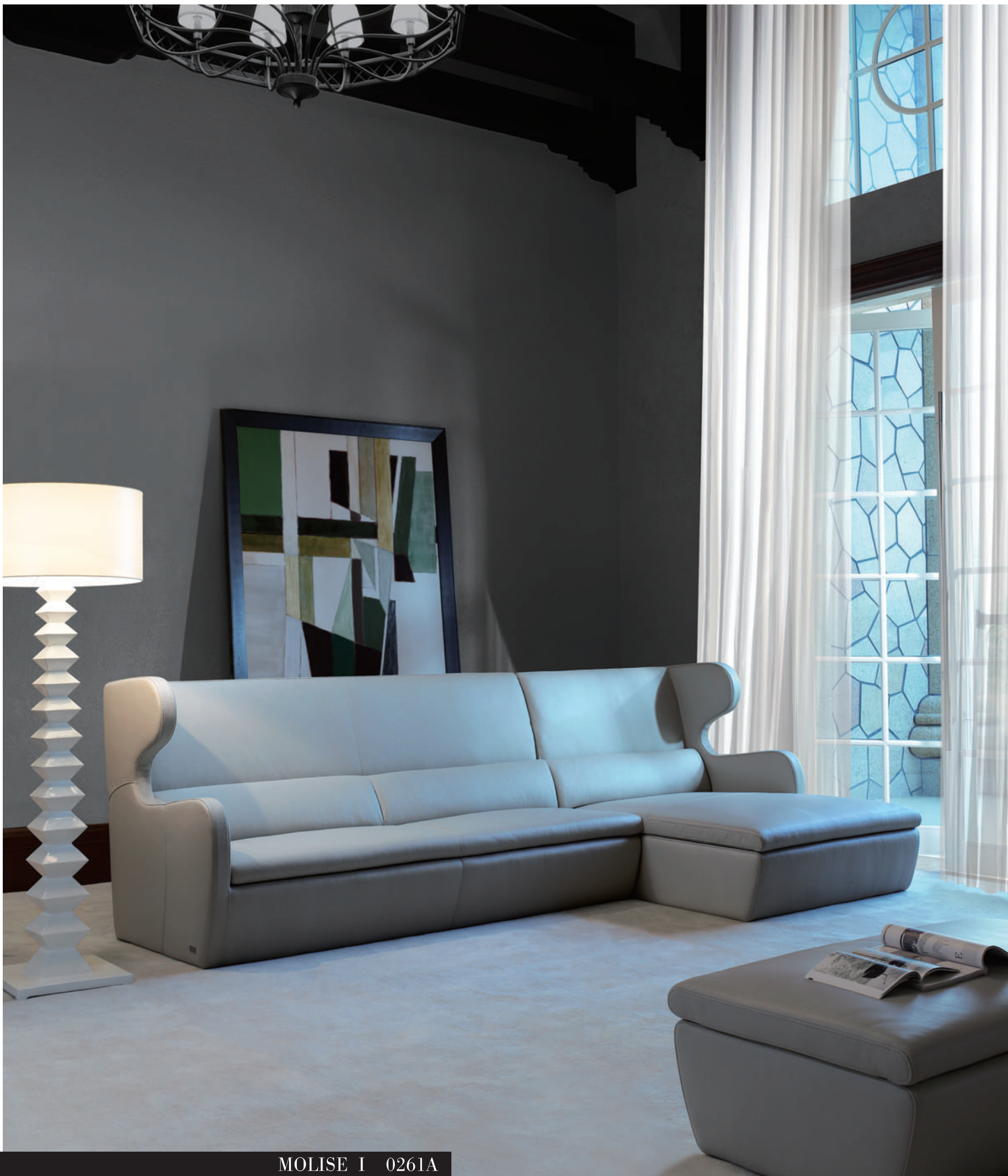
MOLISE I 0261A