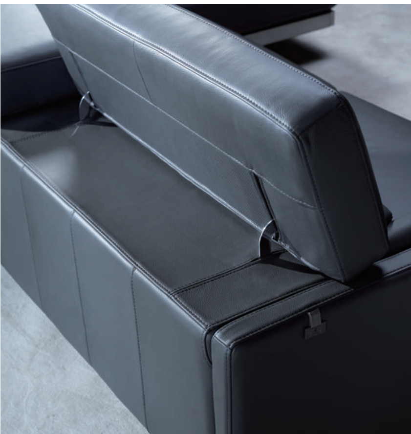
The back mechanisms which have multi-locking positions are made in Germany by Hettich International.