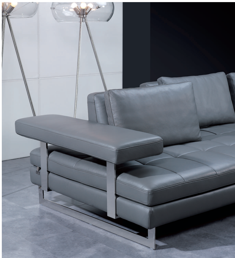
The outlook design of Model ANZIO is in fact a continuation of the design of Model ARSIZIO (2011 Spring Collection). The "see-through" stainless steel arm frames and legs as well as the extra large sitting space are distinctive features of both Model ANZIO and ARSIZIO.