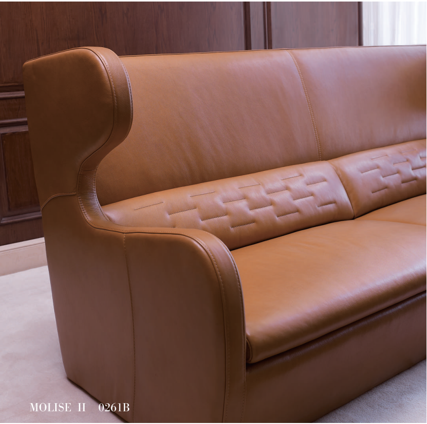
MOLISE II 0261B