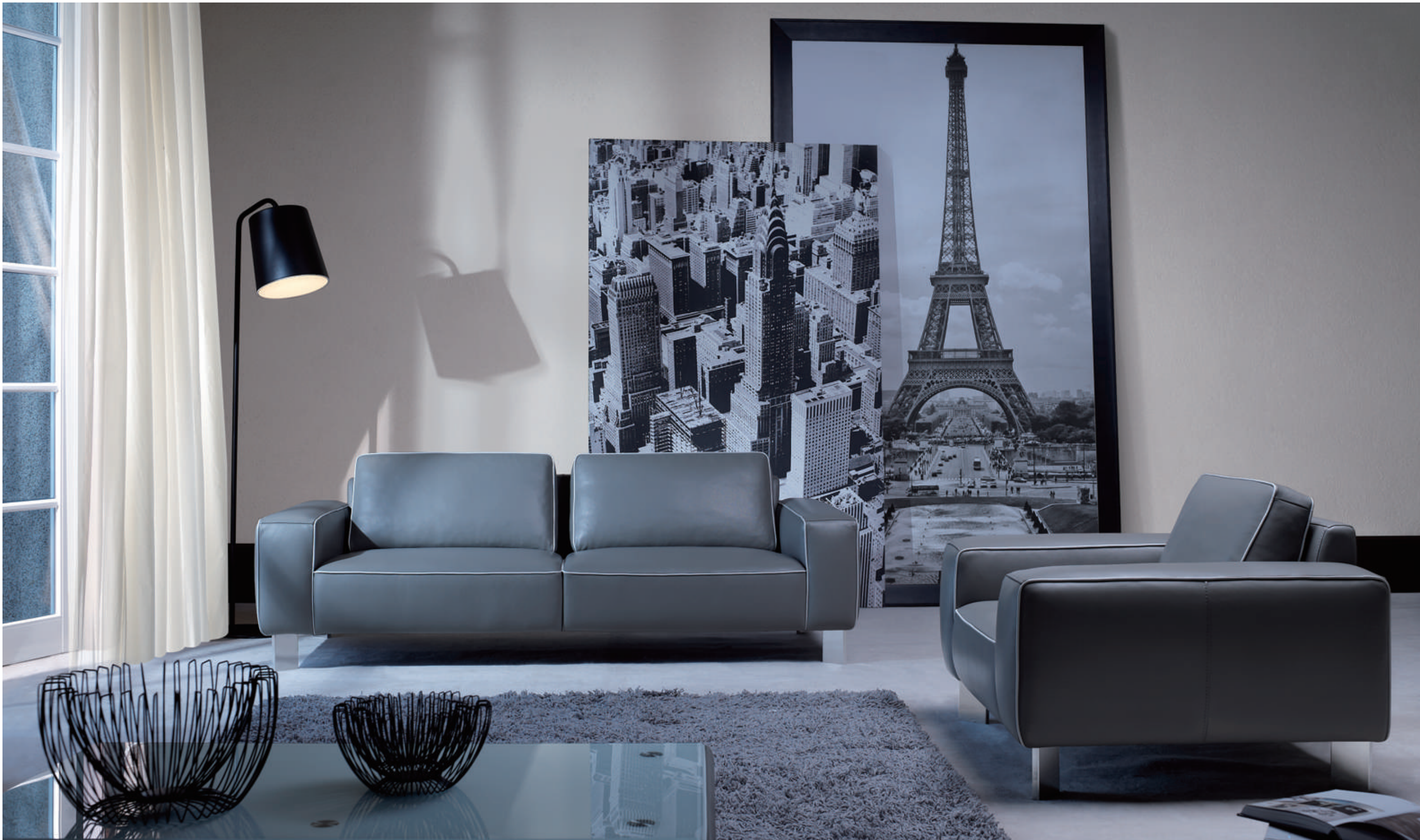
Model EMPOLI is a minimalist, easy-to-match model with contrast piping as its eye-catching feature. The color of the piping can be customized in any leather color.