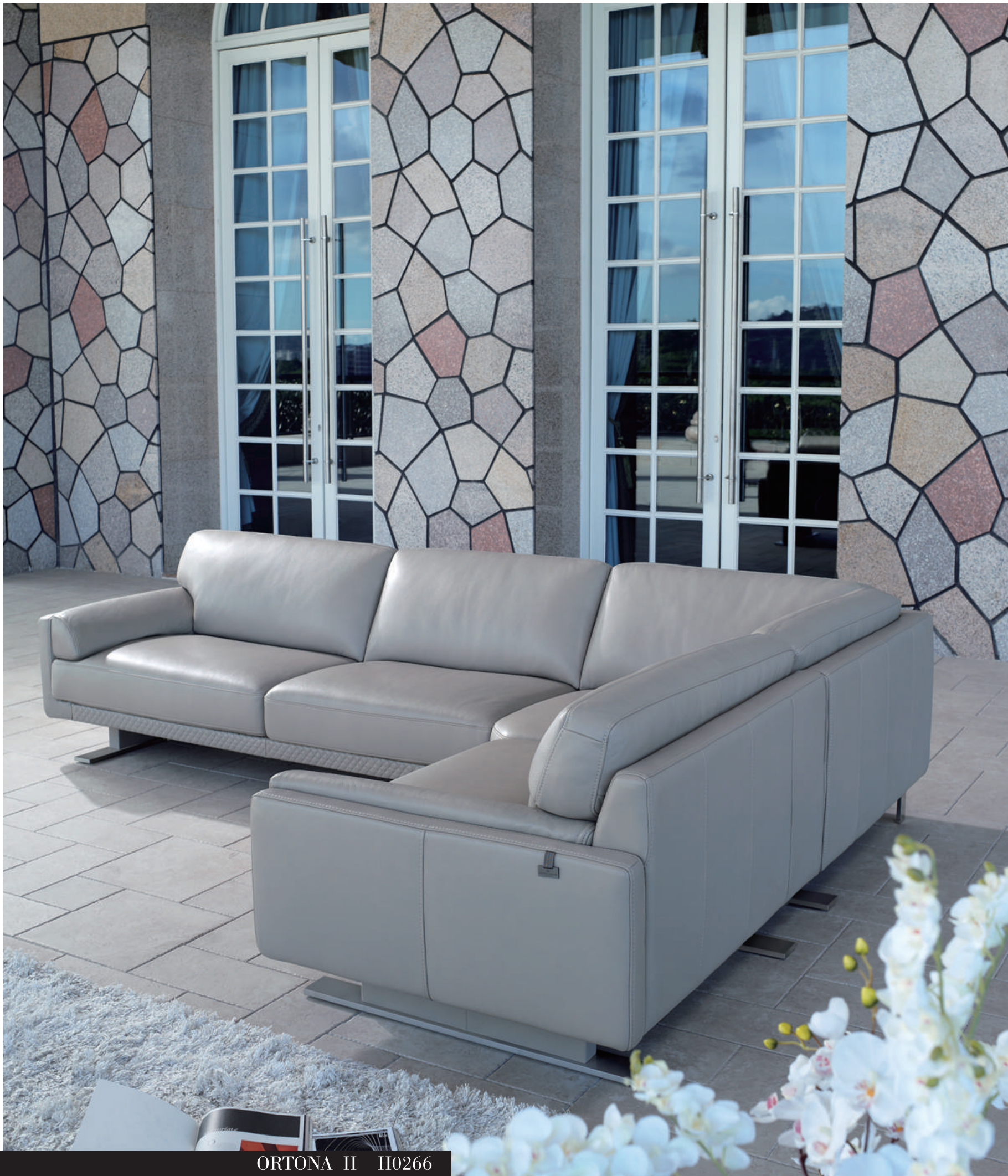
ORTONA II H0266