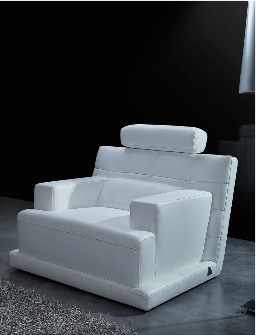
Headrests are not only available to armchairs, they also can be added to all sofa items of Model LUCERA II (no. 0280B).