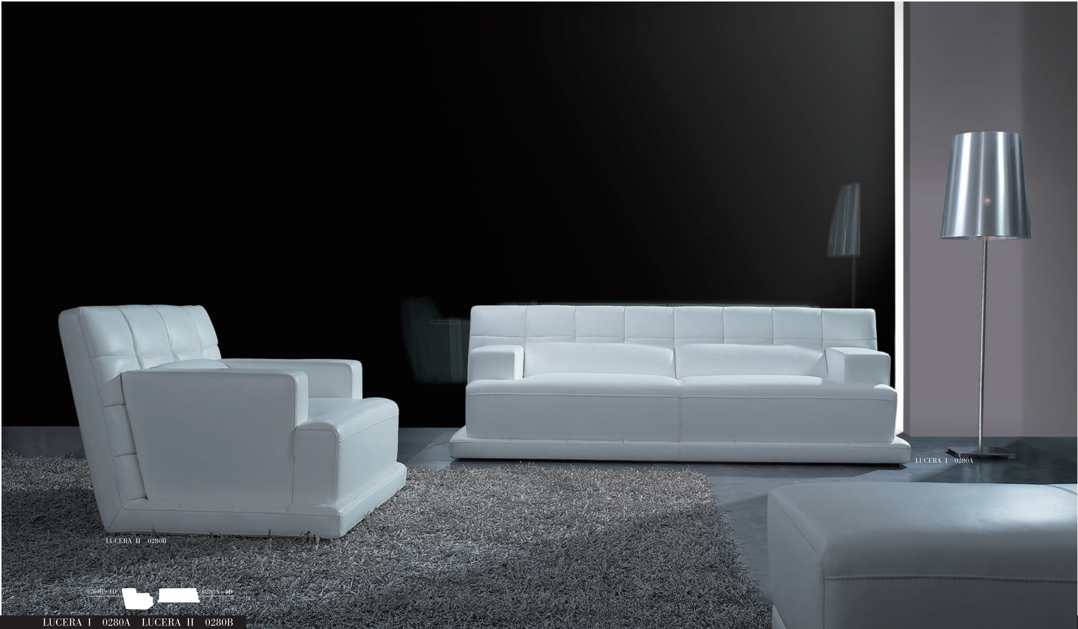
LUCERA II 0280B