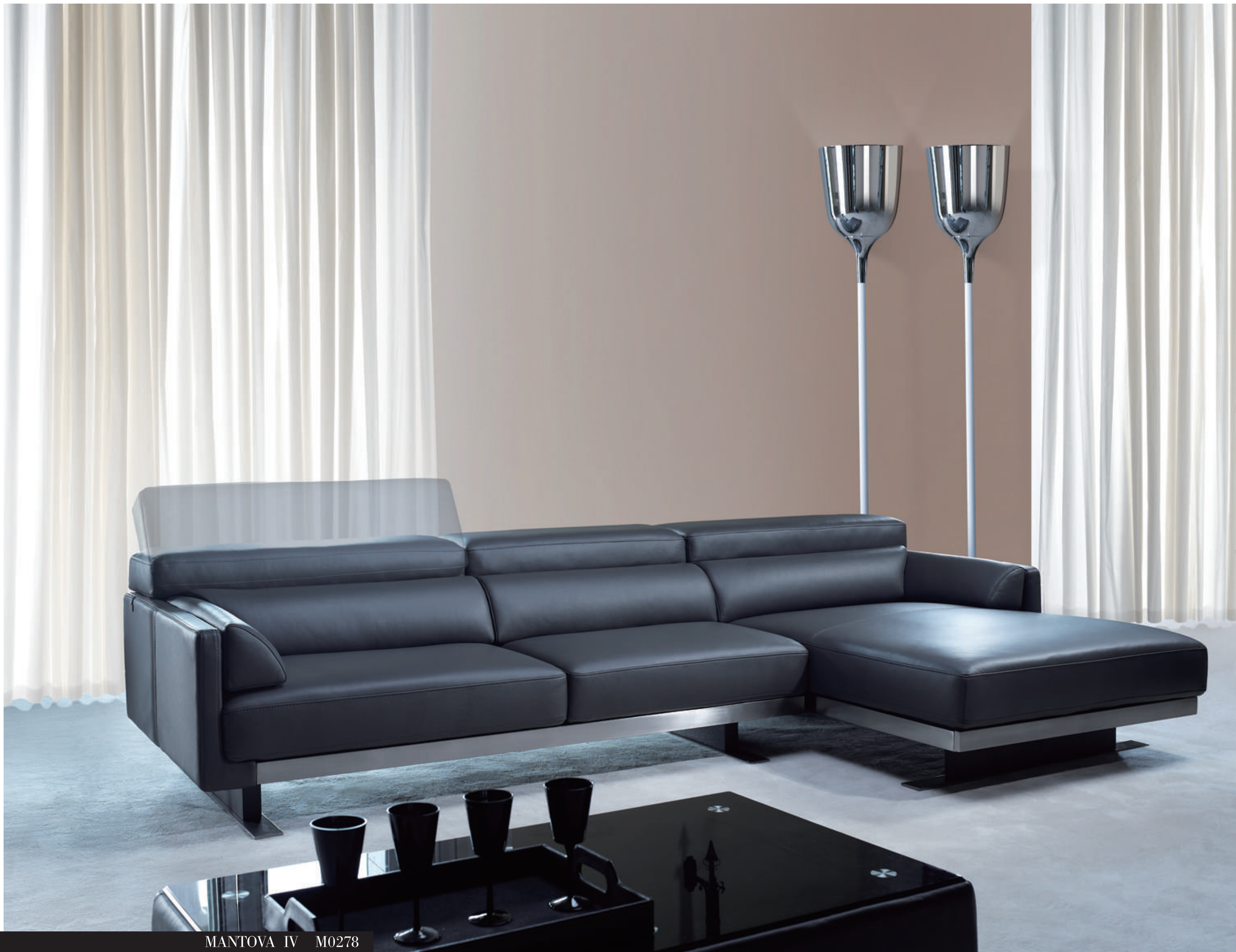
MANTOVA IV M0278