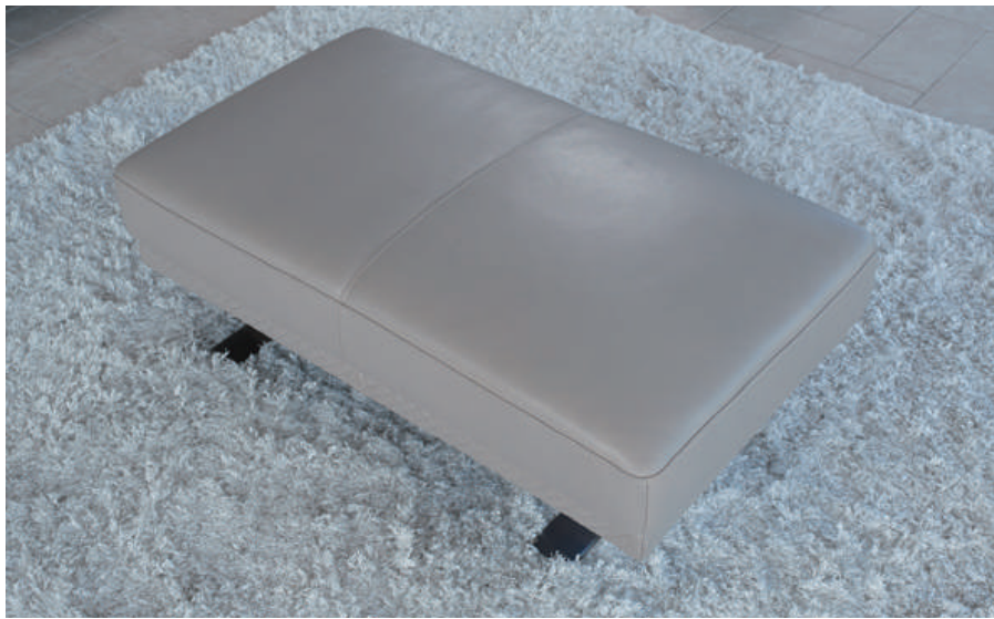
Optional stool (no. ST2) comes with matching sofa base frame front pattern and leg design of Model ORTONA.

Model ORTONA has a thin arm and base frame front design. There are 5 different ways to finish the base frame front. The sofa leg composes of 2 elements. It can be either a match of leather wrap leg and solid wood foot panel (no. H0266) or the foot panel can be made with 8mm solid stainless steel (no. M0266). The extraordinary triangular-shape arm cushions enhance the uniqueness of Model ORTONA.