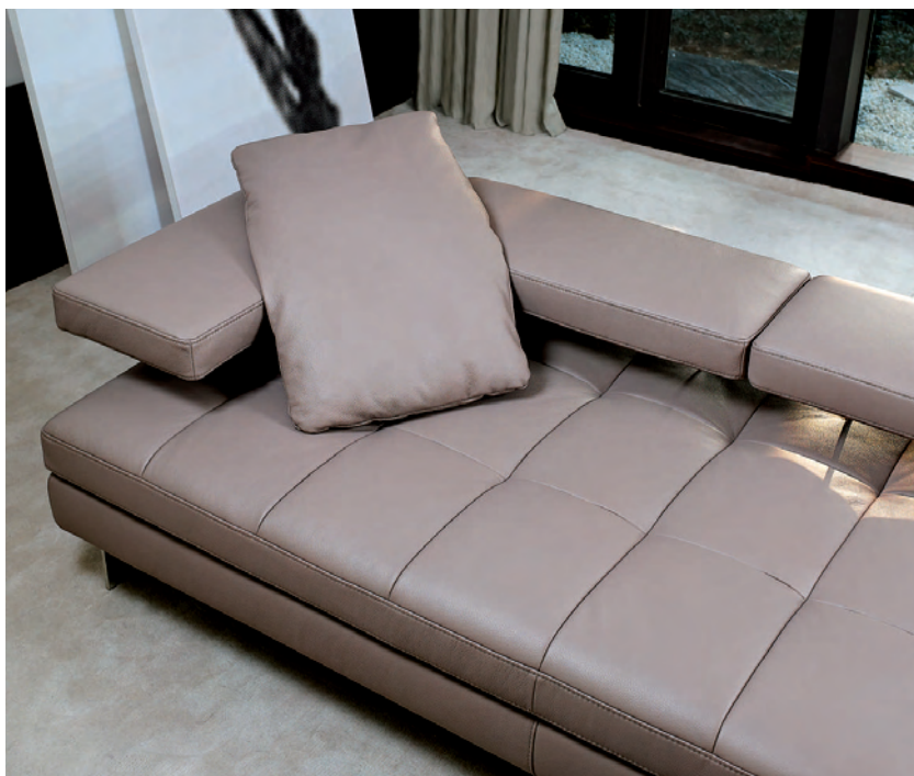
Model ARSIZIO has a unique kind of beauty when it is viewed from the top.