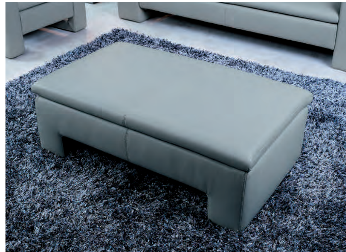
The optional stool (no. ST2) always comes with the cushion and frame that match the sofas.