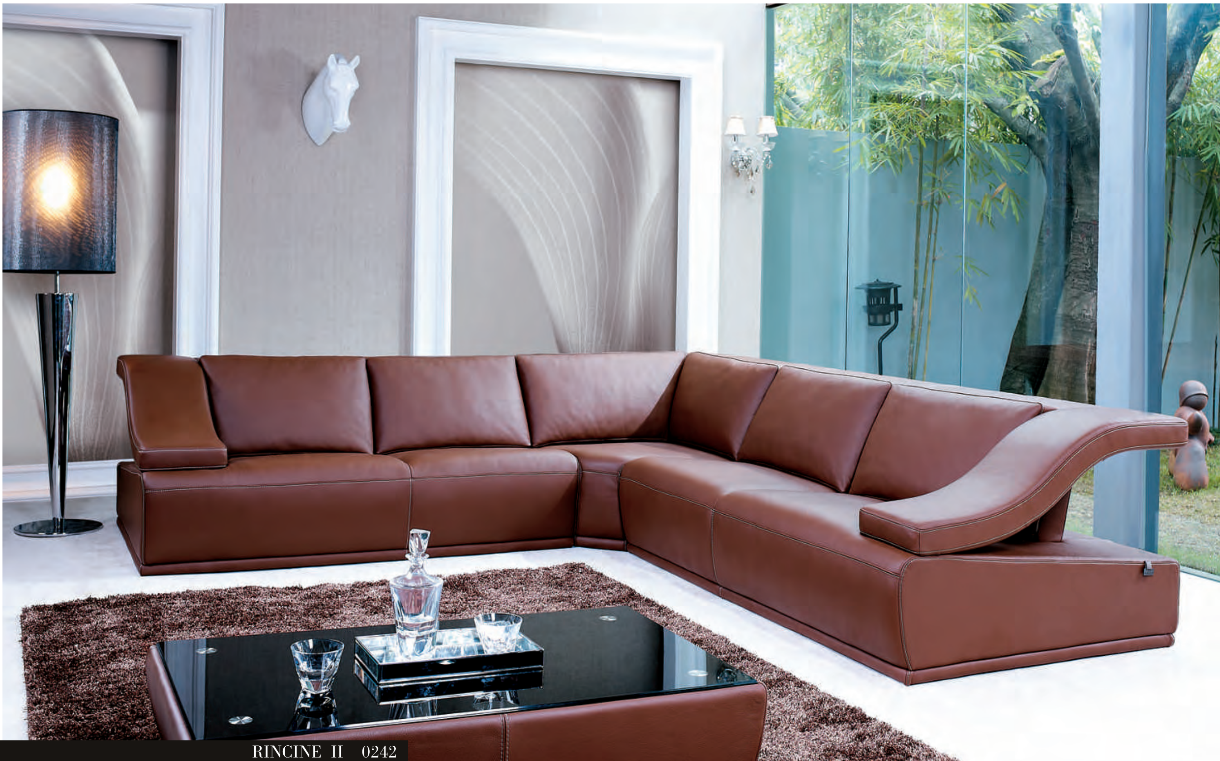
RINCINE II 0242