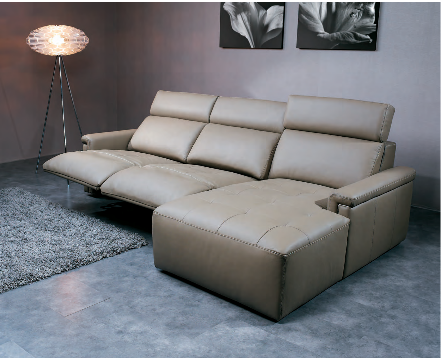
The head mechanisms which come from Germany have multi-locking positions.