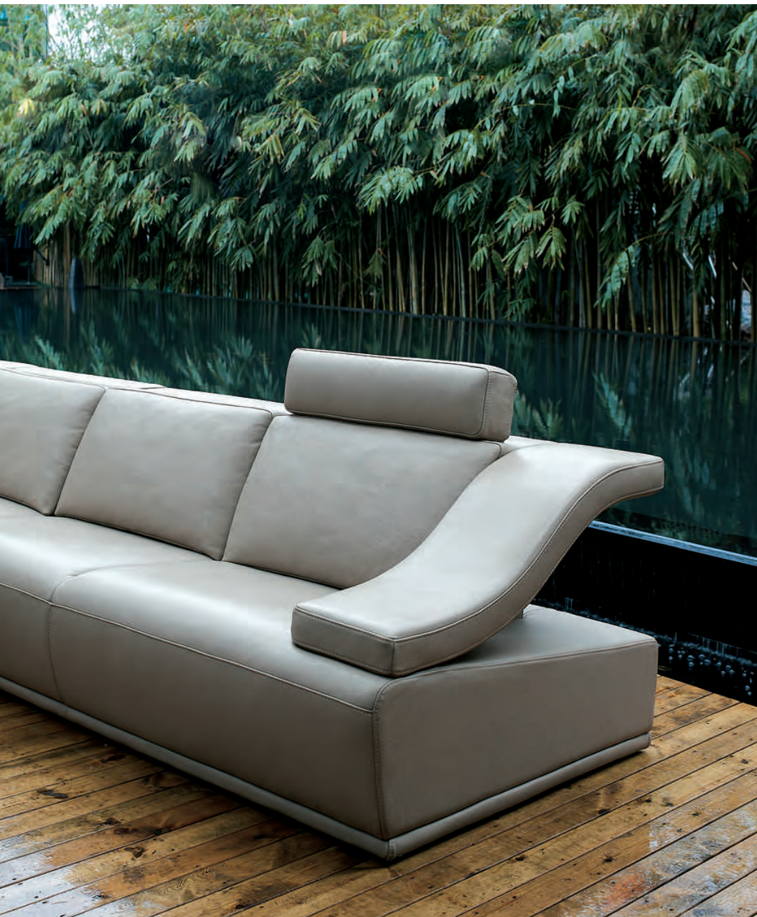
The optional headrest (no. HR4) delivers extra support for your head.