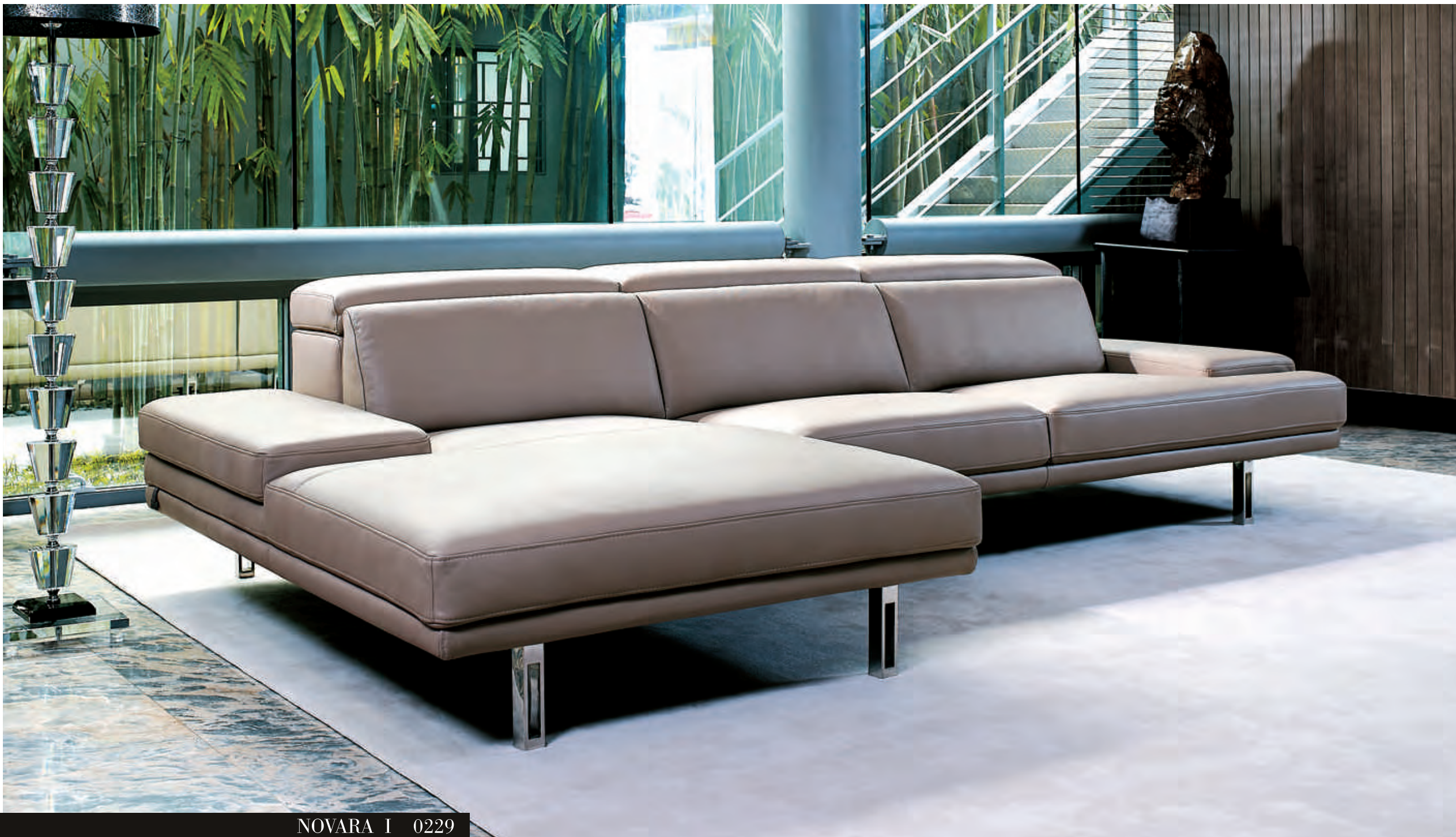
NOVARA I 0229

Model NOVARA was designed for creating a sofa appearance of low backs, low & flat arms and thin seat-frames, yet at the same time, coming with good sitting comfort and support.