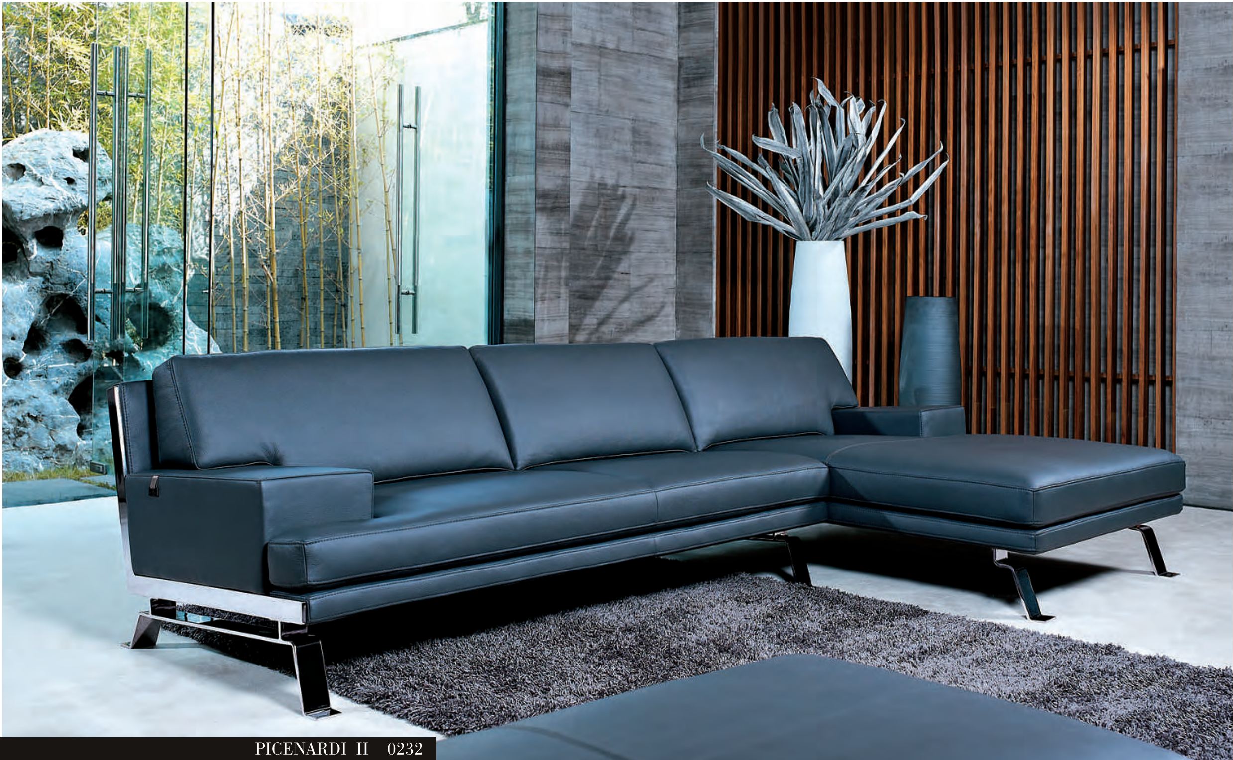
PICENARDI II 0232

The beauty of solid stainless steel has always been a focal point of the KELVIN GIORMANI Collection. In Model PICENARDI II, an L-shape solid stainless steel decorative panel is fixed at each side of the sofa arm. The solid stainless steel sofa leg appears as the continuation of the "L-shape focus."