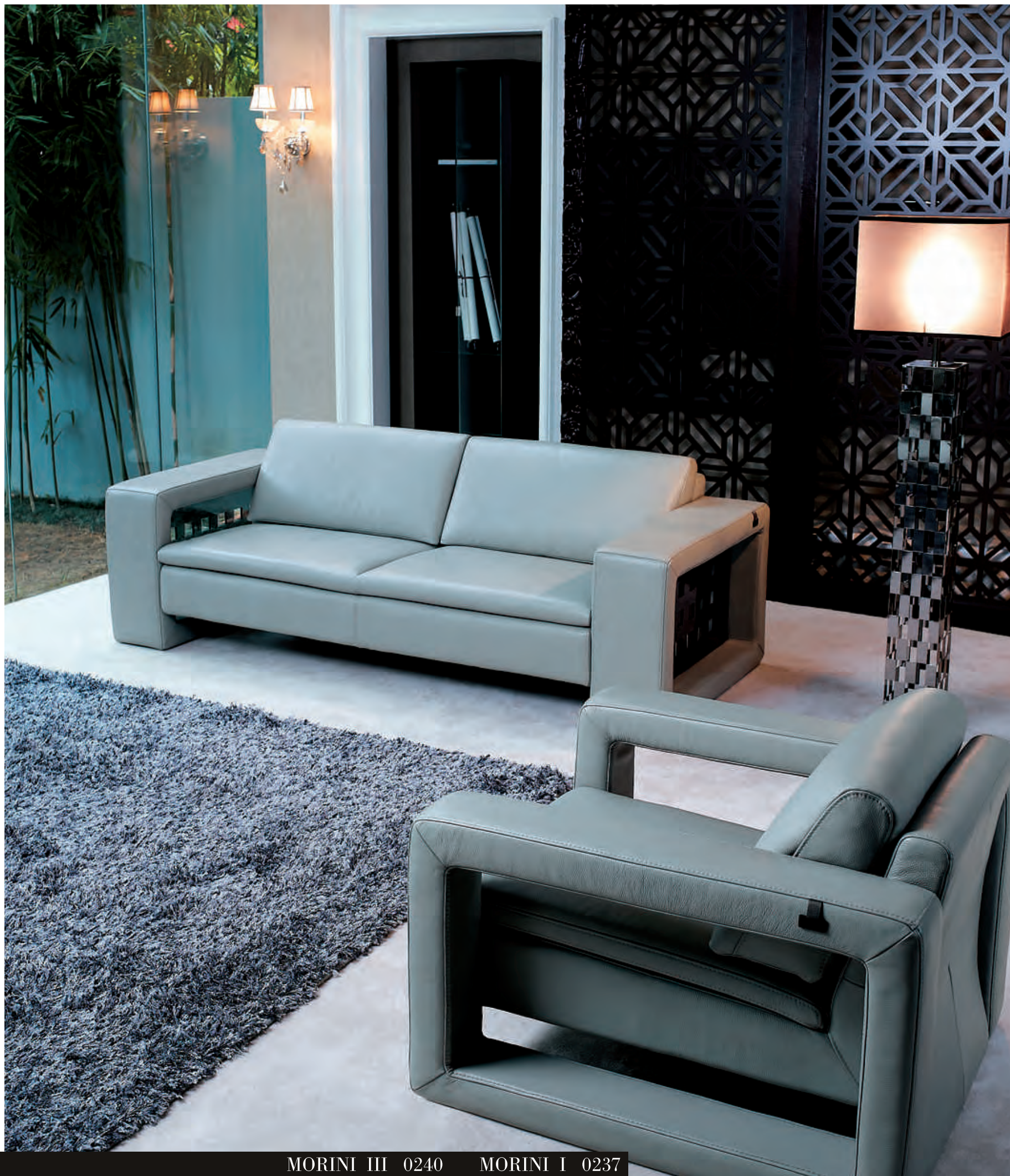
MORINI III 0240 MORINI I 0237