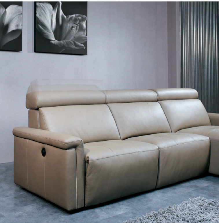
The German head mechanisms can be adjusted even when the recliner function is not effected.