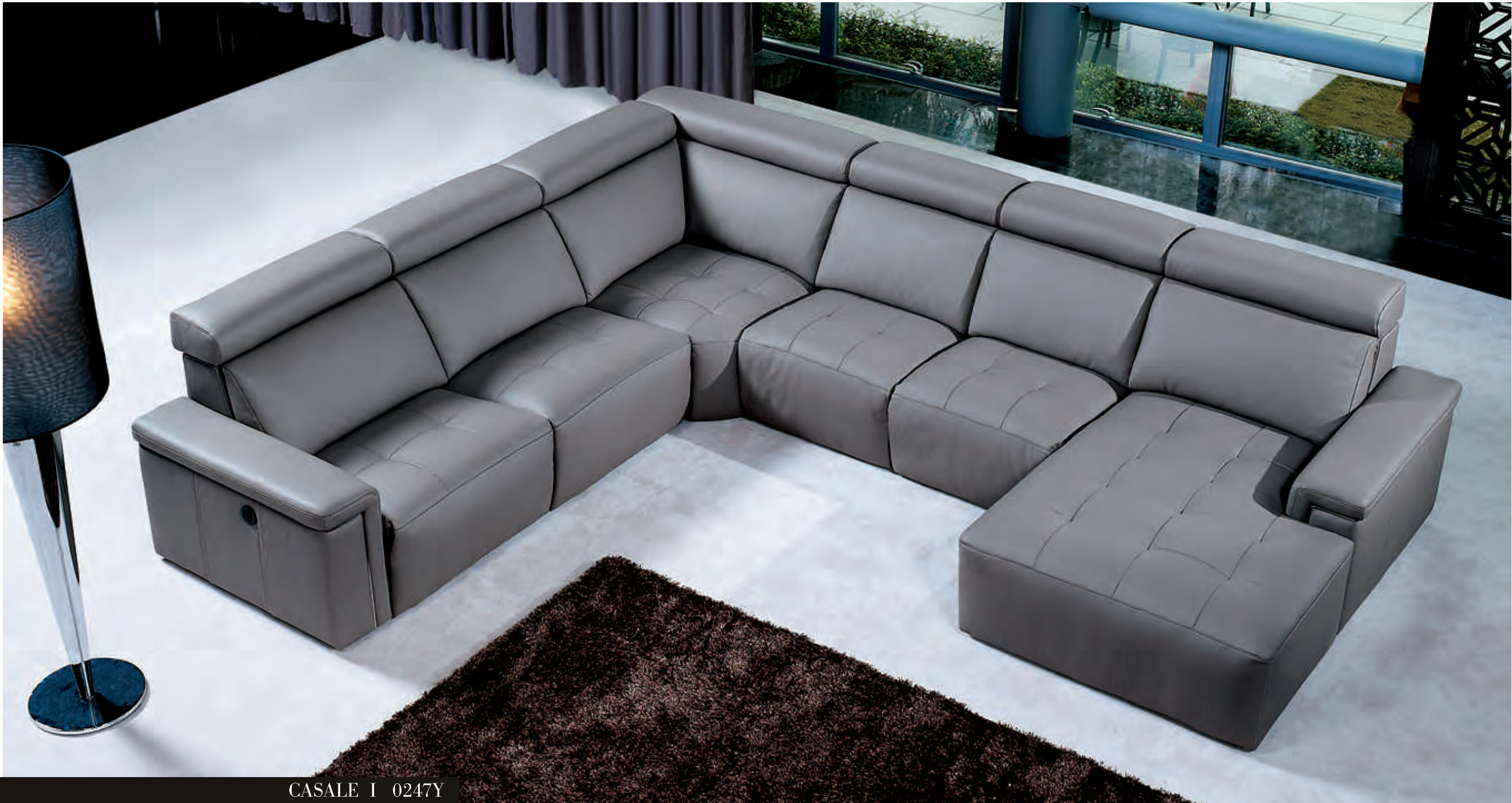
CASALE I 0247Y

Even when the chaise unit of Model CASALE does not recline, it has the head mechanism which is in line with every connecting unit within the CASALE family.