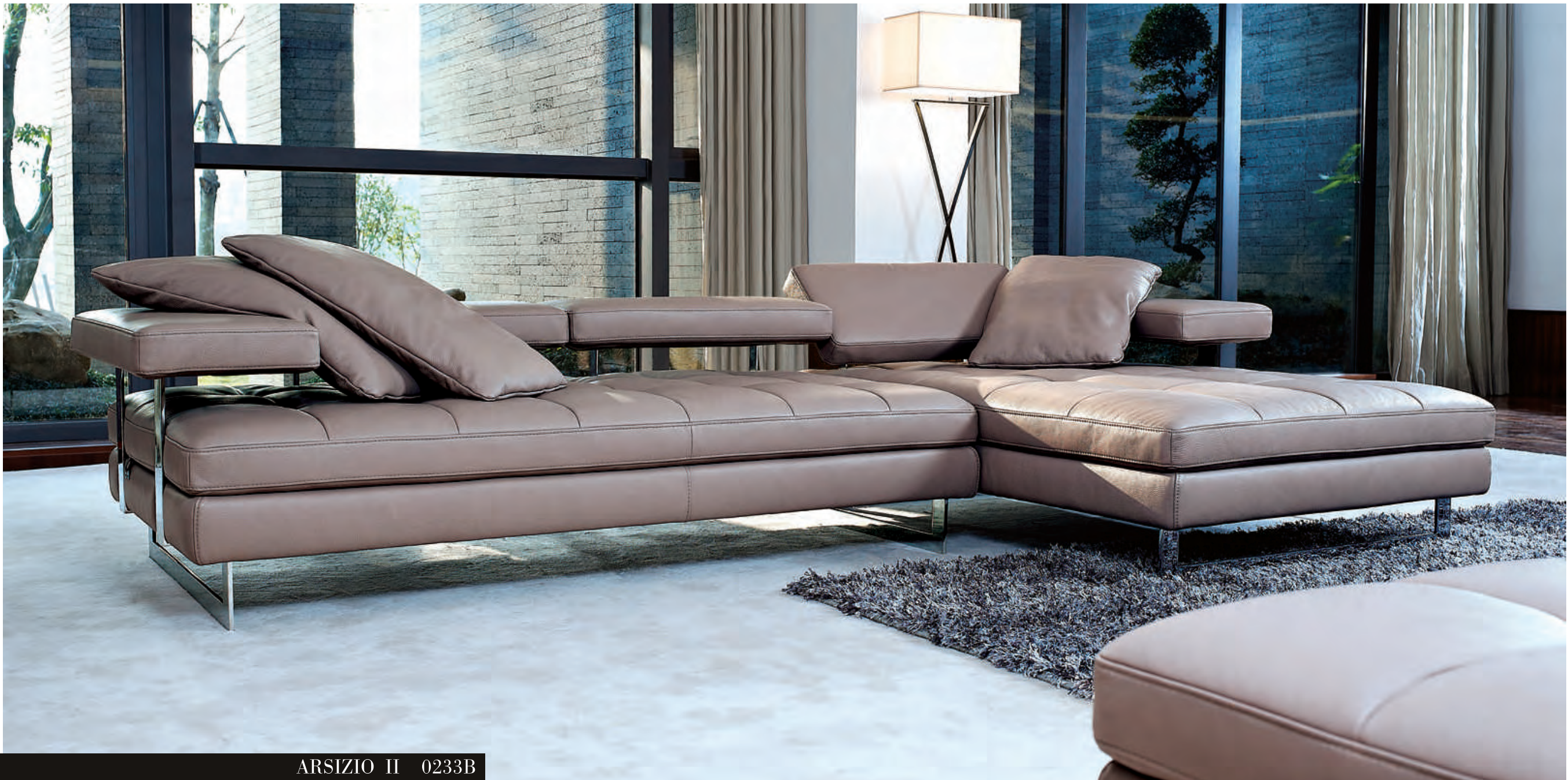
ARSIZIO II 0233B