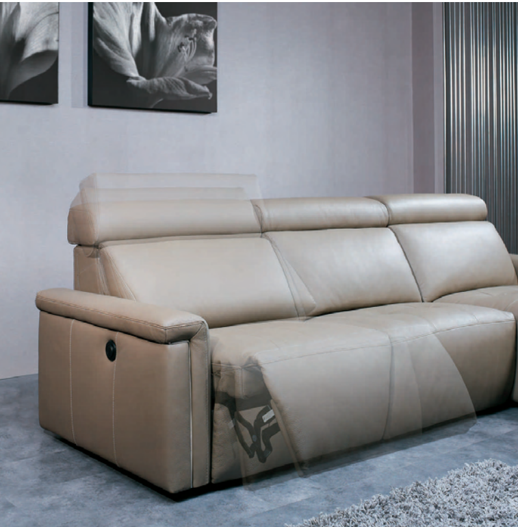
The American reclining mechanism can be operated electrically with a simple switch button (no. ES) or a remote control (ER)