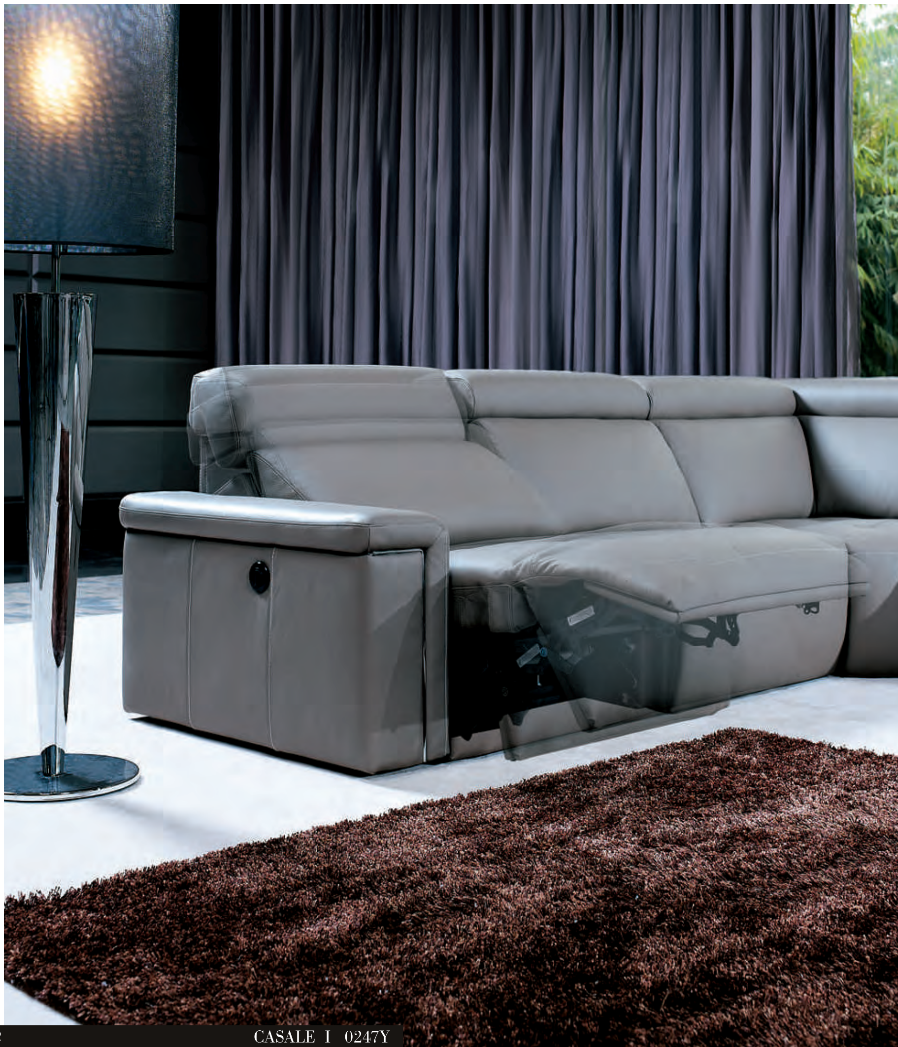
CASALE I 0247Y