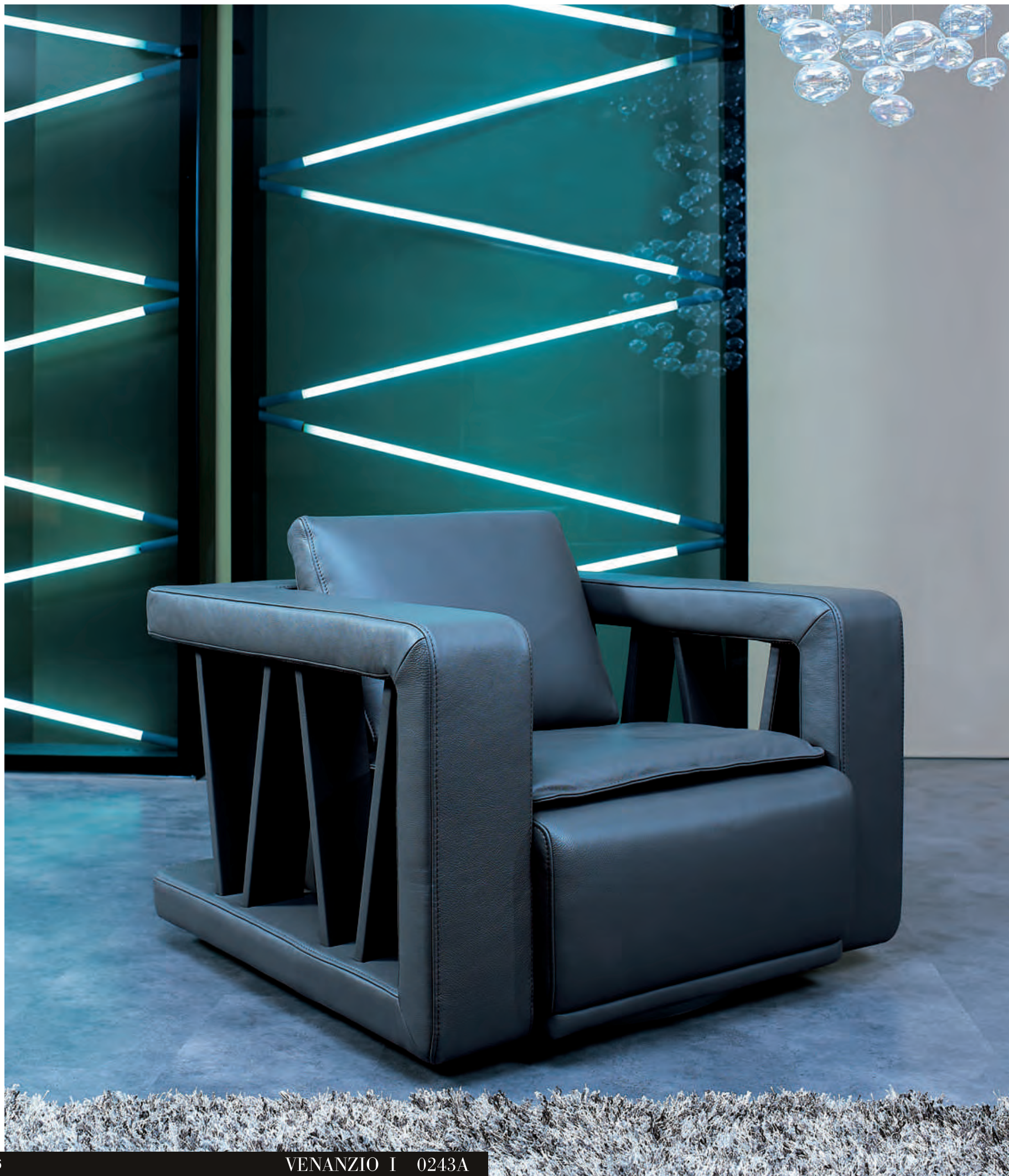
VENANZIO I 0243A