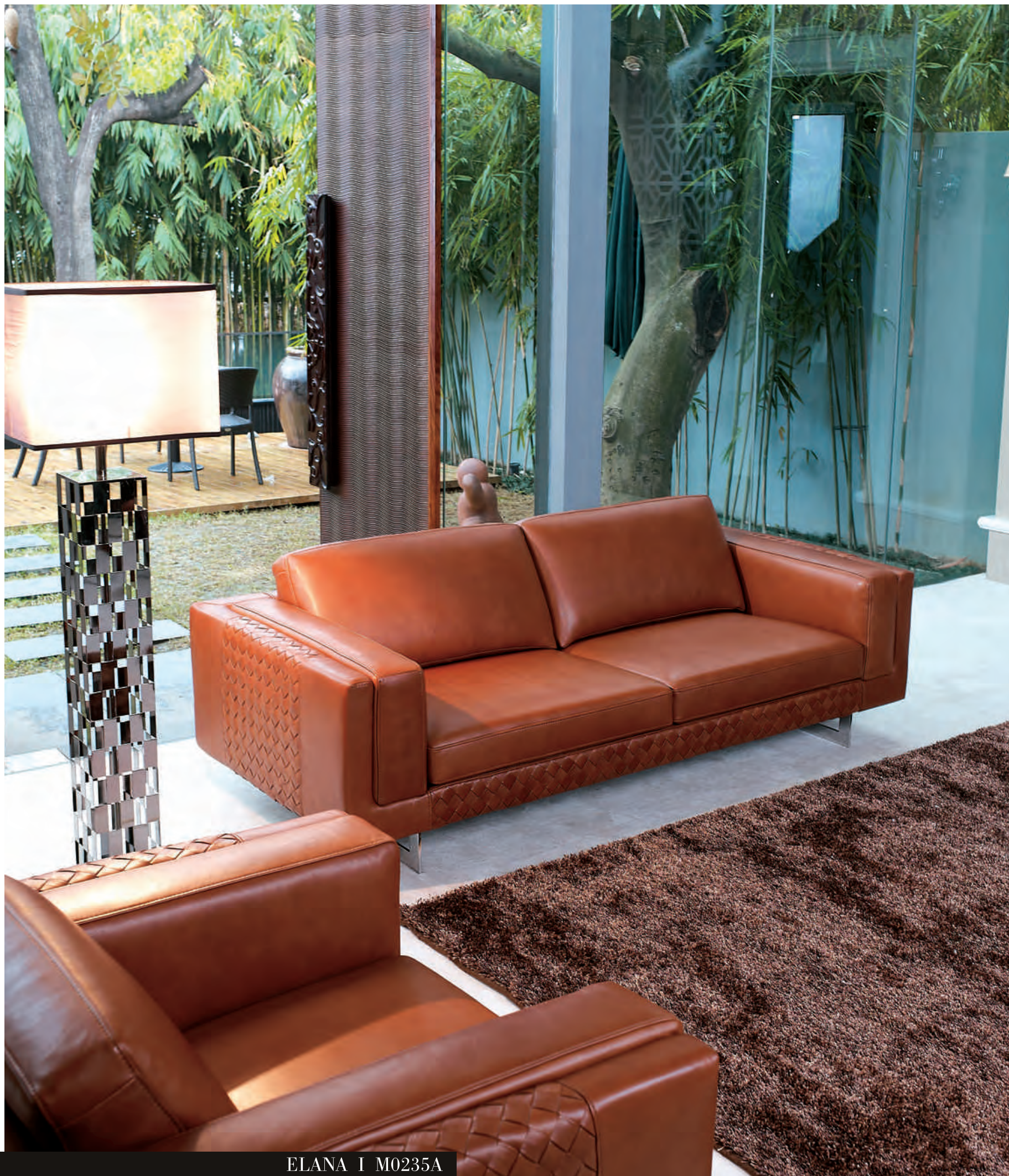
ELANA I M0235A