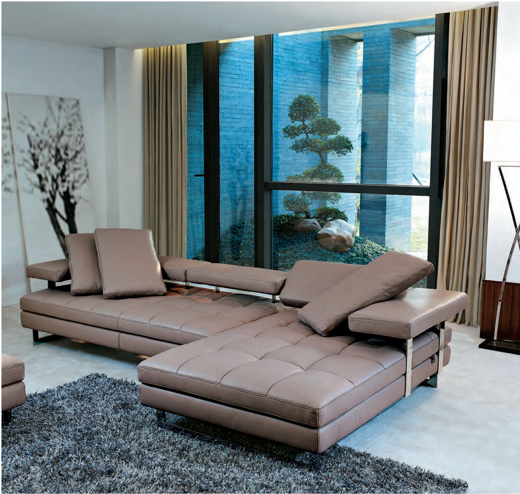
The concept of Model ARSIZIO is to achieve a new "low" level of European contemporary low-back sofa design.