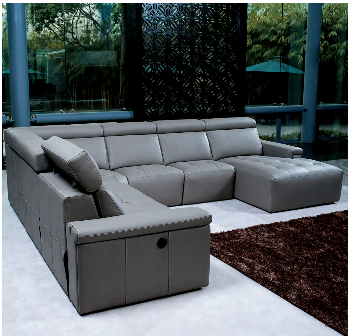
The German head mechanisms can be adjusted even when the recliner function is not effected.