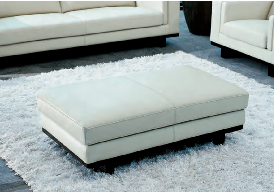
The optional stool (no. ST2) always comes with matching sofa legs.

Model ZENA is a timeless and minimal design piece with some unusual design features. The double-leg design is perfectly in line with the double-arm design which gives the uniqueness to Model ZENA.