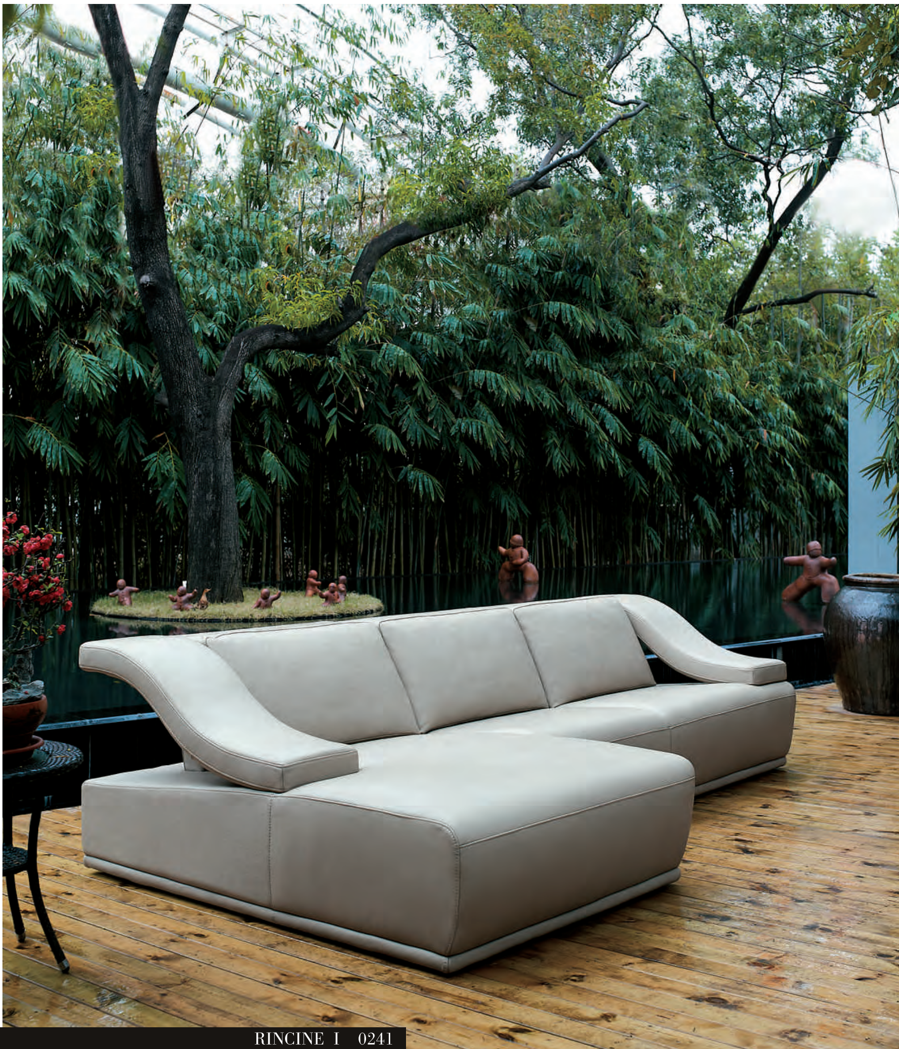
RINCINE I 0241