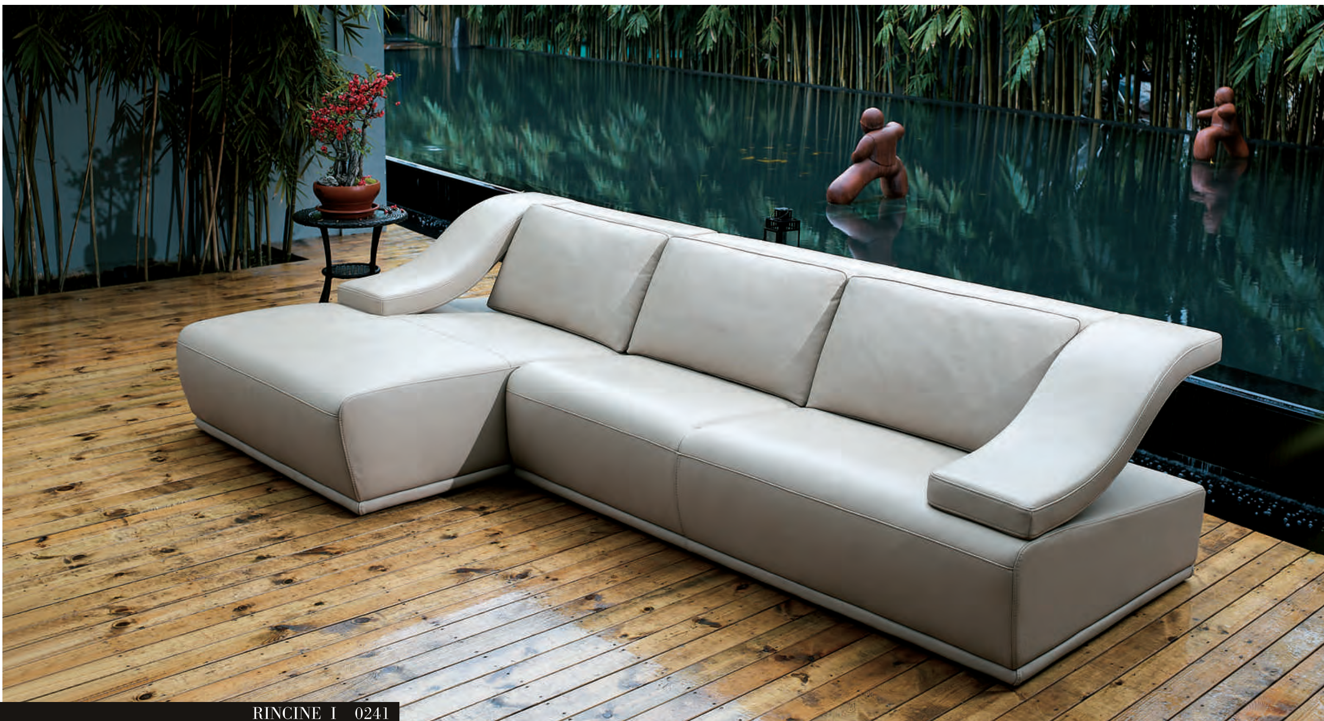
RINCINE I 0241

The optional stool (no. ST2) always comes with the cushion and frame that match the sofas.