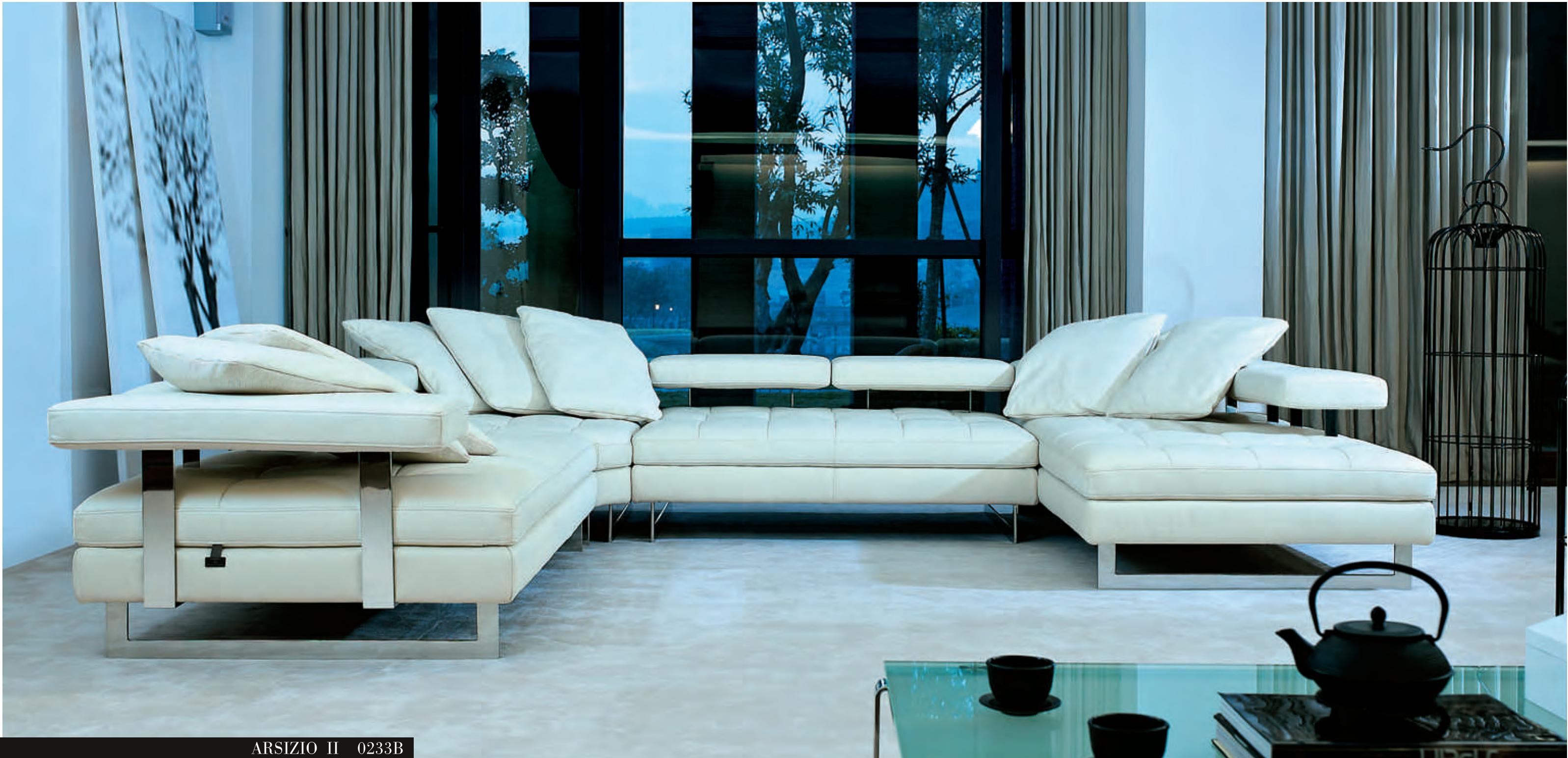
ARSIZIO II 0233B

The transparent feature of the sofa back frames is appreciated even when Model ARSIZIO is looked from the back side of the sofa set. It's a perfect choice for placing in the center of a large living room with an open interior design concept.