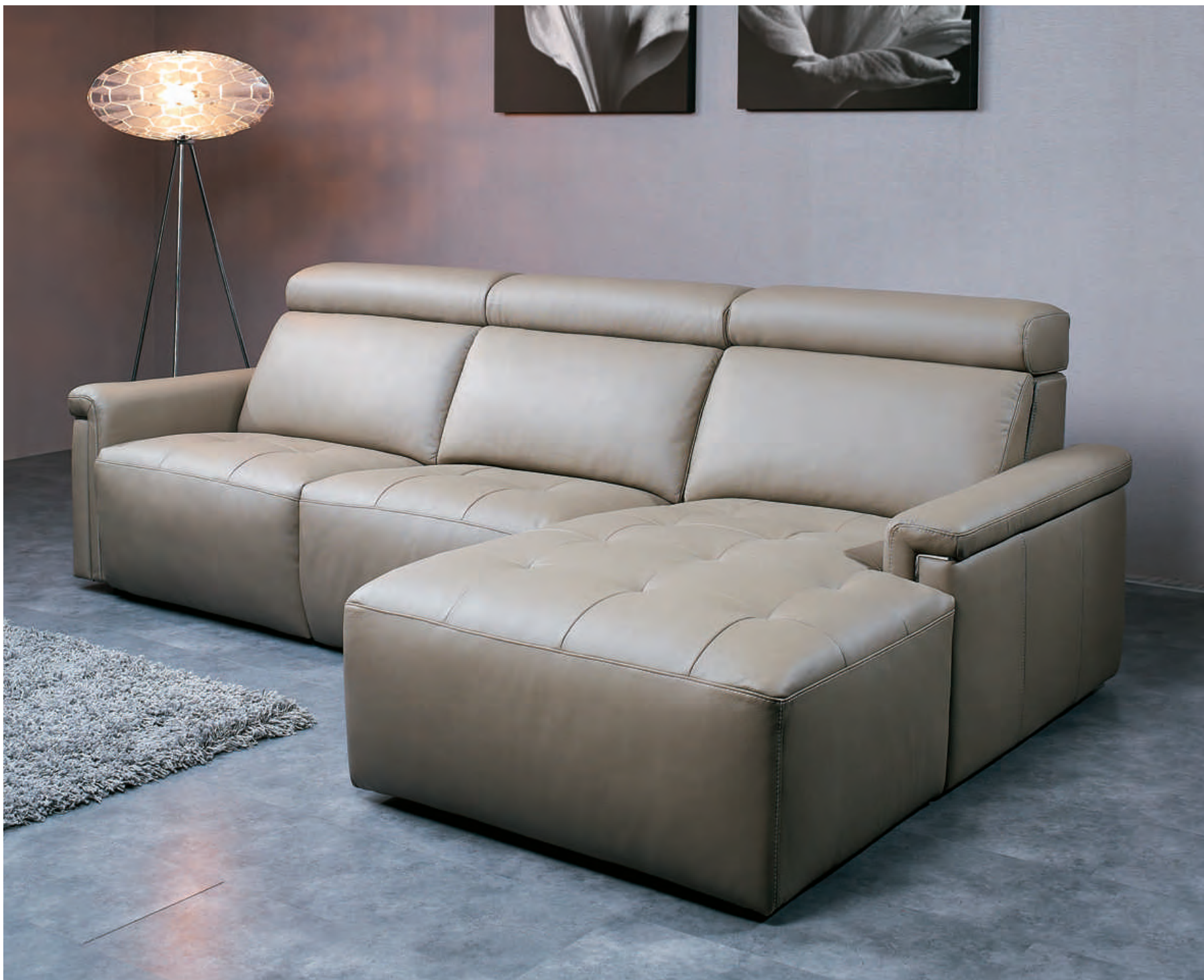
Model CASALE has both reclining mechanisms and adjustable head mechanisms working independently.