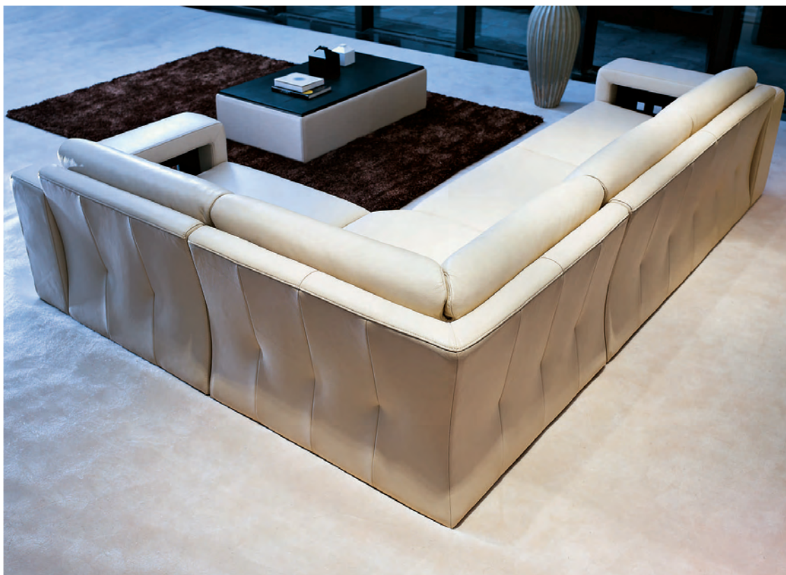
The slightly curved back shape is also an additional design feature which makes Model MORINI look appealing 360 degree while being placed at the center of a living room.