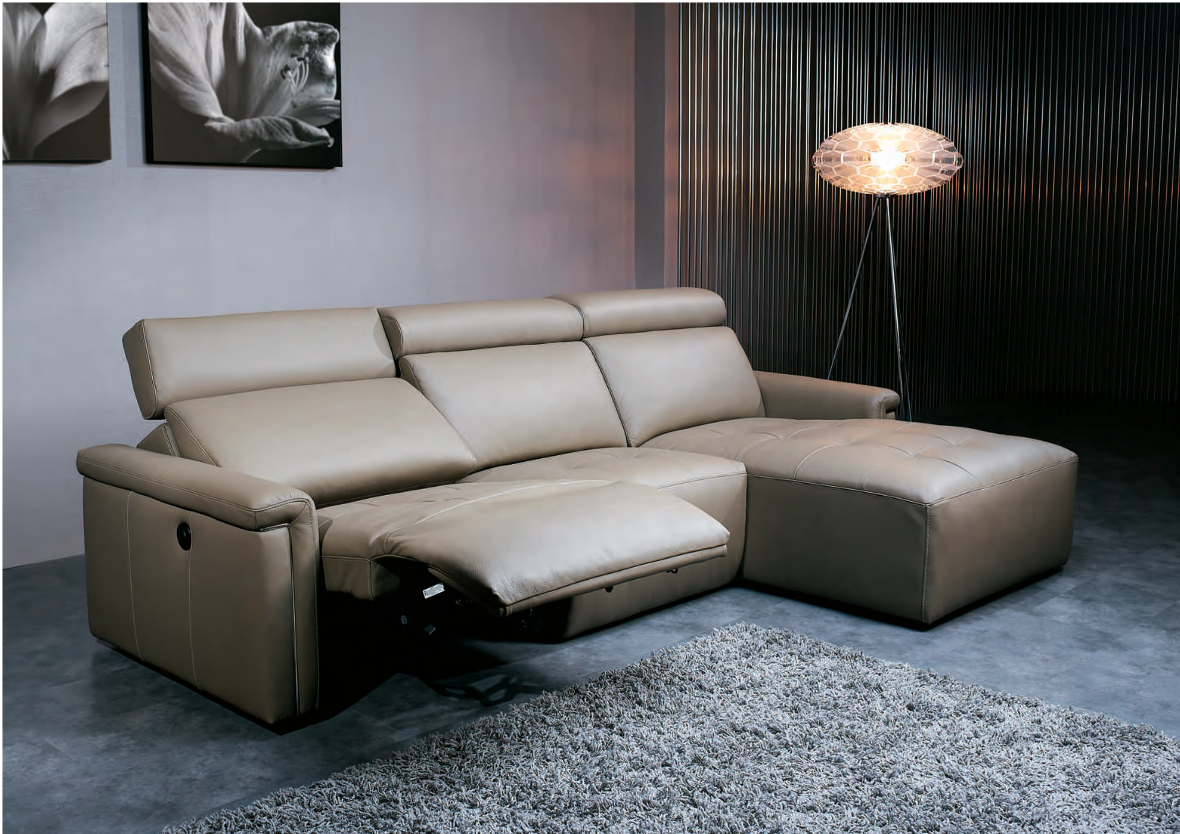
There are 2 different widths of sofa arm within Model CASALE. Model CASALE II (no. 0248Y) has a narrower arm which is 7cm different from the arm width of CASALE I (no. 0247Y).