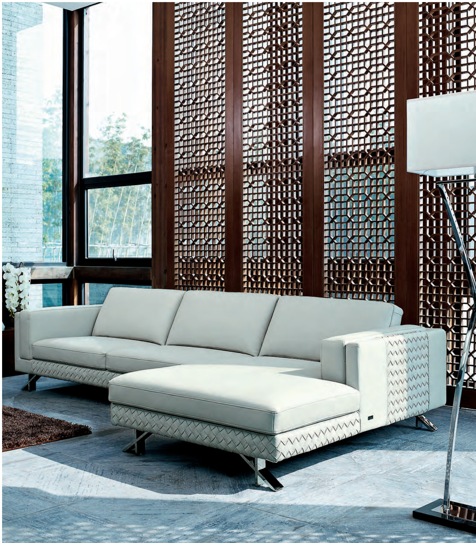
ELANA II M0235B