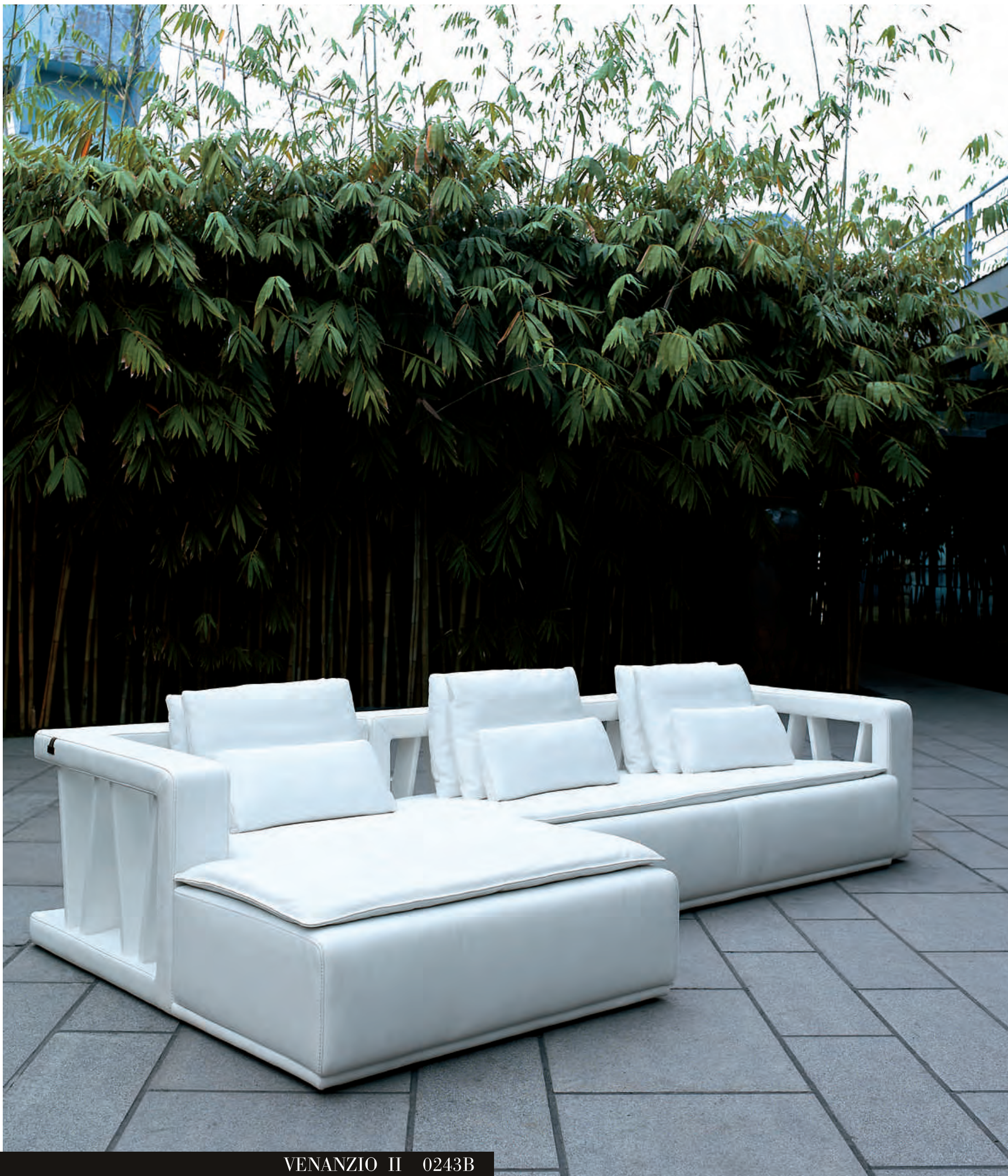
VENANZIO II 0243B