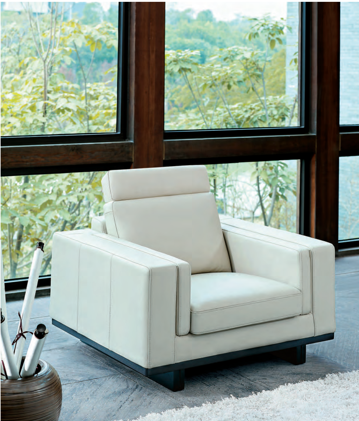
The optional headrest (no. HR3) delivers extra support for your head.