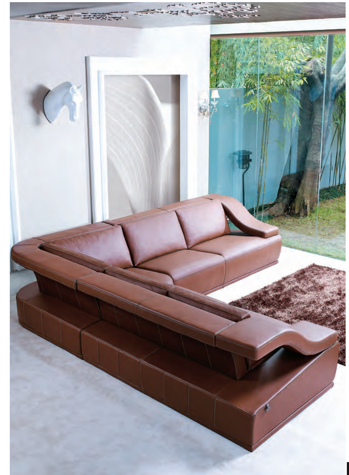
Model RINCINE II has the back frame top 8cm deeper than that of Model RINCINE I. The extra wide back frame top becomes like a wide and flat platform on the top of the sofa group. The larger it is the sofa composition, the more grand the view (of the flat platform) from above becomes.