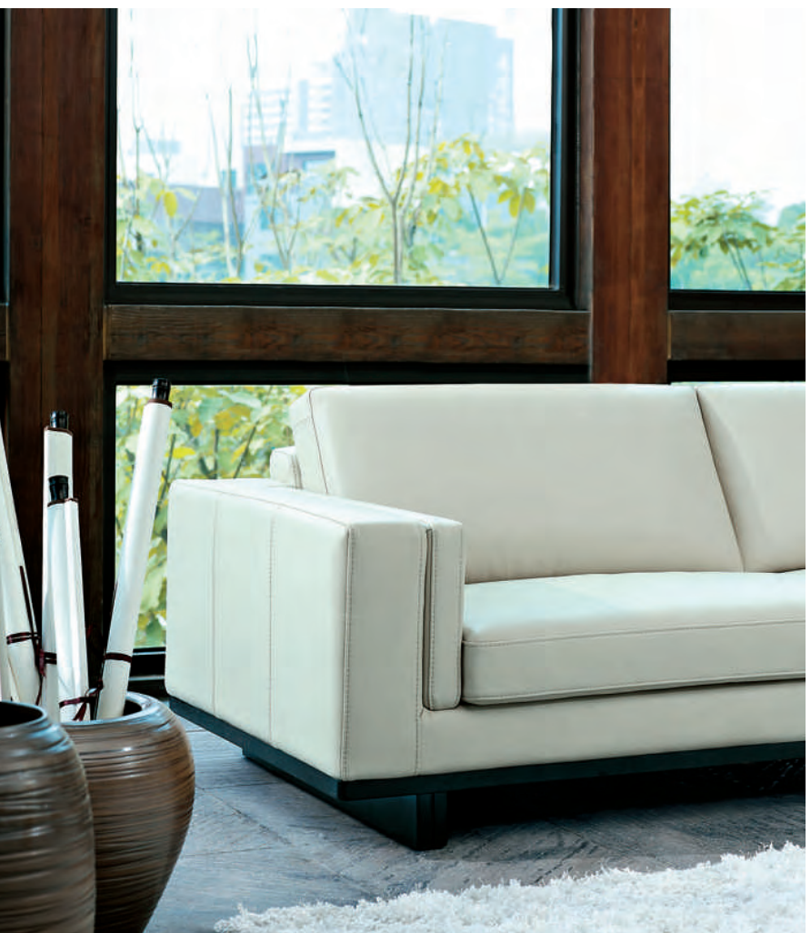
The beauty of nature solid wood has become the main design feature of Model ZENA.

Model ZENA is a timeless and minimal design piece with some unusual design features. The double-leg design is perfectly in line with the double-arm design which gives the uniqueness to Model ZENA.