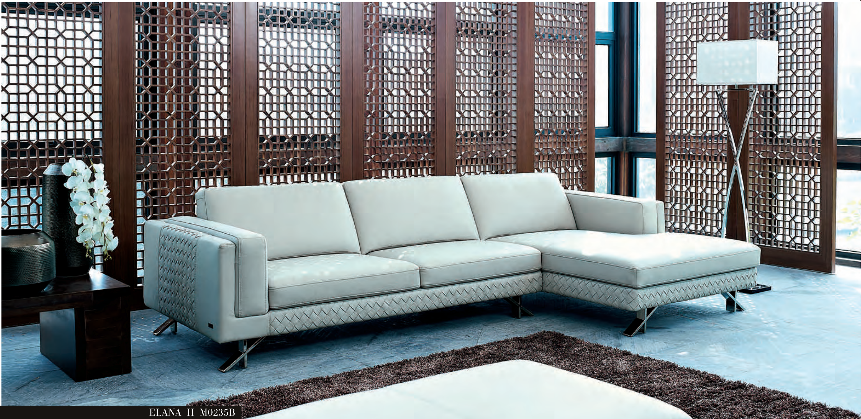
ELANA II M0235B

The woven effect is particularly designed to place in between regularly upholstered leather pieces from the sofa-arm side to seat-front frame. Its a good balance between over-exposure and lack-of-character.