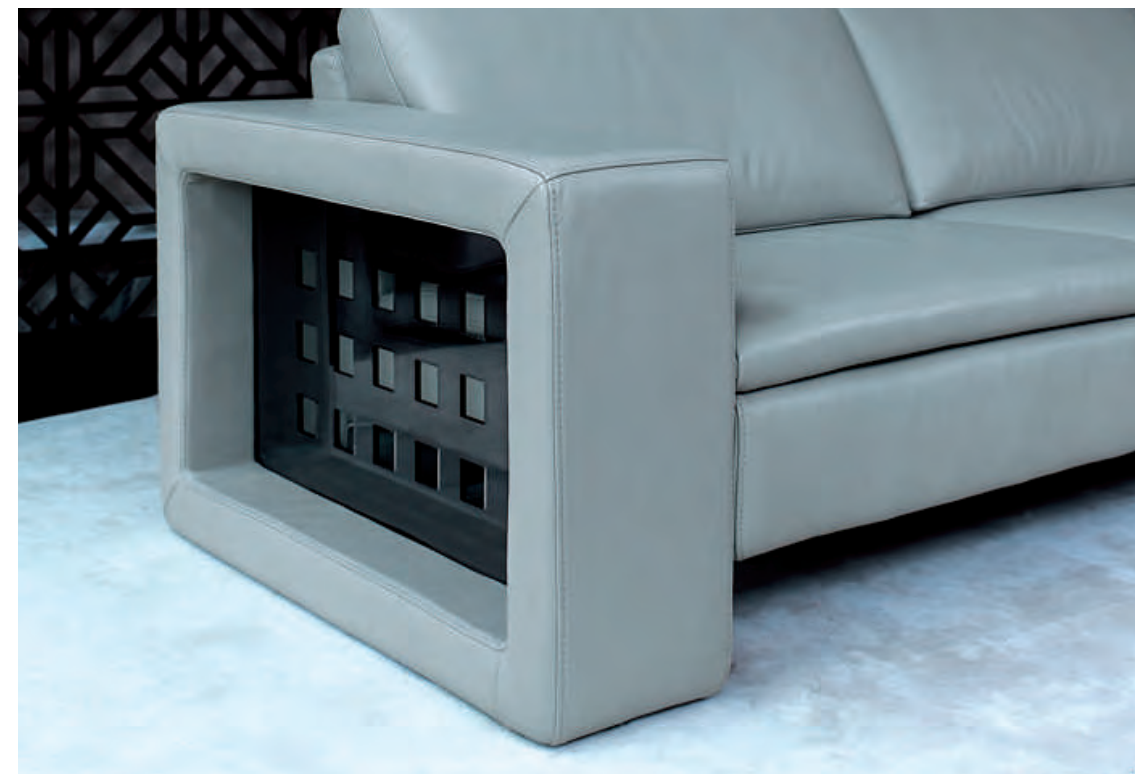
Model MORINI III features an acrylic plate with checkers pattern being fixed in the middle of a hollowed sofa arm. It also has a see-through feature between the outer side and the inner side of a sofa arm.