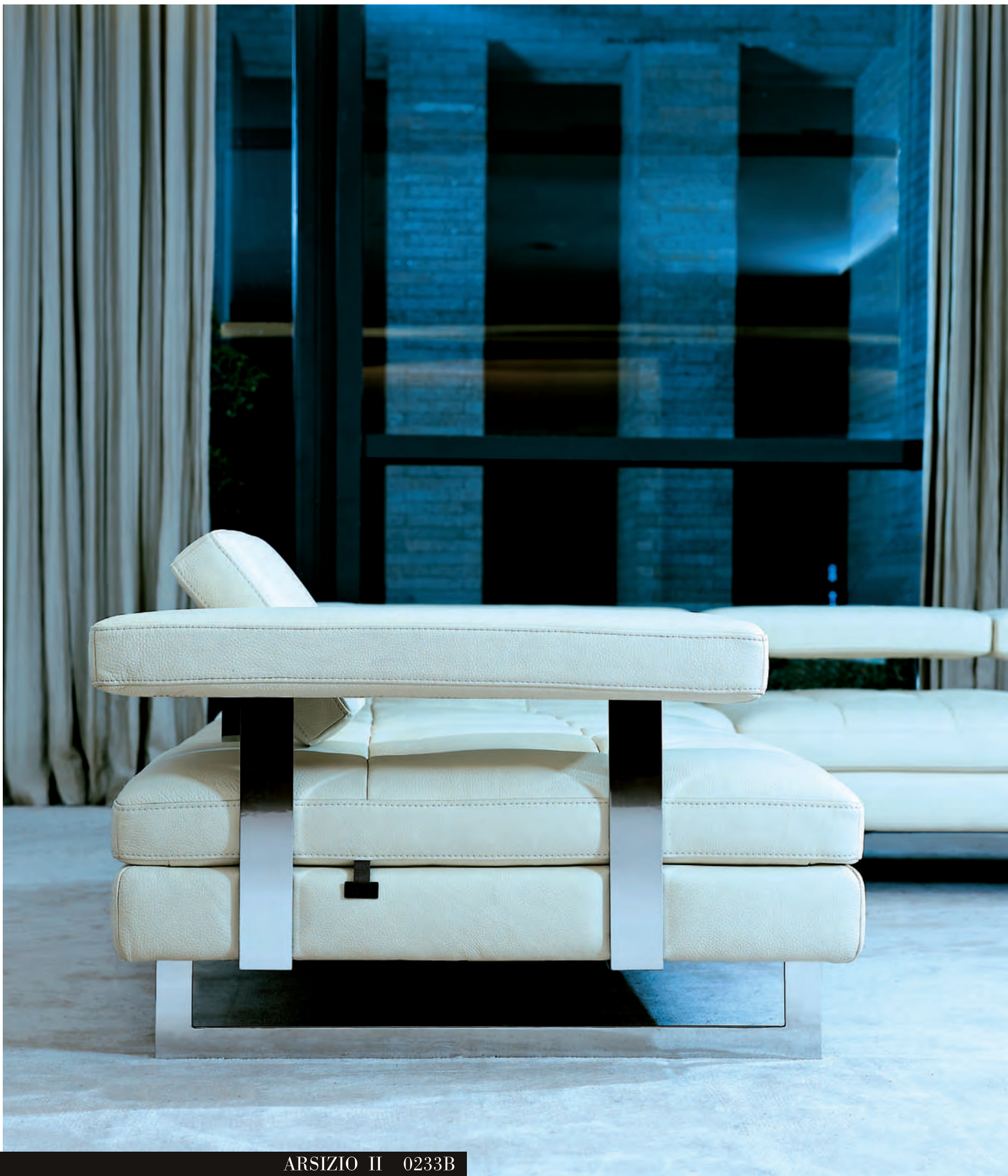
ARSIZIO II 0233B