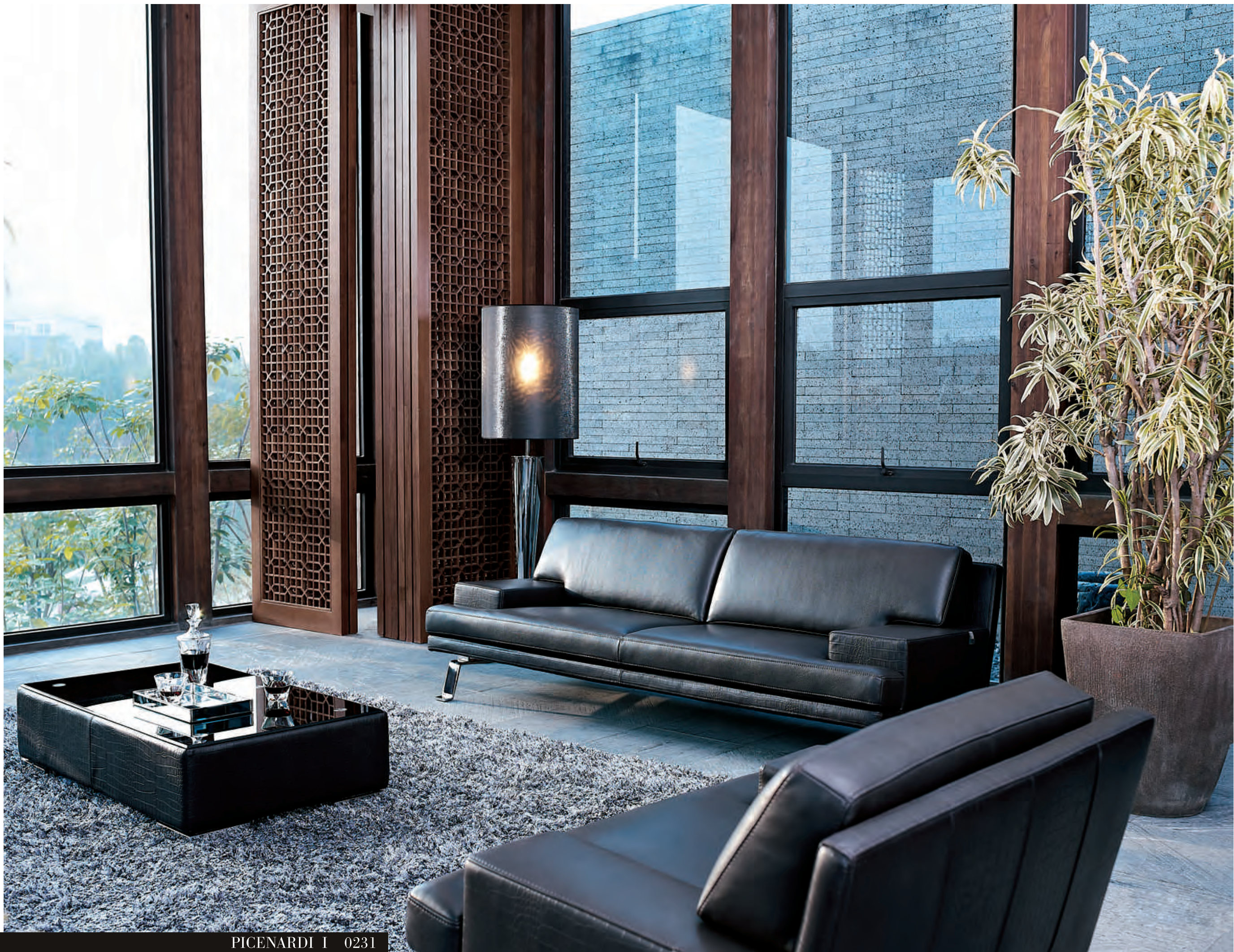
PICENARDI I 0231

Model PICENARDI I was designed for those who are fond of minimal designs and appreciate the aesthetics of straight lines and clear profiles.