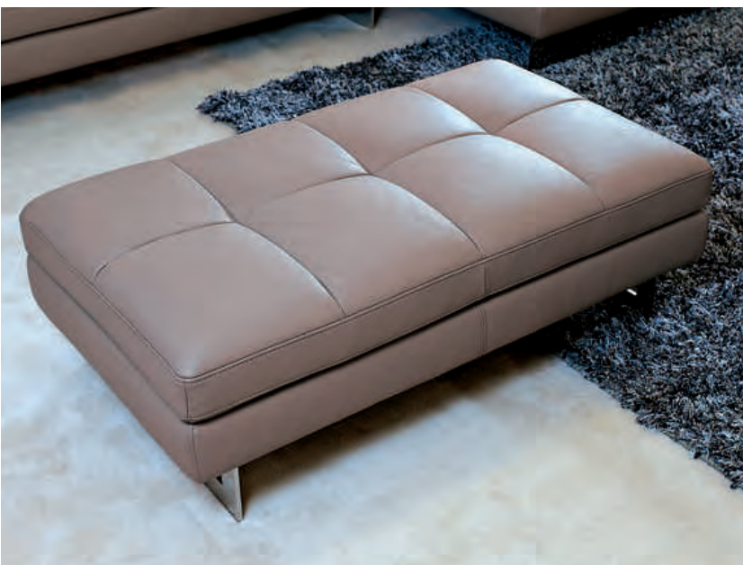
The optional stool (no. ST2) always comes with matching sofa legs.