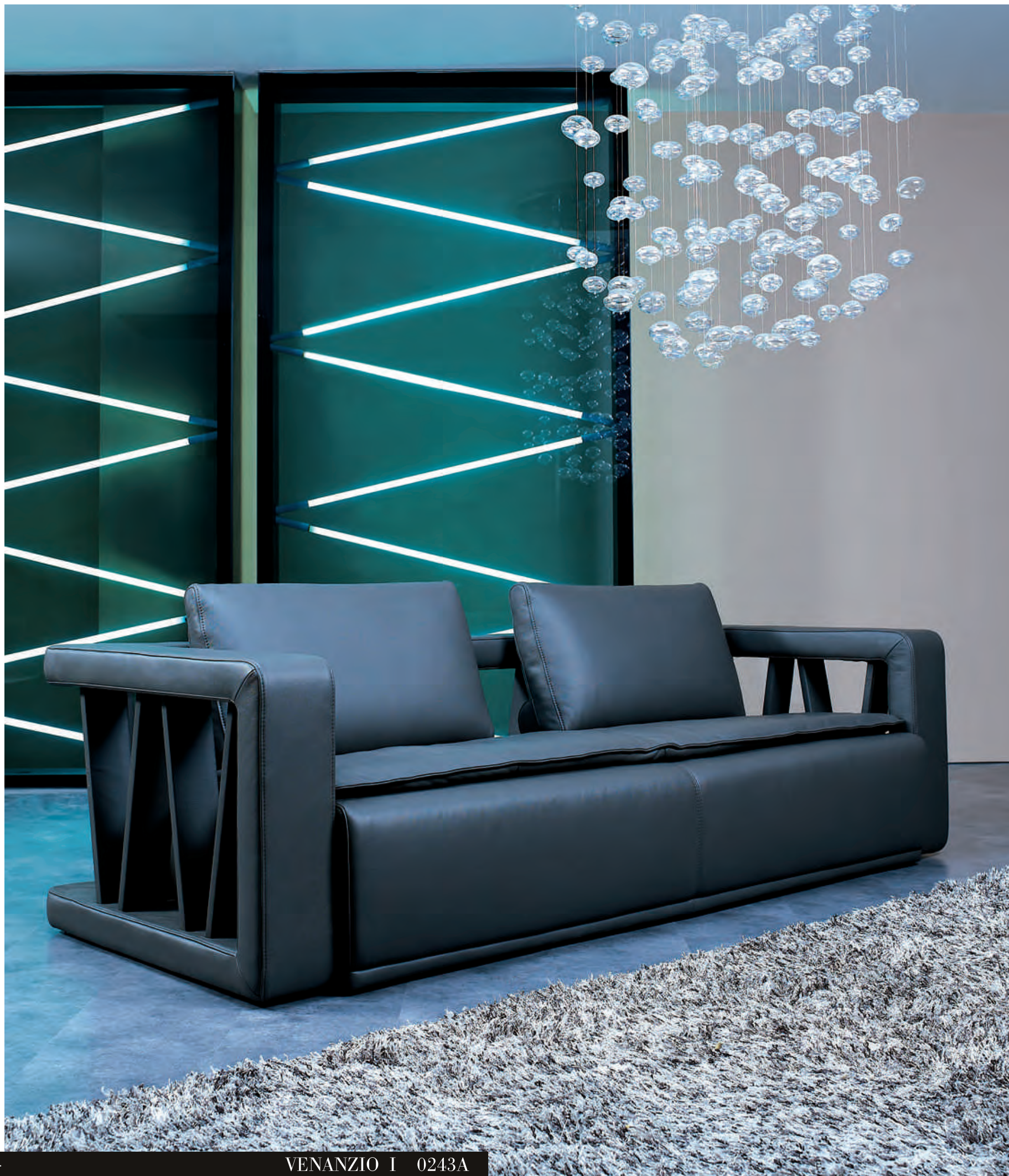
VENANZIO I 0243A