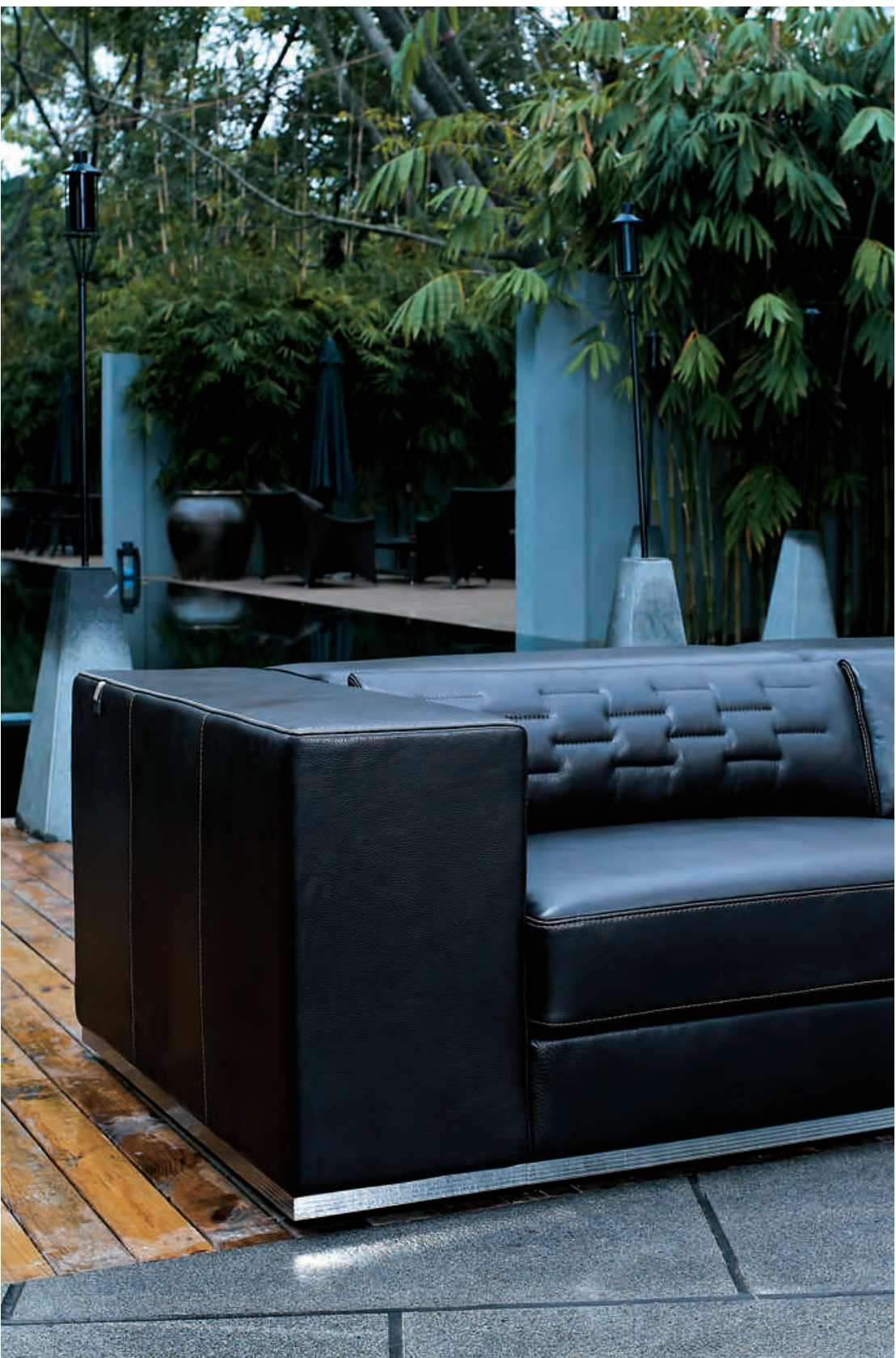
MORA is a design piece that can be both long lasting and one-of-a-kind.