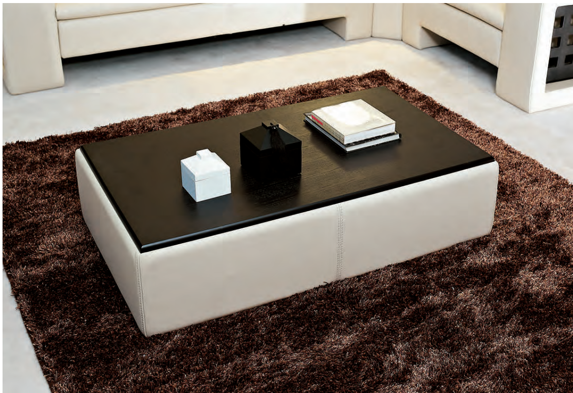
The optional coffee table (no. STW3) has a wood-veneer panel top that matches the color of the sofa arm side decorative panels of Model MORINI II.