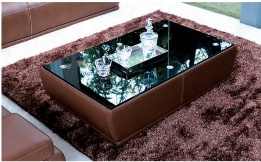
The optional coffee table (STG3B) comes with the frame design that matches the seat frame of the sofa.