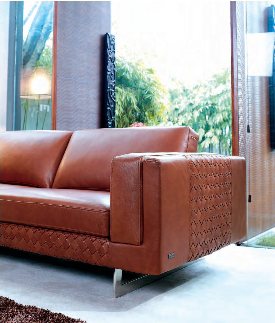
Model ELANA presents a new definition of luxury sofas. They do not only need to come with first class materials, the luxury craftsmanship is also a key element.