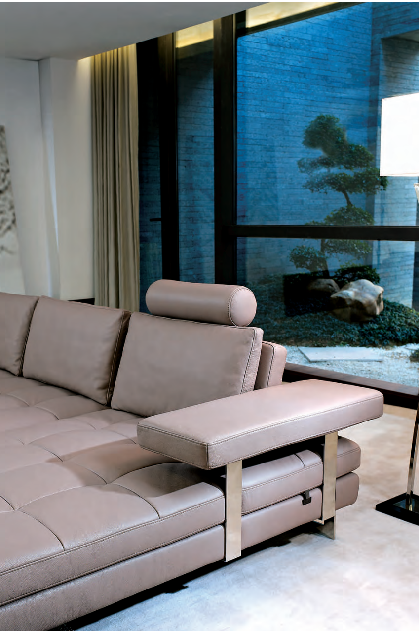
The optional headrest (no. HR) delivers extra support for your head. When it is not used, the headrest can be inserted at the side or the back of the sofa frames.