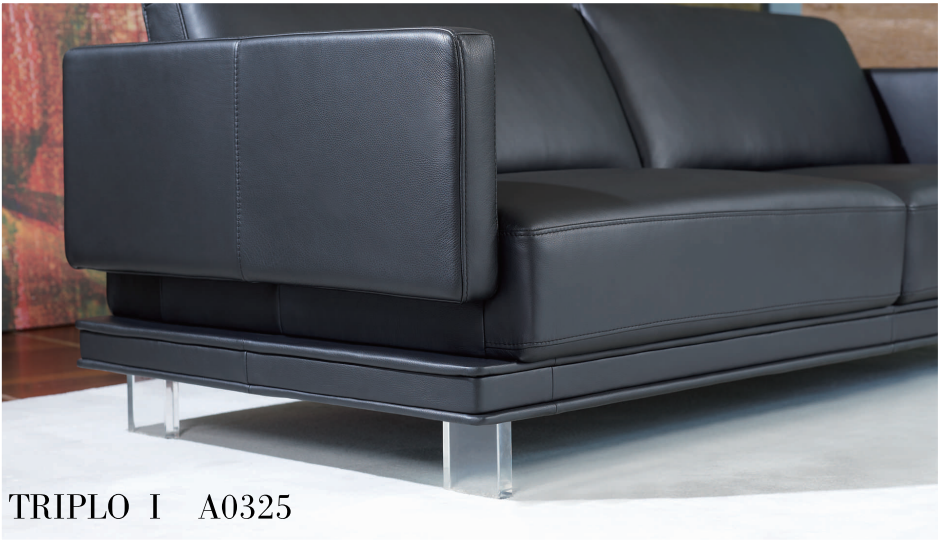
TRIPLO I A0325

The Y-shape stainless steel leg well matches modern home interior settings. Leather-folding Effect on the sofa base frame is meant for those who love fine details.