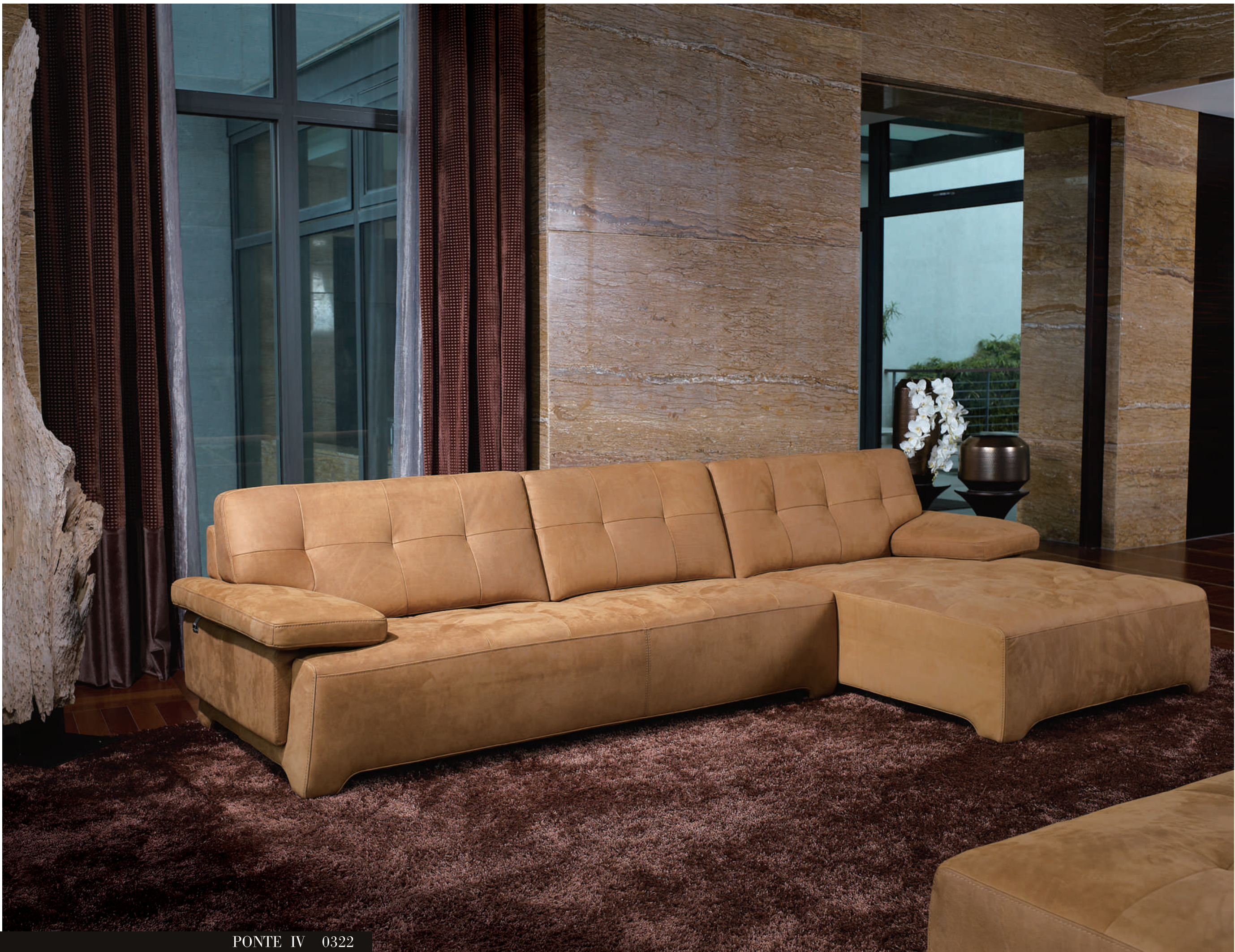
PONTE IV 0322