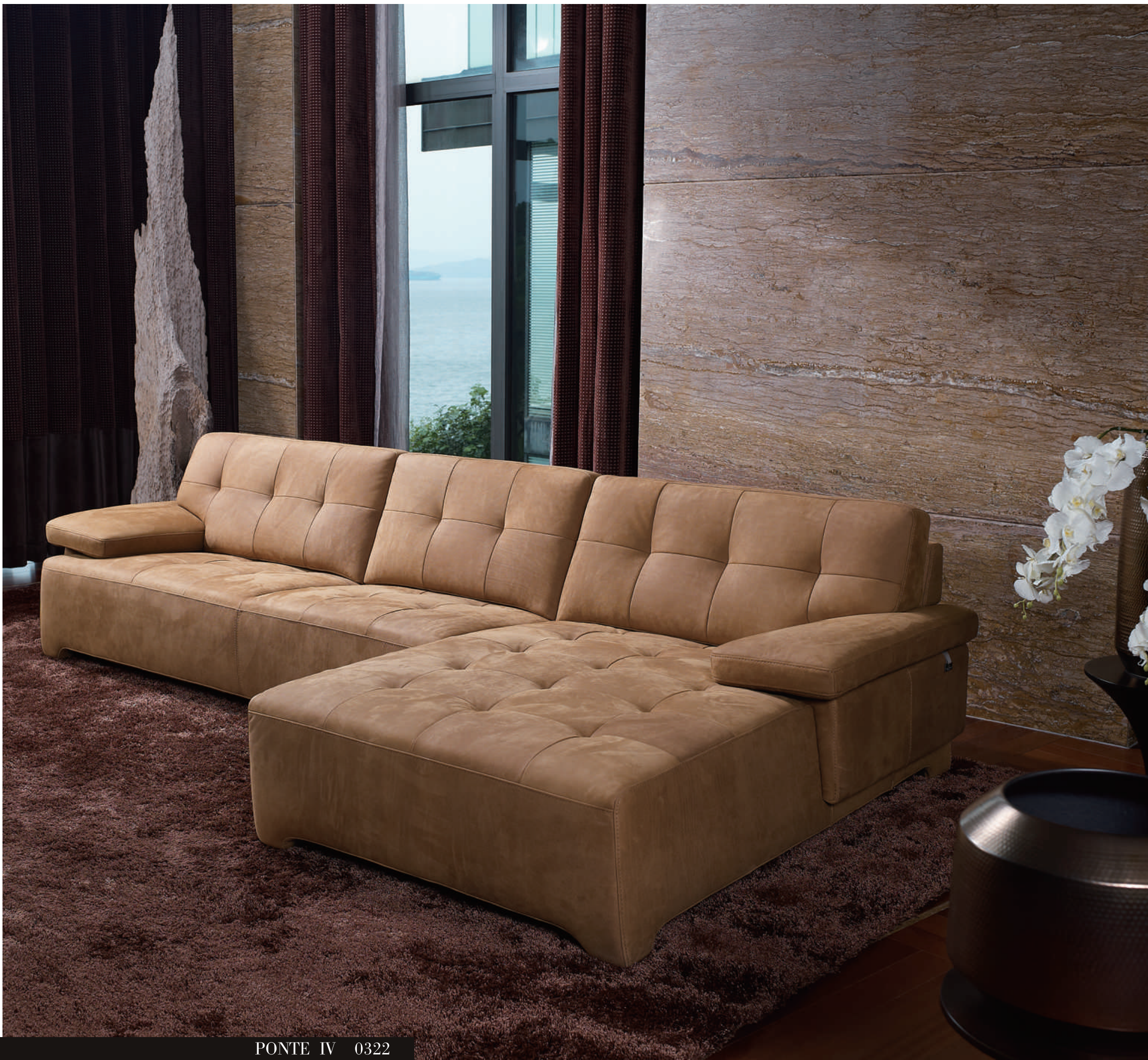
PONTE IV 0322