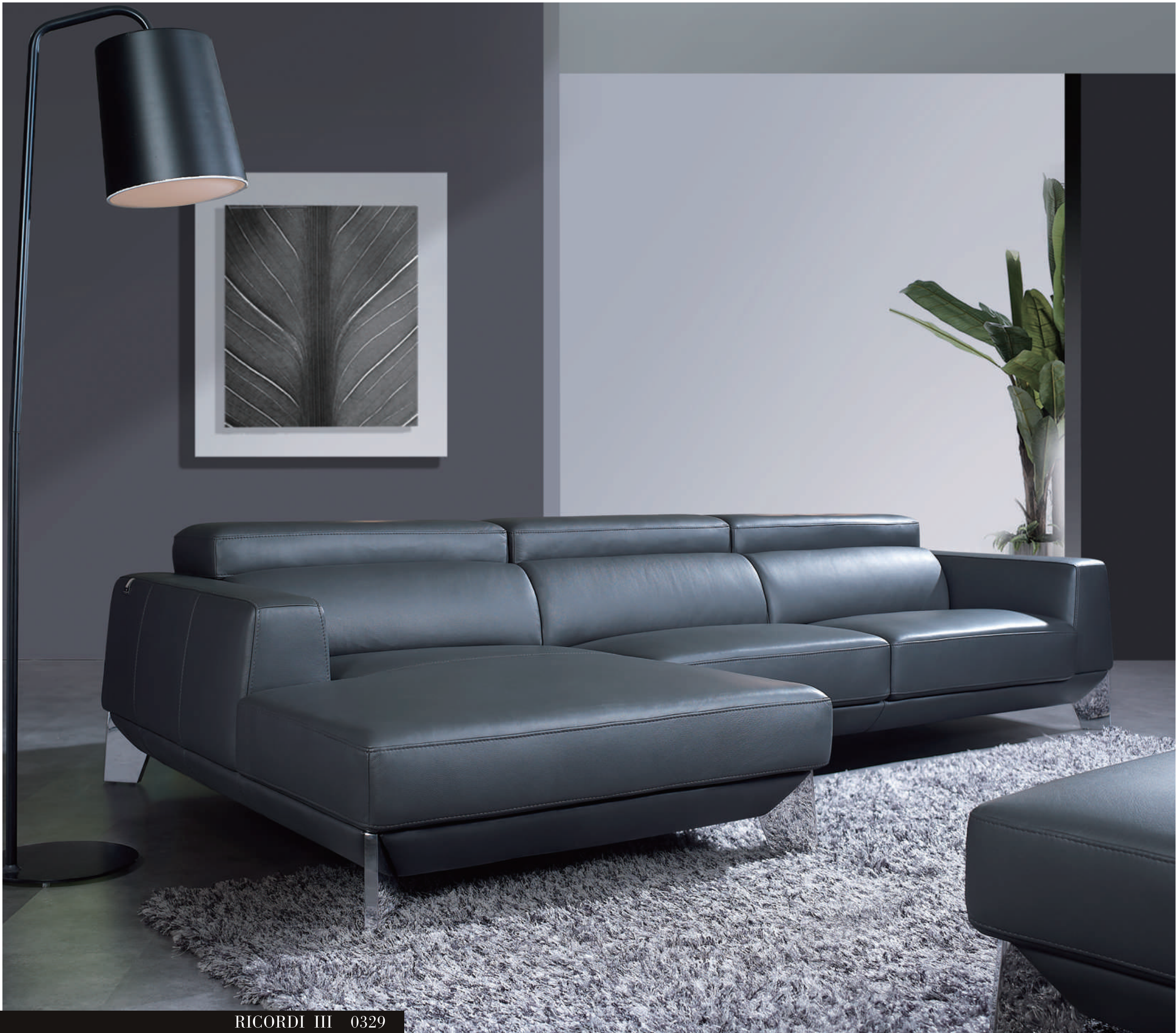
RICORDI III 0329