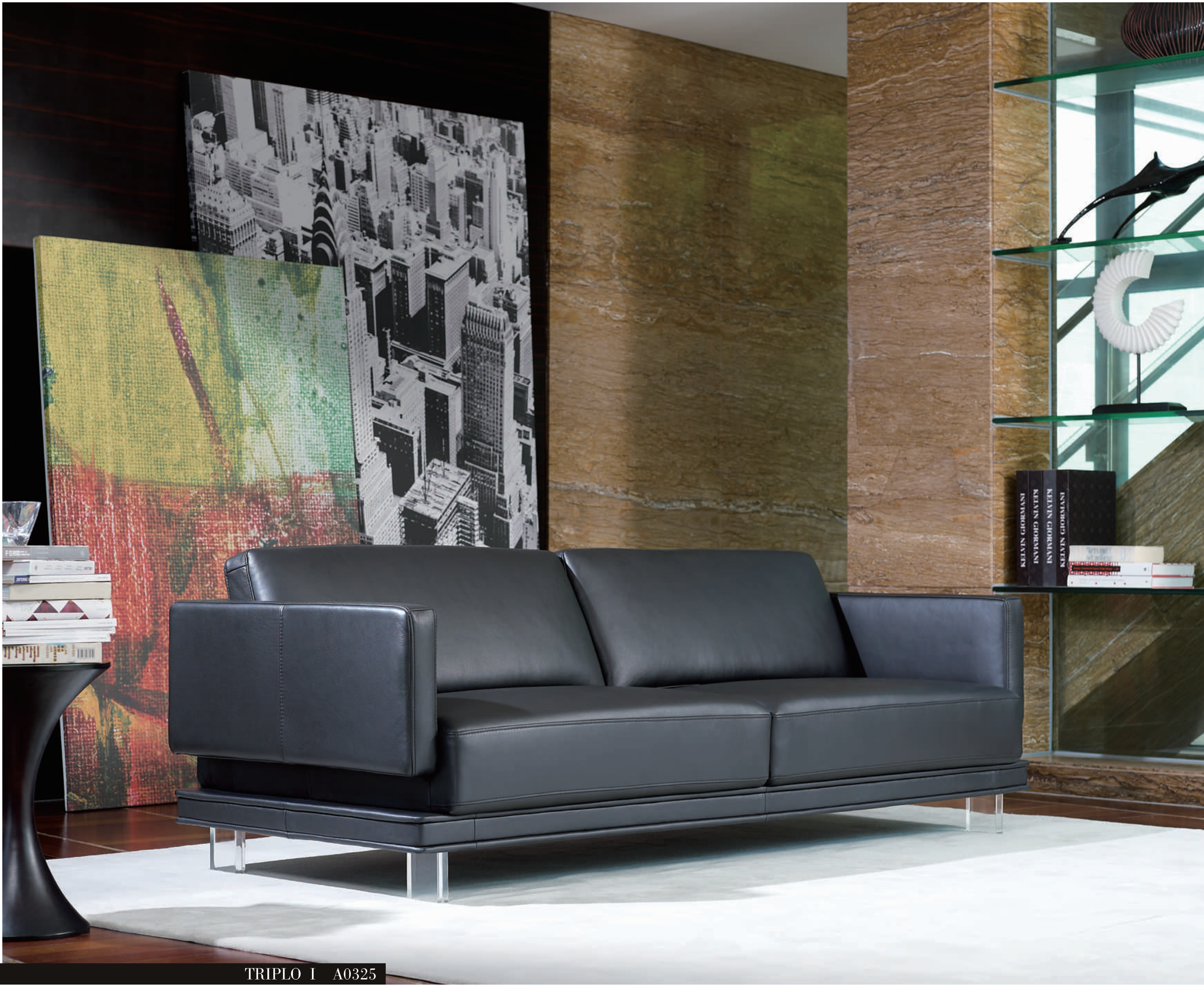
TRIPLO I A0325