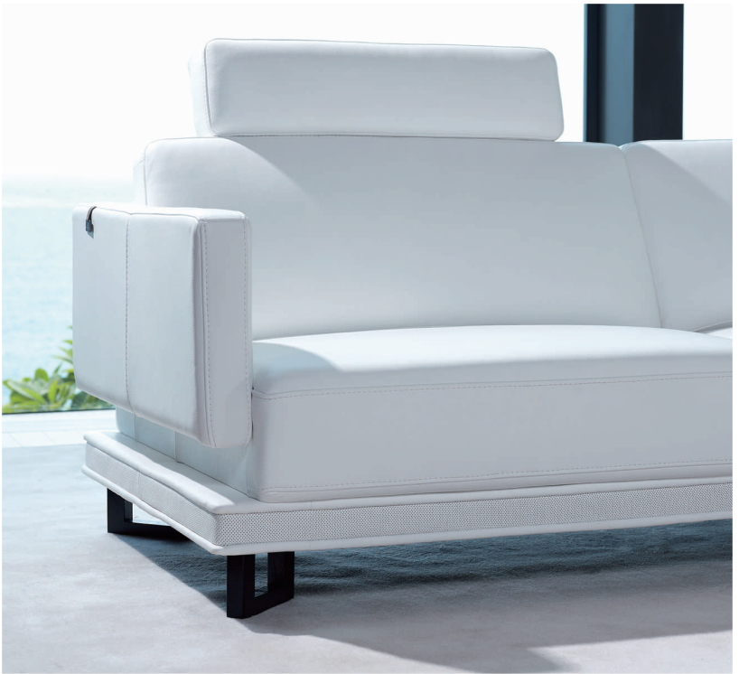
Optional headrest (HR4) offers extra neck support.