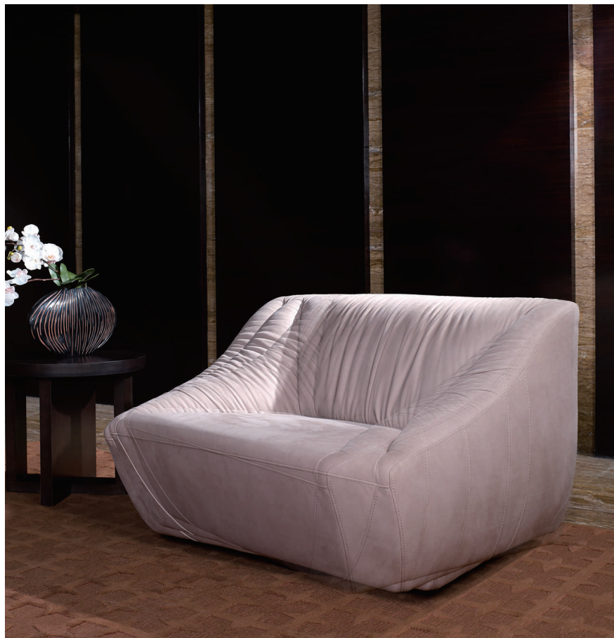
The matching armchair has an option with the swivel mechanism (1DV).