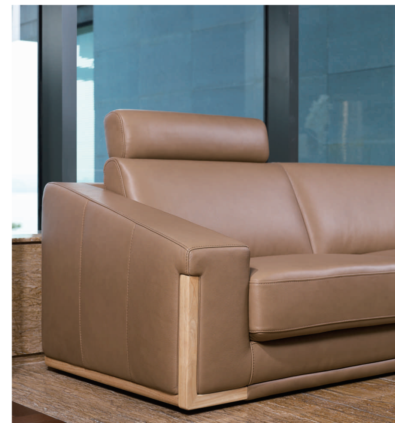
Optional headrest (HR4) offers extra neck support.