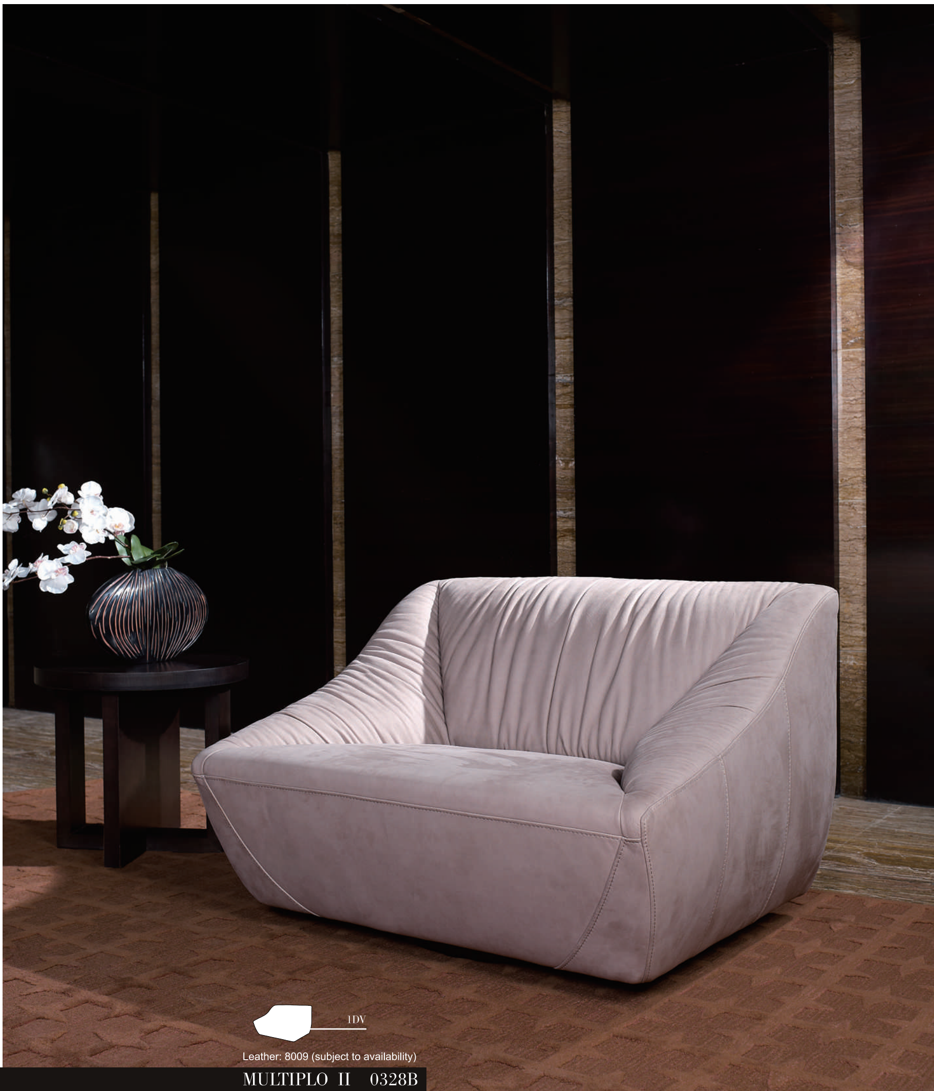
1DV Leather: 8009 (subject to availability) MULTIPLO II 0328B