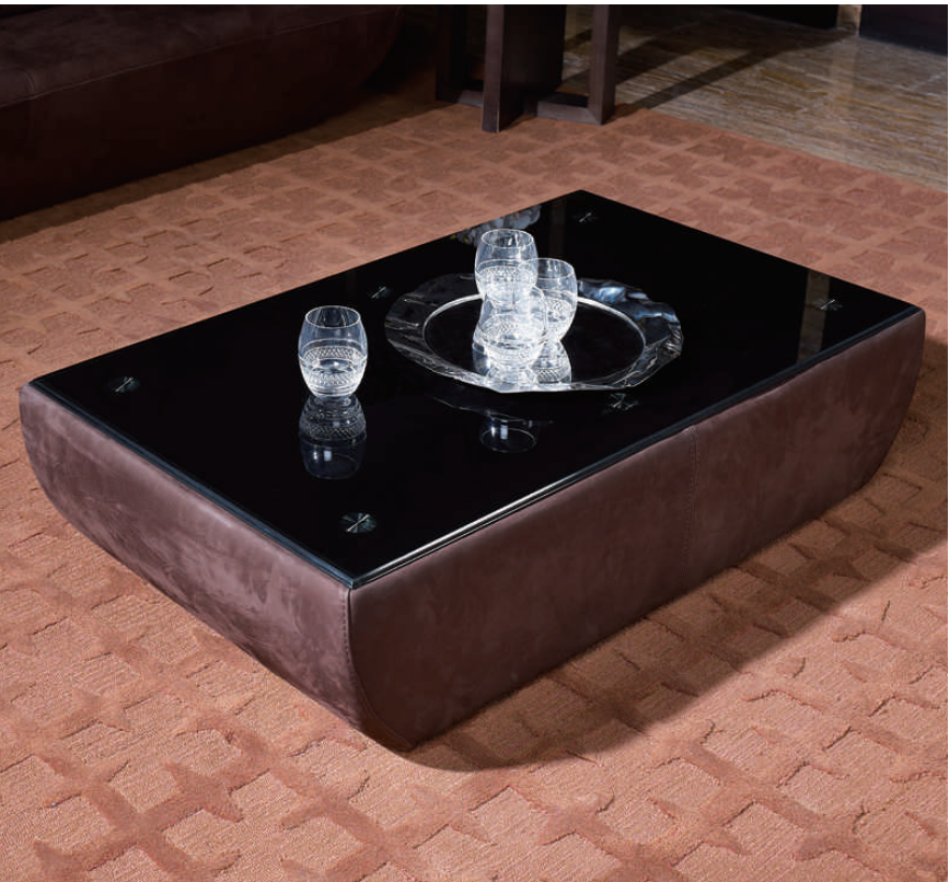
Optional matching coffee table (STG3B) comes with tampered glass in either black or white color.