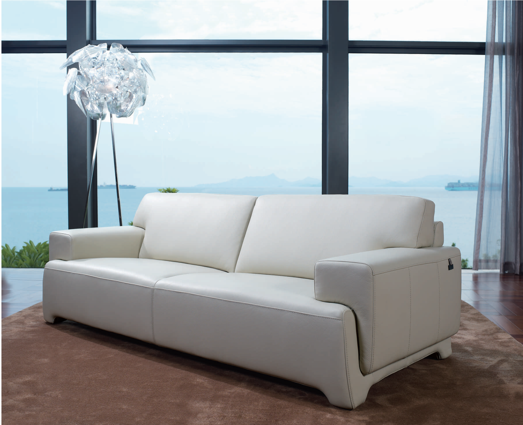
Model PONTE I (no. 0319) is the version of the PONTE family which has a cleaner design on the sofa arm. It's particular good to be made with ultra thick leather (3mm) where the strong leather grains can be well focused.