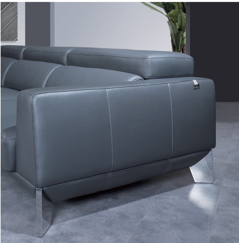
Besides the stainless steel legs, there is also an option of wooden legs which come with 6 choices of stained color (see page 4).