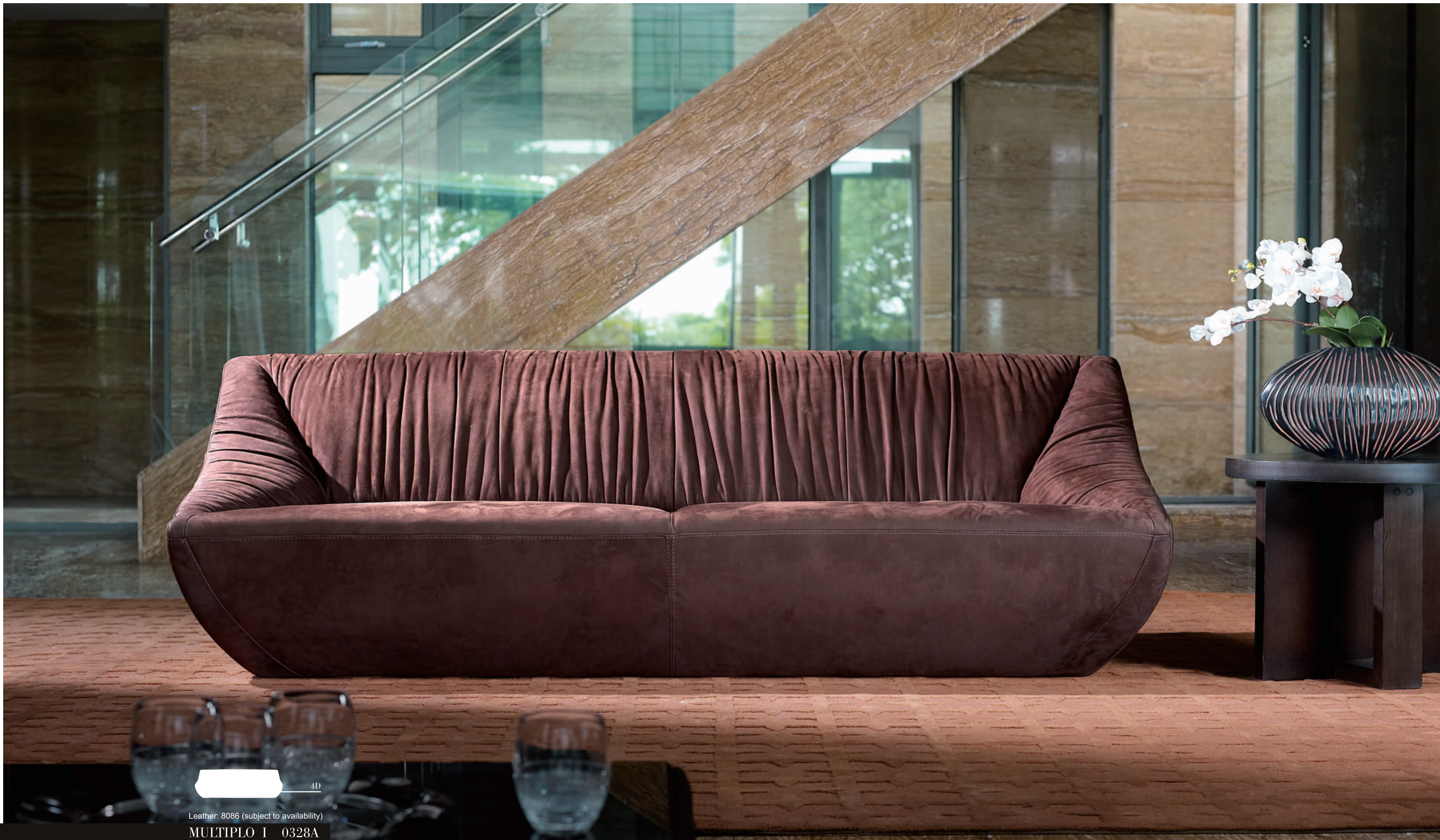
4D Leather: 8086 (subject to availability) MULTIPLO I 0328A