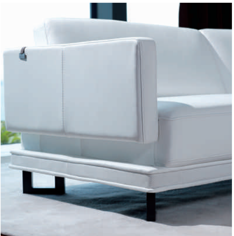
There are 3 different leather crafting effects to accessorize the sofa base frame. Perforation Effect is certainly a choice for homes which are decorated with modern design elements.