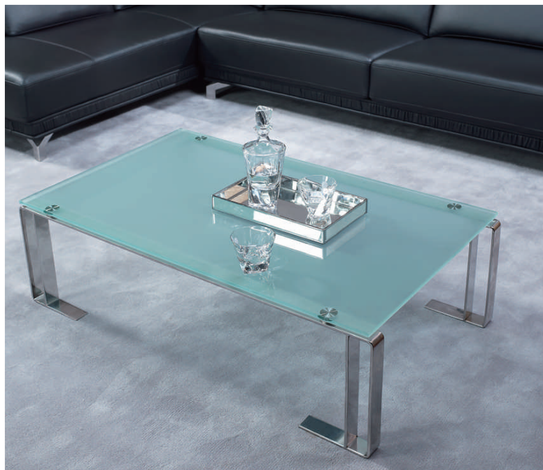
Optional coffee table (MTG3) has stainless steel frames and tempered glass that well match the stainless steel leg of Model TRIPLO III (no. M0327)