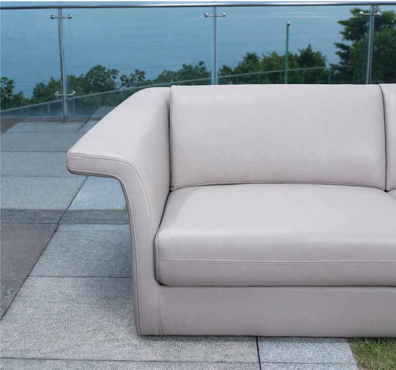
The special shape & form of the sofa arm and its extension to the sofa seat frame is inspired by the elegance of a swan.