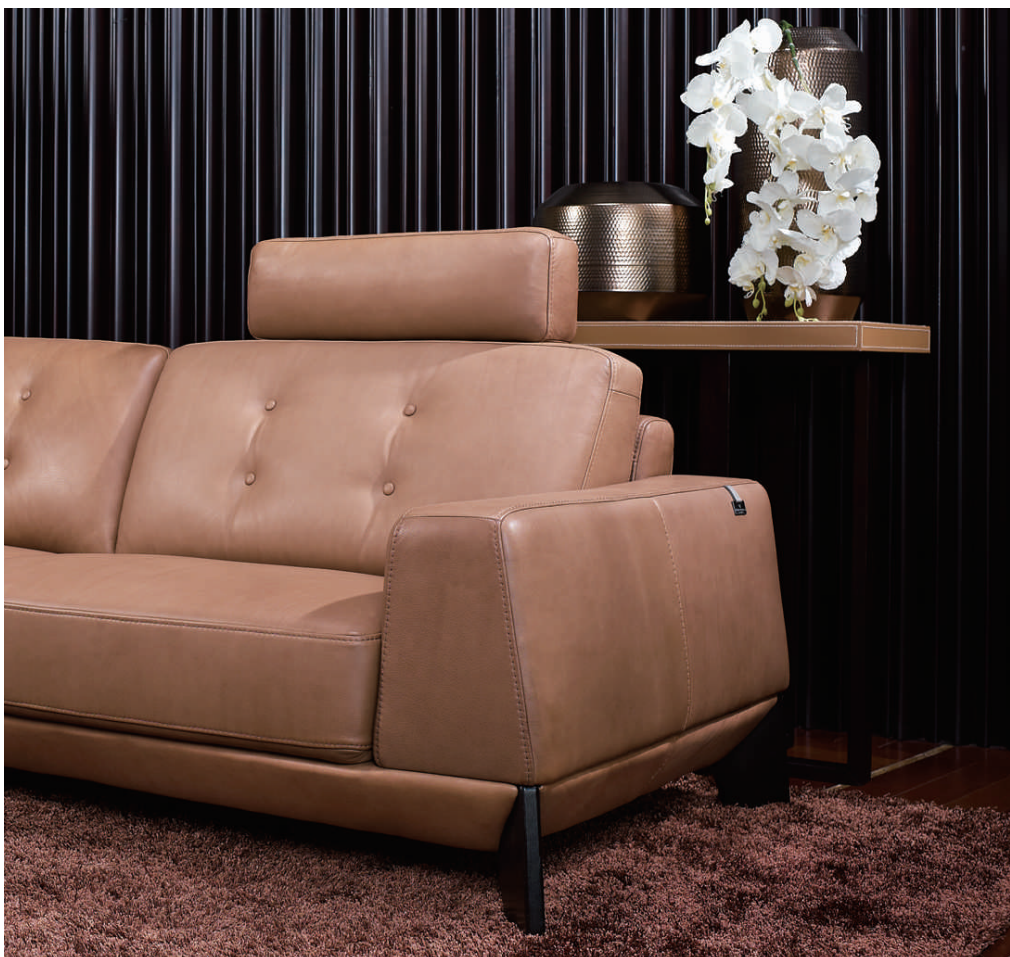
Optional headrest (HR4) offers extra neck support.