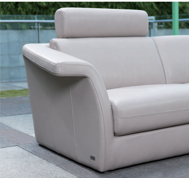
Optional headrest (HR4) offers extra neck support.