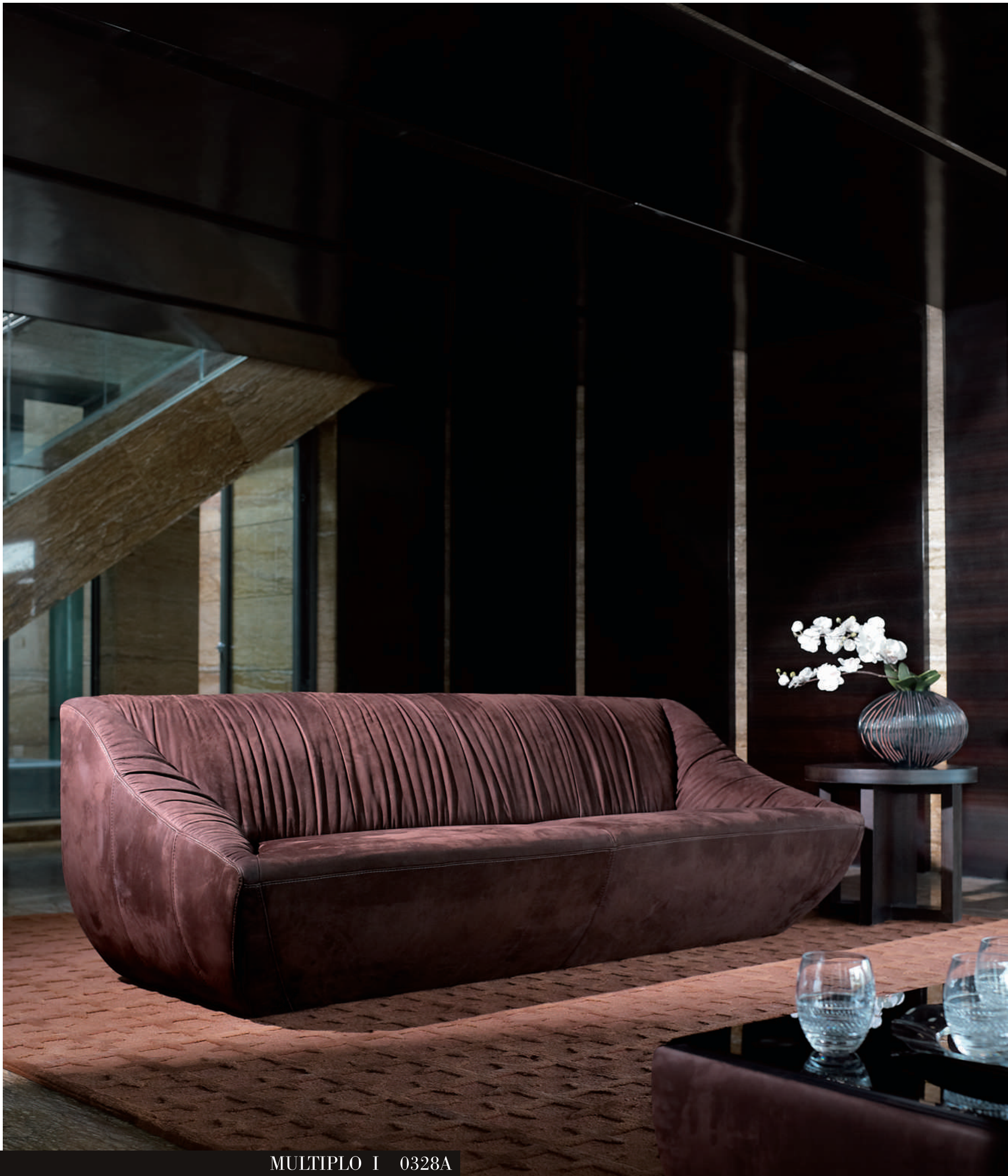
MULTIPLO I 0328A