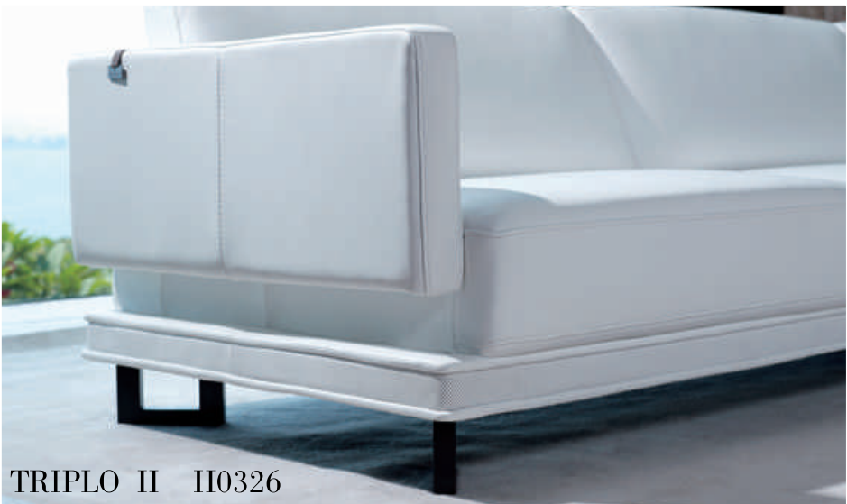
TRIPLO II H0326

There are 3 different designs and materials of legs to choose from. The U-shape wooden leg goes well with transitional home interior design.