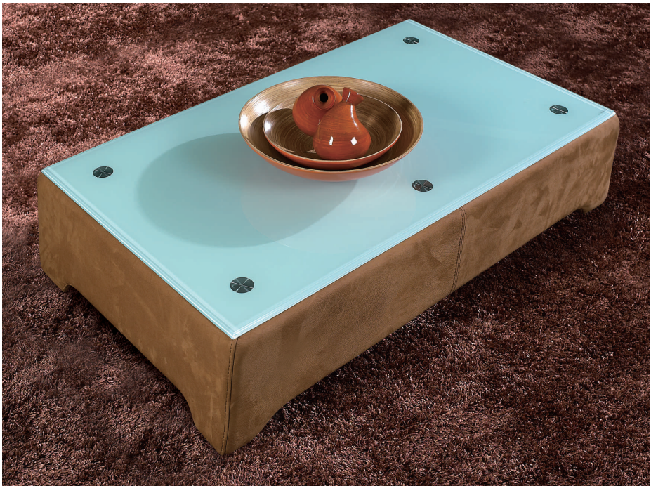
Optional matching coffee table (STG3W) comes with tempered glass in either black or white color.