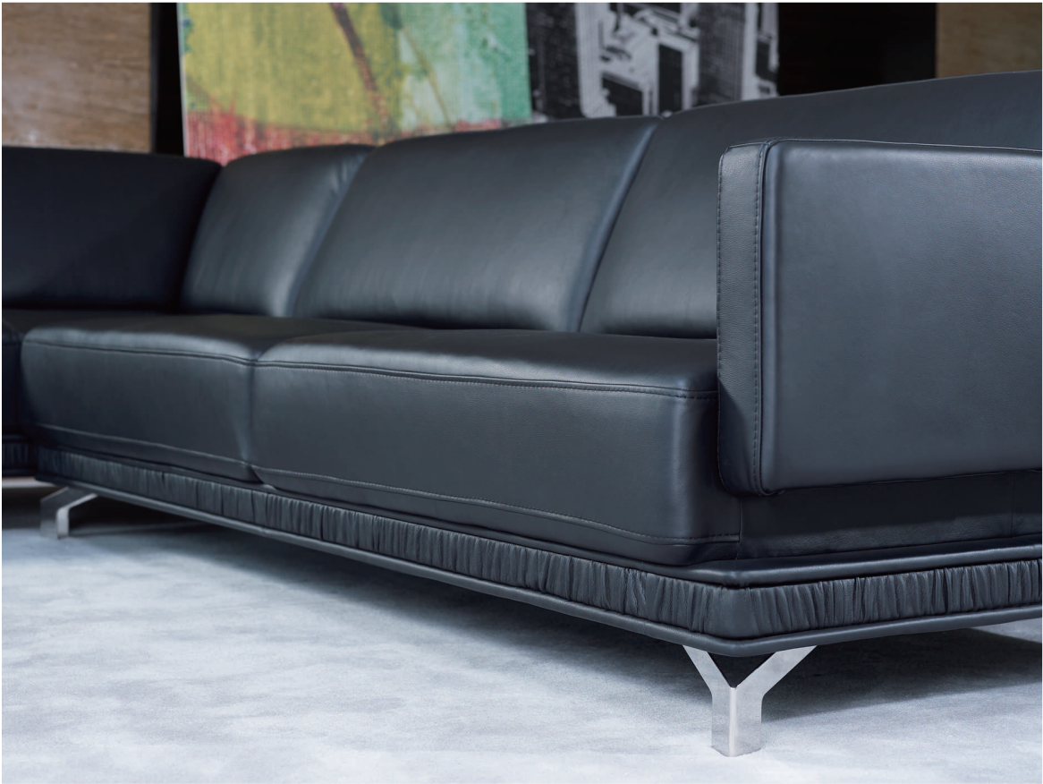
There are 3 different leather crafting effects to accessorize the sofa base frame. Leather-folding Effect on the sofa base frame is meant for those who love fine details.