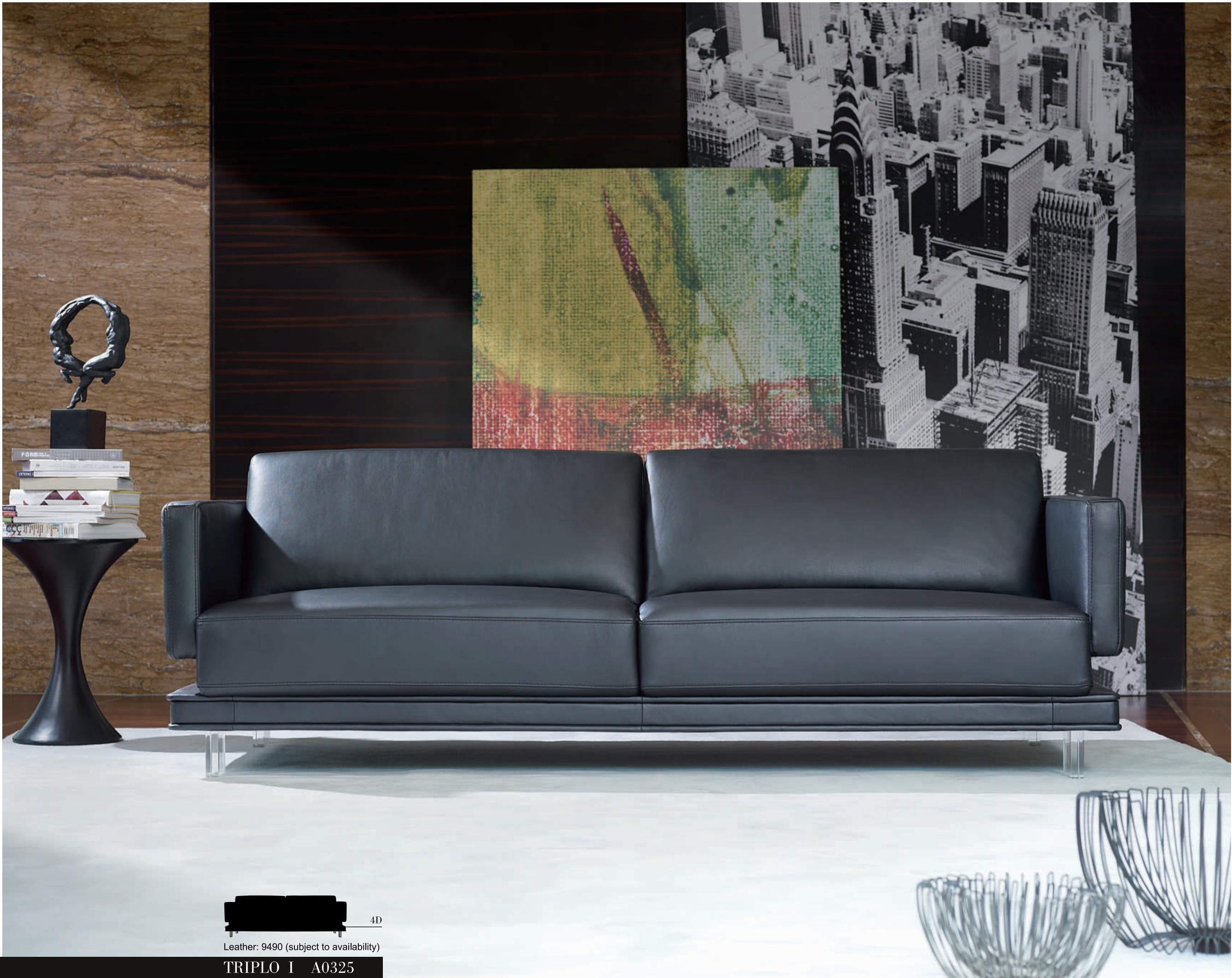
4D Leather: 9490 (subject to availability) TRIPLO I A0325