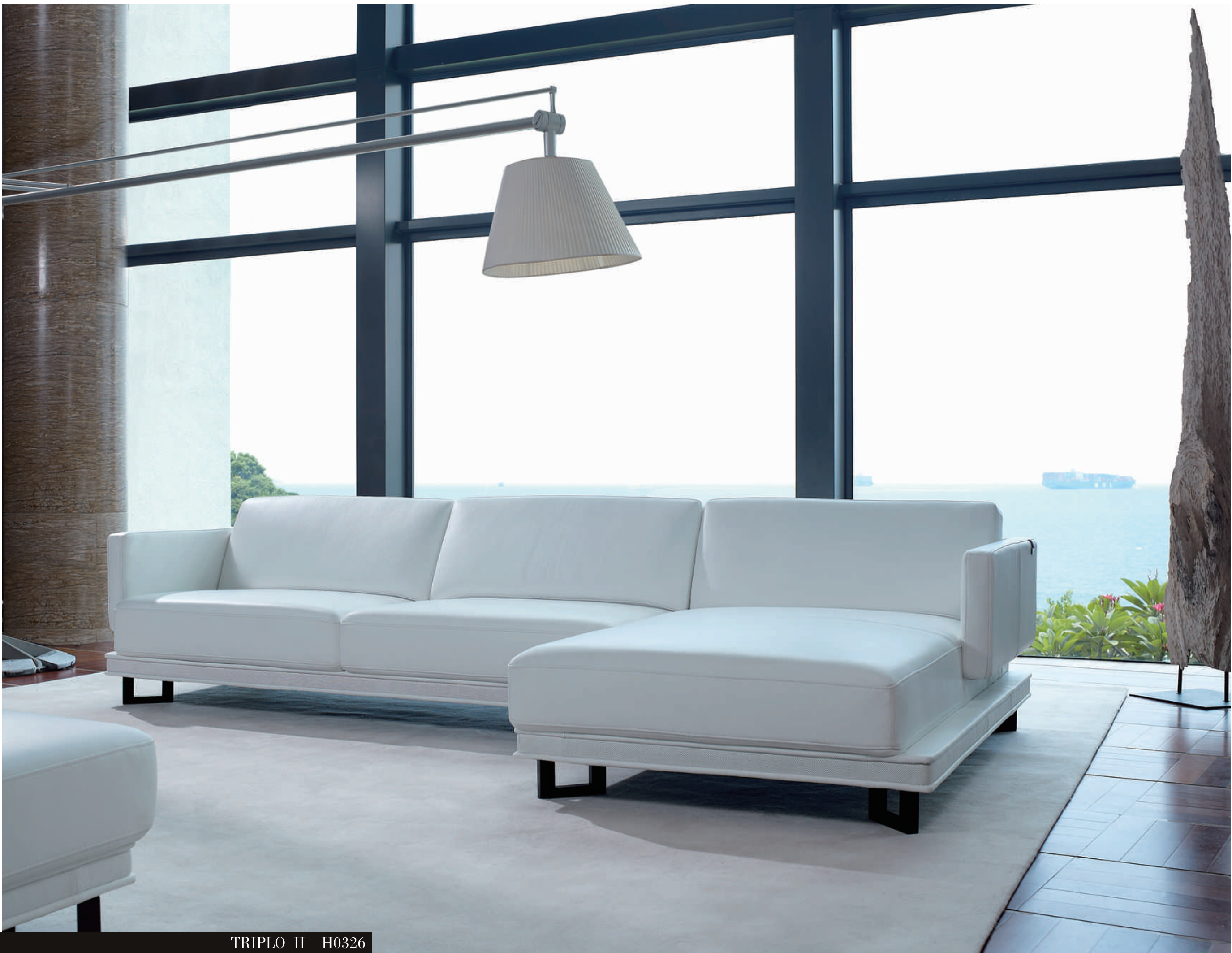
TRIPLO II H0326

The multi-level design concept of Model TRIPLO reveals the aesthetics of modern shapes and forms.