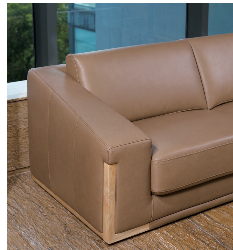
Model SCIVOLO I (no. 0317) has a particularly designed sofa arm with inclination from the top and beveling backward from the arm front. In addition, the special placement of solid wood trims along the edges of each sofa arm comes with natural wood color. The other 6 standard optional stained wood colors are also available.