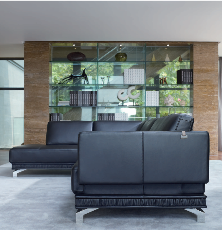
The Y-shape stainless steel leg well matches modern home interior settings.