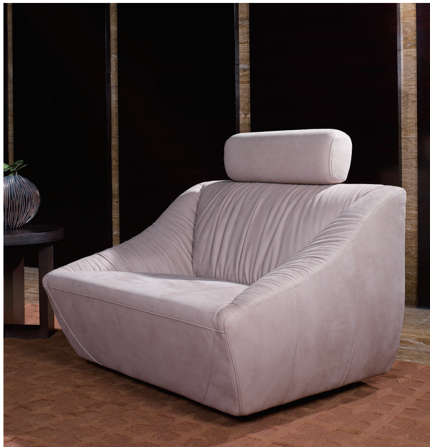
A stationary matching armchair (1D) is available.