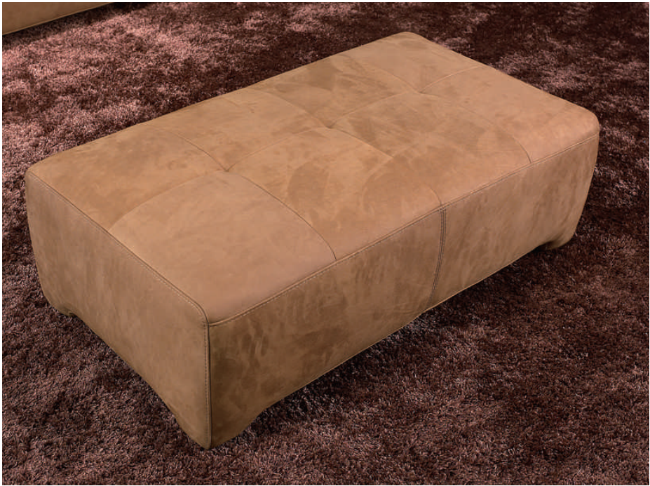
Optional stool (ST2) comes with the base frame design that matches perfectly with the sofa.