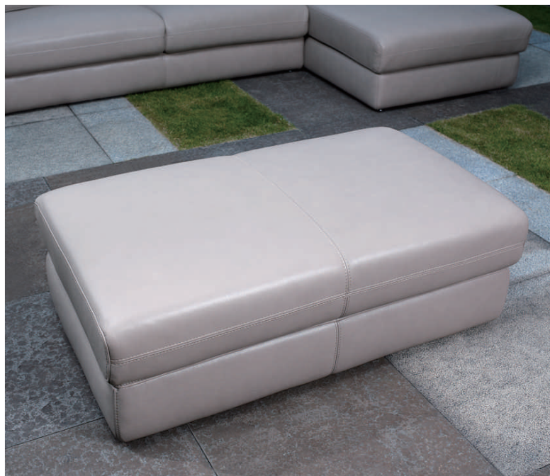
Optional stool (ST2) comes with the base frame design that matches perfectly with the sofa.