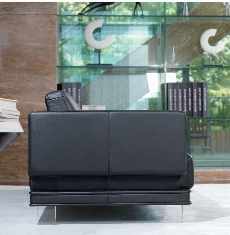
The choice of a minimalist acrylic leg creates an illusion as if Model TRIPLO were floating in the air.