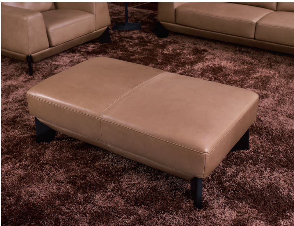
Optional stool (ST2) comes with legs and base frame design matches perfectly with the sofa.