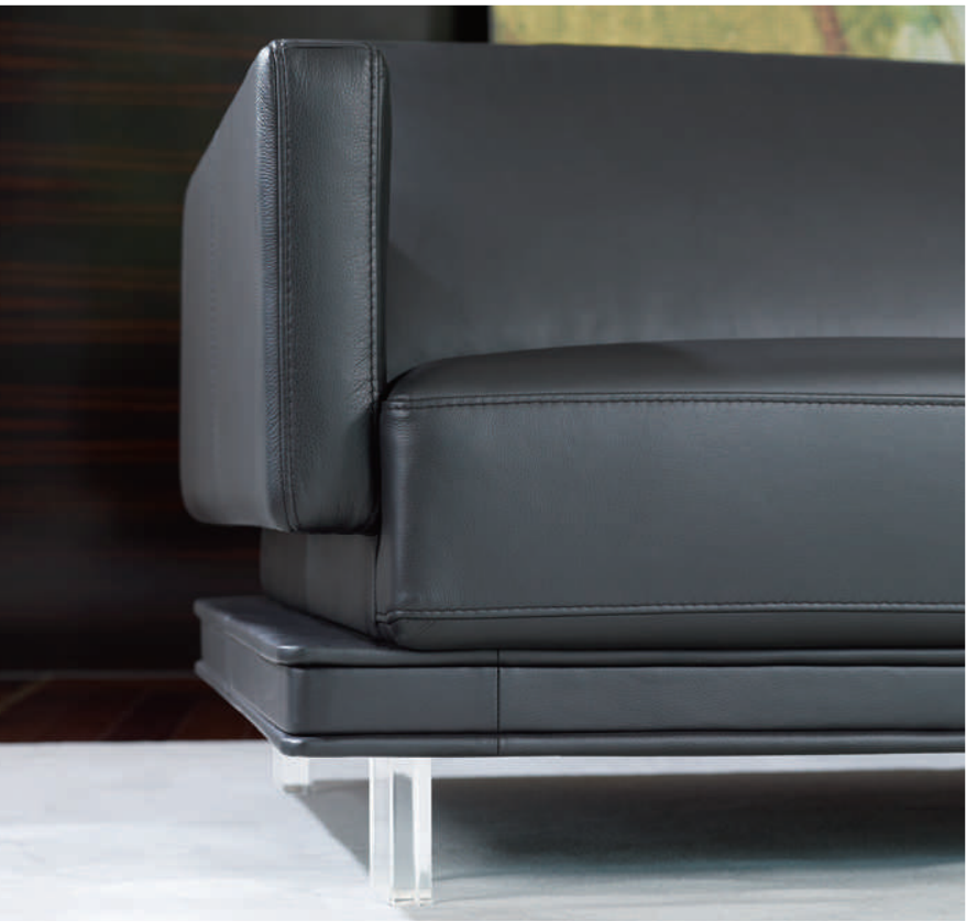
The multi-level design concept of Model TRIPLO reveals the aesthetics of modern shapes and forms.