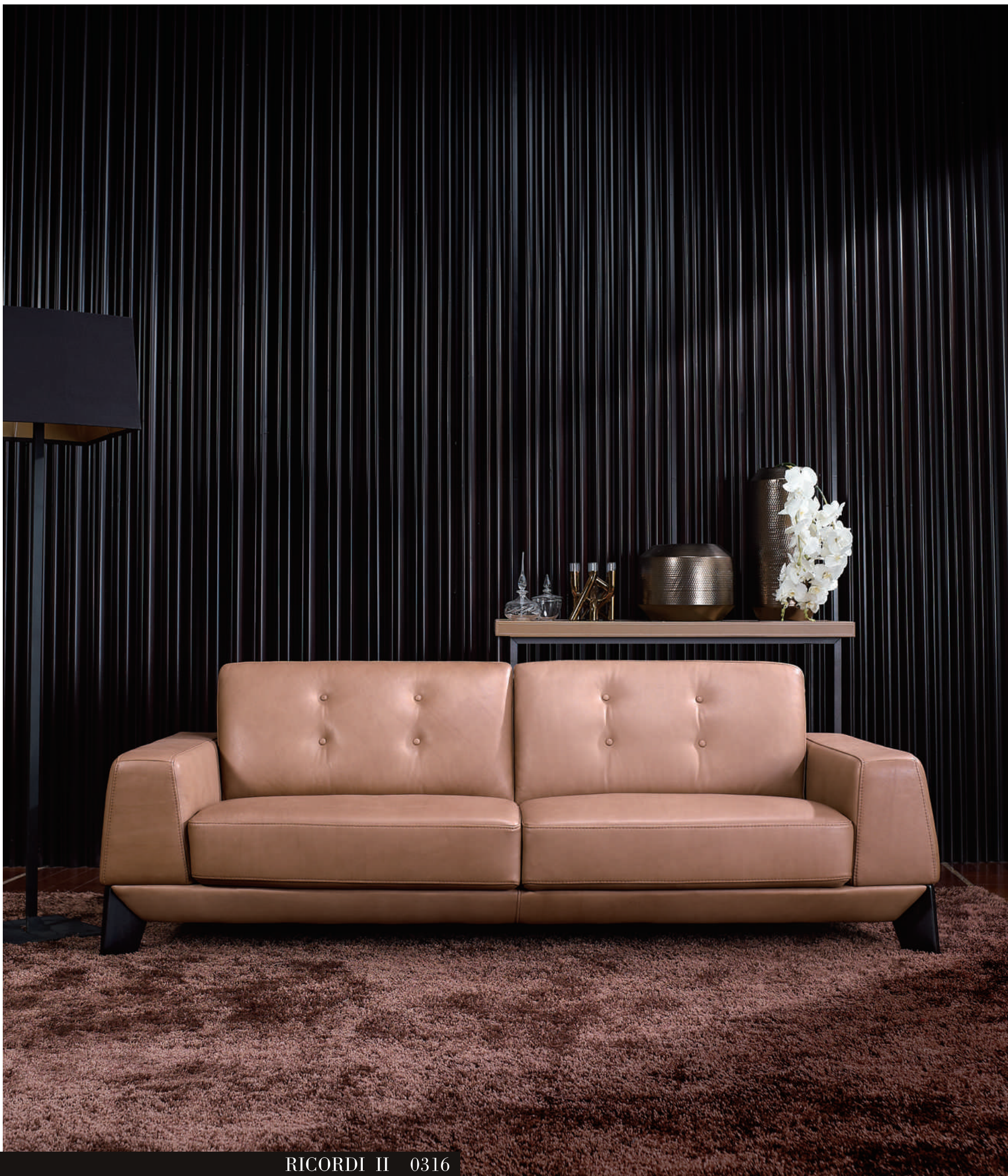
RICORDI II 0316