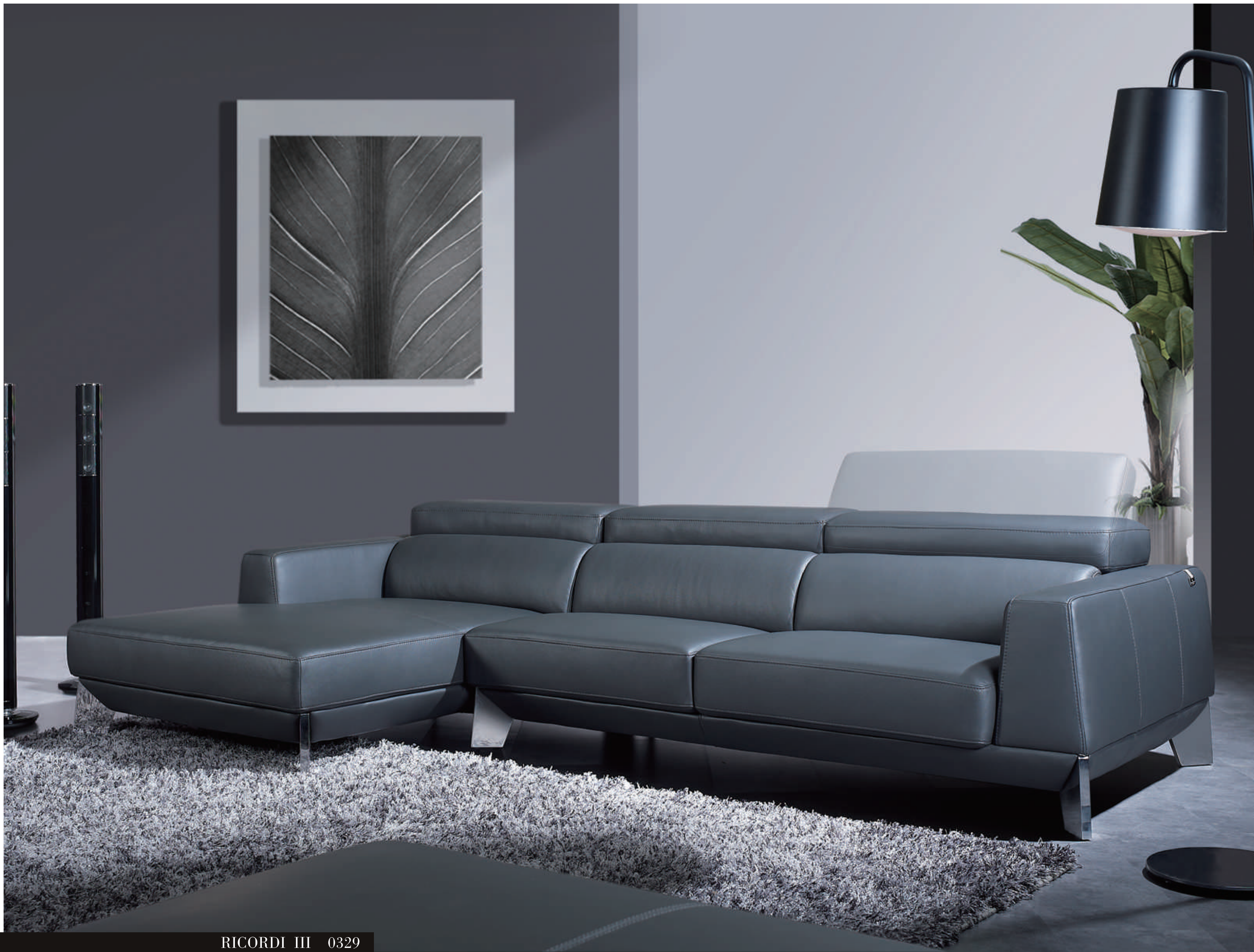
RICORDI III 0329