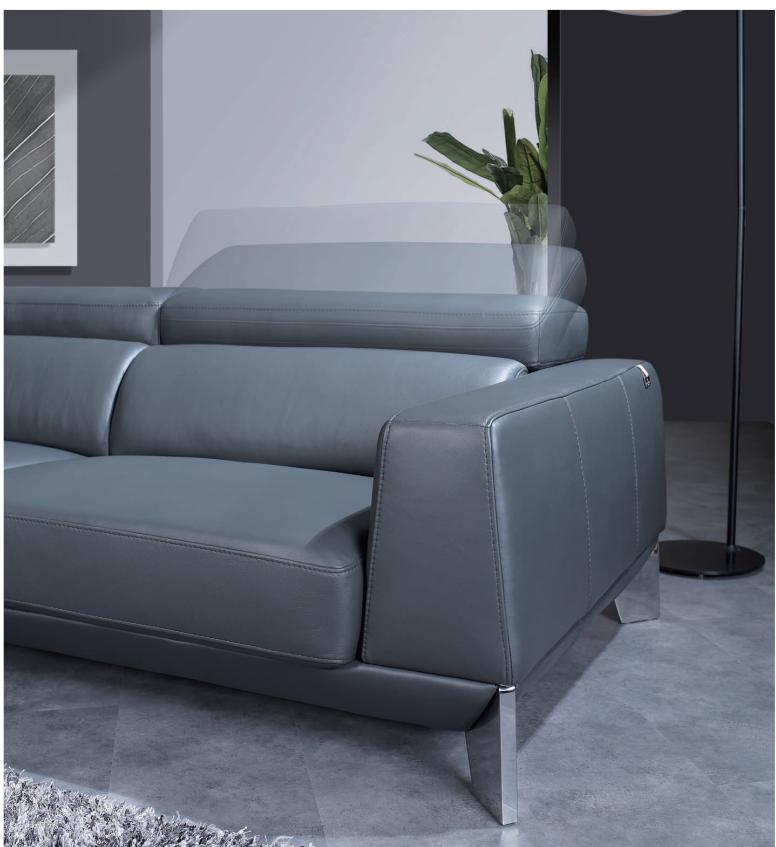
Model RICORDI III (no. 0329) is a functional version of the RICORDI family. It comes with head mechanisms which are made in Germany by Hettich International. The mechanisms have more than 10 locking positions which cater to different preferences of back comfort.