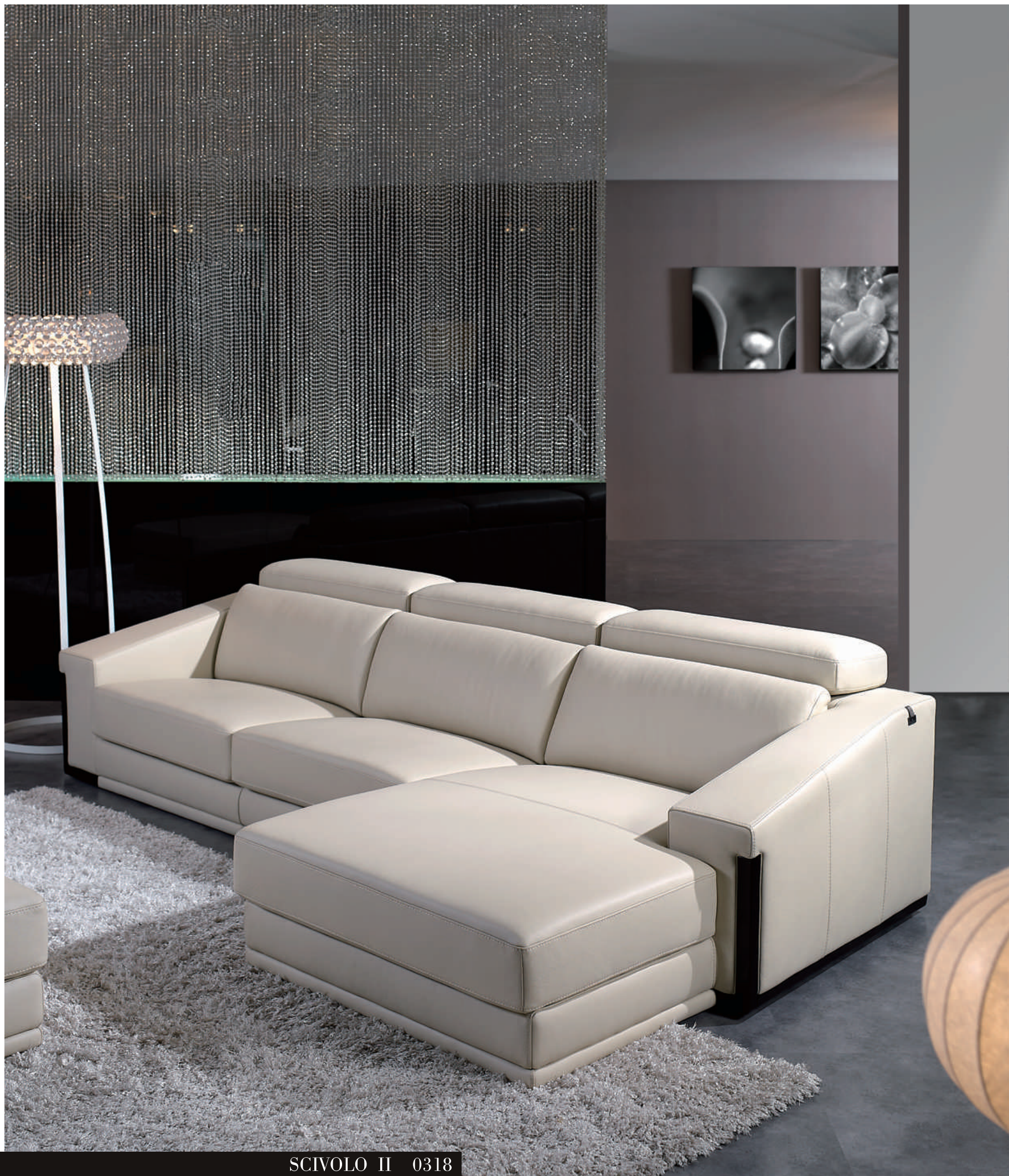
SCIVOLO II 0318

Model SCIVOLO II (no. 0318) has a particularly designed sofa arm with inclination from the top and beveling backward from the arm front. In addition, the special placement of solid wood trims along the edges of each sofa arm comes with natural wood color. The other 6 standard optional stained wood colors are also available. Model SCIVOLO II (no. 0318) has a functional feature of head mechanisms which are made in Germany by Hettich International. The mechanisms have more than 10 locking positions which cater to different preferences of back comfort.