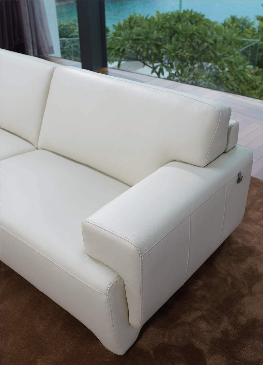
If the tufted square pattern is preferred on this model, there is a version named PONTE II (no. 0320) as an option.