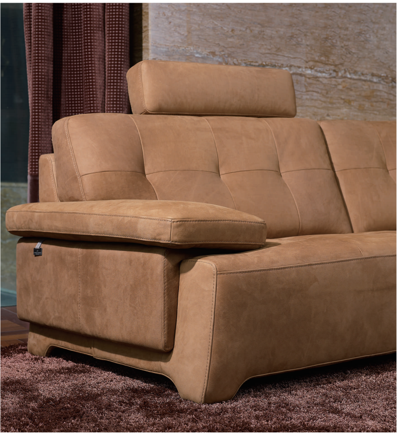
PONTE IV (no. 0322) is a model where layering design of the sofa arm is the focal point. The inclined sofa legs are the smooth extension of the sofa seat frame. The design is simple and special.