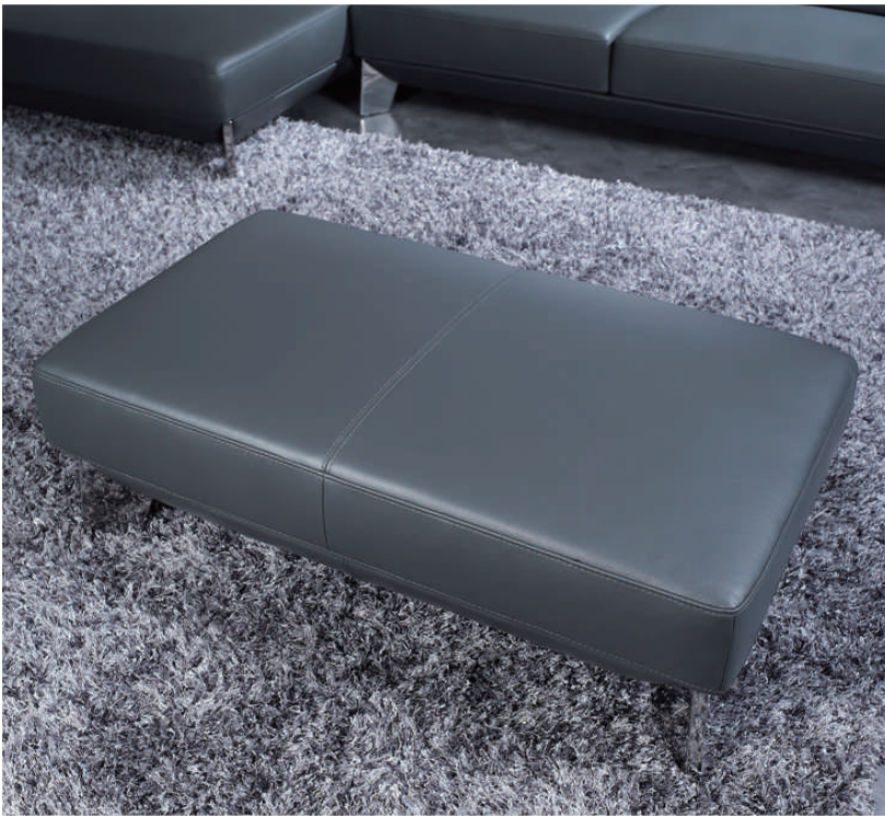
Optional stool (ST2) comes with legs and base frame design matches perfectly with the sofa.