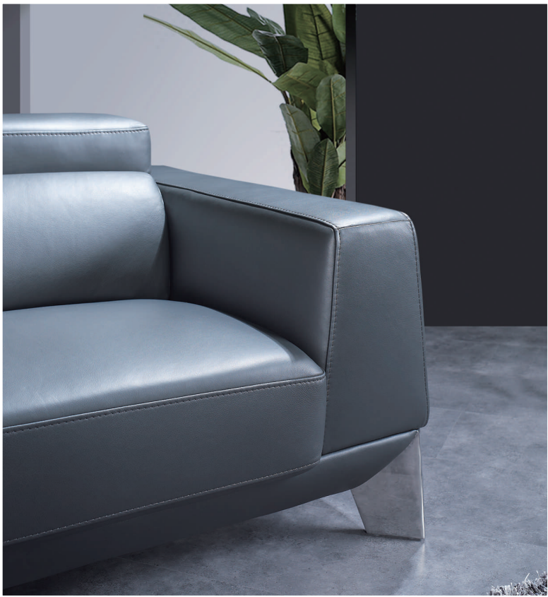
The design of Model RICORDI expresses the aesthetics of bevel edges. The sofa arm and seat base frames are beautifully scaled with the slope of good balance. The 45 degree angle position where the stainless steel legs are fixed well corresponds to the bevel concept of Model RICORDI.