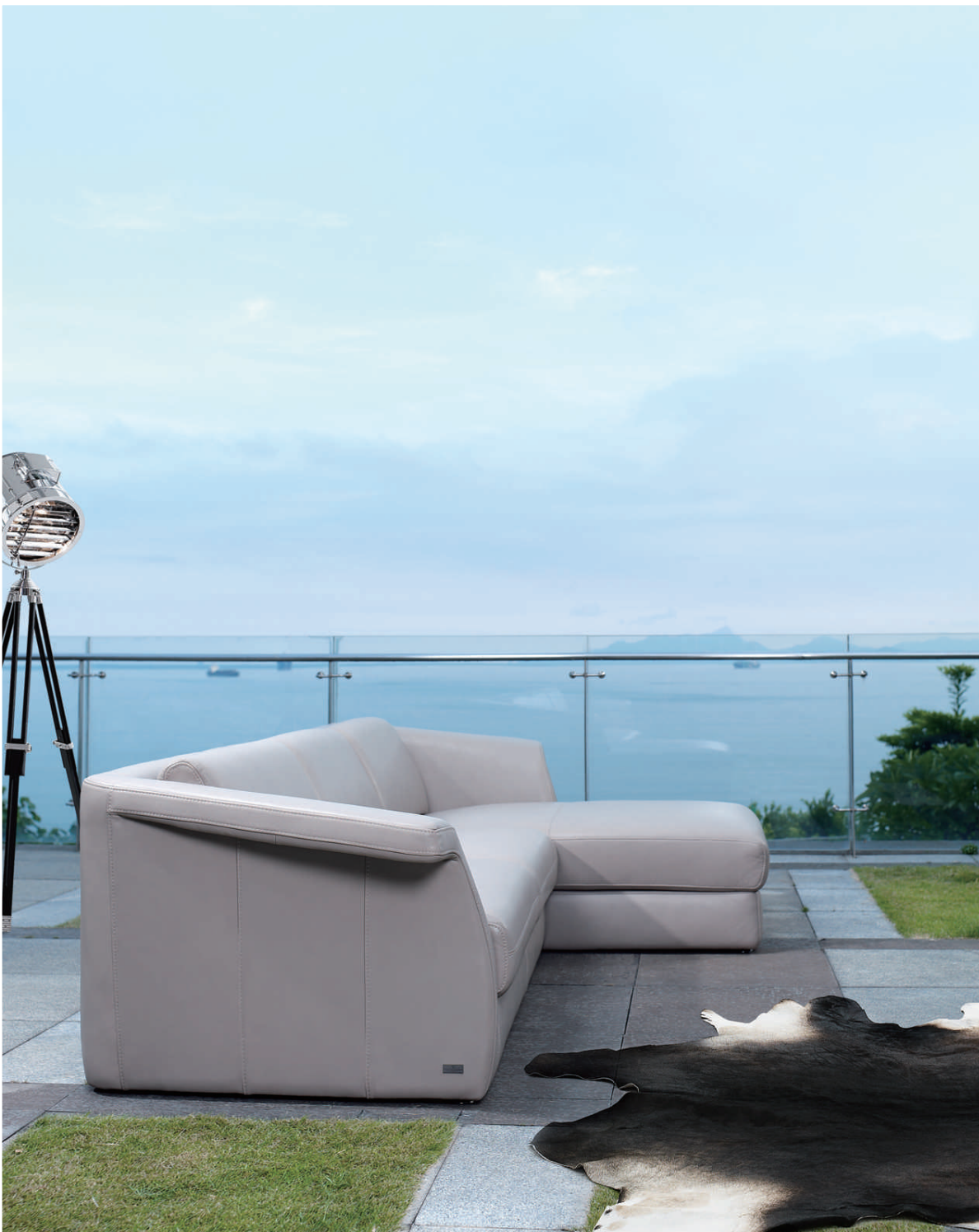
The curve & round design concept of Model OCA can be appreciated from various viewing angles.