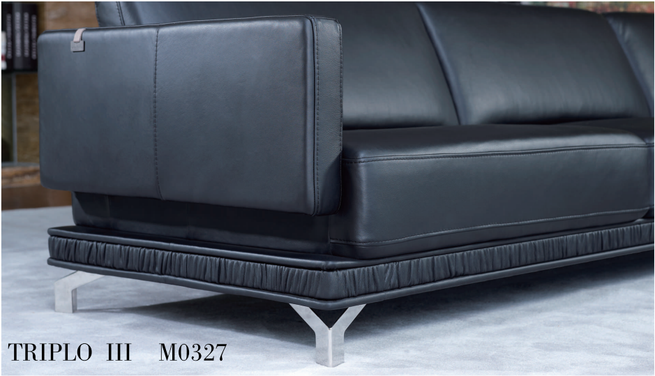
TRIPLO III M0327

There are also 3 different leather crafting effects to accessorize the sofa base frame. Perforation Effect is certainly a choice for homes which are decorated with modern design elements.