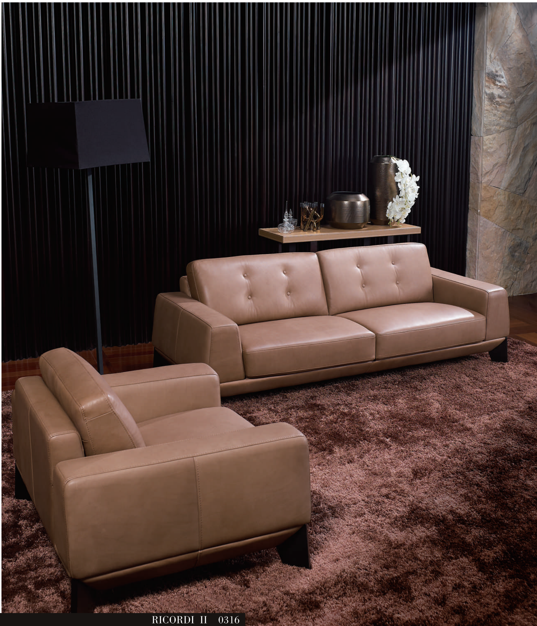
RICORDI II 0316