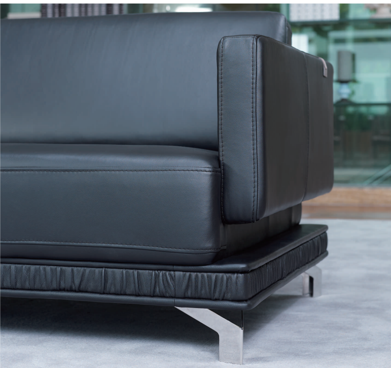
The multi-level design concept of Model TRIPLO reveals the aesthetics of modern conformation.