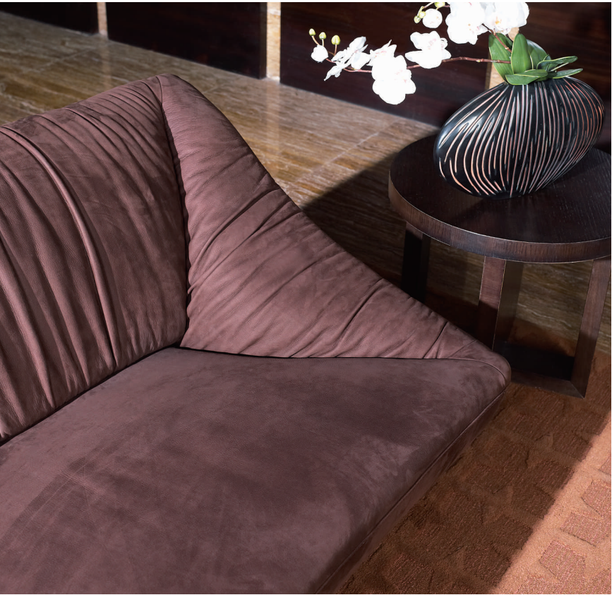
The aesthetics of leather crafting details is always the signature element of KELVIN GIORMANI sofa design. The folding effect on Model MULTIPLO truly reveals the art of leather craftsmanship.