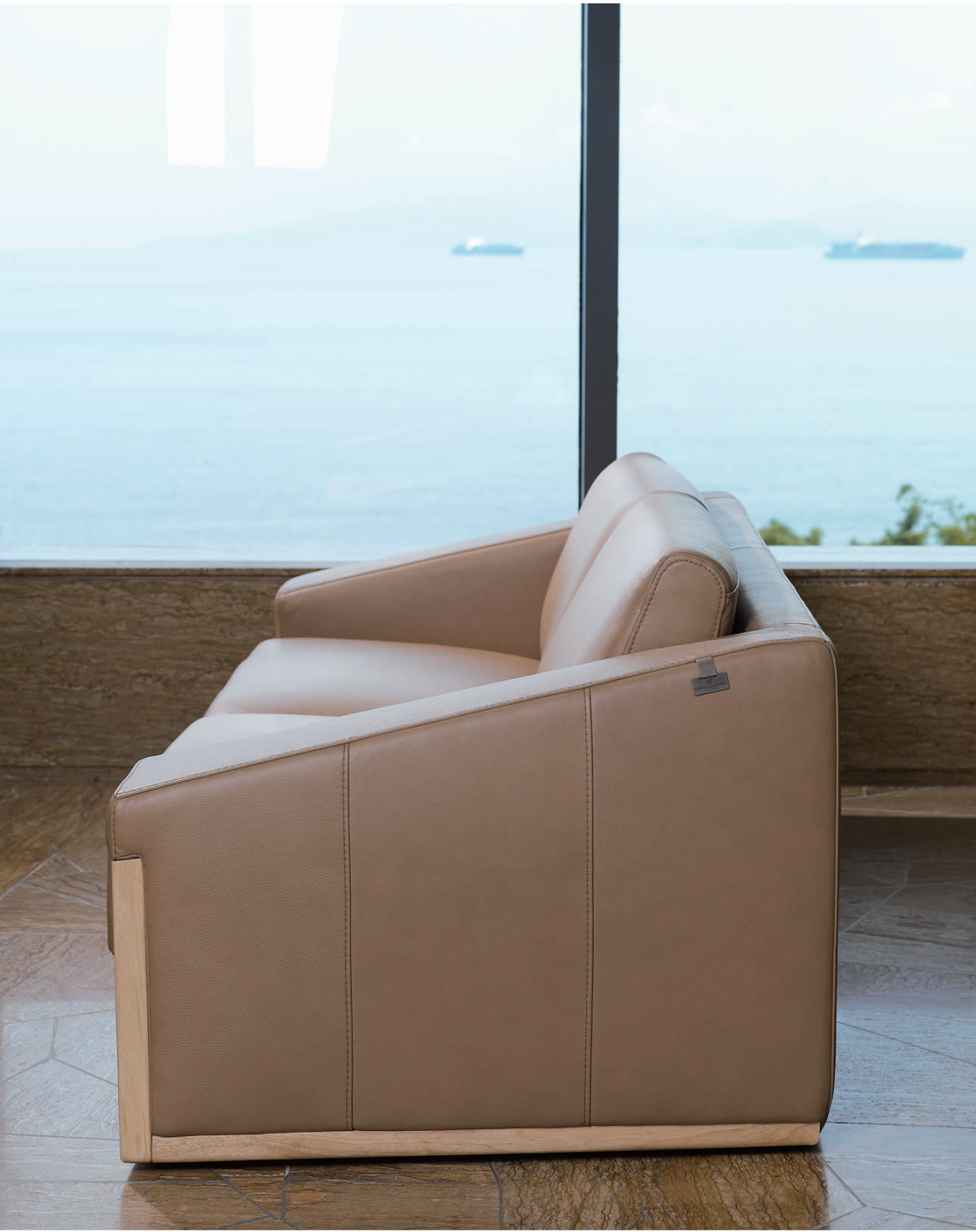
Model SCIVOLO I (no. 0317) is the minimalist version of the SCIVOLO family. It has simple back cushions whose core is primarily made with polyurethane foams that offer good support for your back.