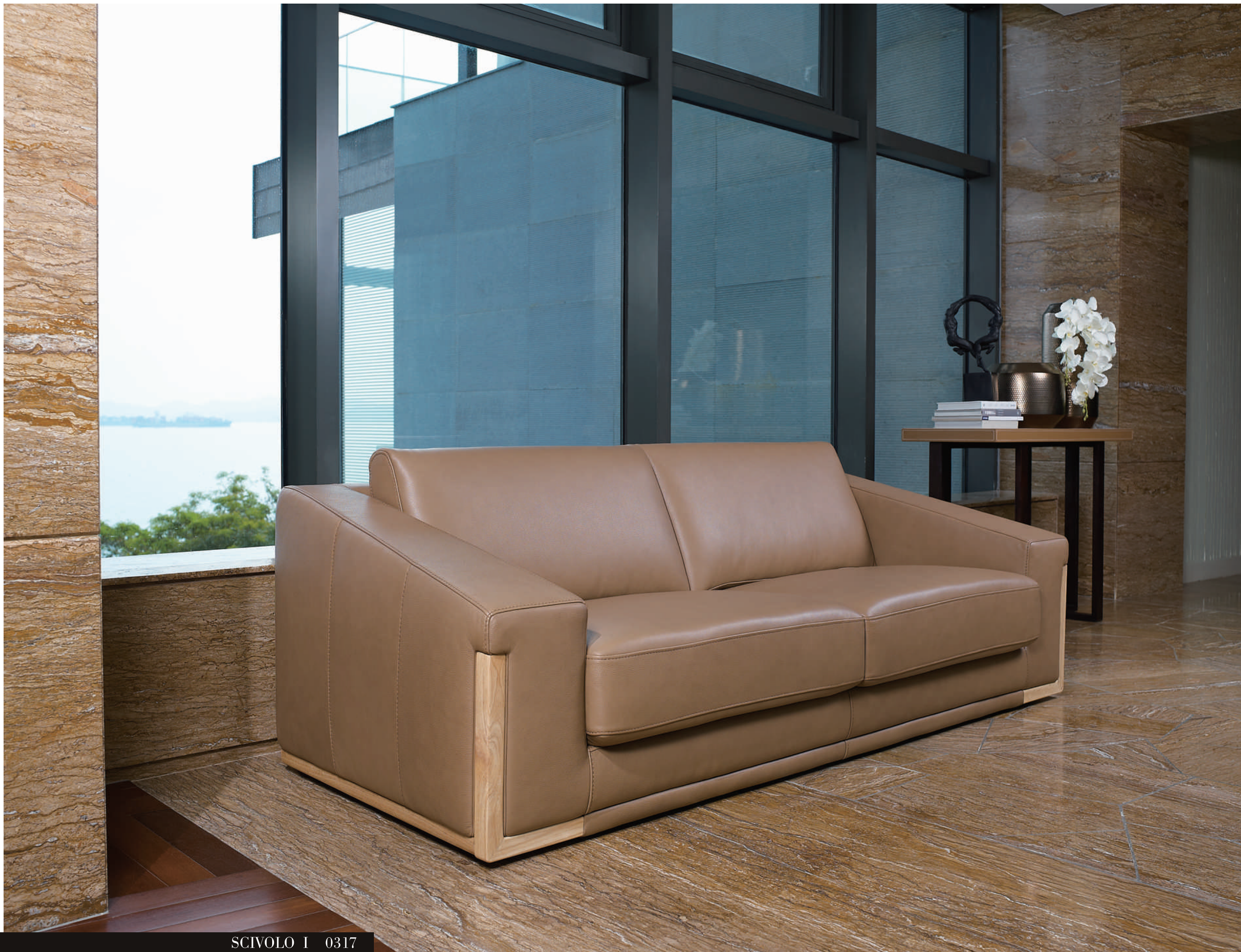
SCIVOLO I 0317