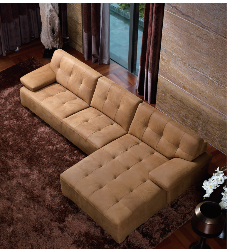
Model PONTE IV (no. 0322) is the version of the PONTE family which comes with the tufted square pattern on sofa seats. For those who prefer the version without the tufted square pattern, Model PONTE III (no. 0321) is the perfect choice.