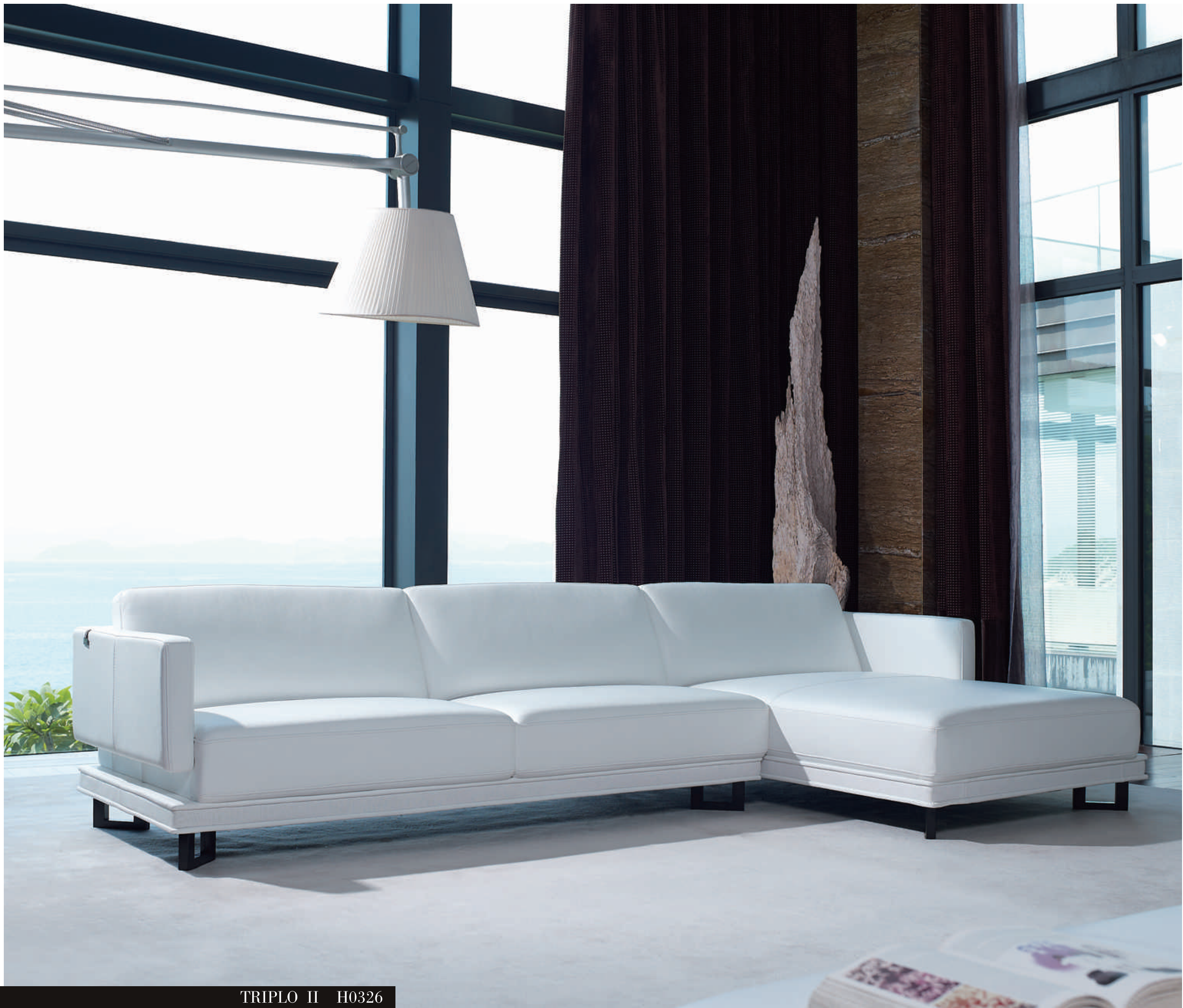
TRIPLO II H0326