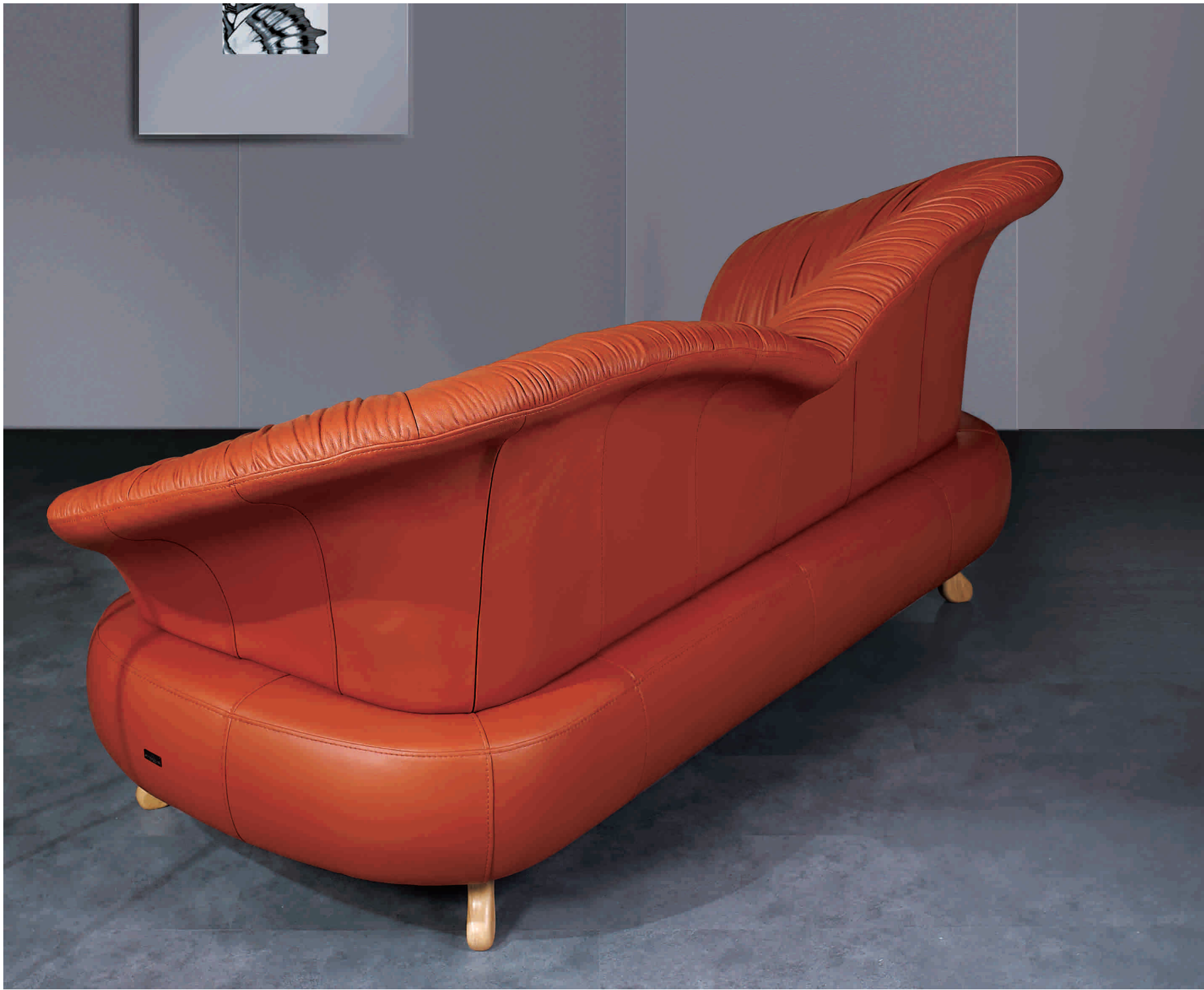
The design of Model FARFALLA's back was so carefully conceived which stimulates people's imagination that the FARFALLA is "flying".