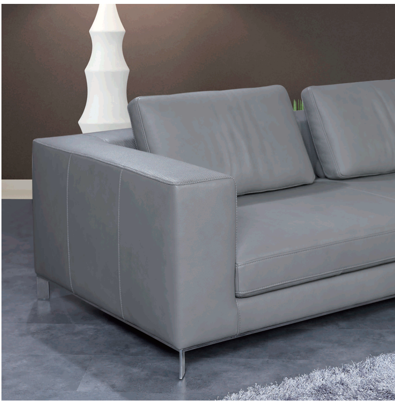
One of the design highlights of Model LIBERTA is the flat stainless steel frame that runs all the way around the sofa base.