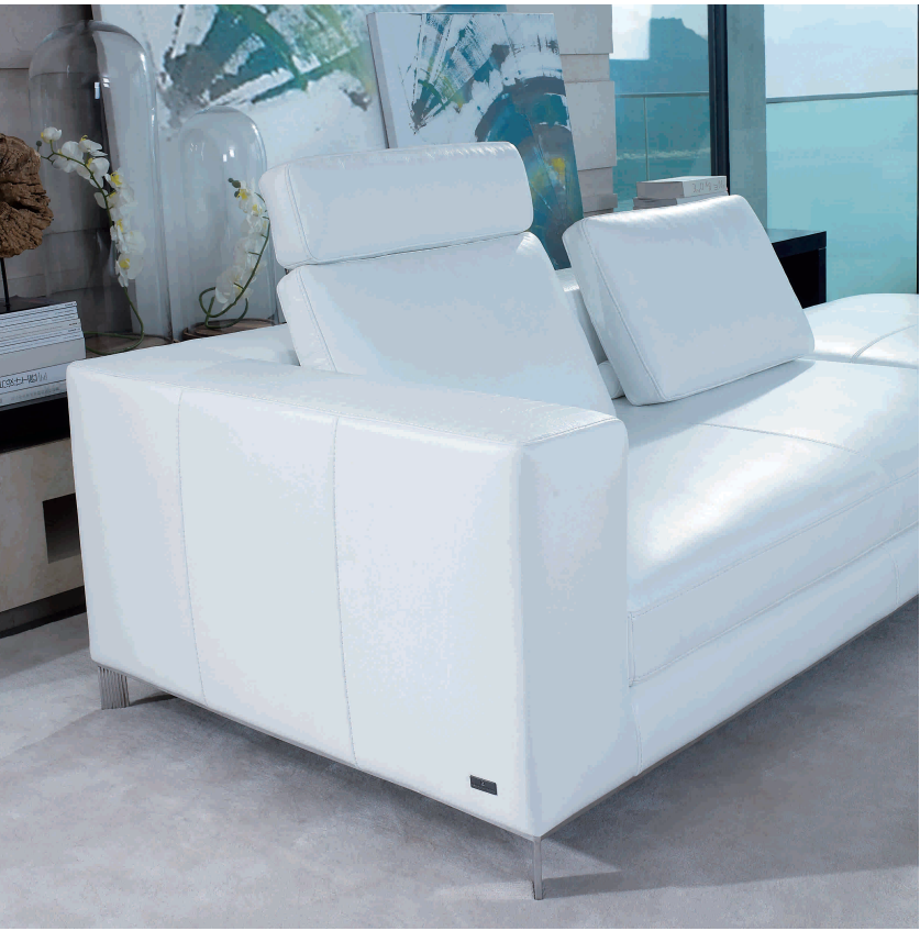
Optional headrest (HR4) is available for extra support on the head and neck.