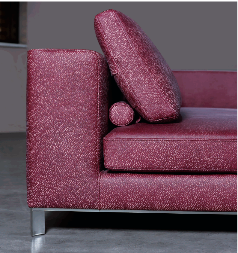
One of the design highlights of Model LIBERTA is the flat stainless steel frame that runs all the way around the sofa base.

Model LIBERTA is generally a minimalistic and timeless model that can well match with any modern contemporary living room interior setting. For each individual item of Model LIBERTA, it was specially designed with each lateral or front side of the sofa being straight and flat (and fully finished with leather) that difficult items can be put together to become different composition sofa sets. This feature allows users to alter the configuration of a sofa set to be different from its original composition.