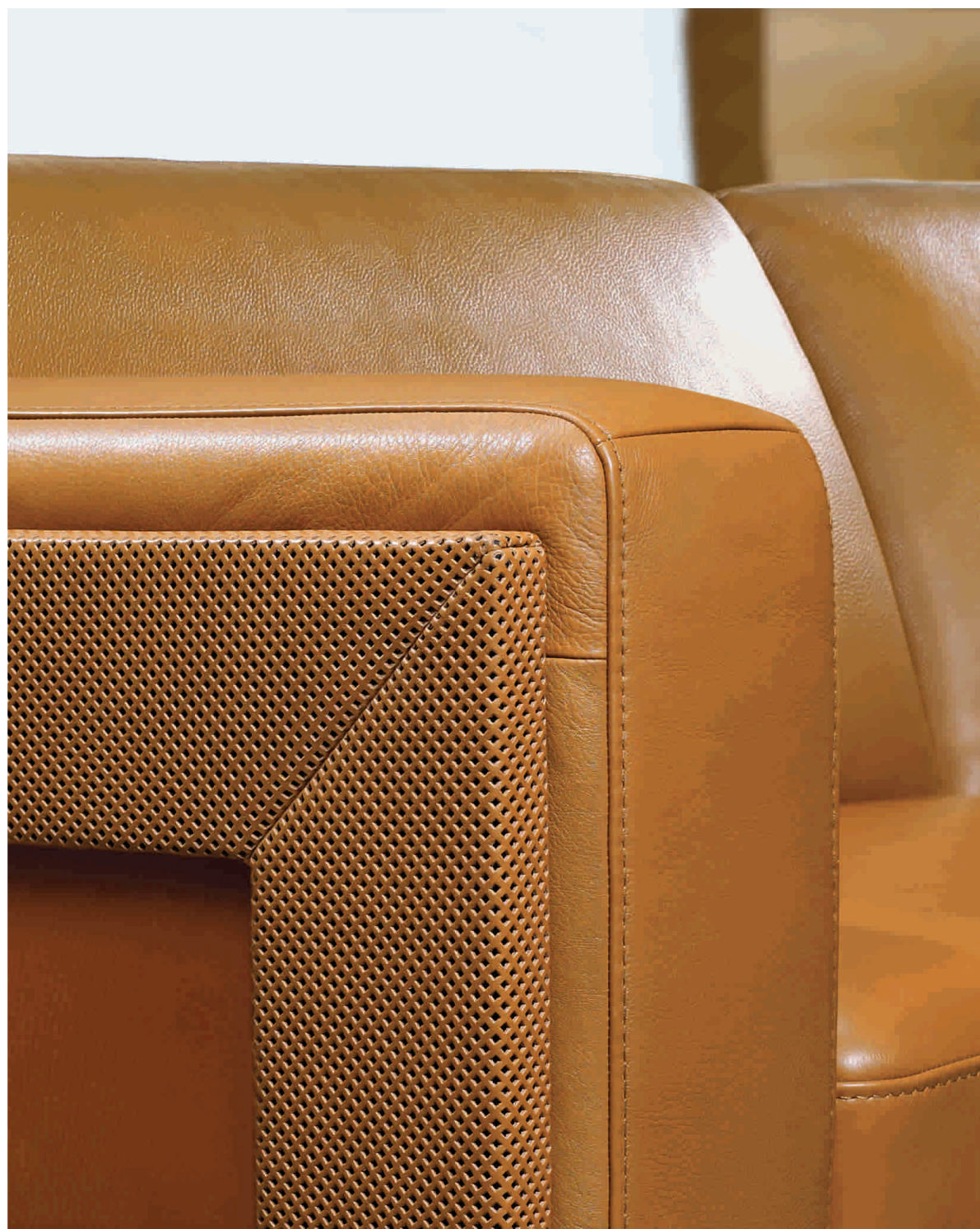
Mounting perforated (and soft) top grain leather on hardwood sofa exterior frames is a kind of meticulous leather crafting technique which can only be achieved by highly skilled hands.