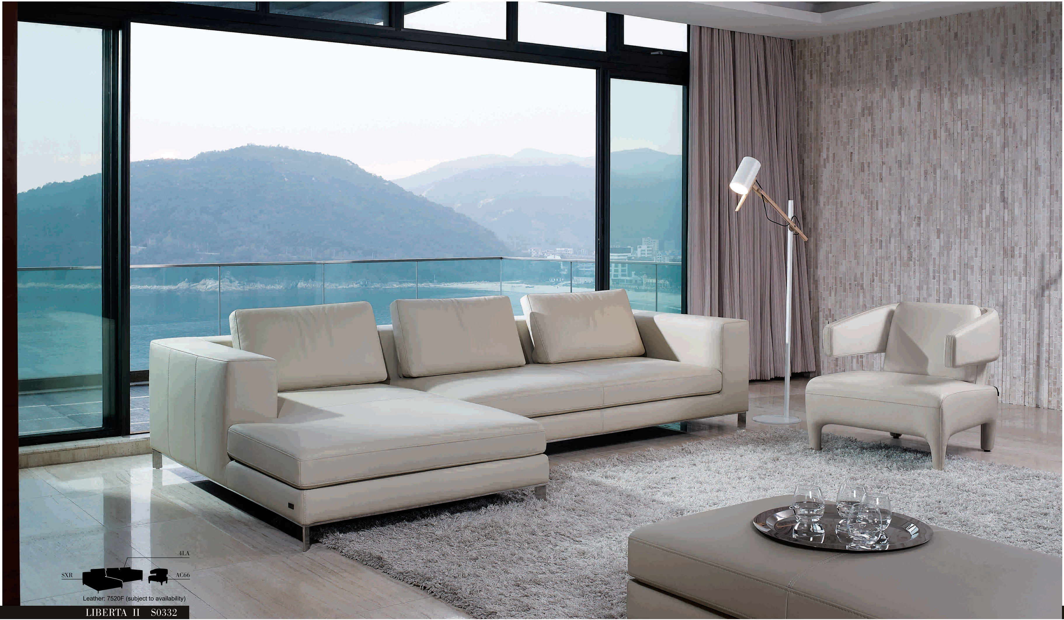
SXR 4LA AC66 Leather: 7520F (subject to availability)