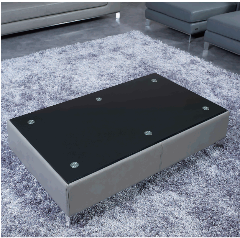
Optional leather upholstered coffee table with black tempered glass top (STG3B) is available with the matching stainless steel base frame and sofa legs.