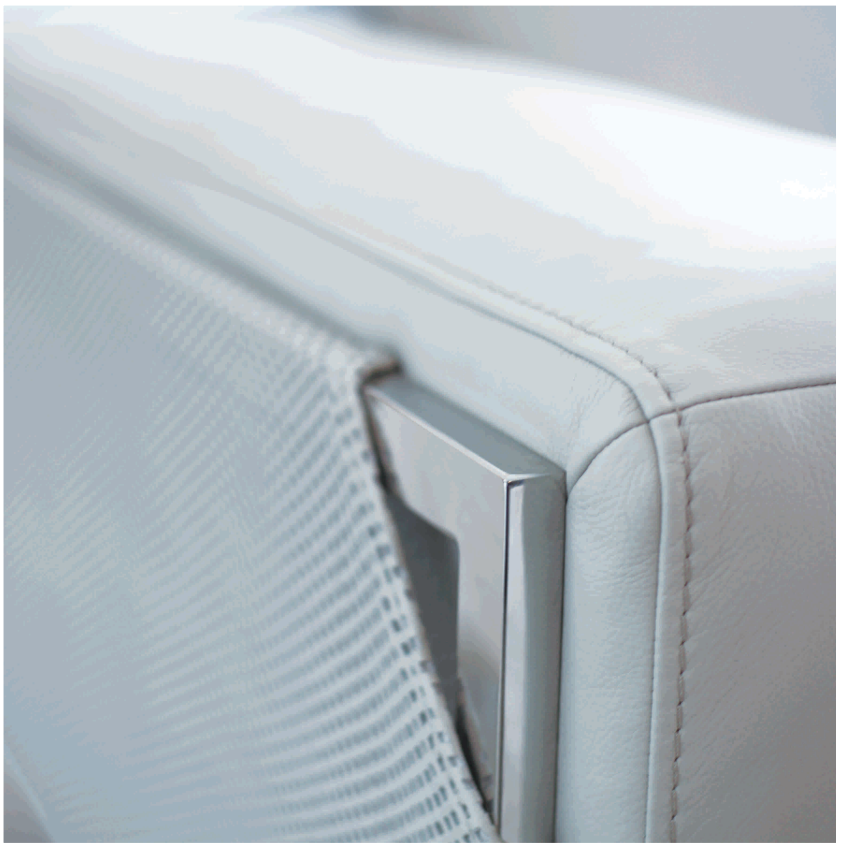
Each arm exterior of Model BRILLANTE II is decorated by a special stainless steel frame where a perforated leather piece is mounted.