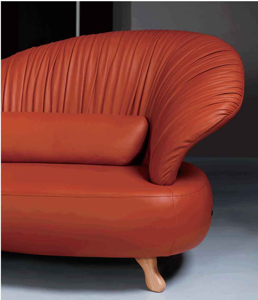
The designs of both legs are inspired by the shapes of some butterflies' lower wings.