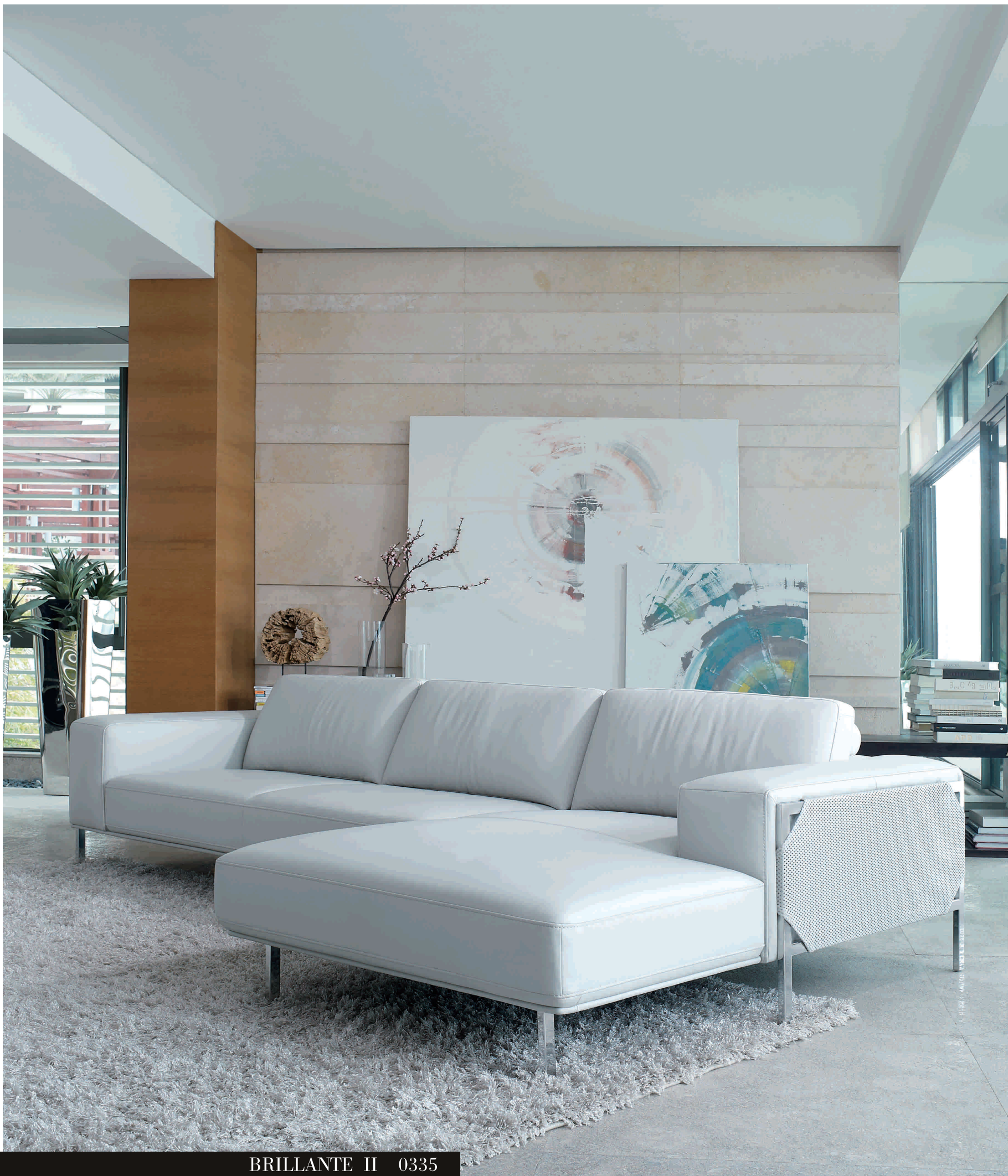
BRILLANTE II 0335