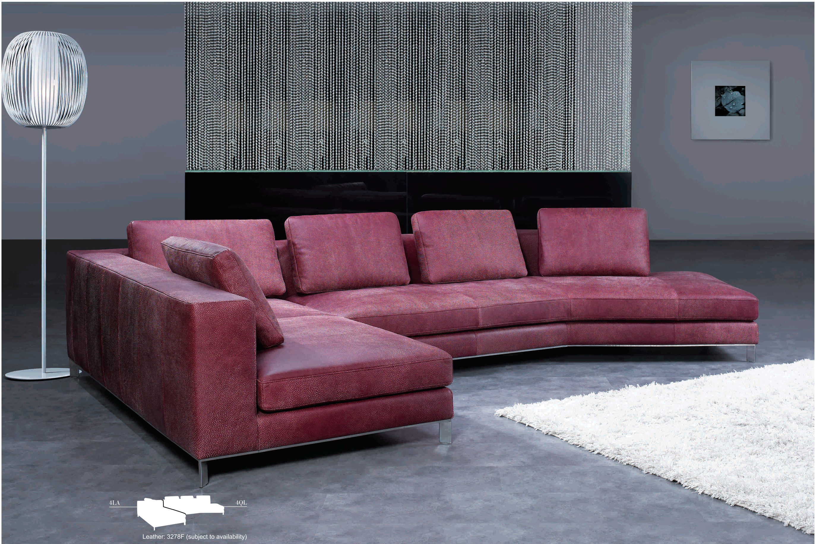
Leather: 3278F (subject to availability)

Model LIBERTA is generally a minimalistic and timeless model that can well match with any modern contemporary living room interior setting. For each individual item of Model LIBERTA, it was specially designed with each lateral or front side of the sofa being straight and flat (and fully finished with leather) that difficult items can be put together to become different composition sofa sets. This feature allows users to alter the configuration of a sofa set to be different from its original composition.