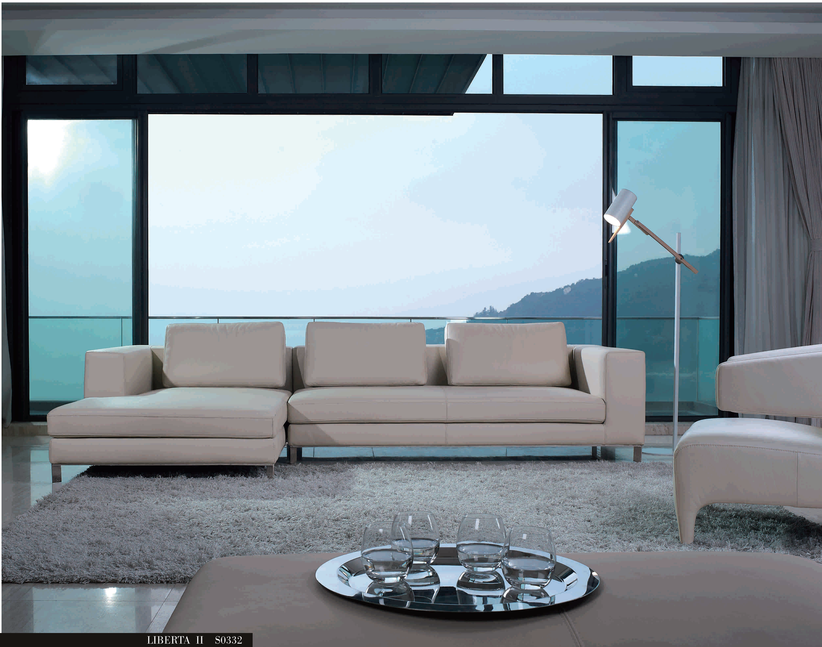
LIBERTA II S0332