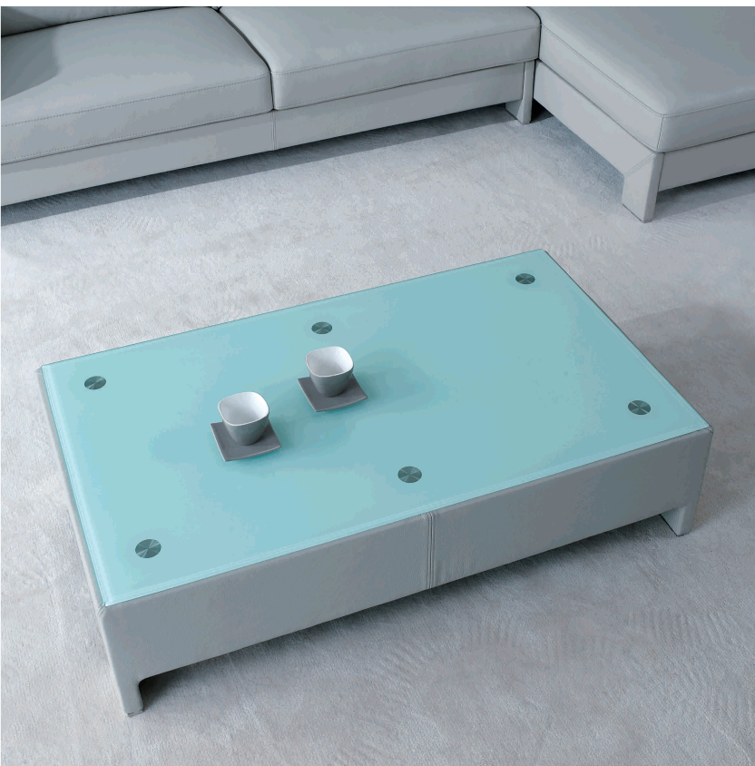
Optional leather upholstered coffee table with white tempered glass top (STG3W) is available with the matching base frame and sofa legs.