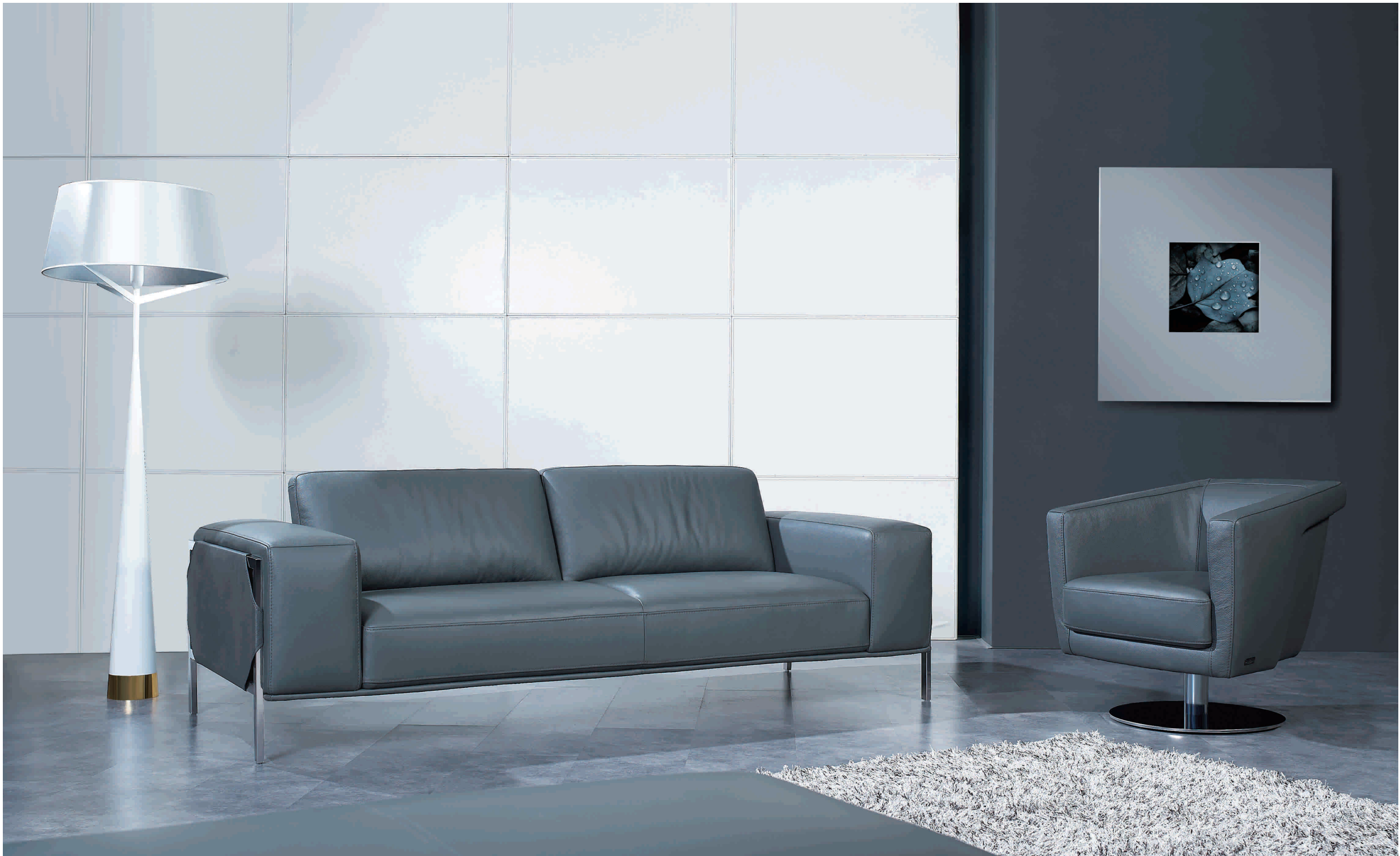
Model BRILLANTE I is the minimalistic version in which the perforation effect is not included. The generally clean cut outline becomes the main tone of design. The 17cm high sofa leg feature enhances the modern contemporary flair of Model BRILLANTE .