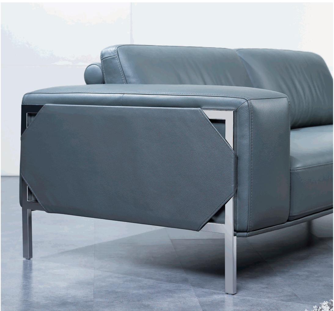
Without the perforation effect, the arm exterior of Model BRILLANTE I exudes the aesthetics of geometric patterns. It certainly brings a unique character to a minimalistic model like BRILLANTE I.