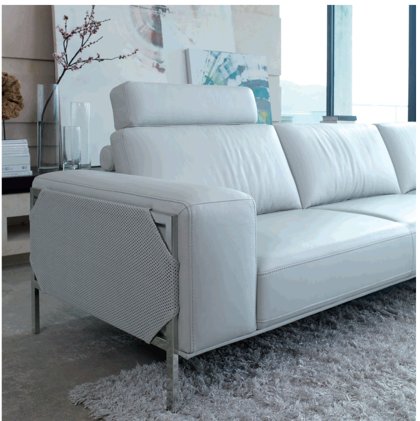
Optional headrest (HR4) is available for extra support on the head and neck.