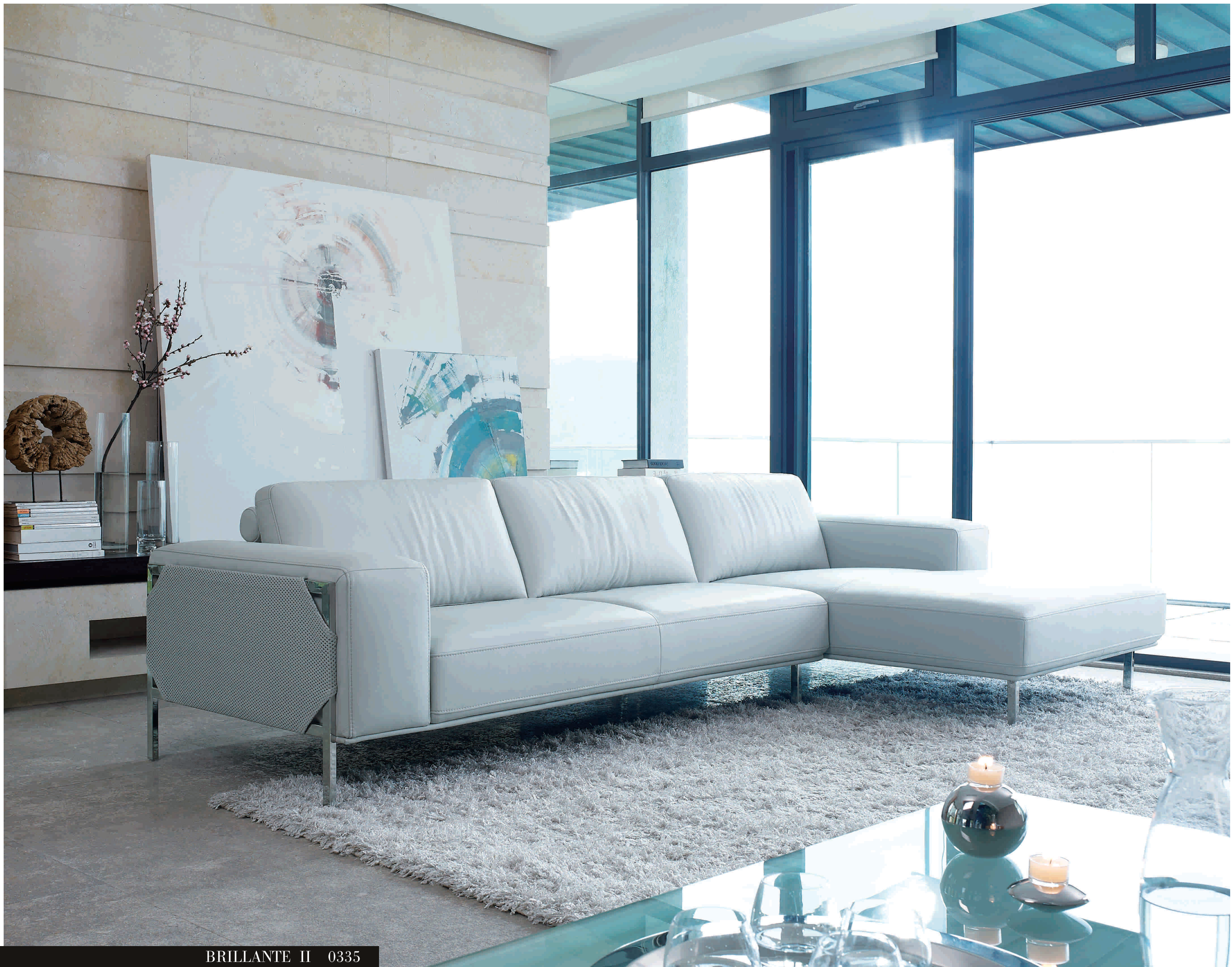
BRILLANTE II 0335