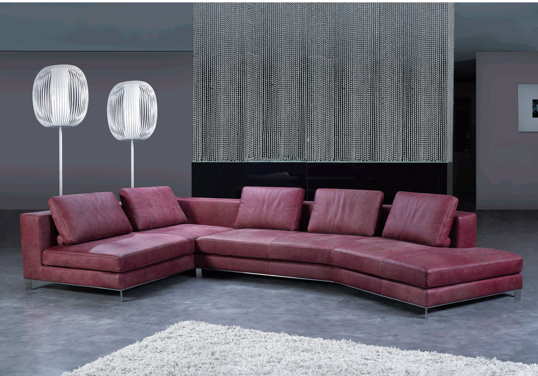
When one of the back cushions of item "4LA" is placed at the different position, a new seating position can be created. It makes Model LIBERTA a very flexible and practical seating device.