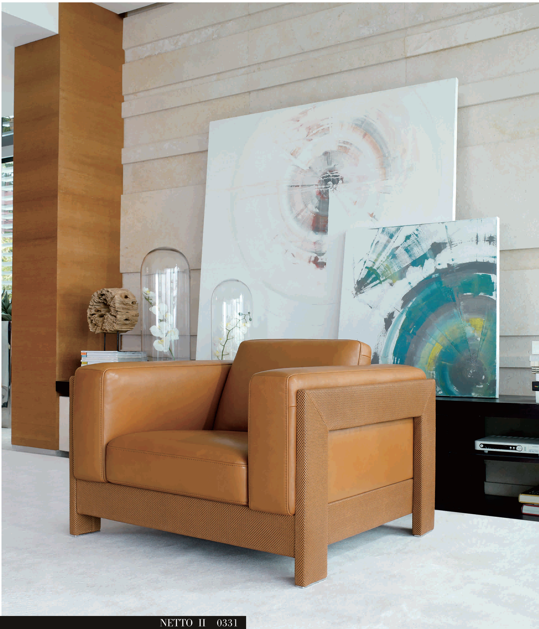
NETTO II 0331