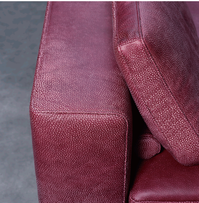
With a clean and minimalistic design, Model LIBERTA is perfect for matching with unconventional leather articles that have an eye-catching effect. The purple leather, NEVICATA, is an aniline leather which the top is specially bufted to create a kind of "stone washed" effect that intensifies the 2-tone color contrast.