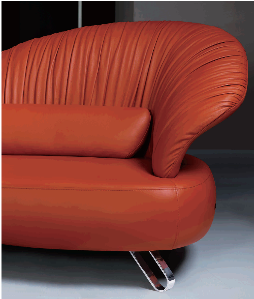
There are options of solid stainless steel legs (Model no. M0339) or wooden legs (Model no. H0339).