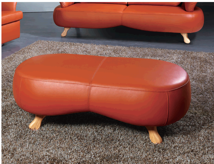
Optional stool (ST2) is available with the matching design of the seat frame and sofa legs.