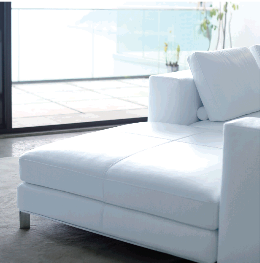
If a large corner composition of sofa is placed at the center of a living room but a more open configuration is preferred, placing a "CT" item at the corner will be a perfect choice. It can also be placed in the front of a sofa set to become a squared stool.