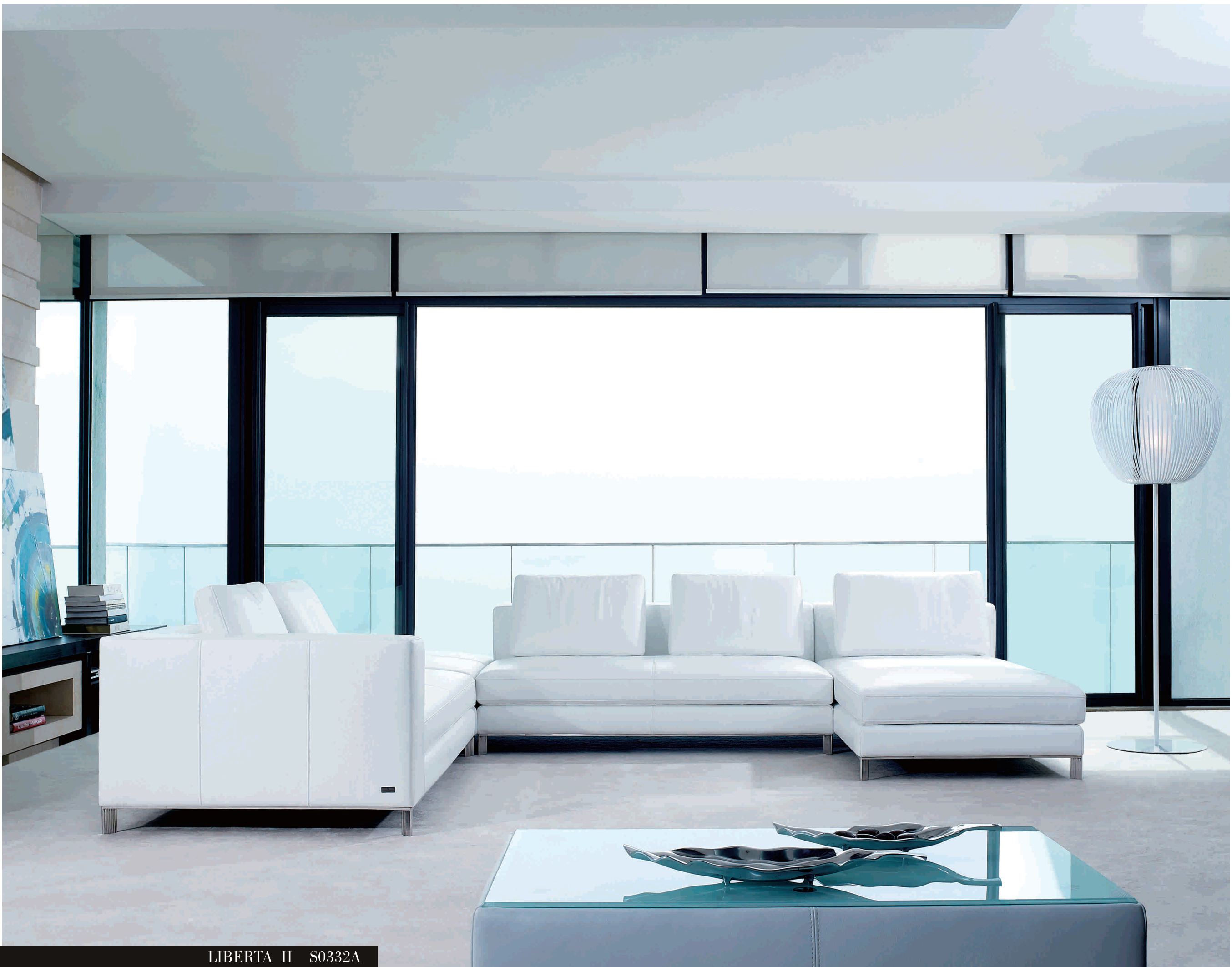
LIBERTA II S0332A