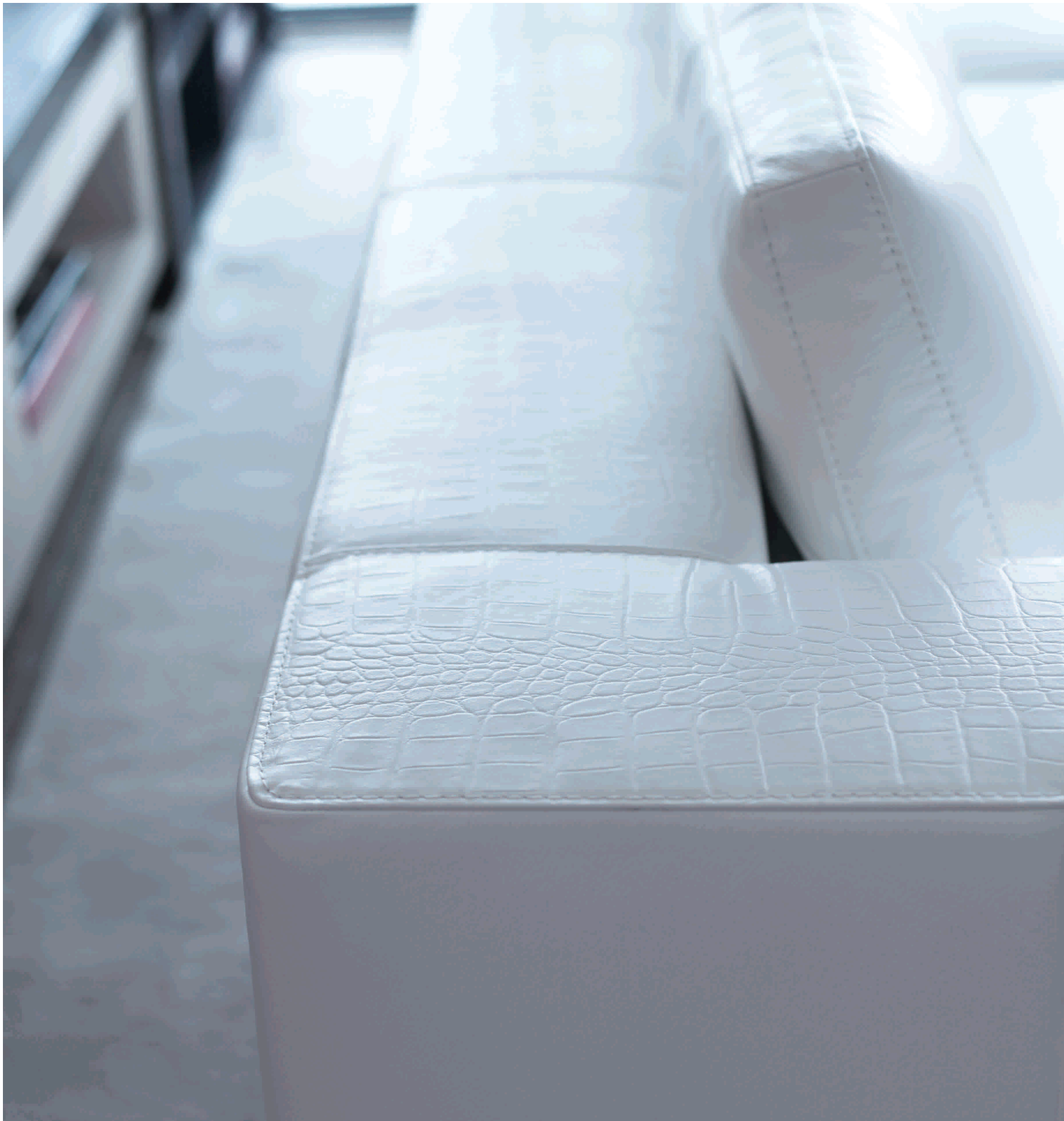
To add some unconventional features to a minimalistic and timeless design piece like Model LIBERTA, you can choose to place the special crocodile skin print leather onto the inner and upper side of the sofa arm and back. Simply just mark an "A" at the end of the model number for indicating where the crocodile skin print leather to be placed.