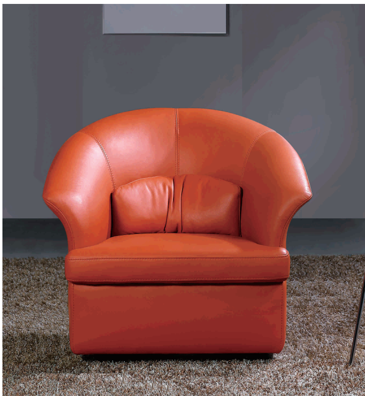
Armchair Model ASTI (no. AC65) has a particular round open design at the back that perfectly matches the unique shapes and forms of Model FARFALLA.