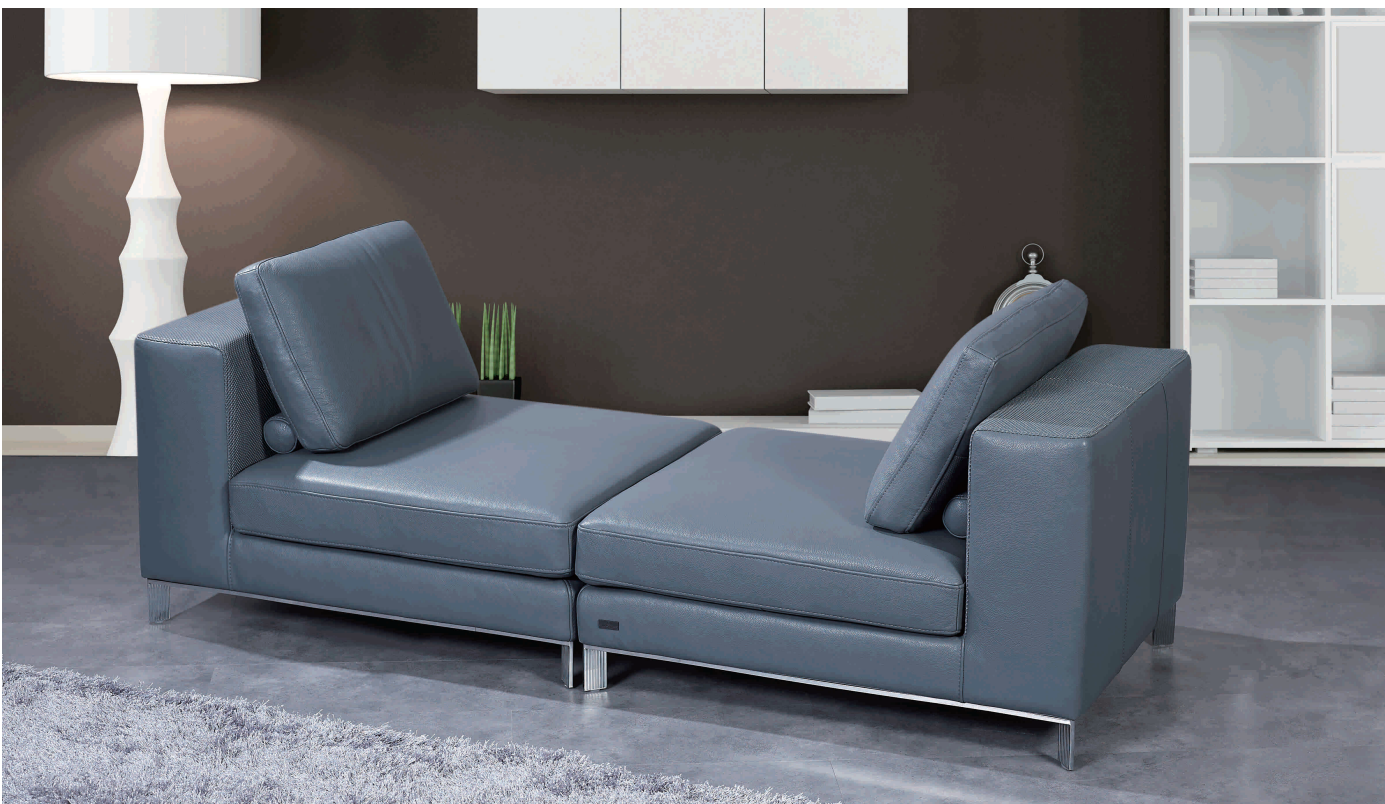
Model LIBERTA is generally a minimalistic and timeless model that can well match with any modern contemporary living room interior setting. For each individual item of Model LIBERTA, it was specially designed with each lateral or front side of the sofa being straight and flat (and fully finished with leather) that difficult items can be put together to become different composition sofa sets. This feature allows users to alter the configuration of a sofa set to be different from its original composition.