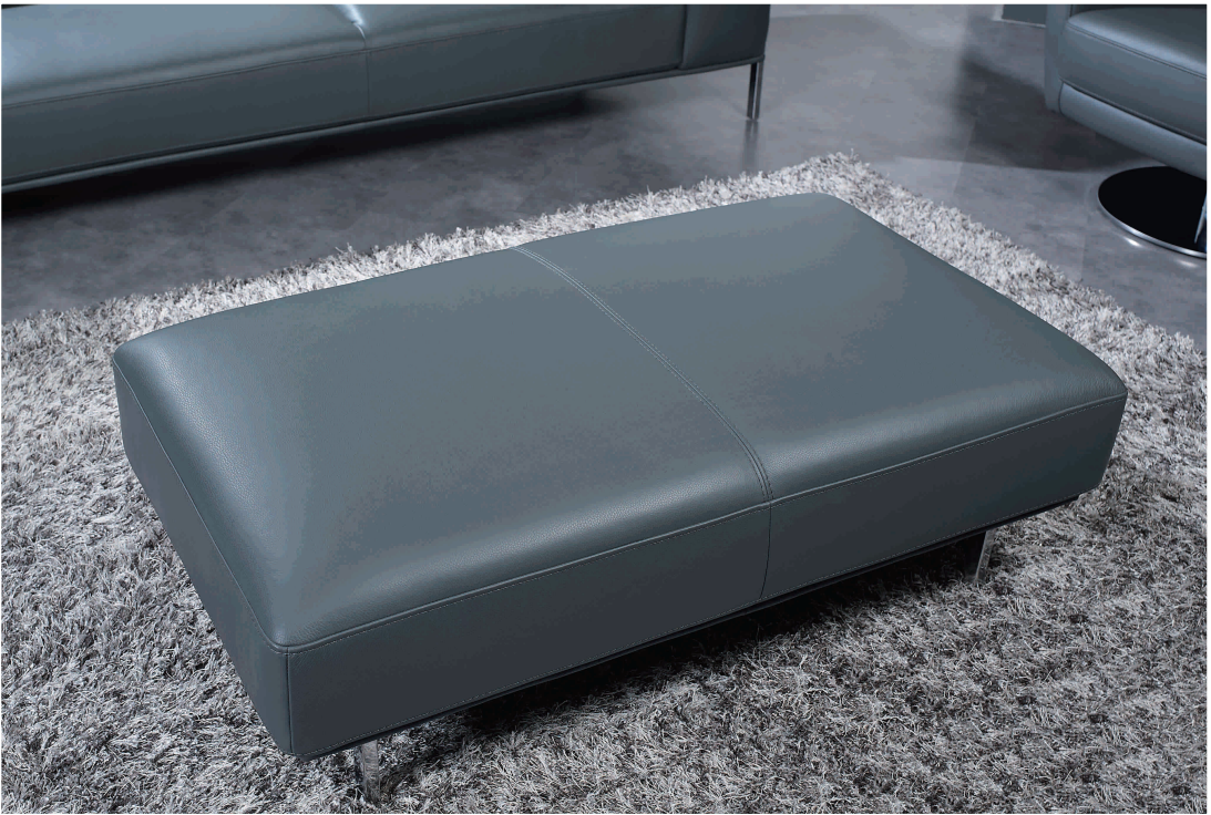
Optional stool (ST2) is available with the matching base frame and stainless steel sofa legs.