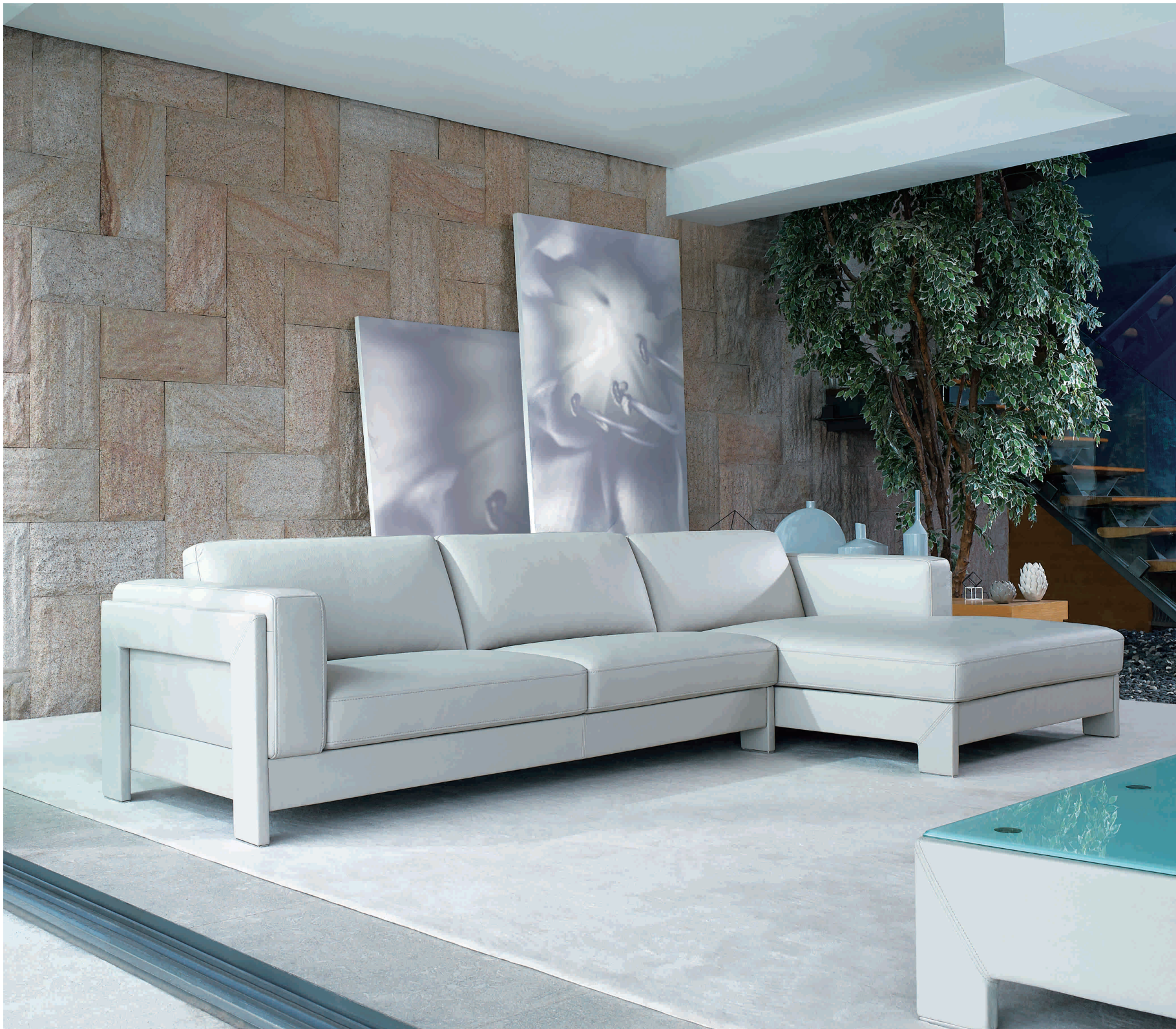
In Model NETTO I, the exterior arm frames and the seat front frames are tightly upholstered which well defines the profile of the sofa.