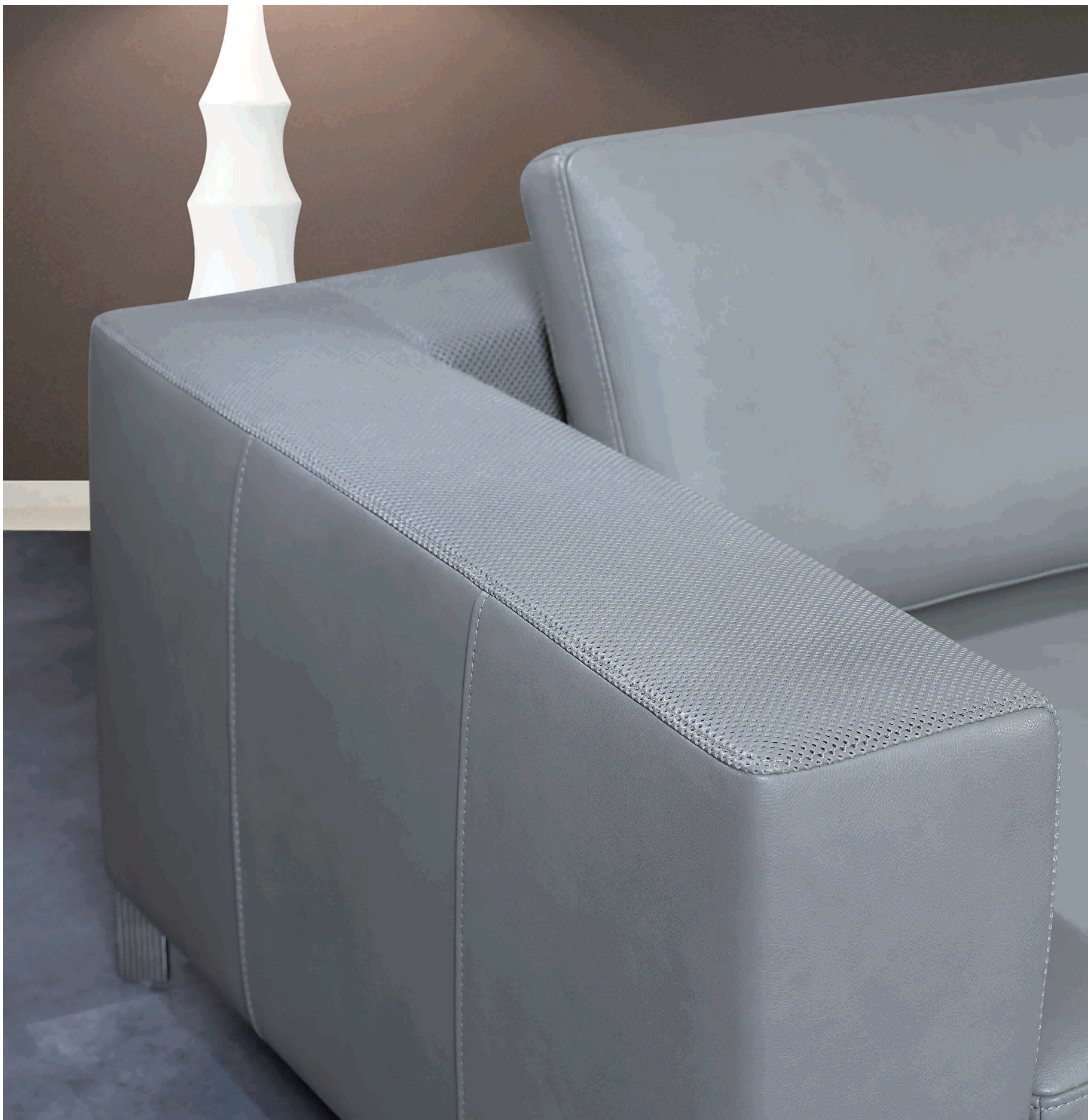
Model LIBERTA III (no. M0333) has an additional design feature. The leather at inner and upper side of the sofa arm and back is perforated with small diamond patterns. This is a special leather crafting effect that is very rarely featured on sofas, which makes this "timeless" design piece, Model LIBERTA, not always "the same"... There is indeed something "new" about it.