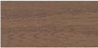
#176 Tannin Walnut (Nogal Taninos)