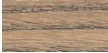
#172 Sand Elm (Olmo Arena)