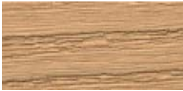
#171 Natural Elm (Olmo Natural)