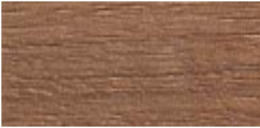
#45 Shaded Walnut (Nogal Sombra)