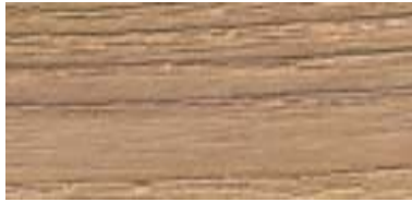
#170 Tenerife Elm (Olmo Tenerife)