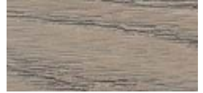
#173 Ash Elm (Olmo Ceniza)