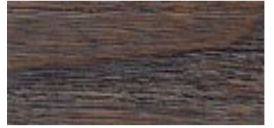
#175 Mount Elm (Olmo Tiede)