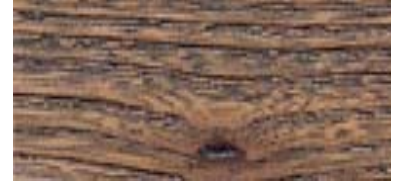
#174 Roasting Elm (Olmo Tueste)