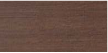
#177 Coffee Walnut (Nogal Café)