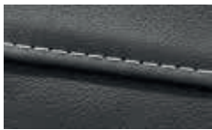
LIGHT GREY 0321

The below displayed combinations of seam colour and leather colour are recommended, exemplary assignments of the 6 available colours of contrast stitching.