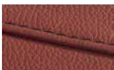
DARK BROWN 1002