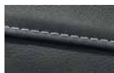
LIGHT GREY 0321

The below displayed combinations of seam colour and leather colour are recommended, exemplary assignments of the 6 available colours of contrast stitching.