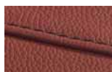
DARK BROWN 1002