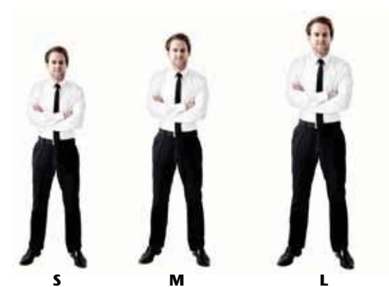
up to ca. 165 cm

In each version the armchair is available in the 3 sizes S, M, L. All relevant comfort sizes (seat height, seat depth, length of the leg flap, back height) are expanding in due proportion, adapted to all body measurements.