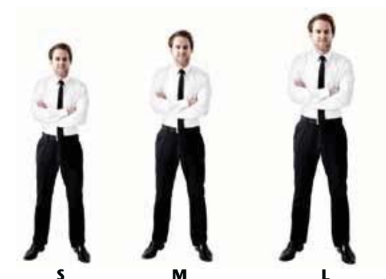
up to ca. 165 cm

In each version the armchair is available in the 3 sizes S, M, L. All relevant comfort sizes (seat height, seat depth, length of the leg flap, back height) are expanding in due proportion, adapted to all body measurements.