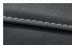
LIGHT GREY 0321

The below displayed combinations of seam colour and leather colour are recommended, exemplary assignments of the 6 available colours of contrast stitching.