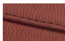
DARK BROWN 1002