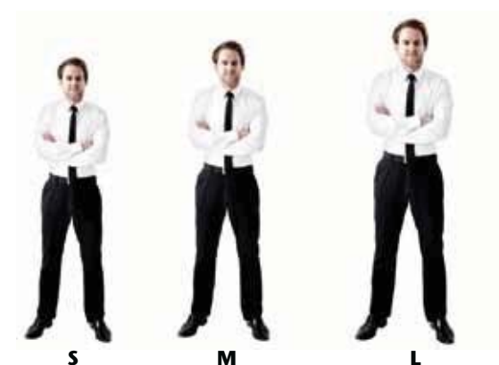
up to ca. 165 cm from o

In each version the armchair is available in the 3 sizes S, M, L. All relevant comfort sizes (seat height, seat depth, length of the leg flap, back height) are expanding in due proportion, adapted to all body measurements.