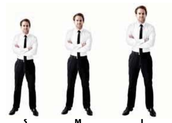
up to ca. 165 cm from ca.

In each version the armchair is available in the 3 sizes S, M, L. All relevant comfort sizes (seat height, seat depth, length of the leg flap, back height) are expanding in due proportion, adapted to all body measurements.